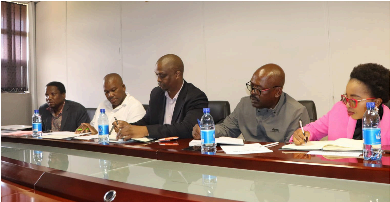
▲ Minerals and Mines Management Board members during their meeting with the minister.