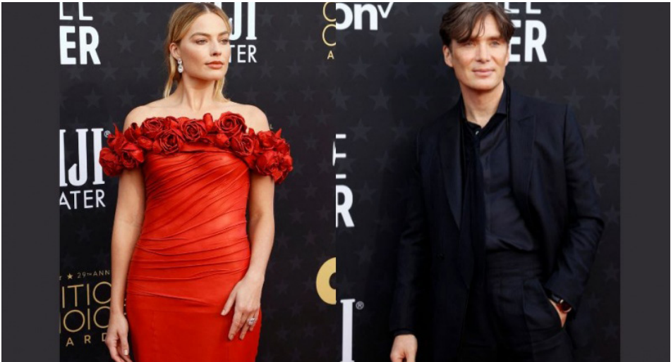
▲ Margot Robbie, who stars in Barbie (l) and Cillian Murphy who stars in Oppenheimer.