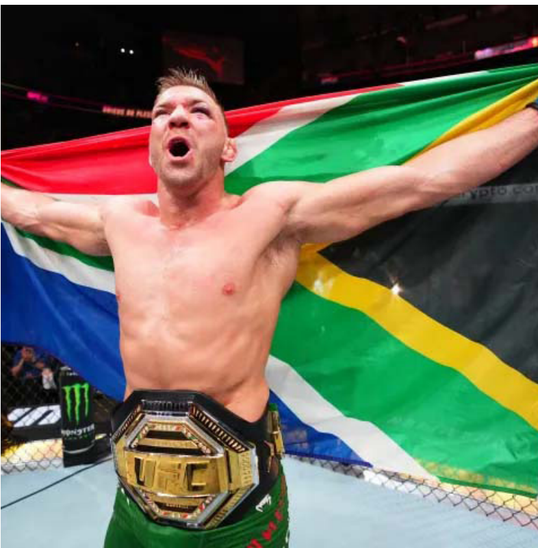
▲ Dricus du Plessis outpointed Sean Strickland to claim a split-decision win and the UFC middleweight title at UFC 297 at the Scotiabank Arena on Saturday, becoming South Africa's first world champion in the promotion.

TORONTO - Dricus du Plessis outpointed Sean Strickland to claim a split-decision win and the UFC middleweight title at UFC 297 at the Scotiabank Arena on Saturday, becoming South Africa's first world champion in the promotion. In the co-main event, Raquel Pennington came on strong over the final two rounds to secure a unanimous decision win over Mayra Bueno Silva to take the vacant women's bantamweight crown. Despite some stiff jabs from Strickland, who won the belt in September with a huge upset of Israel Adesanya, Du Plessis had the better of the opening exchanges. The 30-year-old continued to push the American back in the subsequent rounds but while he enjoyed plenty of success with takedowns he could not keep Strickland on the mat for any length of time. Du Plesis continued to mix up his striking, aiming thudding kicks to the body and landing several left high kicks to keep Strickland guessing. With a stream of blood running from a cut on his left eye, Strickland opened up late in the final round with a series of huge punches but was unable to find a finish and the fight went to the judges' scorecards.