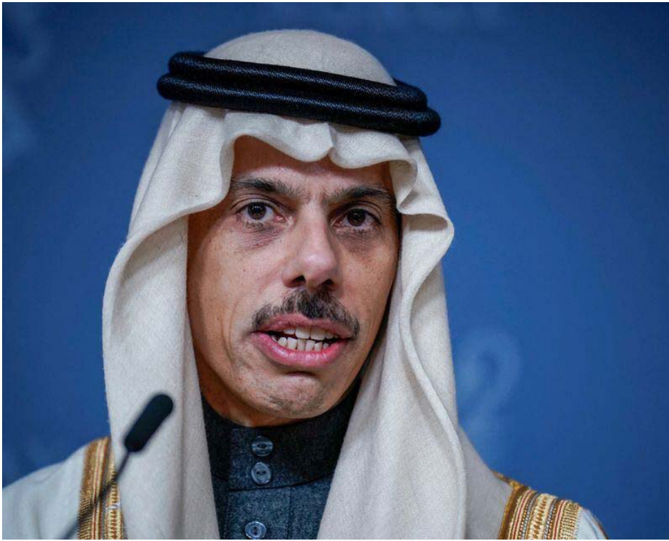
▲ Saudi Arabia’s foreign minister Faisal bin Farhan Al-Saud.

Since last week, the United States has been launching strikes, opens new tab on