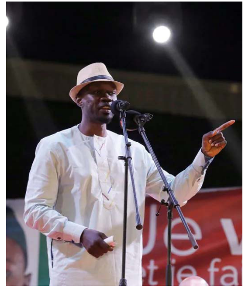
▲ Excluded: opposition leader Ousmane Sonko