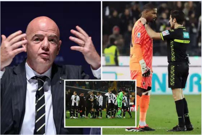
▲ FIFA president Gianni Infantino has called for harsher penalties, including automatic forfeits, against teams whose fans commit racist abuse, following two incidents on Saturday.