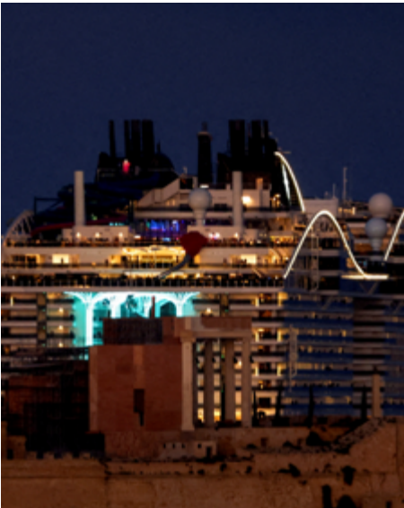
▲The MSC World Europa cruise ship passes behind Fort Ricasoli as it departs from Grand Harbour in Valletta, Malta.

“The safety of passengers and crew is the number one priority and as there was no viable alternative itinerary, the company has regrettably had to cancel the voyages,” MSC Cruises said. “The three ships will transfer directly to Europe without any passengers on board and avoid transiting through the Red Sea.” Although thousands of passengers are