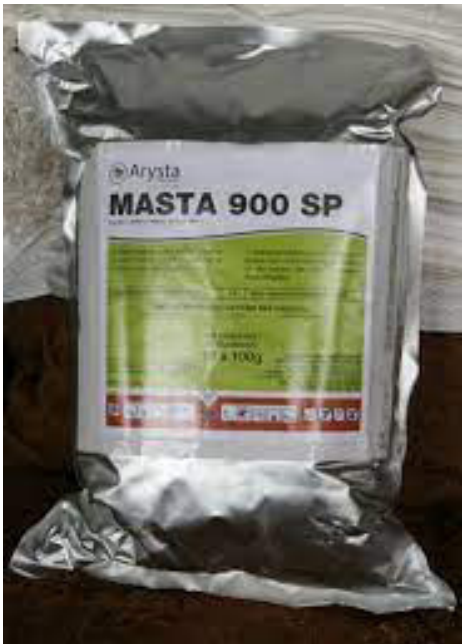
▲ The Masta 900 SP insecticide.