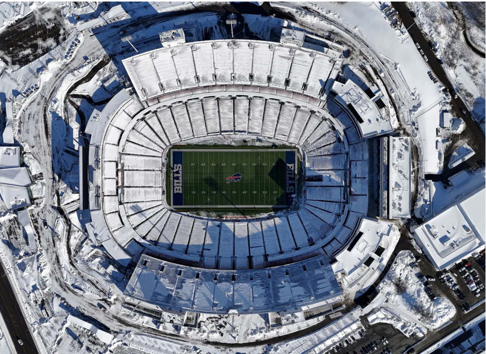
▲ An aerial view of a snow-covered Highmark Stadium during the 2024 AFC wild card game between the Pittsburgh Steelers and the Buffalo Bills in Orchard Park, New York.