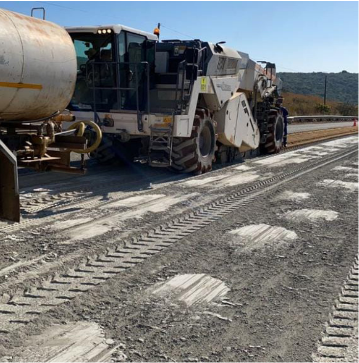
▲Ongoing roadworks towards rehabilitating Mhlaleni - Mahamba MR 9 road which is taking shape