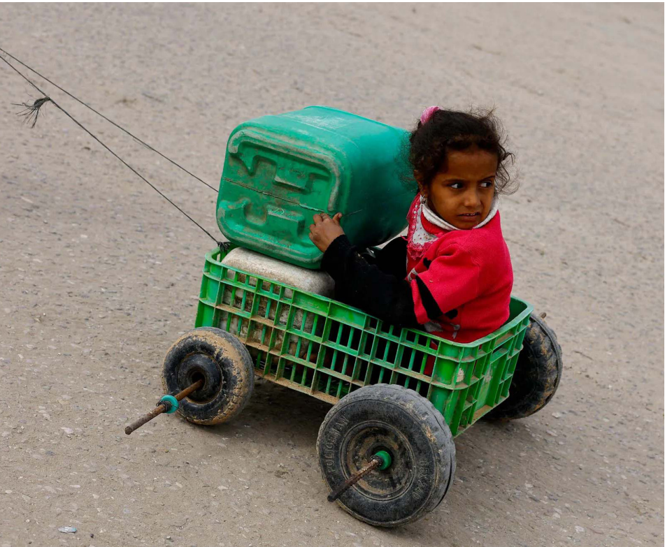
▲ A girl sits in a makeshift cart as Palestinians wait to receive food amid shortages of food supplies, in Rafah in the southern Gaza Strip.