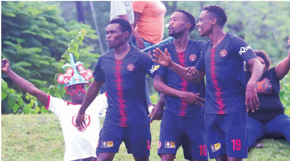
▲ Mbabane Swallows players celebrate the goal that sent them through to the quarter-finals of the Ingwenyama Cup.