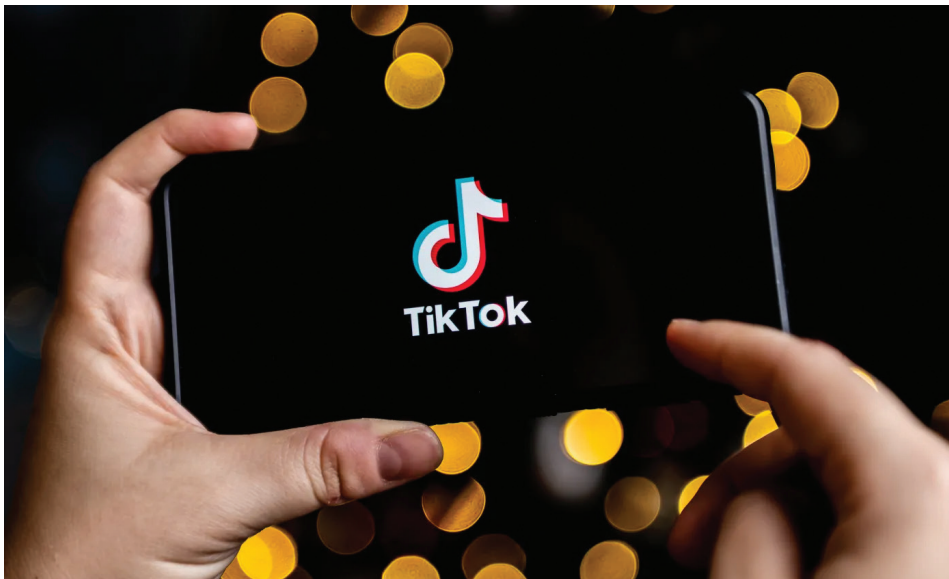
▲ While TikTok’s growth remains positive, that growth is decelerating.

Last summer in the U.K., for example, TikTok experimented with an in-app shopping section called “Trendy Beat,” which offered products sold by TikTok parent ByteDance. TikTok also offers an affiliate program that allows creators to earn commissions from products, as the AP and others have reported.