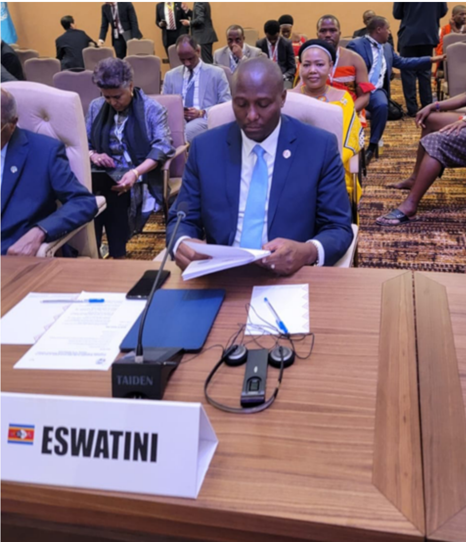
▲Prime Minister Russell Dlamini during the Summit in Kampala, Uganda.

challenges. The Prime Minister pointed to the need for innovative approaches to greening economies and achieving energy sufficiency as crucial factors for sustainable development. At the NAM Summit, Eswatini emphasized the importance of collaborating on matters of political and international security. This includes promoting international law, peaceful conflict resolution, the fight against terrorism, and UN reform, particularly the reform of the Security Council. The NAM Summit brings together representatives from over 120 developing nations aiming to promote global peace, solidarity, and development. The Non-Aligned Movement (NAM) is a forum that is not formally aligned with