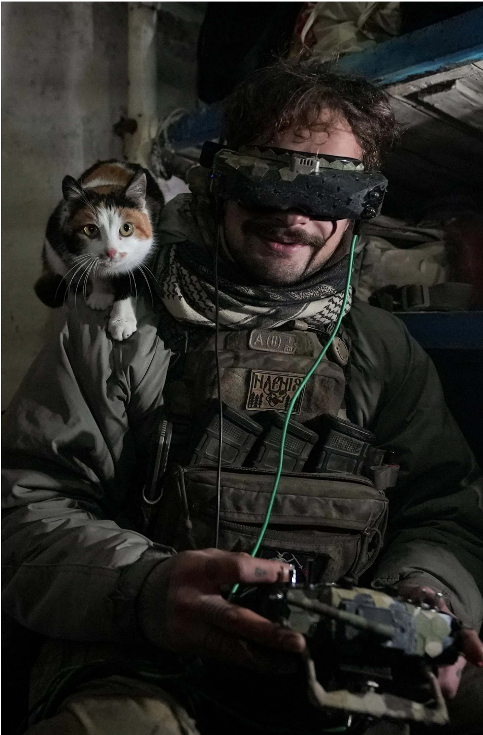
▲ A Ukrainian serviceman of the Rarog UAV squadron of the 24th Separate Mechanized Brigade operates a first person view (FPV) drone at a position near the town of Horlivka, n Donetsk region, Ukraine