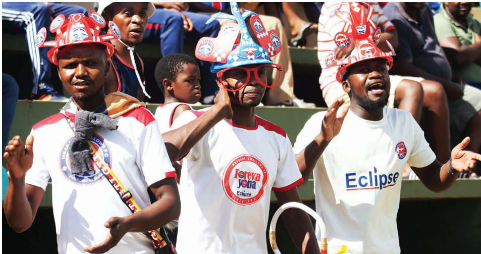
▲ Mbabane Swallows supporters in song after the victory.