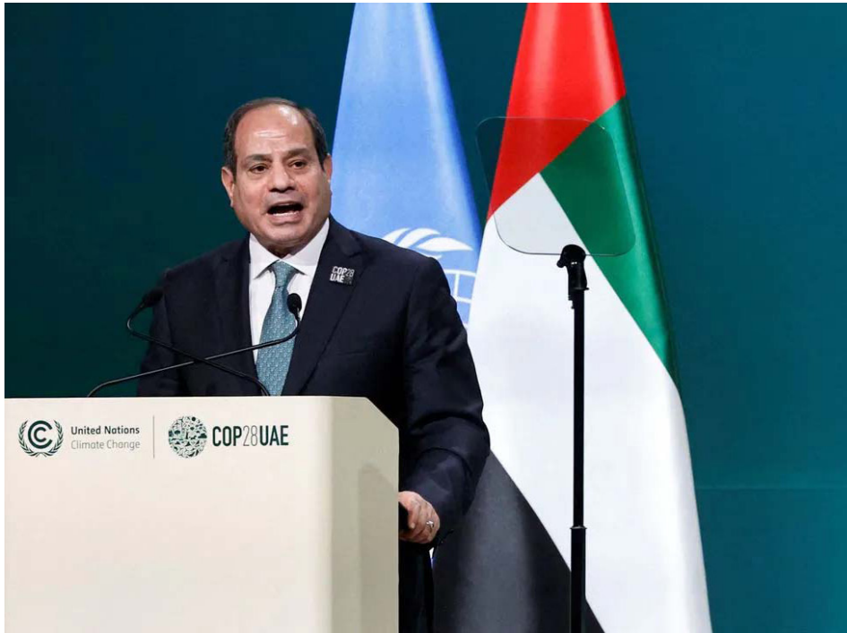
▲ Egypt's president Abdel Fattah al-Sisi

Ethiopia's current main port for maritime