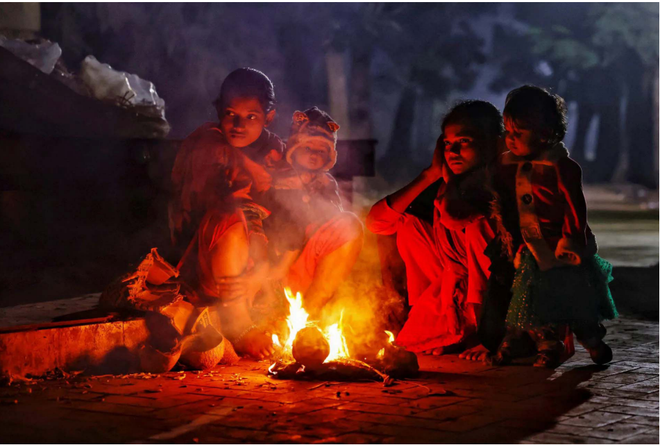
▲ Homeless people who live at the Suhrawardy Udyan light a fire to warm themselves, as temperature drops significantly during winter in Dhaka, Bangladesh.