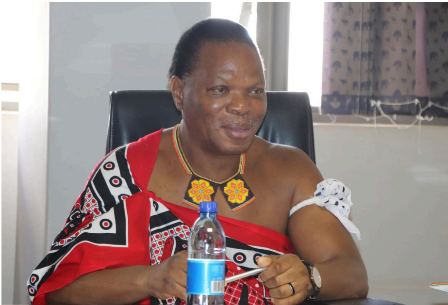
▲ Minister of Natural Resources and Energy Prince Lonkhokhela during the meeting with the Minerals and Mines Management Board.

create jobs, and diversify the economy beyond traditional sectors like agriculture and tourism.