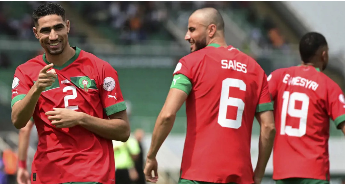
▲Acraf Hakimi celebrates after scoring against DR Congo during the 1-all draw.