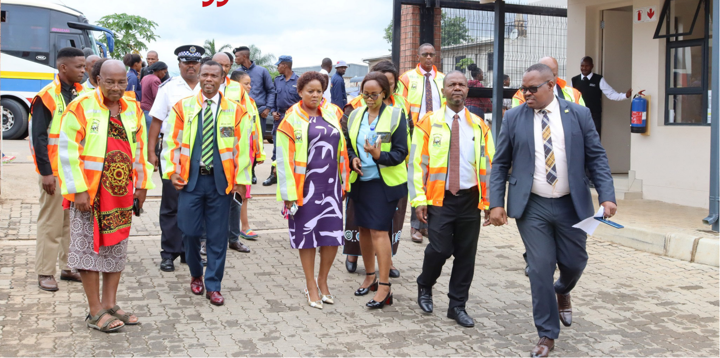
▲The Minister touring the newly completed state of the art Aids Healthcare Foundation (AHF) Health facility.