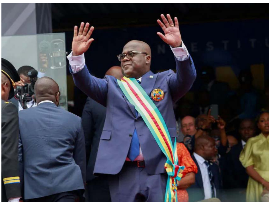
▲ Democratic Republic of Congo President Felix Tshisekedi was sworn in for a second five-year term on Saturday

Choirs singing the Hallelujah chorus from Handel's Messiah, marching military bands