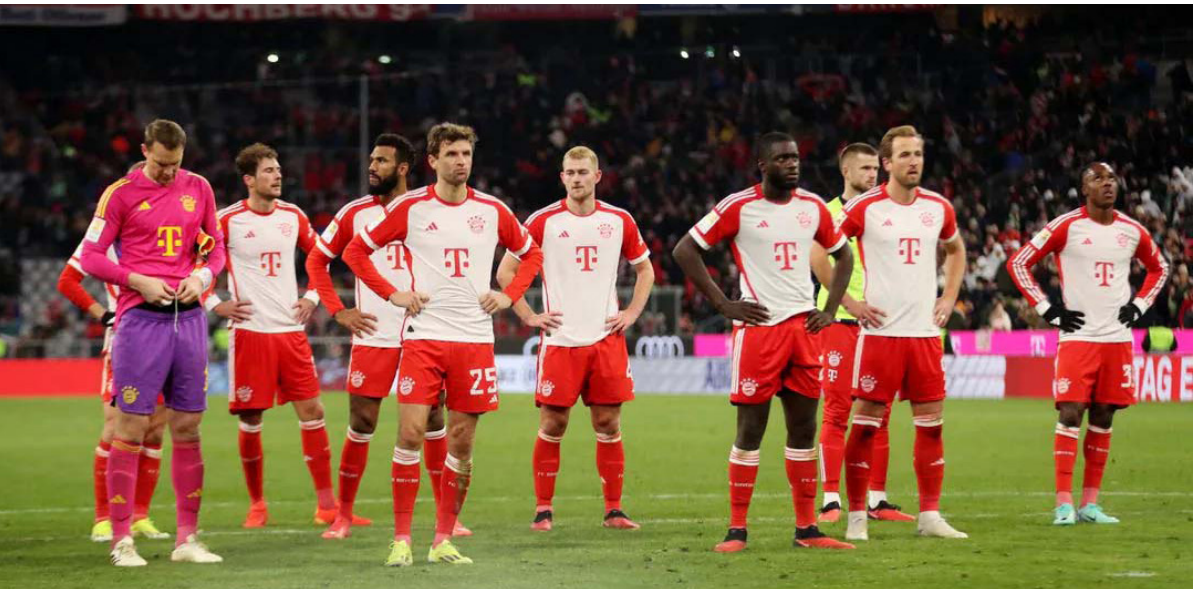
▲ Bayern Munich's Thomas Mueller and teammates look dejected after the match.

59th minute, charging into the box, then shaking off Alphonso Davies and firing an unstoppable shot past keeper Manuel Neuer. The hosts then poured forward but had no clear plan with top scorer Harry Kane missing the target with a close-range header in the 72nd. Werder keeper Michael Zetterer then palmed a Leroy Sane shot wide in the 79th before tipping the ball away from Kane's head a little later. Bayern substitutes Eric-Maxim Choupo Moting and Mathys Tel also had their share of chances but Zetterer stood firm as the visitors held on to secure the win. (Reuters)