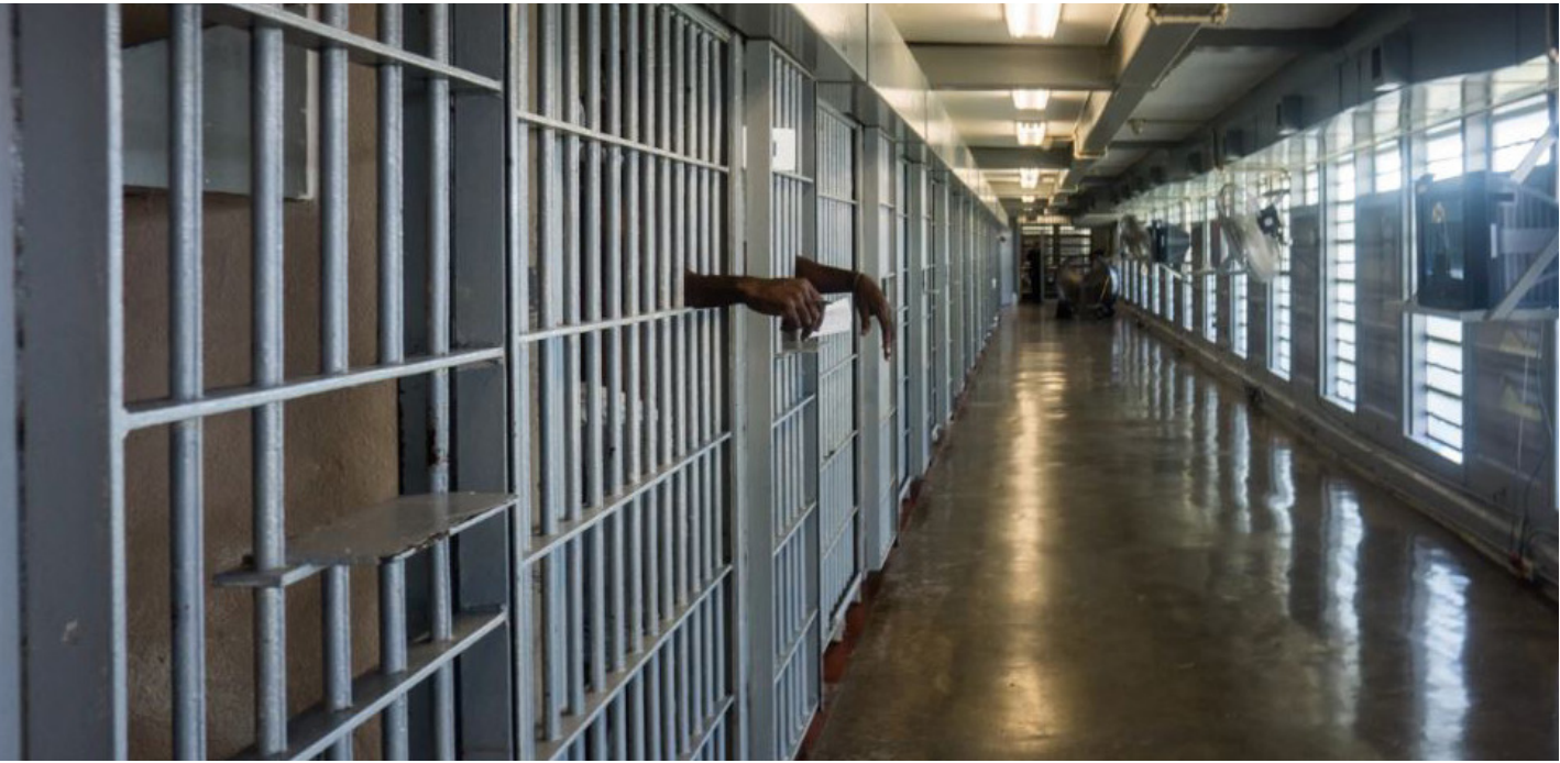
▲ A prison cell.

● Just last week a man aged 30 years was also charged with assault after he allegedly hit his ex-girlfriend with a fist on the nose thus causing her bruises