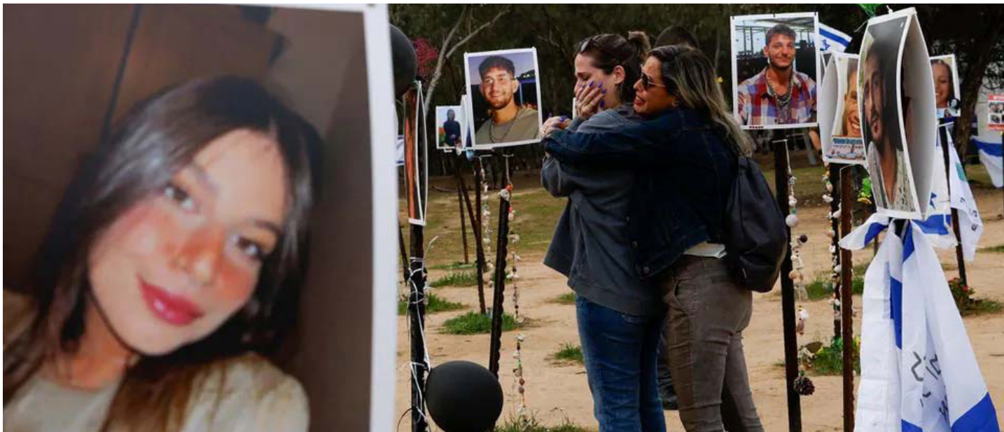
▲ The toll of Palestinians killed in Israeli strikes on Gaza since Oct. 7 has passed 25,000