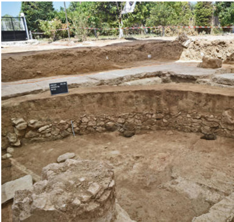
▲ The temple found in the 2023 excavations dated back to the seventh century B.C.