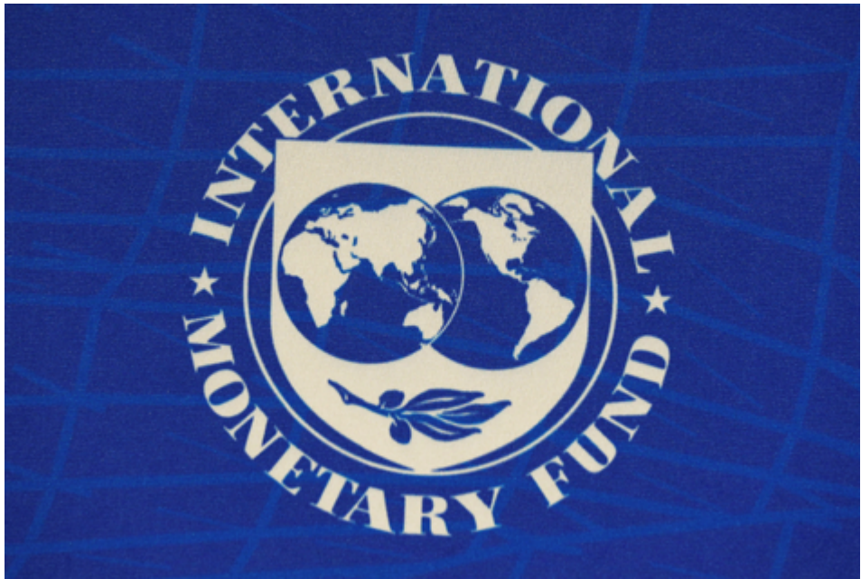
▲The logo of the International Monetary Fund (IMF), is seen during a news conference in Santiago, Chile.