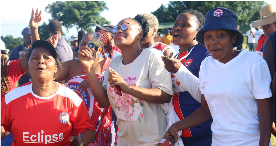
▲ Mbabane Swallows fans in song after the final whistle.