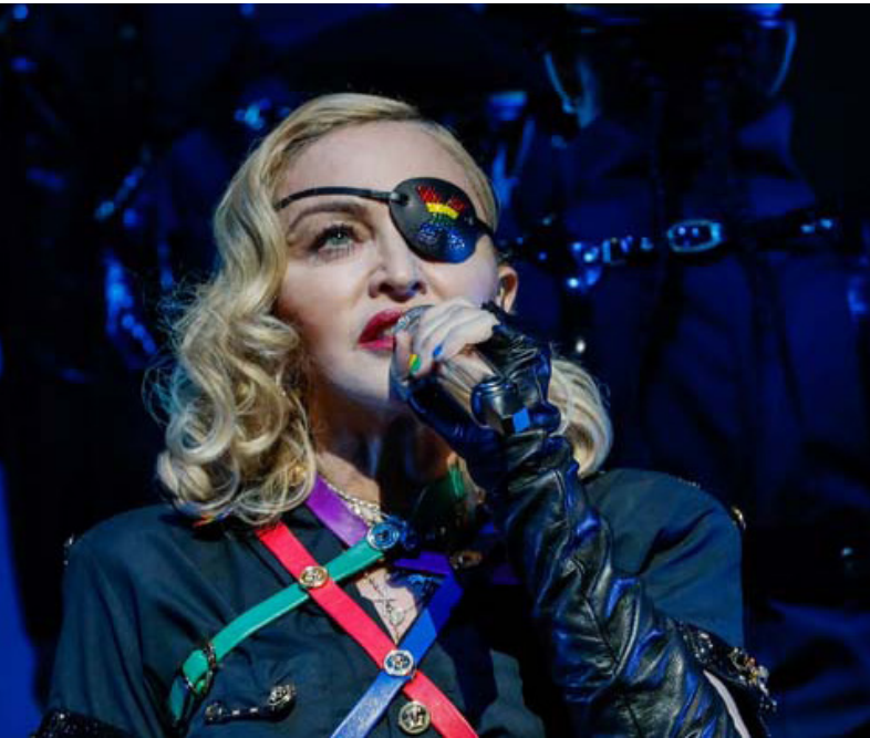
▲ Two Madonna fans are suing the megastar for damages over concerts in New York that started two hours late, accusing her of “flippant difficulty,” court documents show.

and a representative for Madonna did not respond to requests for comment.