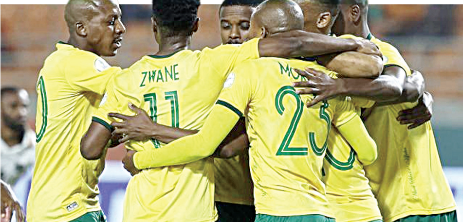
▲Bafana Bafana players celebrate one of their goals in the 4 - 0 thrashing of Namibia.