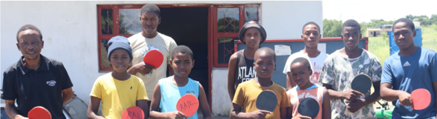
▲Some of the juniors who played in the Whistle Stop Engineering Table Tennis Tournament in Matsetsa.