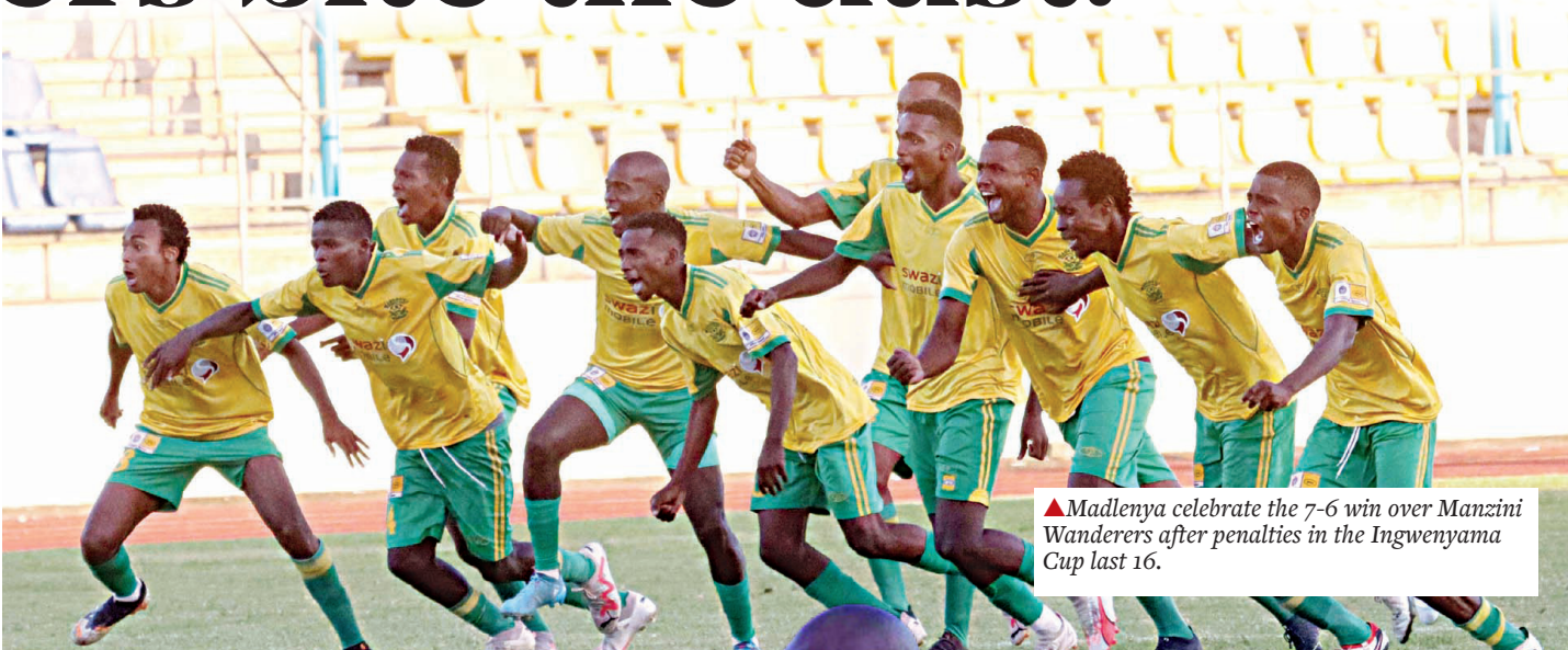
▲Madlenya celebrate the 7-6 win over Manzini Wanderers after penalties in the Ingwenyama Cup last 16.

The two teams created little chances in both halves, forcing the contest to be decided on penalties. Madlenya were determined on the day, as they were backed by Mbabane Highlanders fans, who sympathised with them