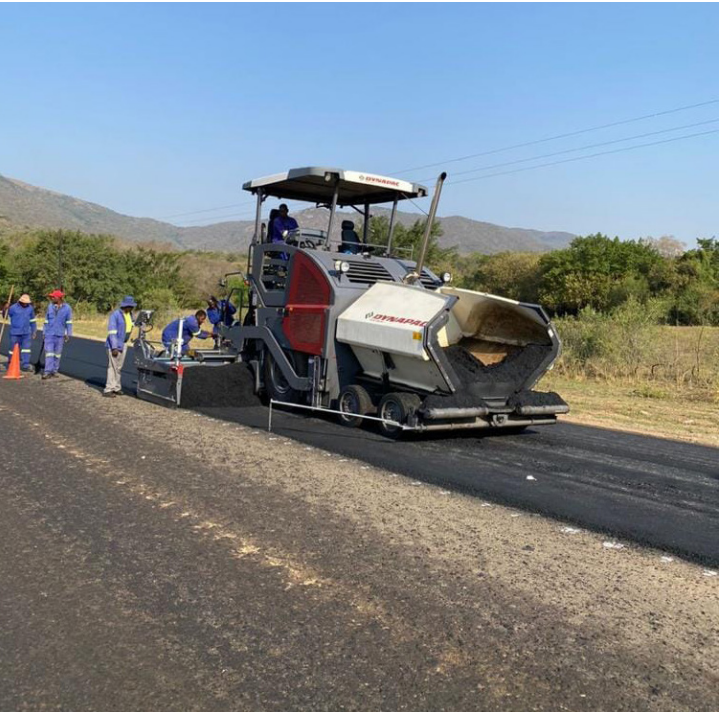
▲ Government has expressed that the rehabilitation is done in phases on the MR 9 road.