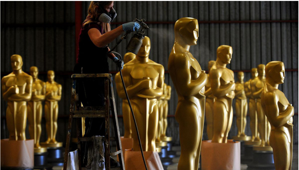
▲ Nominations for this year’s Oscars will be unveiled on Tuesday, with the ‘Barbenheimer’ juggernaut expected to roll on to the climax of Hollywood’s awards season with multiple chances at glory.