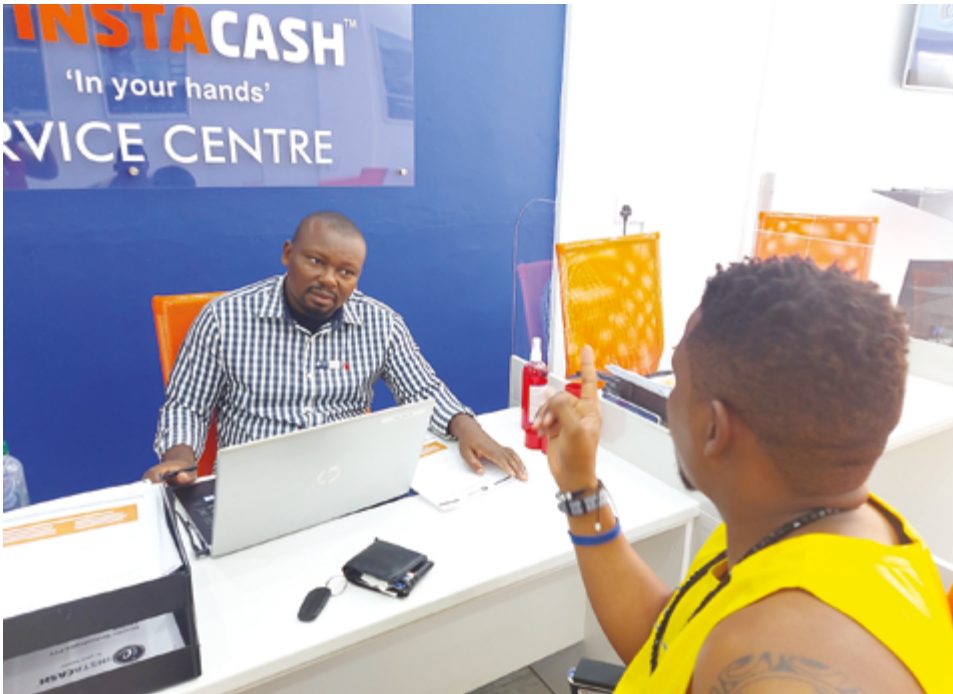
▲A customer at an Instacash Service Centre.

account by Instacash has been a resounding success, capturing the attention and approval of the general public. The account’s accessibility, convenience, and range of benefits have made it a popular choice for individuals looking to save and invest their money, while its innovative approach to financial inclusion has had a positive impact on communities. As the popularity of the Zero-rated Stokvel account continues to grow, it is evident that Instacash has effectively addressed a significant market need, and is well-positioned to continue making a meaningful impact on the financial landscape.