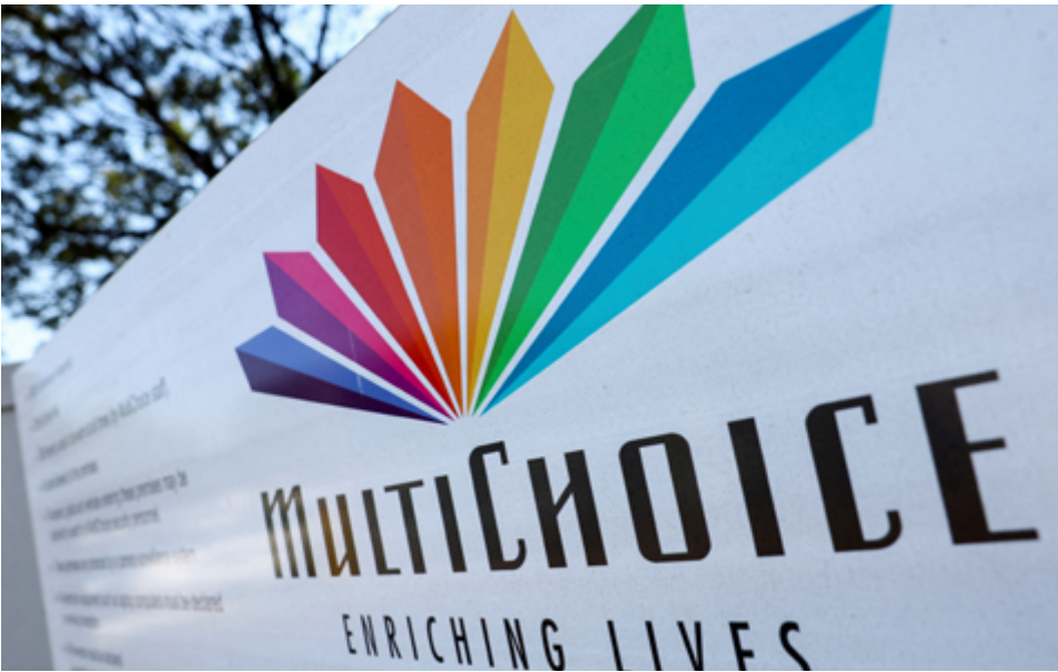
▲A MultiChoice logo is displayed outside the company’s building in Cape Town, South Africa.

requested the Takeover Regulation Panel to make a ruling as to whether a mandatory offer must be made.