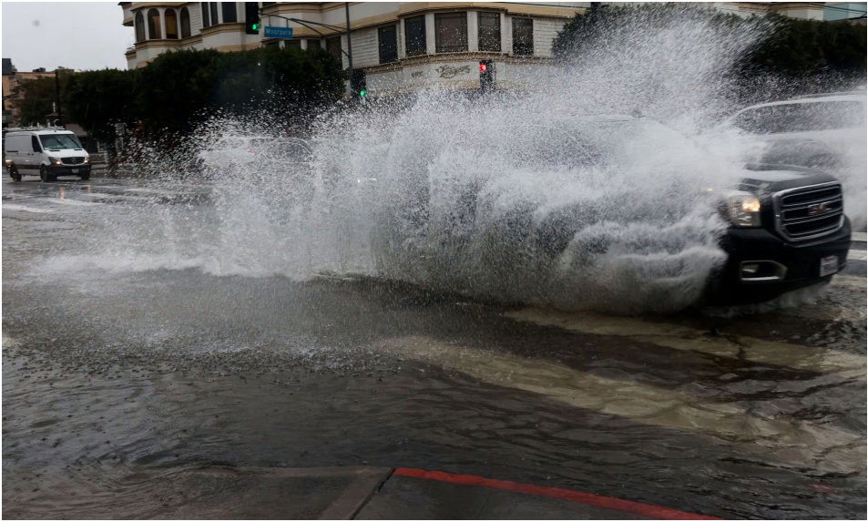
▲ Cars drive on flooded streets, during the ongoing rain storm in Studio City, California.