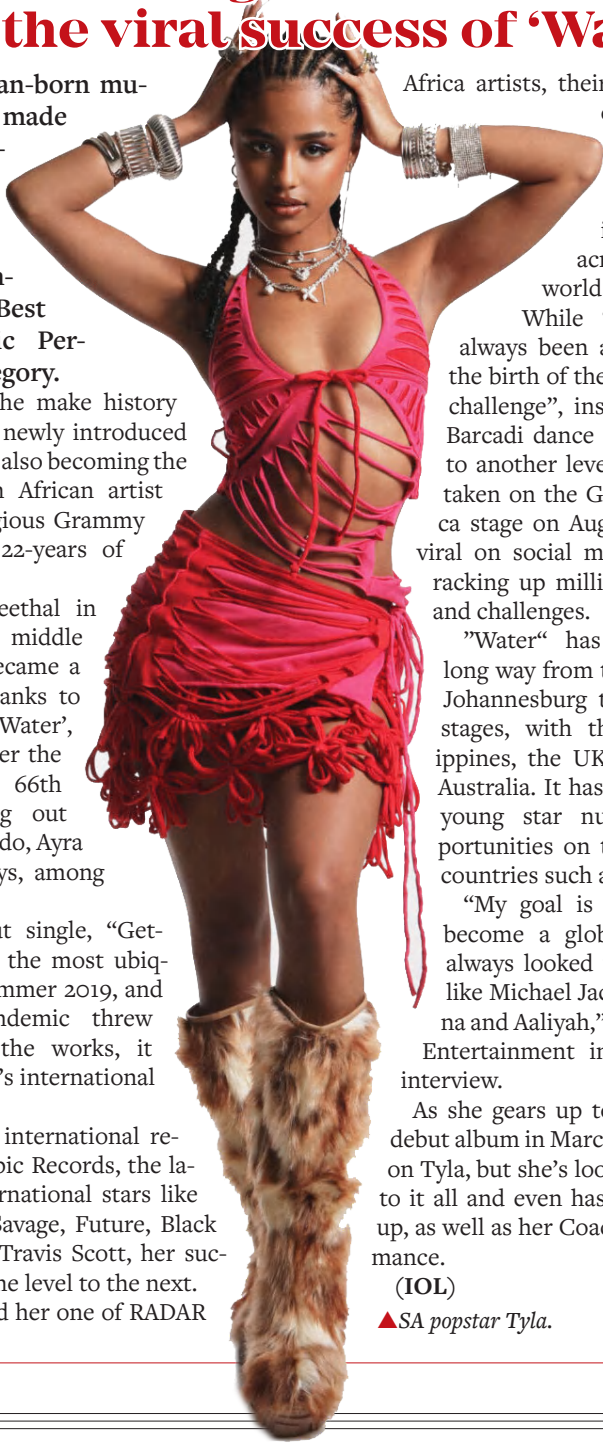
▲SA popstar Tyla.