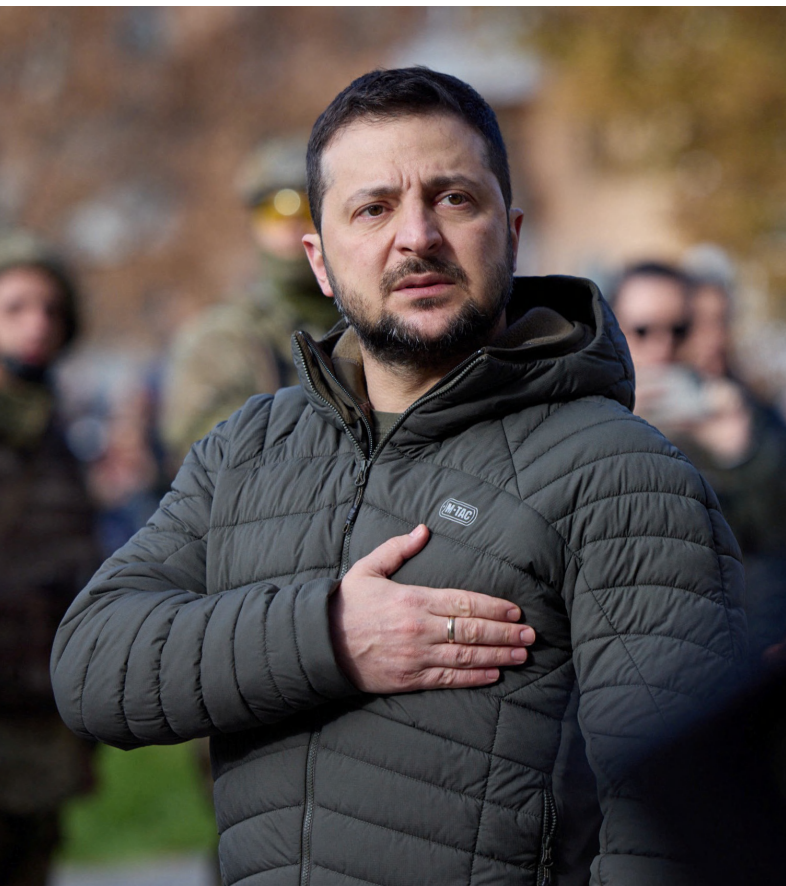
▲ President Volodymyr Zelenskiy is considering a “reset” to replace several senior officials that will go beyond the military sphere.

“We can have discussions about tactics inside of the team but we are all united around our strategic goal which is the defeat of Russia in Ukraine and restoration of Ukraine’s territorial integrity and sovereignty. And there are no discussions whatsoever on this strategic goal,” he said. Speculation has gripped Ukraine for weeks over suggestions that the president was about to dis-