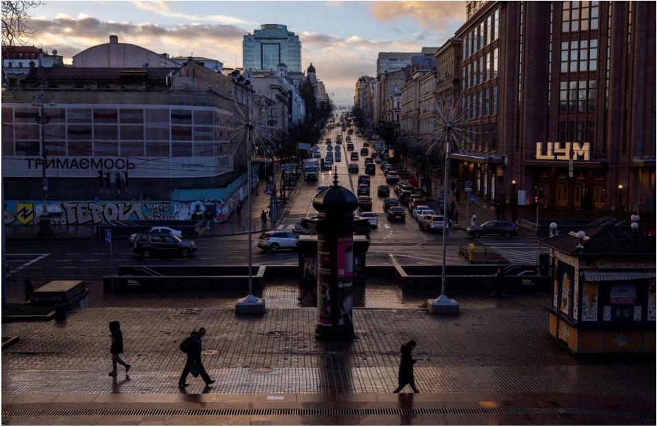
▲ People walk along Khreshchatyk street as the evening sun breaks through the clouds after a rainy day in Kyiv, Ukraine.