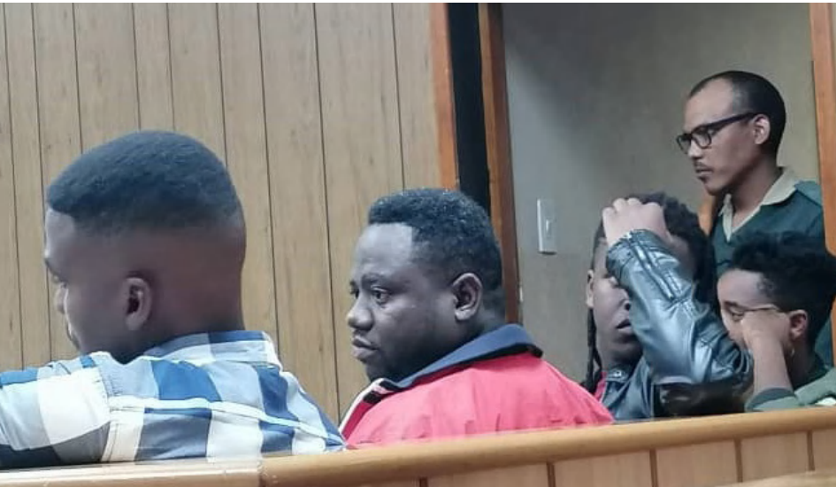
▲The alleged ATM bombers during their court appearance.

He explained that he, along with other police officers, immediately proceeded to the scene. Upon arrival, they took random pictures of the crime scene while waiting for the bomb technicians to assess the situation