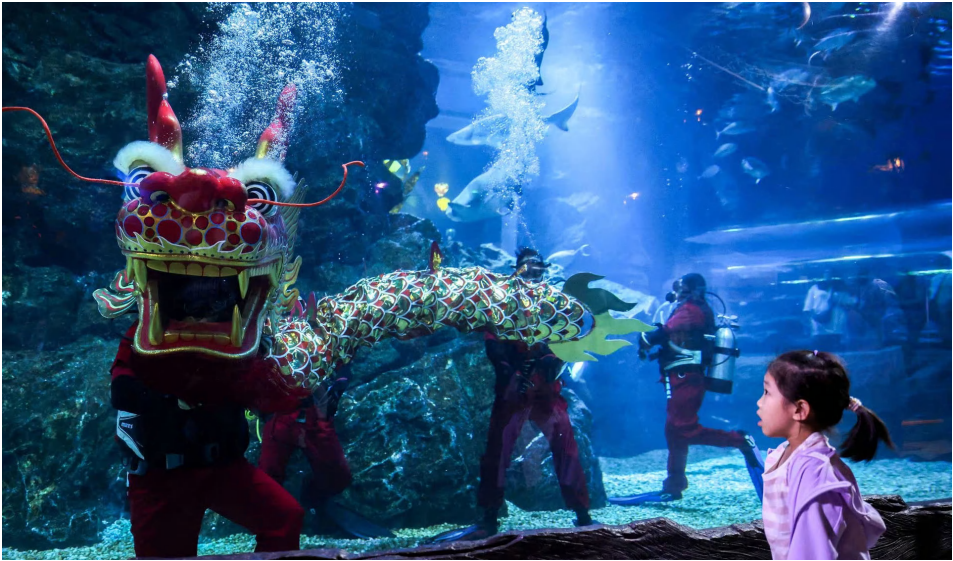
▲ A girl looks, as divers perform a dragon dance ahead of the Lunar New Year celebration at the Sea Life Bangkok Ocean World aquarium in Bangkok, Thailand.