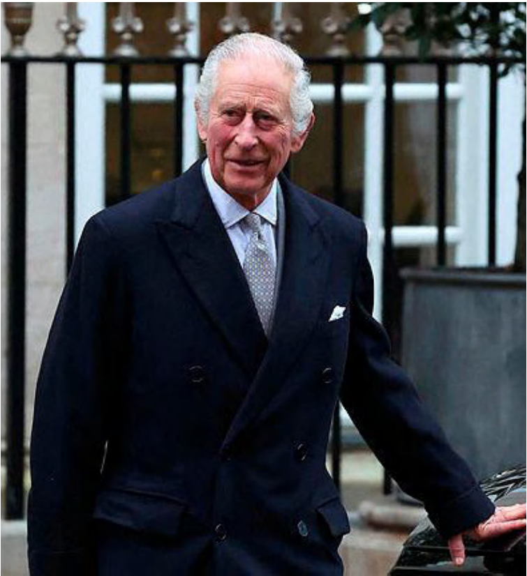
▲ King Charles has been diagnosed with a form of cancer and will postpone public engagements to undergo treatment.

Polls suggest most Britons have a favourable view of his reign so far, although younger generations appear much less enthusiastic