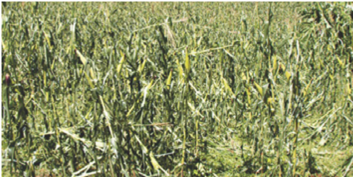
▲Maize plants were also damaged by the storm.