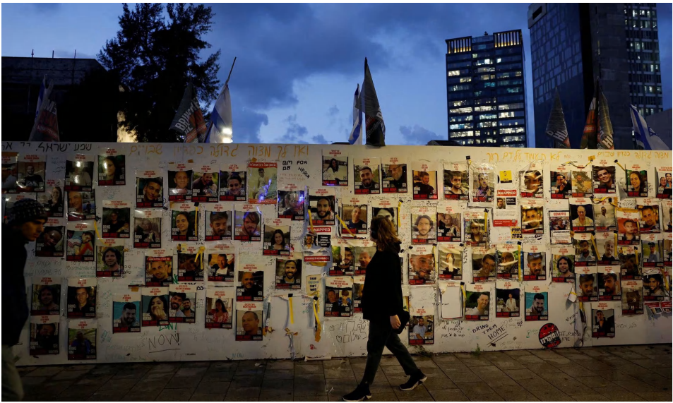
▲ A woman looks at a board displaying pictures of hostages kidnapped in the deadly October 7 attack on Israel by the Palestinian Islamist group Hamas, in Tel Aviv, Israel.