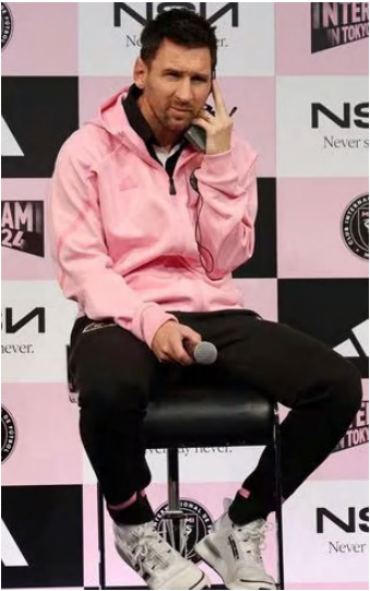
▲ Lionel Messi left open the possibility of playing in Inter Miami's friendly in Tokyo,

"In Hong Kong, we had an open-door training session and I went out because there was such a big crowd there and there was a clinic with the kids, and I wanted to be there and participate," the 36-year-old told a press con-