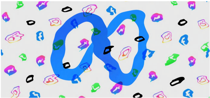
▲Meta also updated its Sextortion hub with new guidance is launching a global campaign to raise awareness about sextortion.

back control of their personal intimate phones and prevents ex-partners and scammers from spreading them online. The system can be used by people under 18 who are worried their content has been or may be posted online. It can also be used by parents or trusted adults on behalf of a young person. Plus, it can be used by adults who are concerned about images taken of them when they were under 18. The system works by having users follow instructions to assign a unique hash, which is a digital fingerprint in the form of a numerical code, to their image or video privately from their own device. Once the hash has been submitted to NCMEC, Meta can find copies of the image or video and take them down. (TechCrunch)