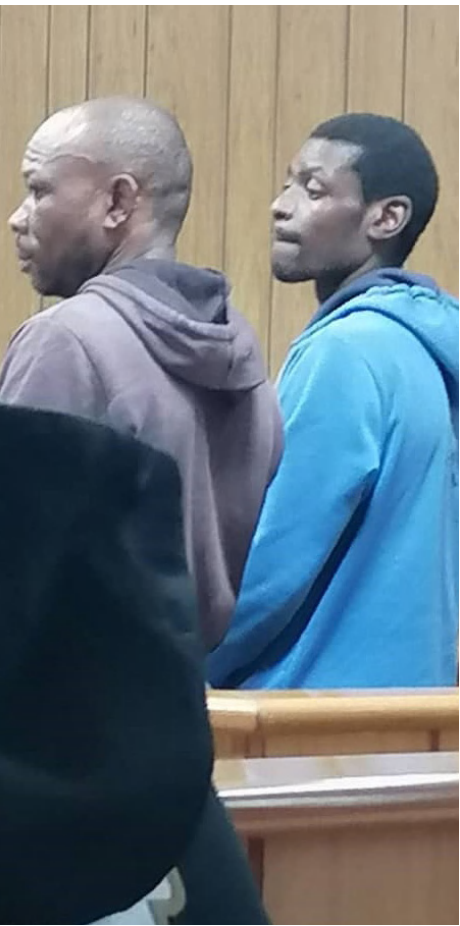
▲The two men who have been charged with theft of steel metals worth E30,500.