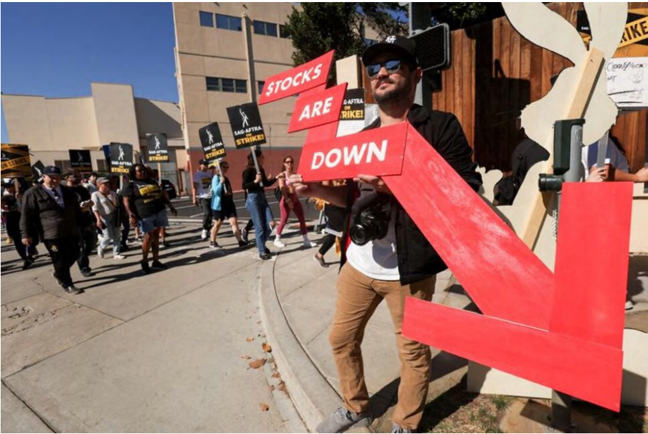
▲SAG-AFTRA members walk the picket line during their ongoing strike outside Disney Studios in Burbank, California, U.S.

Analyst TD Cowen estimated broadcast and cable television advertising will end 2023 down 7% from the prior year, with total advertising declines of 11.7% at Disney, according to LSEG. Warner Bros Discovery