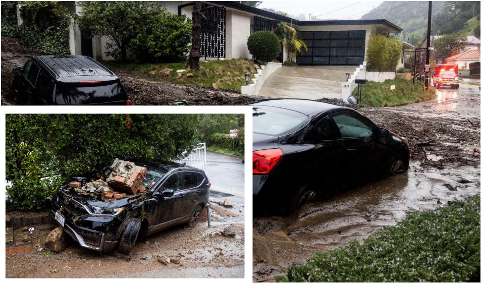
▲ Rain falls over cars stuck by a mudslide, caused by an ongoing rain storm in Studio City, California, INSET Bricks lie on top of a damaged car, during the ongoing rain storm in Studio City, California.