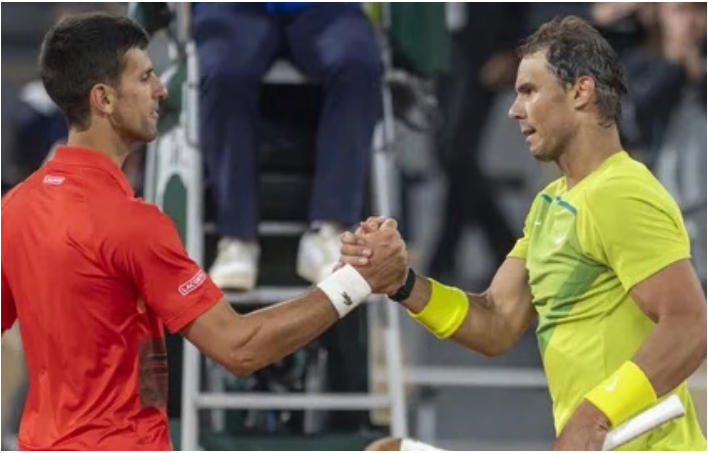
▲ Saudi Arabia will host a new elite tennis exhibition featuring Novak Djokovic and Rafa Nadal.