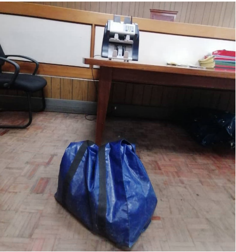
▲Money which was collected by the police in the blue bag and the notes counter used in court during the trial.

court with his qualifications as evidence of his expertise in assessing crime scenes.