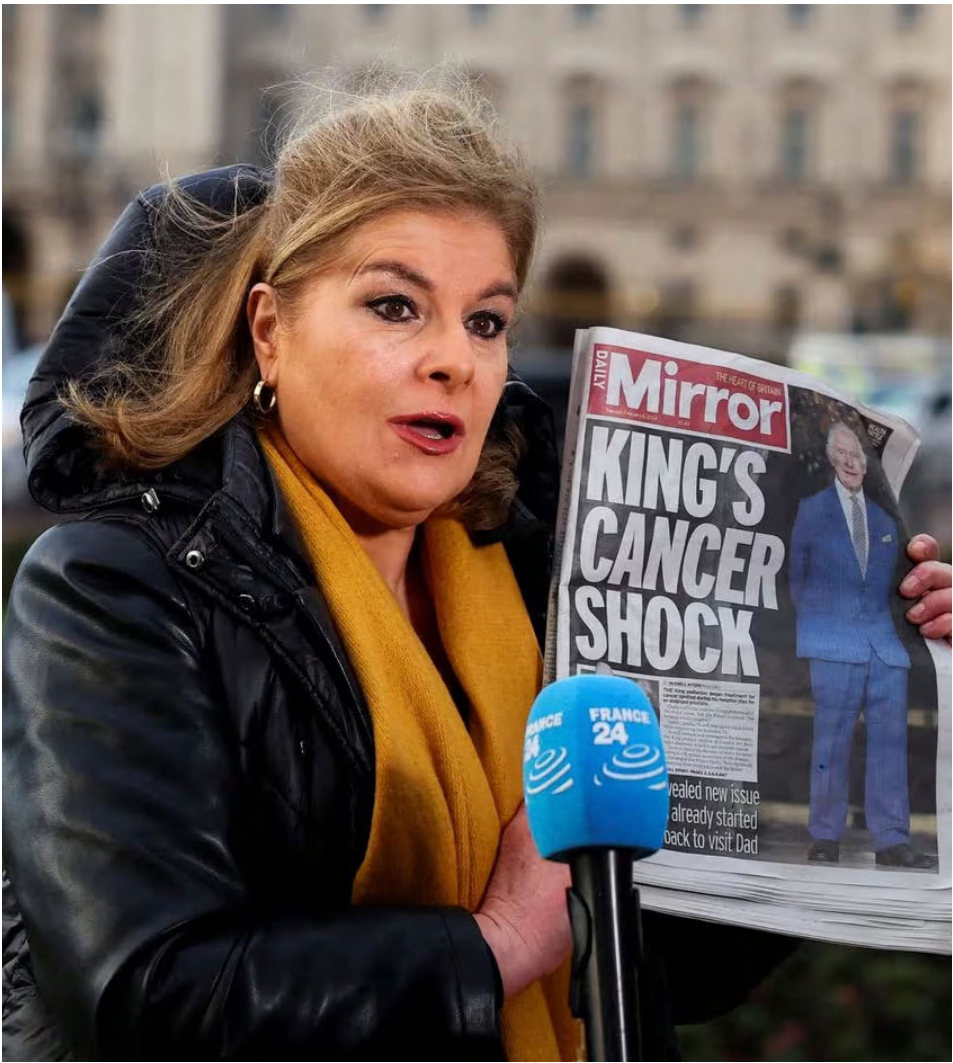
▲ A member of the media holds a copy of the "Daily Mirror" newspaper while working outside Buckingham Palace, after it was announced that Britain's King Charles has been diagnosed with cancer, in London, Britain.