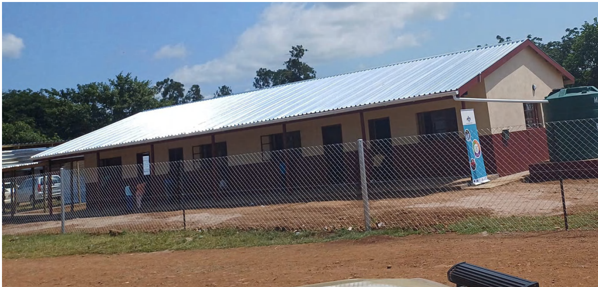
▲ The newly opened Maphiveni school which currently has 48 grade 1 pupils.

The swift action, with renovations commenced on January 10th, demonstrated the collective commitment to ensuring every child has access to quality education as now 48 have begun the grade one lesson in the school.