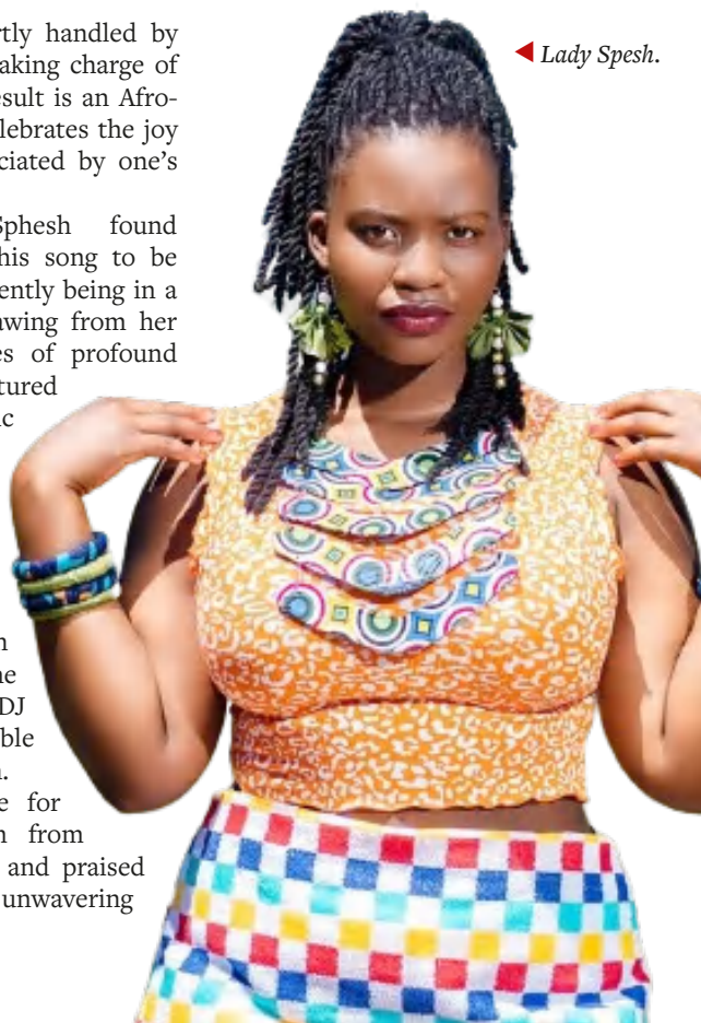
◀ Lady Spesh.

She expressed gratitude for the opportunity to learn from these talented individuals and praised the entire team for their unwavering support.