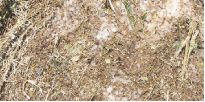
▲Remains of the hail on some fields.