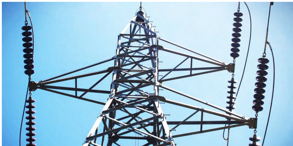
▲ Electricity consumption grew by a marginal 0.5 per cent to 1,129.4 GWh in the review period, from 1,123.6 GWh in the previous year

Some of these projects will include the ongoing Ezulwini water project, and new projects such as Lomahasha – Namaacha, Manzini Water Supply (Lot 1 and 2), and Shiselweni project.