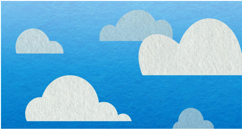
▲Bluesky looks and functions like Twitter at the outset, but the platform stands out because of what lies under the hood.

Bluesky looks and functions like Twitter at the outset, but the platform stands out because of what lies under the hood. The company began as a project inside of Twitter that sought to build a decentralized infrastructure called the AT Protocol for social networking. As a decentralized platform, Bluesky’s code is completely open source, which gives people outside of the company transparency into what is being built and how. Developers can even write their own code on top of the AT Protocol, so they can create anything from a custom algorithm to an entirely new social platform.