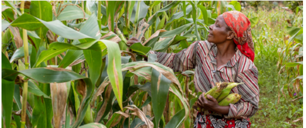
▲ A woman harvests green maize in this undated picture.

In the 2022/23 growing season, maize was affected because the season was plagued with a plethora of challenges that proved detrimental