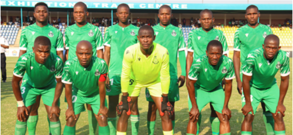
▲ Green Mamba hope to turn the tables after dropping to fourth spot in the Premier League.