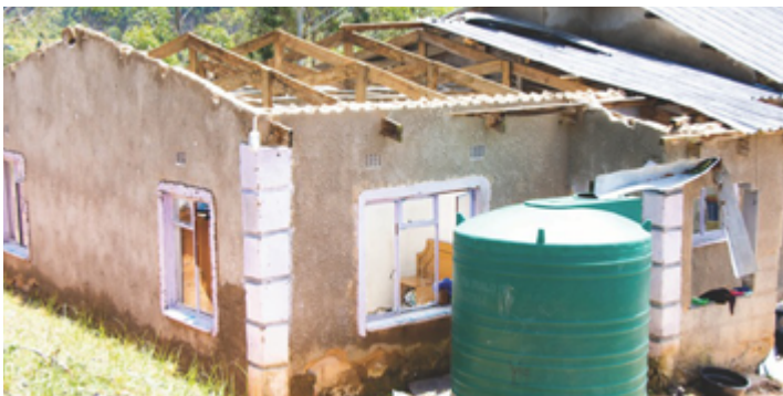
▲Roofing of a homestead was blown off during the storm.

In addition to the residential damage, household assets including furniture and vehicles were also affected by the storm. The storm also caused damage to critical infrastructure, including two schools, businesses, telecommunication systems, and electricity lines, resulting in power outages. Roads were also affected by fallen trees and