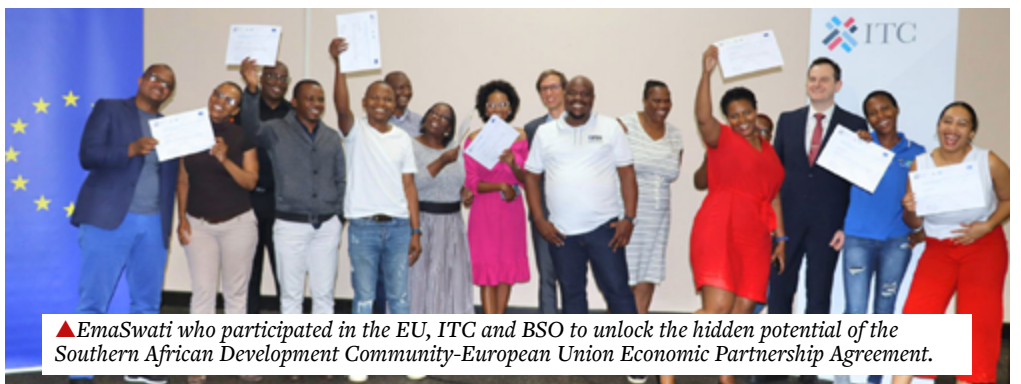
▲ EmaSwati who participated in the EU, ITC and BSO to unlock the hidden potential of the Southern African Development Community-European Union Economic Partnership Agreement.

This initiative is aimed to equip them with the knowledge and tools to effectively advise local companies on identifying promising trade opportunities in the EU market, navigating the intricate world of origin criteria to qualify for preferential access, and leveraging online tools and resources for market and regulations information.