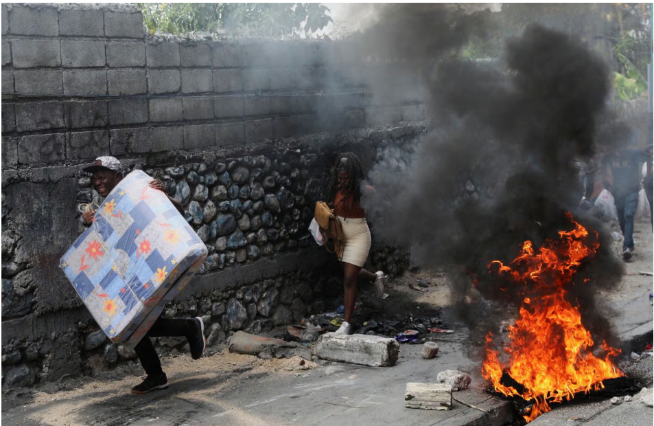
▲ People react as they walk near a burning barricade set up in protest against the government and calling for the resignation of Prime Minister Ariel Henry, in Port-au-Prince, Haiti.