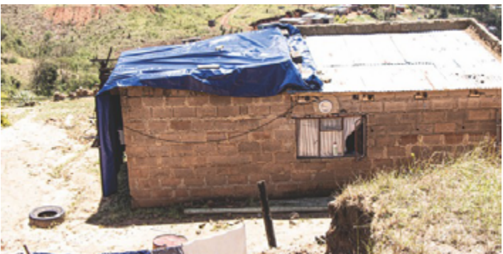
▲A tarpaulin is used as roofing on a damaged house.