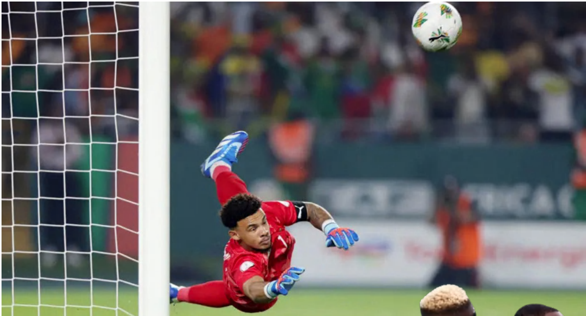
▲South Africa Goalkeeper Ronwen Williams saved an incredible four penalties against Cape Verde. (Right) Nigeria players celebrating a goal.

Bafana's last appearance in a Cup of Nations semifinal came in Lagos where they were swiftly dealt with by the Super Eagles, who scored in the first minute through Tijani Babangida. He ran at the Bafana defence to score a superb individual effort. Bafana had disposed of the co-hosts Ghana in the previous round and looked to have strong credentials as they looked to reach a third successive final. But it was a nightmare game for many in the side, notably Mark Fish and John Moshoeu, with little going right for Bafana. The Dutch-based Babangida then added a second just past the half-hour mark, curling the ball into the right side of the goal as he sprinted down the left, to effectively end any contest. South Africa went onto edge Tunisia on penalties in the third place play off while Nigeria lost on post-