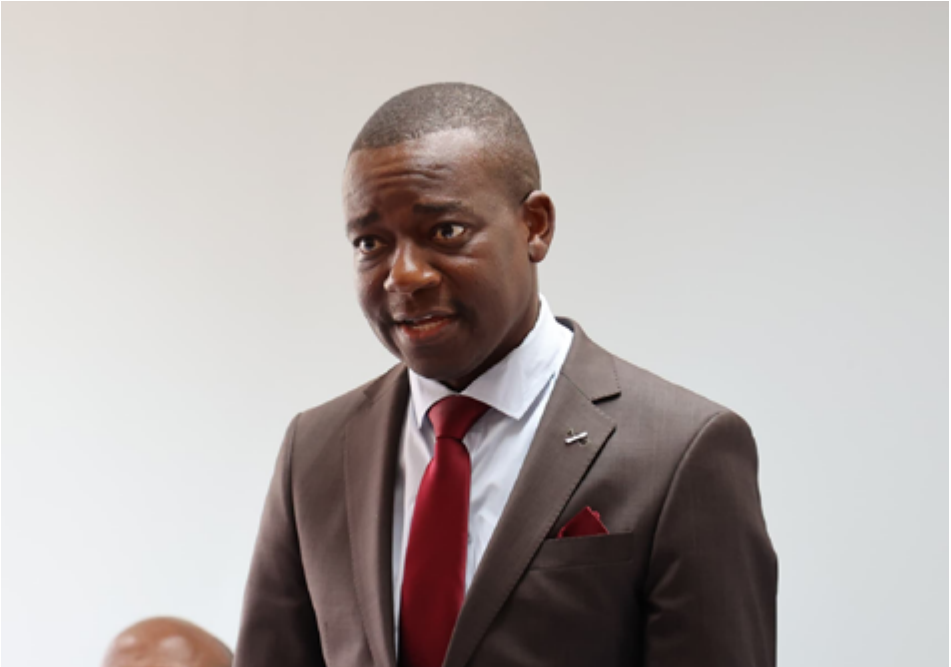
▲ Minister of Sports, Culture and Youth Affairs Bongani Nzima.

Ntiwane said the event will start at 8am with a walk run that will cover 8km.