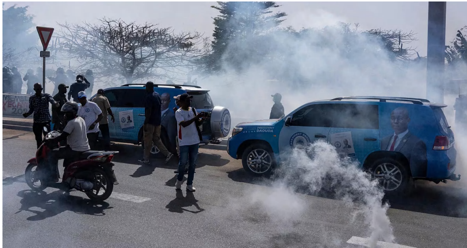
▲ Senegal's parliament on Monday voted to hold a postponed presidential election on Dec. 15 in the face of public outcry that led some opposition lawmakers to blockade proceedings until security forces intervened.

back elsewhere on Monday. At least three of the 20 presidential candidates submitted legal challenges to the delay, Constitutional Council documents showed. Two more candidates have vowed to challenge it via the courts.