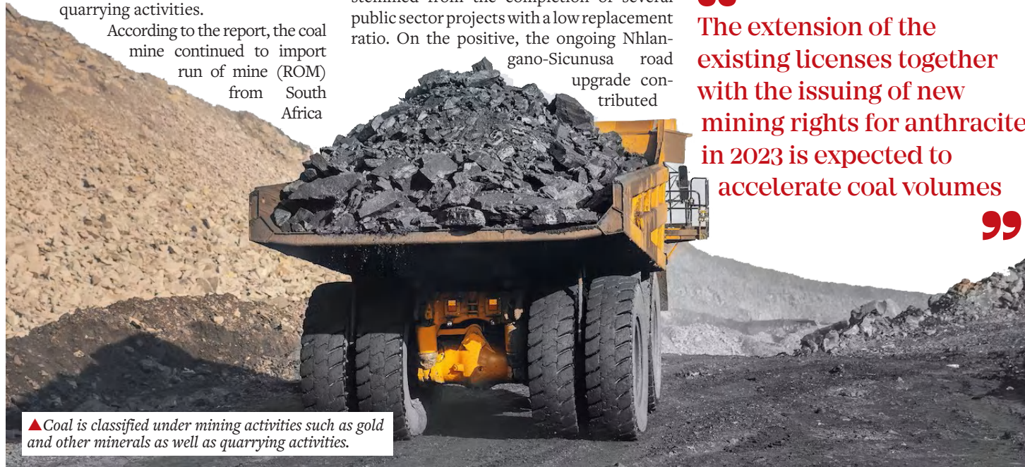
▲ Coal is classified under mining activities such as gold and other minerals as well as quarrying activities.