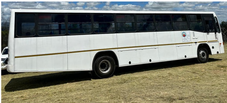
▲ The E2.1 Million bus handed over to Macudvulwini Multipurpose Cooperative through RDF.