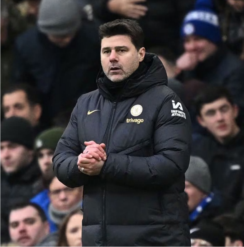
▲ Chelsea manager Mauricio Pochettino

Pochettino, however, insists he has the support of the owners and has no issues with any of his players. "I haven't (heard) anything in another way. I received very good texts