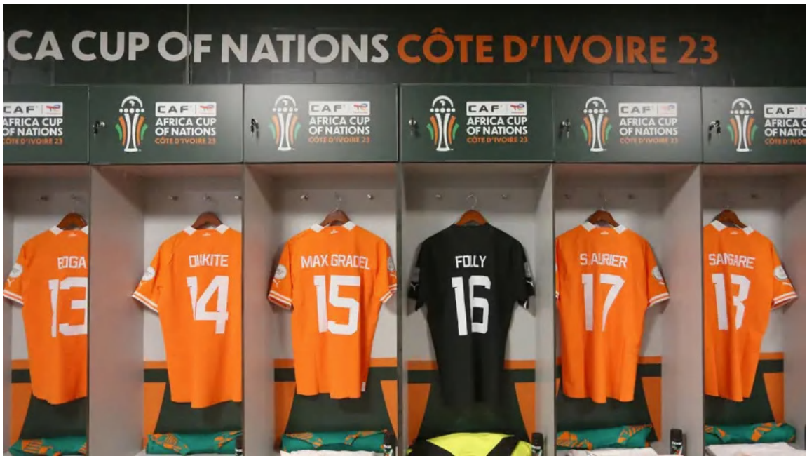
▲The Ivory Coast kit in the changeroom. (Left) DRC players.

pened. After all that we endured, we are no longer afraid of anything," said influential Ivorian midfielder Seko Fofana.