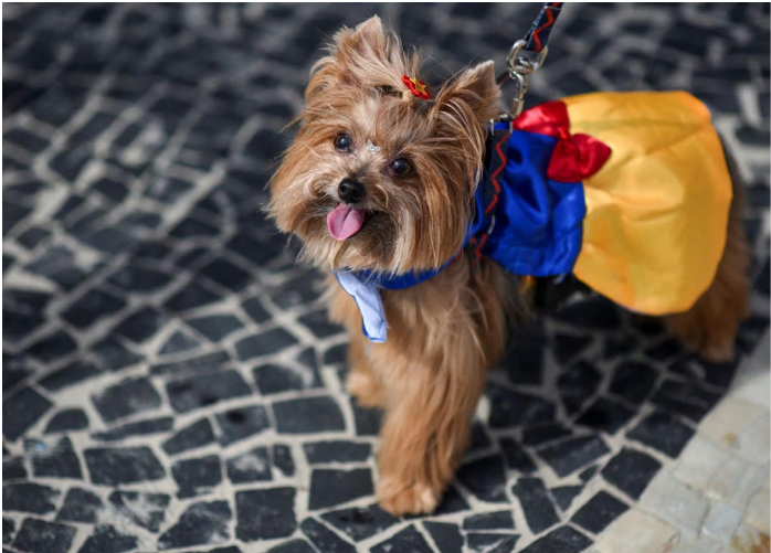
▲ A dog wears a costume at the “Blocao” dog carnival parade, during pre-carnival festivities in Rio de Janeiro, Brazil.