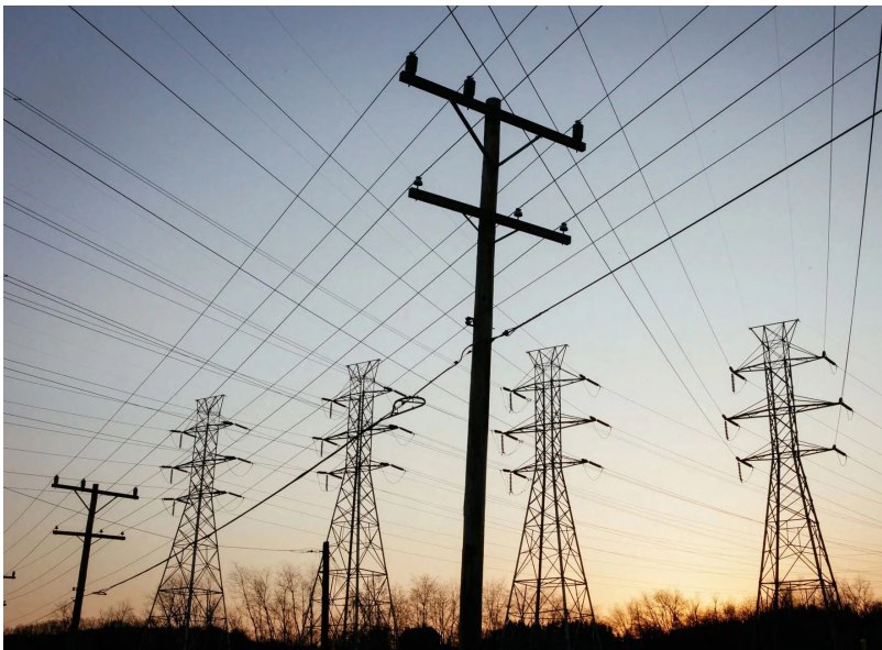
▲ Electrical power lines.

This comprehensive legal review aims to ensure the new laws are in line with current policies and international standards. This modernization will create a supportive en-