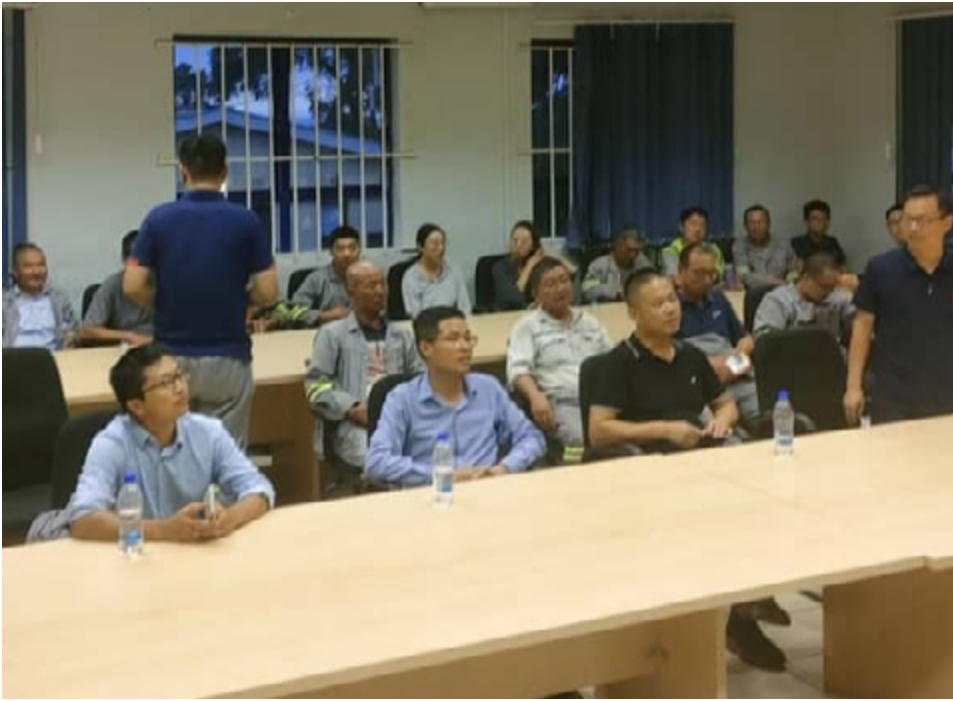
▲Some of the Chinese nationals working at the Mpakeni Dam project.

and further advised to arrange legal representation for their upcoming trial, scheduled to be held on April 8, 2024.