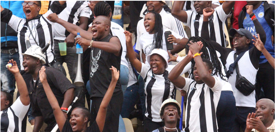
▲ Mbabane Highlanders supporters celebrate the equalising goal against Ezulwini United.