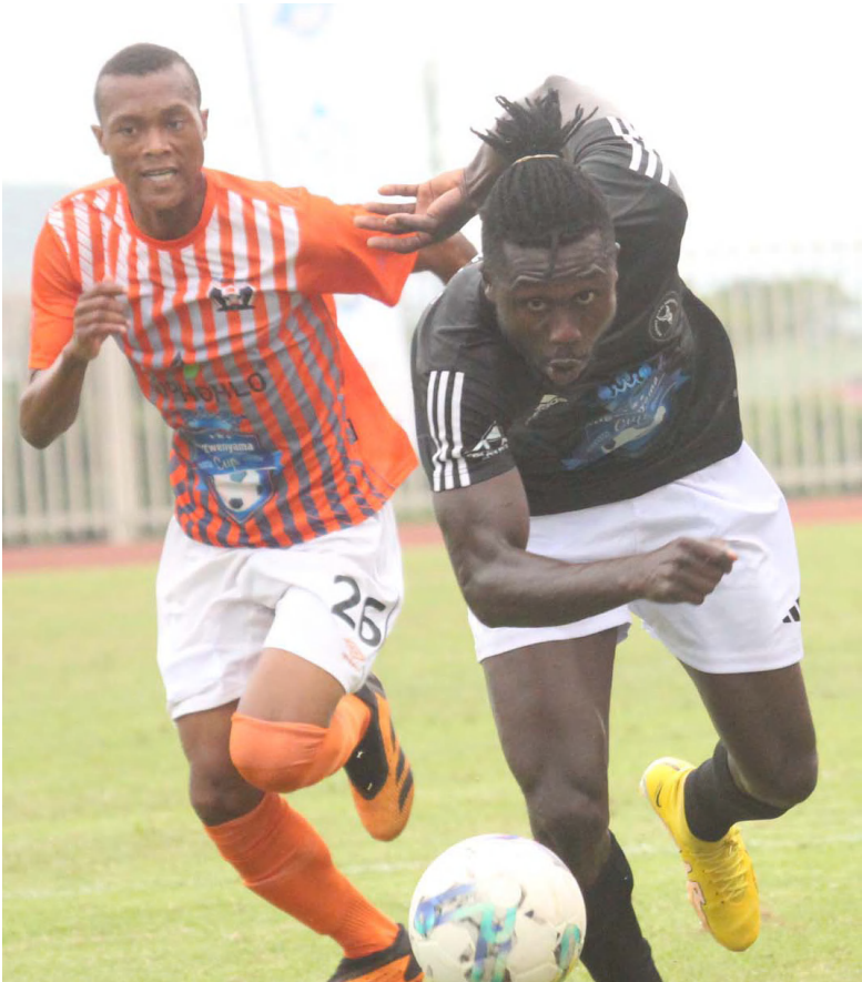
▲ Mbabane Highlanders Primpong runs with the ball during the game against Ezulwini United.