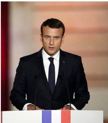
▲ France President Emmanuel Macron.

in France, one of Europe's strongholds for far-right anti-immigration parties. Darmanin said, however, that "there is no question of doing this for other territories of the Republic."