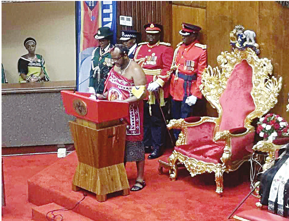
▲ His Majesty King Mswati III making his Speech from the Throne 2024.

His Majesty also praised the efforts of the previous parliament for setting the stage for a strong economic start in 2024. "We also recognise the remarkable achievements of those who came before you. their efforts have positioned the country favourably for a strong 2024 economic start." The King asserted. "You are urged to establish a collab-