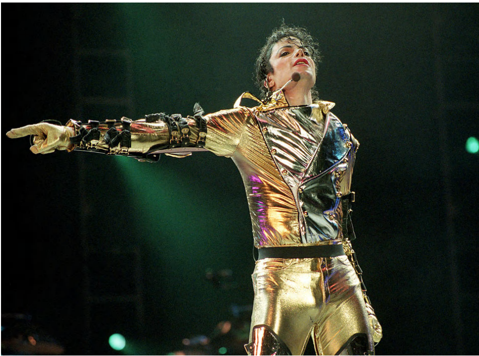
▲Late singer Michael Jackson.