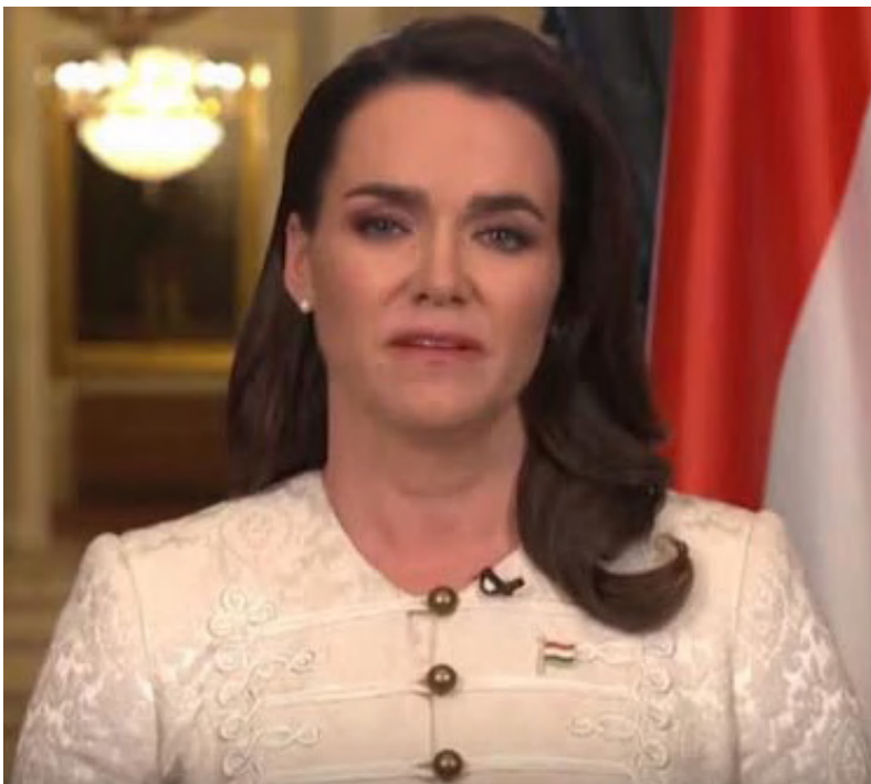
▲ Hungarian President Katalin Novak resigned on Saturday after coming under mounting pressure to pardon a man convicted of helping to cover up sexual abuse in a children's home.

"I made a decision to grant a pardon last April believing that the convict did not abuse the vulnerability of children whom he had overseen. I made a mistake as the pardon and