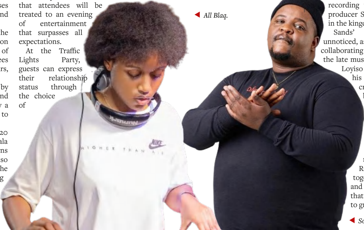
◀ All Blaq.

For those looking to fast-track their love connections, red, green, and orange Traffic Light wristbands will be available at the door.