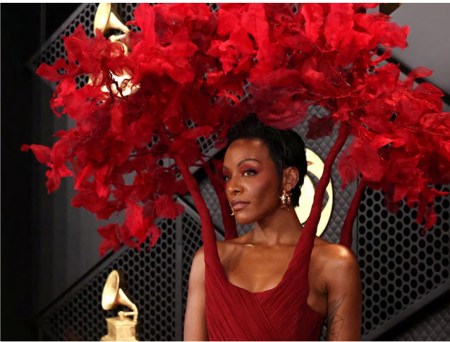
▲ Dawn Richard poses on the red carpet as she attends the 66th Annual Grammy Awards in Los Angeles, California, U.S.