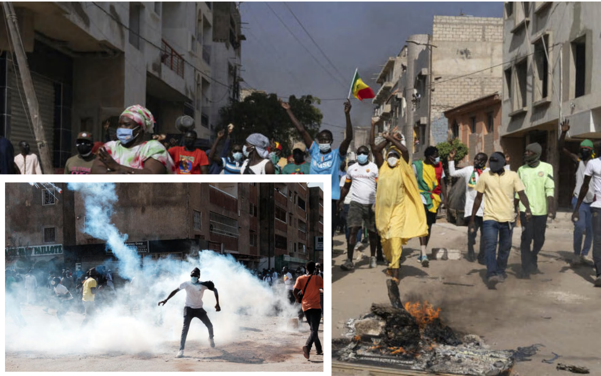
▲ On Saturday (Feb. 10) at least two people were confirmed dead after protests were held across Senegal, Friday.

stand. In an interview Friday (Feb. 09), he said he wants to rapidly organize a national dialogue that will pave the way for a peaceful electoral process. Opposition lawmakers have filed an appeal at the Constitutional court while presidential candidates appealed to the Supreme Court. A new round of protests is planned for Tuesday (Feb. 13). Senegalese in the diaspora have also taken to the streets. In France where a large community of Senegalese lives, crowds gathered Saturday (Feb. 10) in major cities including Paris, Bordeaux (South west) and Nice (south). (Africanews)