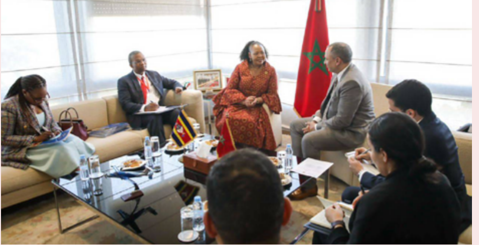
▲Minister of Foreign Affairs and International Cooperation Pholile Shakantu and the Moroccan Minister of Industry and Trade Ryad Mezzour in discussion whilst their delegation looks on.

The Industrial Cooperation Protocol and the joint declaration of intent on health sector cooperation were signed in Rabat in 2020 by the then Eswatini Minister of Foreign Affairs and International Cooperation and current Deputy Prime Minister Thulisile Dladla, African Cooperation and Moroccans expatriates, following bilateral talks. In the same year, Eswatini opened its embassy in Rabat. The Kingdom of Eswatini Embassy in Morocco is also accredited to Benin, Burkina Faso, Cape Verde, Chad, Egypt, Guinea, Ivory Coast, Liberia, Libya, Mali, Mauritania, Niger, Sierra Leone, Sudan, Togo, Ghana and Tunisia