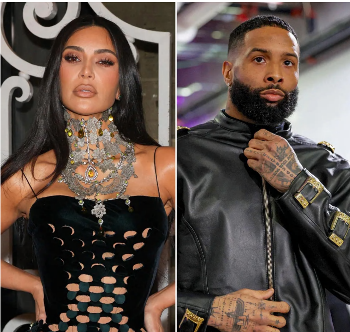
▲Kim Kardashian and Odell Beckham Junior.