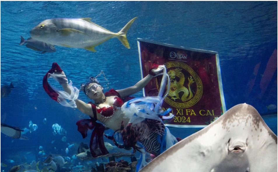
▲ A diver dressed as a “mermaid of the dragon seas” swims at the oceanarium in Manila Ocean Park, as part of its Lunar New Year celebrations in Manila, Philippines.