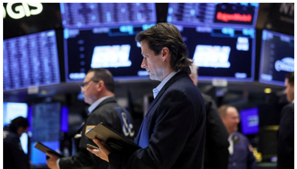
▲ Traders work on the floor at the New York Stock Exchange (NYSE) in New York City, U.S.

Inflation in Germany, Europe's biggest economy, eased in January to 3.1 per cent, adding fuel to bets on when the European Central Bank will begin easing rates.