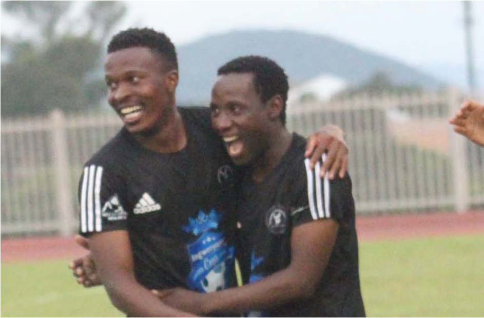
▲ Mbabane Highlanders beat Ezulwini United 4-3 after penalties to reach the semi-finals of the Ingwenyama Cup.

Ezulwini United had taken the lead two minutes before the hour-mark with