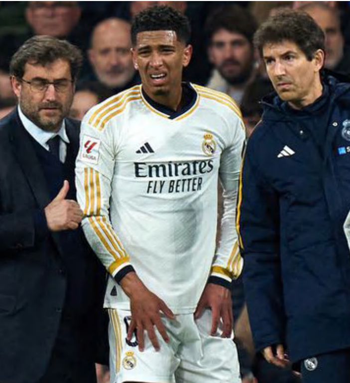
▲ Jude Bellingham suffered an ankle sprain during Saturday's 4-0 victory over Girona, Real Madrid said on Sunday.

April, but made no mistake from the spot after he had been brought down by Alphonse Areola. Rice led West Ham to Europa Conference League glory in his final game for the club before moving to north London for a fee in excess of £100 million. The England international was given a clear demonstration of why he had to make the move to fulfil his ambition of more silverware as another wicked Rice delivery was nodded in by Gabriel. Trossard pilled on the West Ham pain in first-half stoppage time as he cut inside to fire brilliantly into the top corner. That goal was the trigger for many of the home support to leave for the afternoon as the second half was played out in front of vast swathes of empty seats. Moyes made two changes at halftime to try and stop the bleeding as Calvin Phillips and former Arsenal defender Konstantinos Mavropanos were introduced. By the visitors cut loose again with two goals in two minutes just after the hour mark. Saka's first had been his 50th Arsenal goal and he cut inside to fire home in trademark fashion on his left foot. Rice then rubbed salt in West Ham wounds with a stunning finish into the top corner from outside the box.