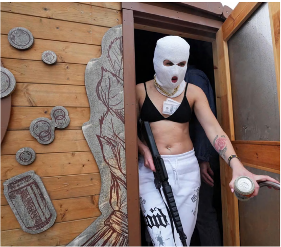
▲ A woman exits a sauna during the European Sauna Marathon in Otepaa, Estonia.