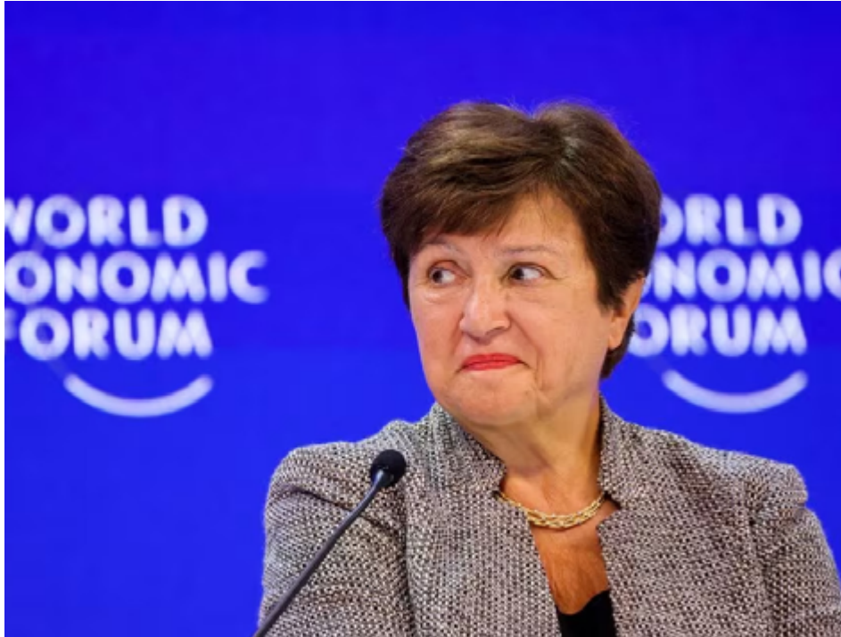
▲ International Monetary Fund (IMF) Managing Director Kristalina Georgieva attends the 54th annual meeting of the World Economic Forum, in Davos, Switzerland.

Georgieva said economies neighbouring Israel and the Palestinian territories saw the conflict weighing on tourism revenues, while Red Sea attacks weighed on freight costs globally.