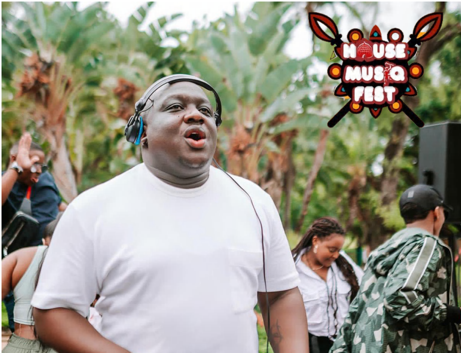
▲ South African DJ Darque will perform at House Musiq Fest.

Beyond the music, House Musiq Fest offers a plethora of experiences for all festival goers. From delectable food and beverages to artisanal crafts, therapy and body wellness, health and wellbeing,