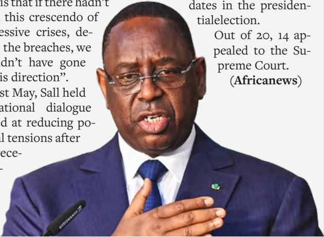
▲ Senegal President Macky Sall.

ots. However, rights groups continued to accuse authorities of repressing the media, civil society and the opposition. Senegal's president now believes a new dialogue can solve the crisis the country grapples with. “The dialogue for me can start anytime from next week, but I think there are prerequisites if we want to have success. First among these prerequisites is to establish trust between the actors, bring peace and enter a dialogue,” Senegal's president said. “So within one or two weeks maximum if the actors accept and I see a lot of interest from more and more actors who are okay with the idea of dialogue, that means we can get there quickly.” Opposition lawmakers have filed an appeal at the Constitutional court. The decree voted by Parliament to postpone the election is also contested by candidates in the presidential election. Out of 20, 14 appealed to the Supreme Court. (Africanews)