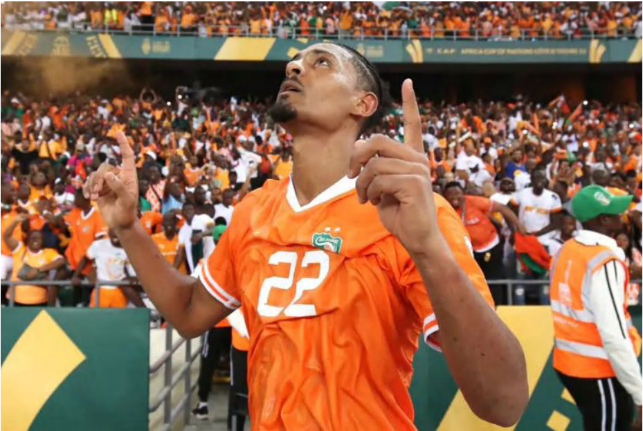
▲ Cote d'Ivoire's Sebastien Haller.

Yet interim boss Emerse Fae inspired a spirited fightback to reach the final. This resilient collective spirit shone through again as they recovered from Troost-Ekong's opener. Nigeria's defence looked typically defiant until Kessie rifled in a crucial equaliser. With penalties looming, Haller then struck the decisive blow, firing home