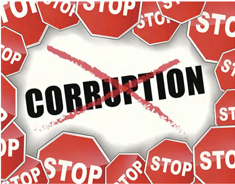
▲ Prime Minister Russell Dlamini reiterated government’s commitment to supporting the police service in its fight against crime and ensuring the nation’s safety and security.

He urged the REPS to collaborate with the government to achieve these goals and move the country forward.