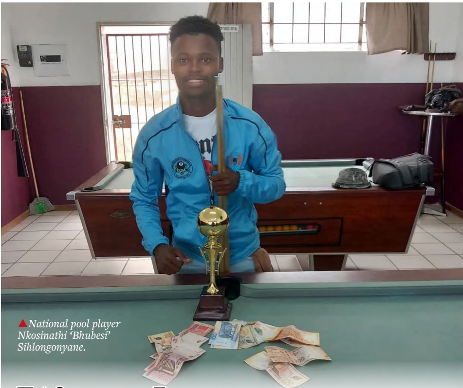
▲ National pool player Nkosinathi 'Bhubesi' Sihlongonyane.