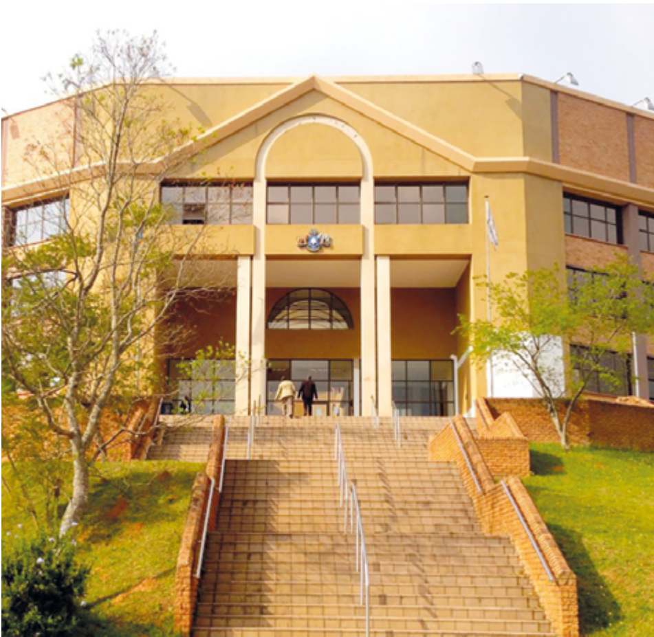
▲ High Court of Eswatini.

I am still at school and with hopes of a bright future as a young person,” he submitted. He further told the court that he was born with a strained breathing condition that requires that he does not get exposed to humid conditions, referencing the Piggs Peak holding cell which he said he struggles to breathe normally. The teenager undertook to adhere to all bail conditions, further acknowledging the seriousness of the charges he faces. He noted that, however, there has not been any evidence against him that can influence him to flee the country whilst out on bail. “Although I have been charged with an offence where violence is a component, I have no propensity to such. I have never been violent or threatened anyone with violence, neither have I been charged with such before,” he submitted. He further said he conceded that murder is a serious offence which attracts a heavy sentence, however, the prospects of being convicted of murder and assault are negligible. He added that his community would not be outraged therefore his release on bail would not lead to public disorder, and his safety would not be jeopardised. Bail was granted at E15,000 and was ordered to pay E3,000 cash and the rest as surety. He is expected to report at Buhleni Police Station every last Friday of the month.