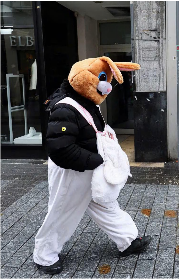
▲ A reveller in a rabbit costume walks during a celebration of “Weiberfastnacht” (Women’s Carnival), marking the start of the street Carnival festivals in Cologne, Germany.