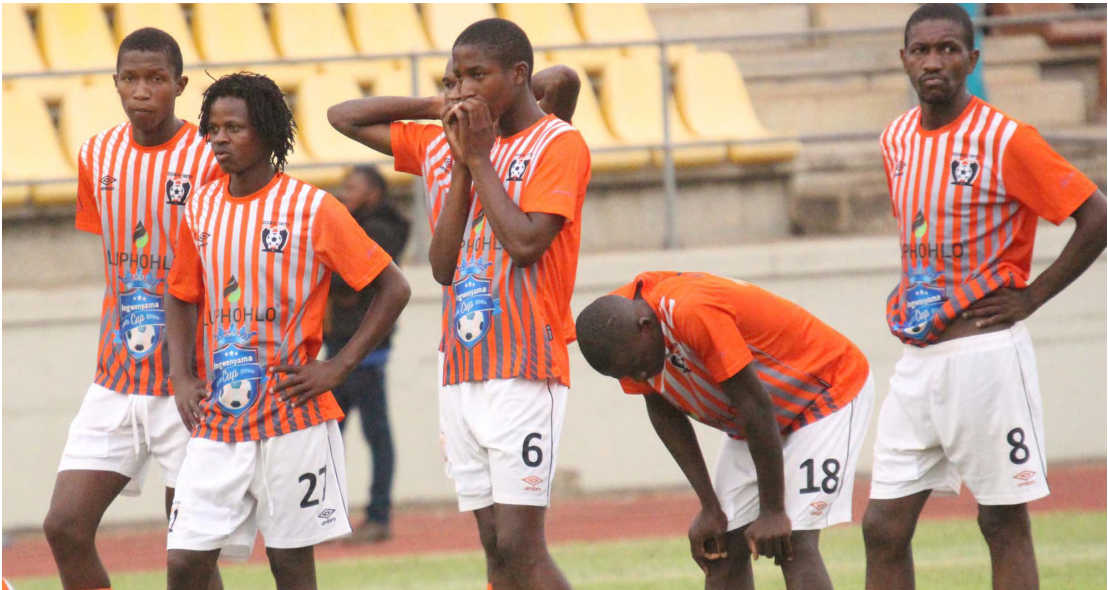
▲ Leaders from five African countries who were present at the official opening of the Transform Africa Summit 2023