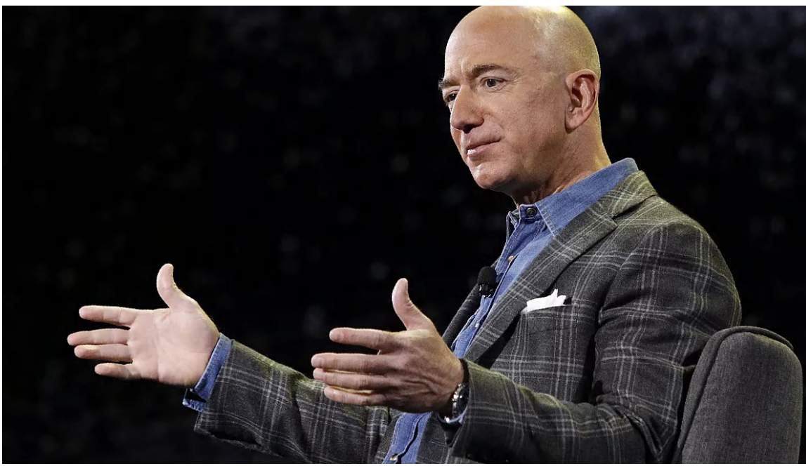
▲ Tech billionaire Jeff Bezos.

While the exact motive behind Bezos’ decision to offload shares is unknown, the massive sale does