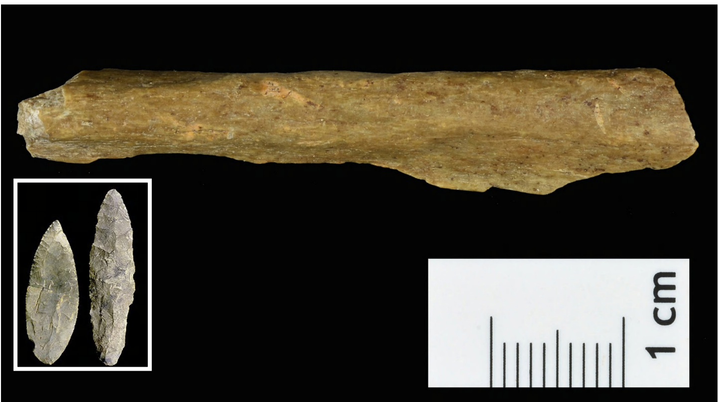
▲ A human bone fragment from the new excavations at Ranis. Stone tools from the Lincombian-Ranisian-Jerzmanowician technocomplex at Ranis. (Inset) The partial bifacial blade point (left) is characteristic of the stone tools produced by hominids, now identified as modern humans, who occupied the Ranis cave.