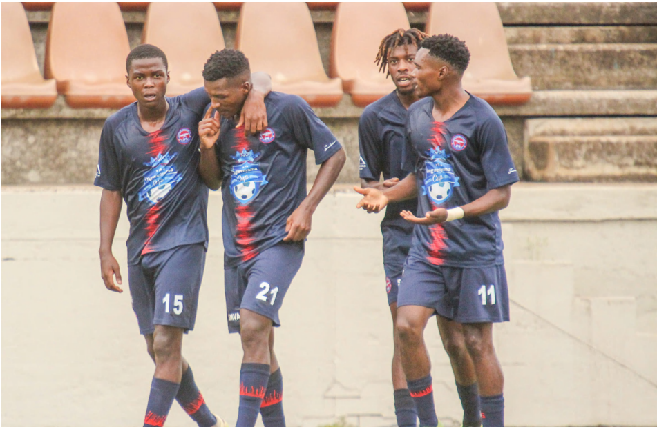
▲ Mbabane Swallows players celebrate the 4-0 win over Pigg's Peak Rangers in the Ingwenyama Cup quarter-finals on Sunday at Mavuso Sports Centre.