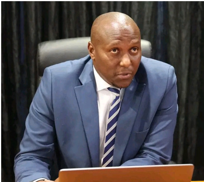
▲ Prime Minister Russell Dlamini.