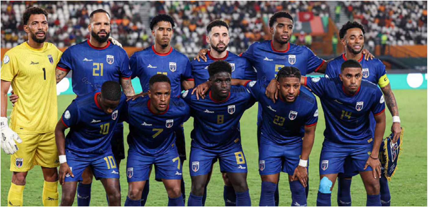
Cape Verde National Football Team aka Blue Sharks.

The 'Blue Sharks' of Cape Verde qualifying for the quarter-finals of the Africa Cup of Nations 2023 is a true example of how proper leadership, intelligent planning and genuine support from government can be the foundation of success inspite of small nation in size.