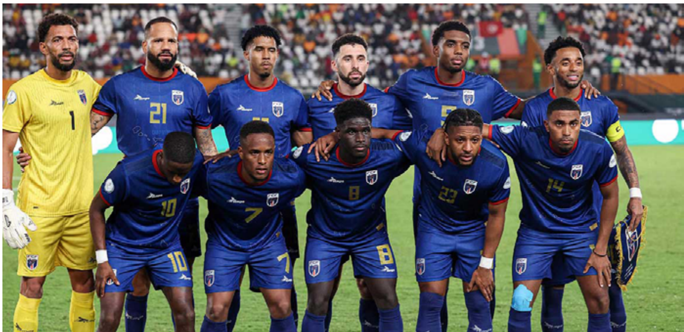
Cape Verde National Football Team aka Blue Sharks.

The 'Blue Sharks' of Cape Verde qualifying for the quarter-finals of the Africa Cup of Nations 2023 is a true example of how proper leadership, intelligent planning and genuine support from government can be the foundation of success inspite of small nation in size.