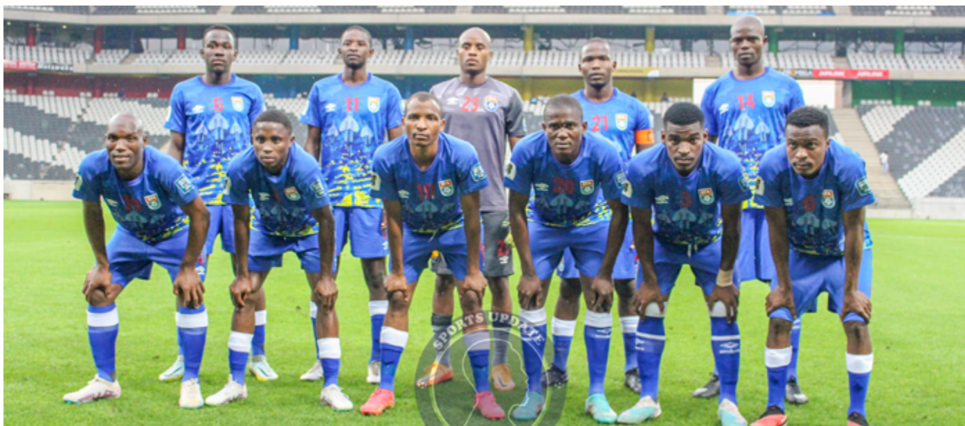
Eswatini National Football Team aka Sihlangu Semnikati.