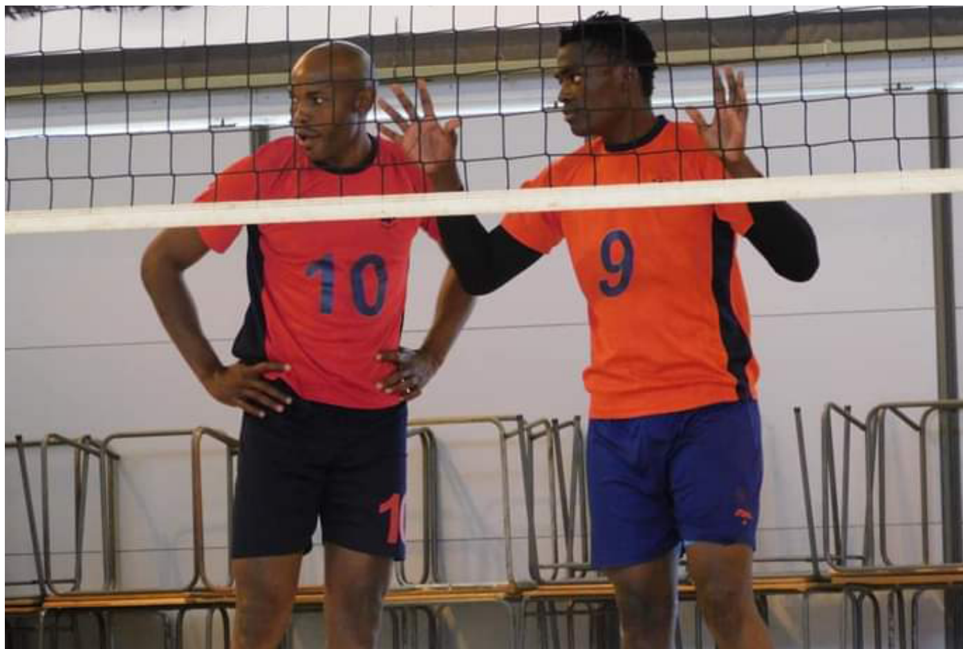
Volleyball Beach males and females teams during the recent African qualifiers.