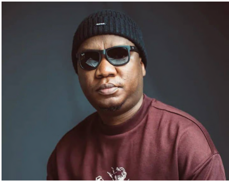
▲ DJ Cup.

emotional depth and relatability contribute significantly to its appeal. “We wanted to create a film that connects with viewers on a personal level,” he explained. The characters are portrayed with nuance, allowing audiences to see themselves in their journeys.