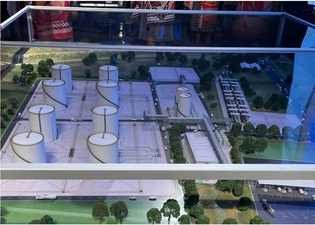
▲ A model of the proposed strategic oil reserve facility being funded by Taiwan.

The Taiwanese investor delegation, led by OIDC officials and representatives from the Taiwan External Trade Development Council (TAITRA), expressed optimism about Eswatini's