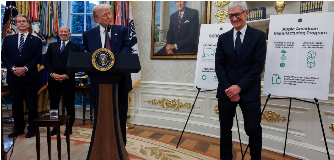
▲ Apple CEO Tim Cook reacts while U.S. President Donald Trump speaks, as they present Apple's announcement of a $100 billion investment in U.S. manufacturing, while U.S. Treasury Secretary Scott Bessent and Commerce Secretary Howard Lutnick stand.