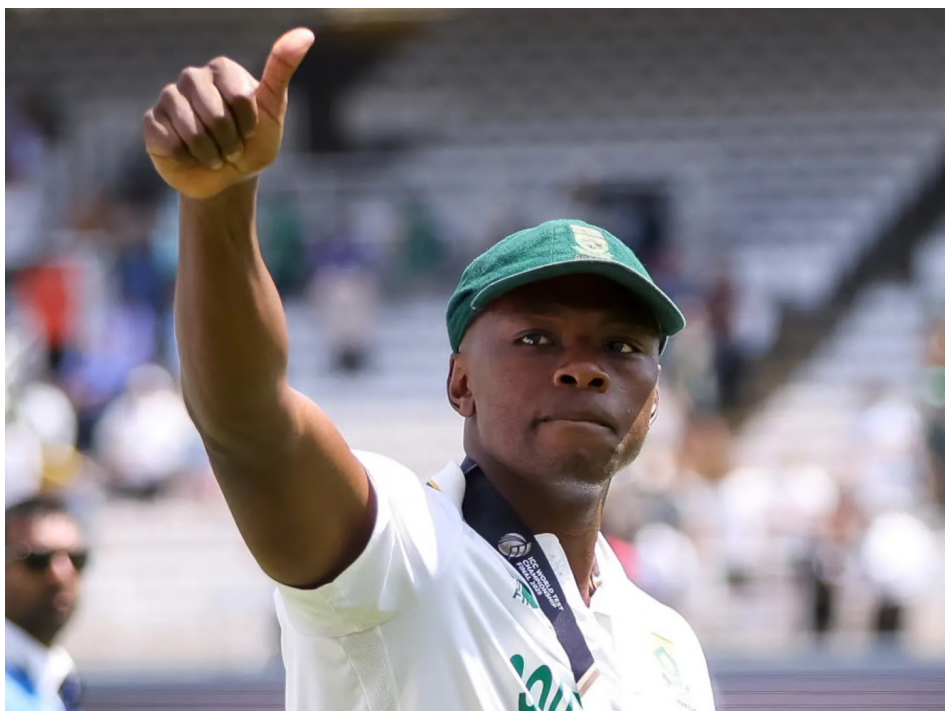
▲ South Africa's leading paceman Kagiso Rabada. 14-man squad.

"It's always some hard cricket being played, some good cricket," he said. "Whenever we play Australia, I always feel like they get the best out of us, because they're sort of in our faces. And I guess we like that." Test-capped players Cooper Connolly, Todd Murphy and Nathan McSweeney were also in the