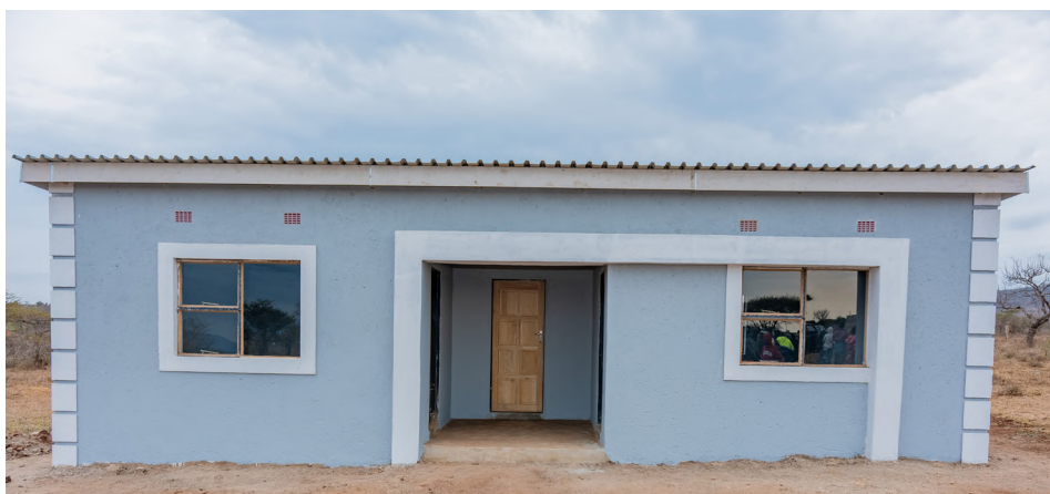
▲ One of the house which was handed over by the DPM built by Maloma Colliery.