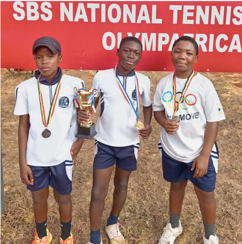
▲The tennis juniors national team.

a recent selection tournament held at the Olymp Africa Centre. “We look forward to the competition and our main comprises and our is to reach the semifinals. I am confident that the boys will perform well during the international assignment,” he said. The Coach also thanked the sponsor, Swaziland Building Society, for supporting their programs. “We are grateful to the support of the sponsor, which contributes towards the development of the sport in the country,” he said.