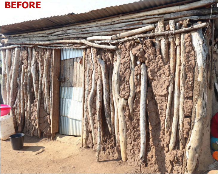
▲ Before and after pictures of one of the houses constructed by the National Disaster Management Agency.