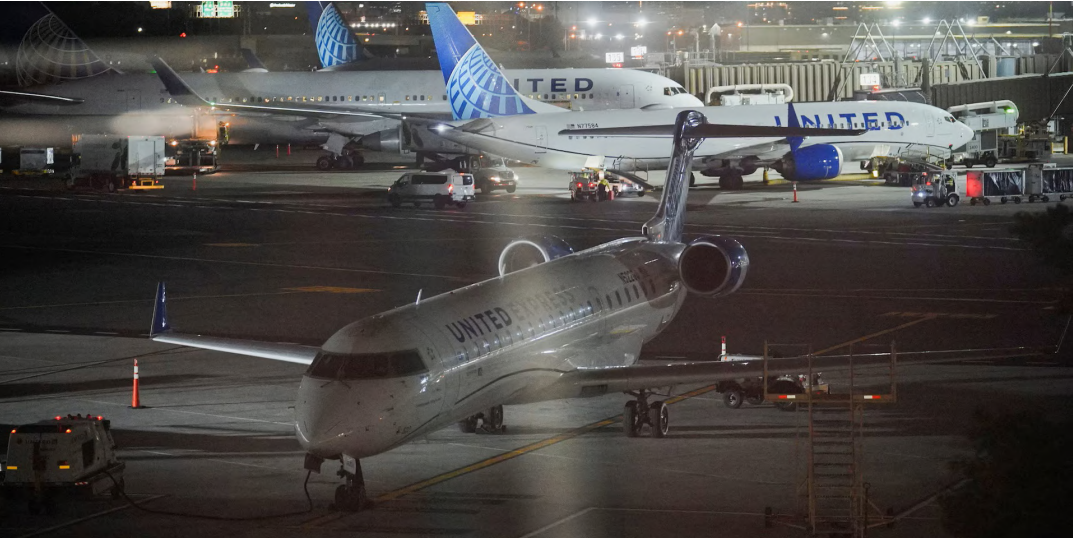
▲ United Airlines planes sit grounded due to a tech outage at Newark Liberty International Airport in Newark, New Jersey.