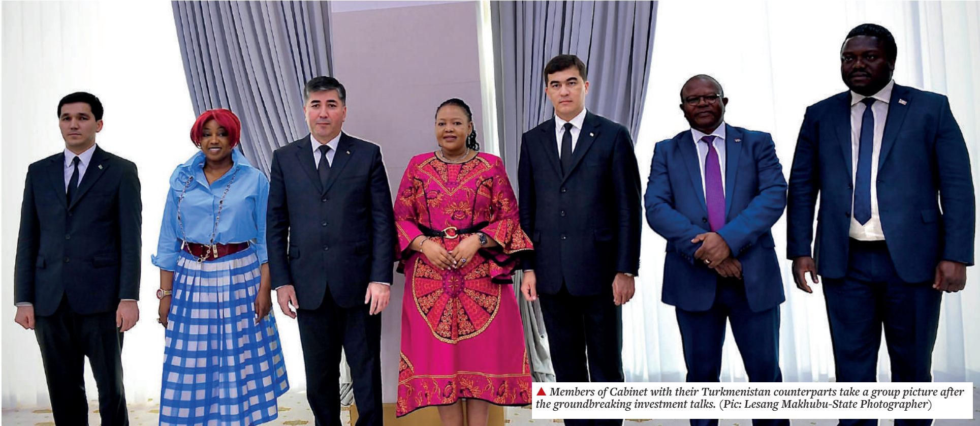
▲ Members of Cabinet with their Turkmenistan counterparts take a group picture after the groundbreaking investment talks.