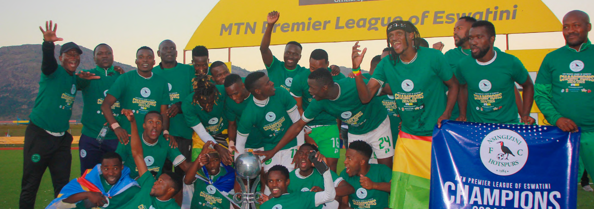
▲ Nsingizini players celebrating winning the league.