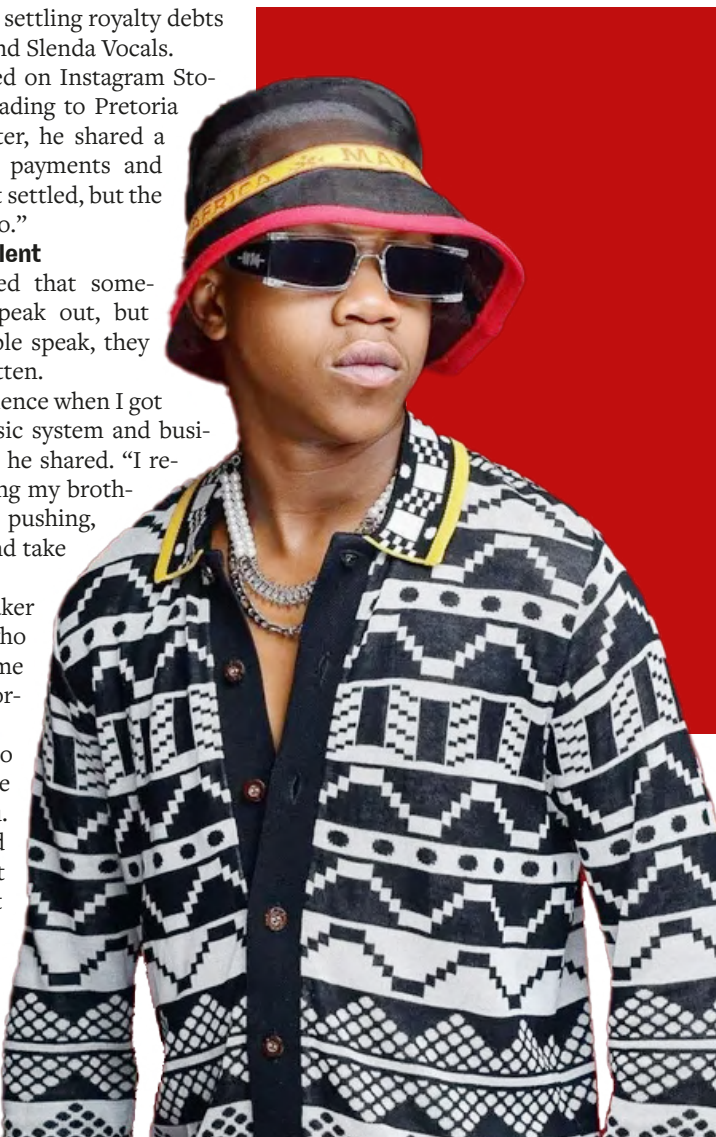
▲ Young Stunna, real name Sandile Fortune Msimango