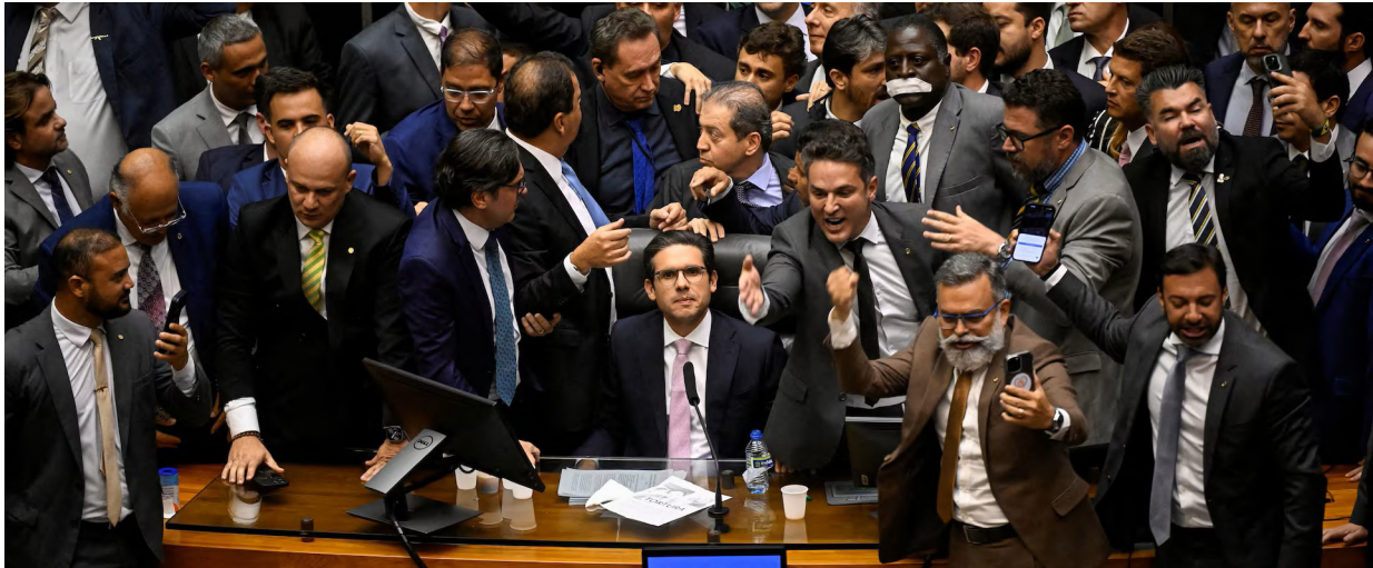
▲ President of the Chamber of Deputies Hugo Motta sits in his chair after the end of a protest by allies of former president Jair Bolsonaro that blocked the resumption of sessions after the mid-year recess in protest against the house arrest of Bolsonaro