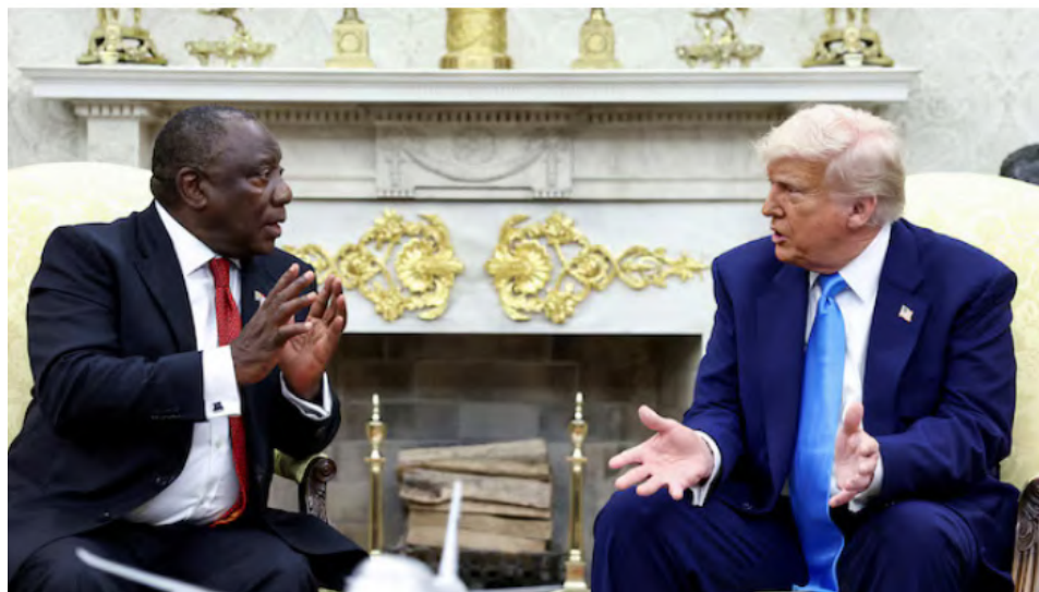
▲ South African President Cyril Ramaphosa held a telephone call with U.S. President Donald Trump.

"The two leaders undertook to continue with further engagements, recognising the various trade negotiations the U.S. is currently involved in," Ramaphosa's office said in a statement. "Respective trade negotiating teams will take forward more detailed discussions." (Reuters)