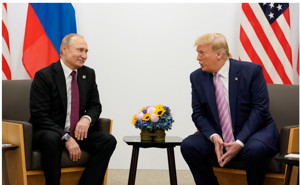
▲ Vladimir Putin and Donald Trump will meet in the coming days.

There has been no summit of U.S. and Russian leaders since Putin and Joe Biden met in Geneva in June 2021. Russia went to war in Ukraine in February 2022, citing threats to its own security and plunging relations into deep crisis. Kyiv and its Western allies cast