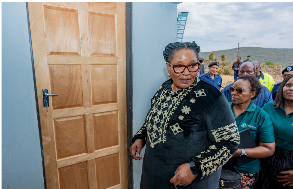
▲ The Deputy Prime Minister, Senator Thulisile Dladla during the opening of one of the houses.

The final stop was at Mndobandoba, where the Deputy Prime Minister handed over a two-room structure built for Zodwa Gamed-