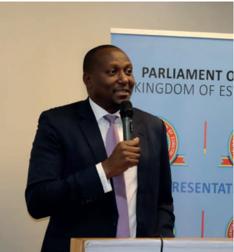
▲ Prime Minister Russell Dlamini.

By Siphesihle Dlamini siphesihled@rubiconmedia.group