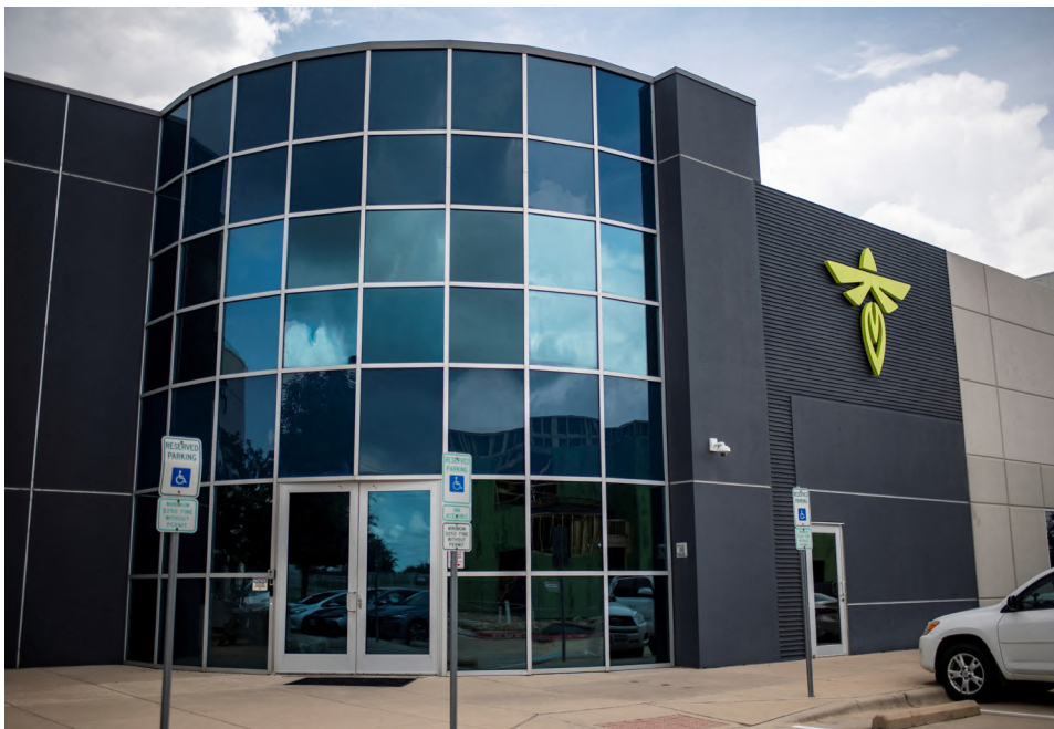
▲ Vladimir Putin and Donald Trump will meet in the coming days.

FIREFLY Aerospace (FLY.O), opens new tab secured a valuation of $9.84 billion after its shares surged 55.6% in their Nasdaq debut on Thursday, as investors continue to pour capital into companies aiding expansion of the U.S. space and defense program.