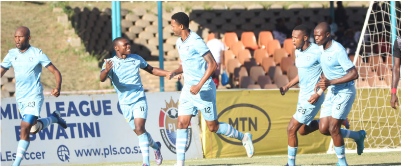
▲ Leopard players celebrating a goal.

WHO will it be for Nsingizini Hotspurs and Royal Leopard in the CAF interclub competi-tions? Surely, Nsingizini Hotspurs, tar-geting the group stage in the To-talEnergies CAF Champions League 2025/26, a draw against South Afri-ca rivals, including Mamelodi Sun-downs is not preferred. The draw is on Saturday, August 12, in Dar er Salaam for the first time ever. Both Nsingizini and Royal Leopard will be standing for Eswati-ni, the latter in the TotalEnergies CAF Confederation Cup, after win-ning the Ingwenyama Cup 2024/25 title, while Nsingizini lifted their first-ever league title. It has been officially confirmed by the Confederation of African Football (CAF) that all teams that qualified and registered their partic-ipation will know their preliminary