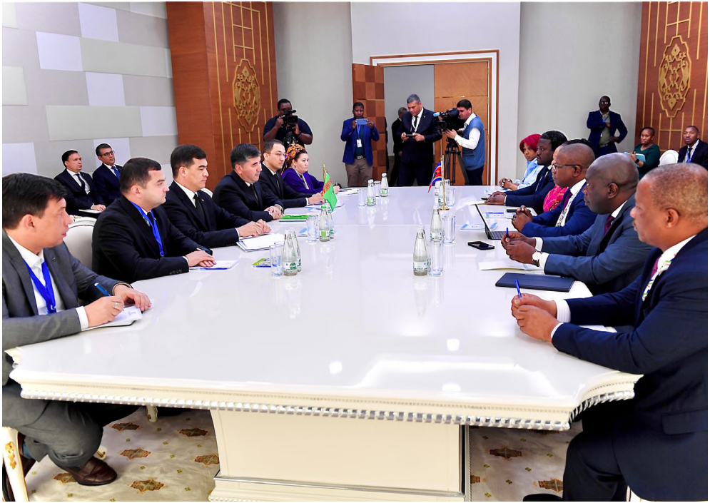
▲ Members of the Eswatini and Turkmenistan delegations during the high level discussions.