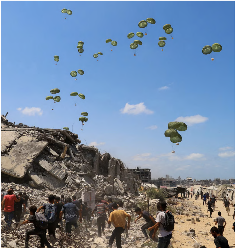
▲ Palestinians run towards parachutes carrying aid packages airdropped over northern Gaza Strip.