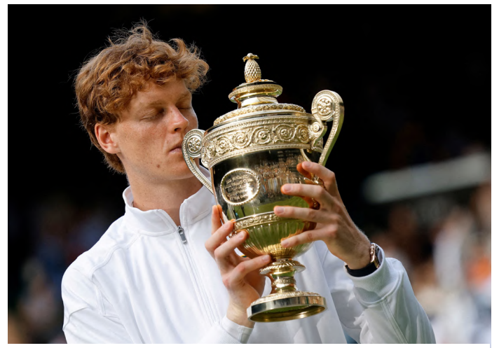
▲ World No 1 Jannik Sinner.

Sinner sported a protective sleeve on his right elbow when he practised with Christopher Eubanks on Wednesday, sparking concerns that he was still feeling the effects of an injury sustained during his title run at Wimbledon. (Supersport)