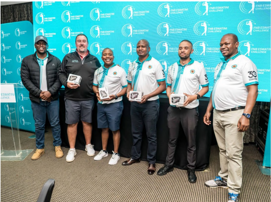
▲ The PRO AM runner up with their prizes.