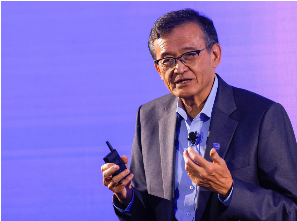
▲ Intel CEO Lip-Bu Tan makes a speech on stage in Taipei, Taiwan.