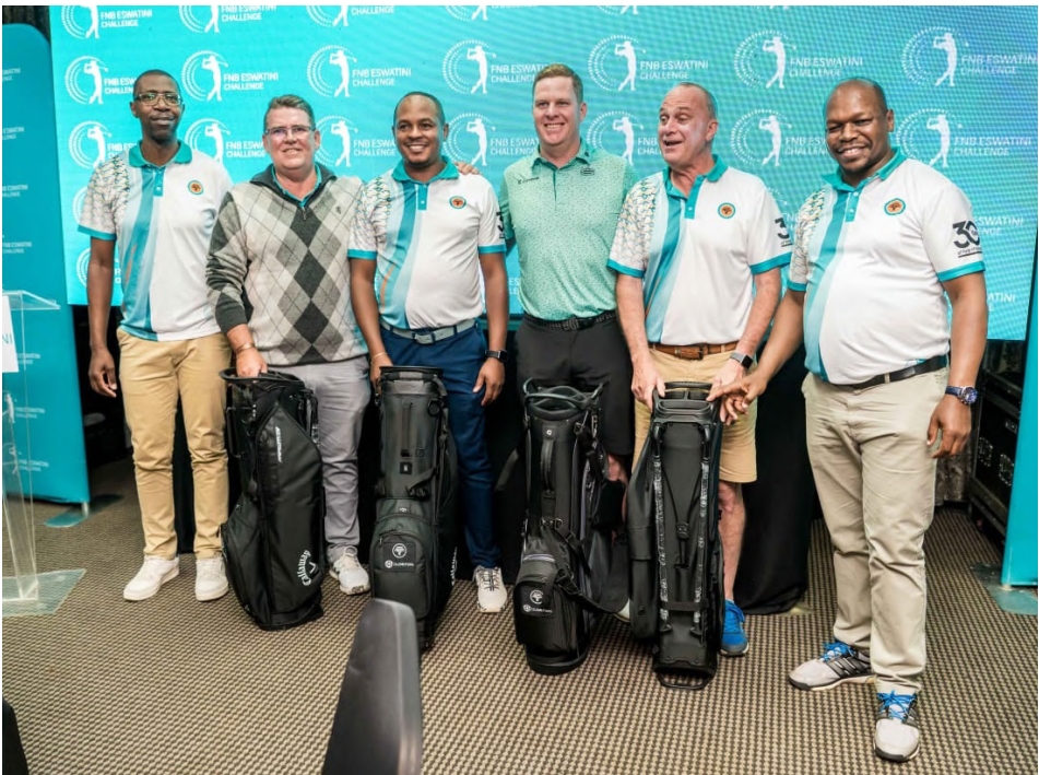
▲ The number one PRO AM team in the ongoing FNB Eswatini golf challenge.