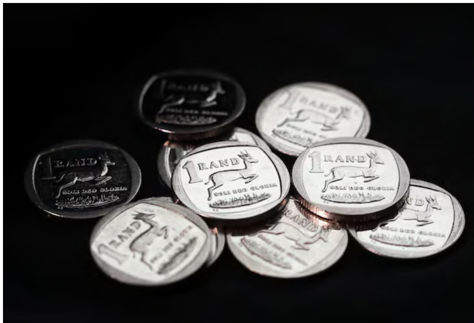
▲ At 0750 GMT the rand traded at 17.6850 against the dollar, up roughly 0.5% on Wednesday's close.