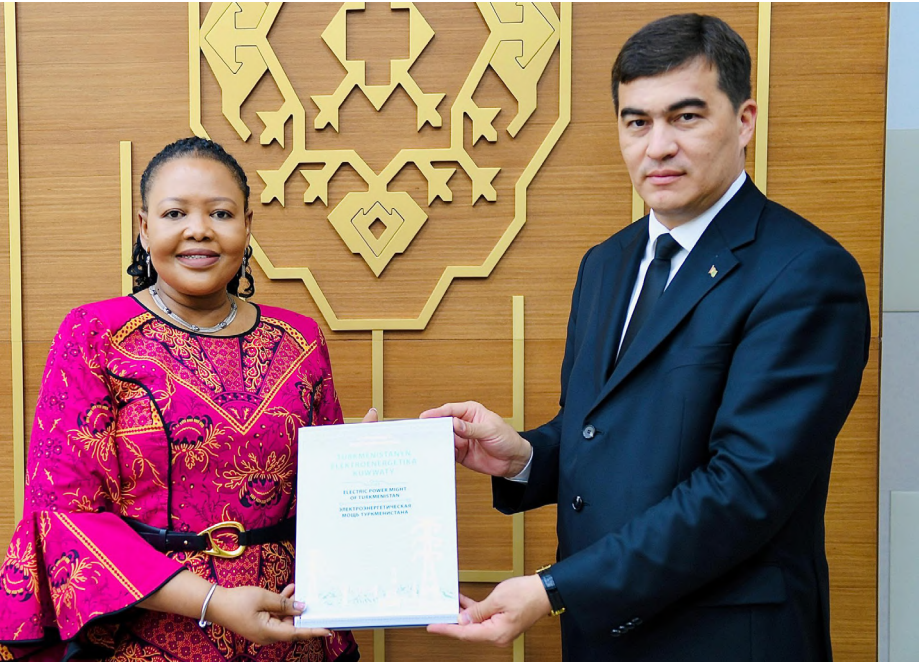
▲ Minister of Foreign Affairs and International Cooperation Pholile Shakantu, outlined key areas for collaboration, with a focus on information communication and technology (ICT), agriculture, mining, manufacturing, infrastructure and energy, among others.