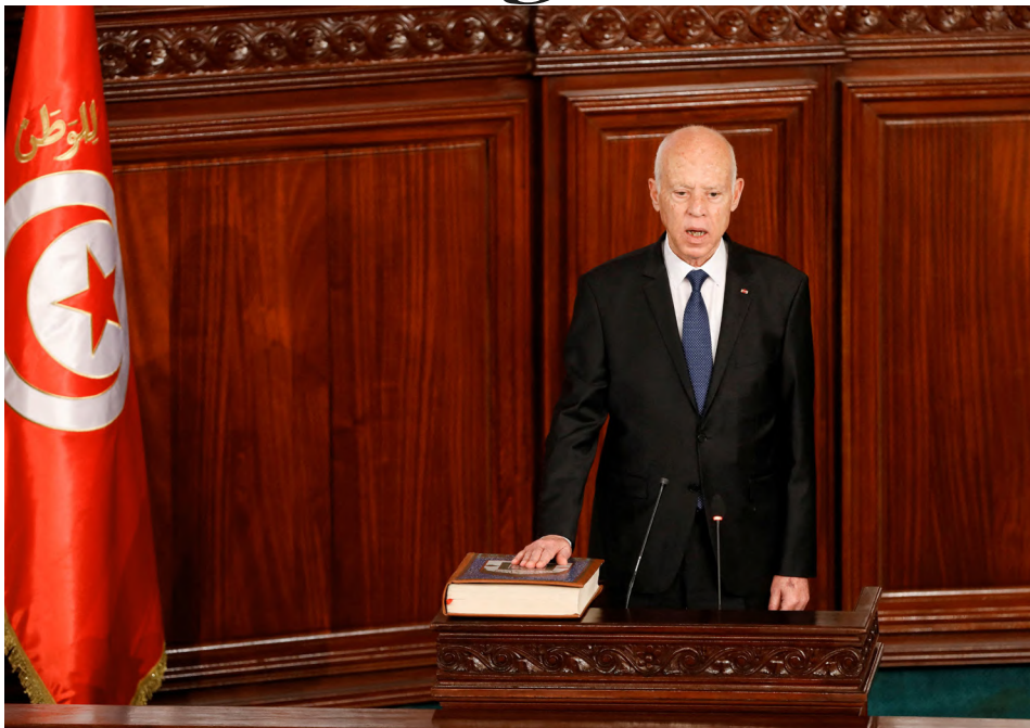
▲ Tunisia's President Kais Saied attends his swearing-in ceremony for his second term at the parliament in Tunis, Tunisia.

The UGTT, which played a key role in Tunisia's post-revolution transition, has remained openly critical of Saied's concentration of power — making it a potential target in what critics describe as an accelerating