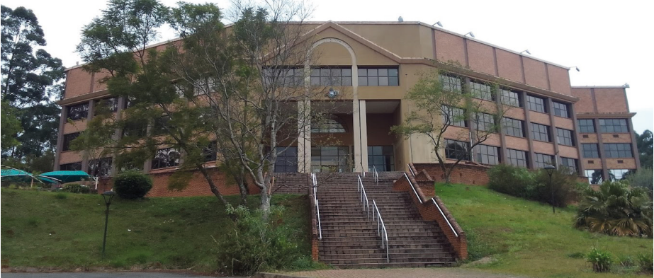
▲ High Court of Eswatini.

She argued that she was not in possession