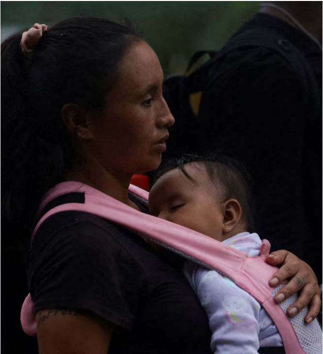
▲ A migrant woman departs carrying her baby in a caravan from Tapachula, heading toward Oaxaca and Mexico City.