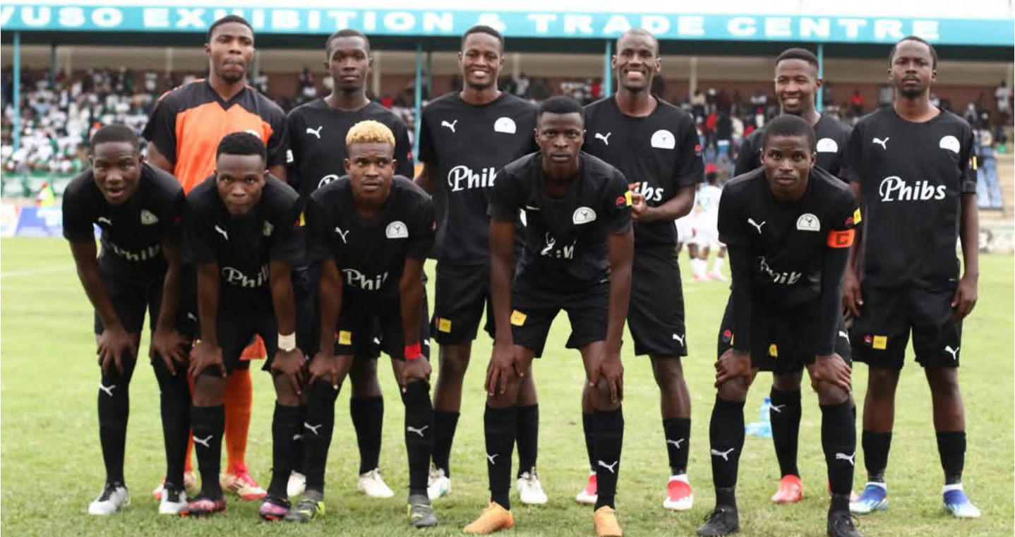
▲ Mbabane Highlanders AM FC has begun its massive clear-out.