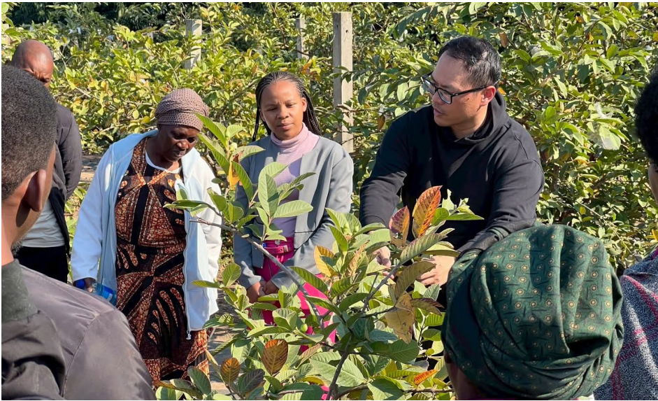
▲ Farmers being trained on growing Guava.