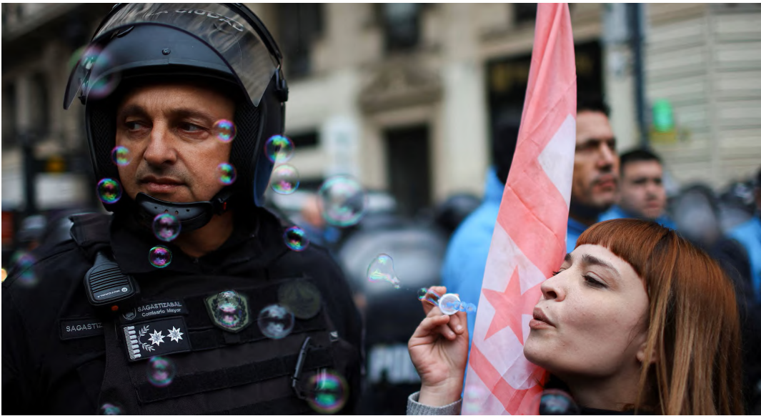
▲ A demonstrator blows soap bubbles next to a member of the Buenos Aires police during a weekly protest by retirees after Argentine President Javier Milei vetoed a pension increase and a bill strengthening protections for people with disabilities.