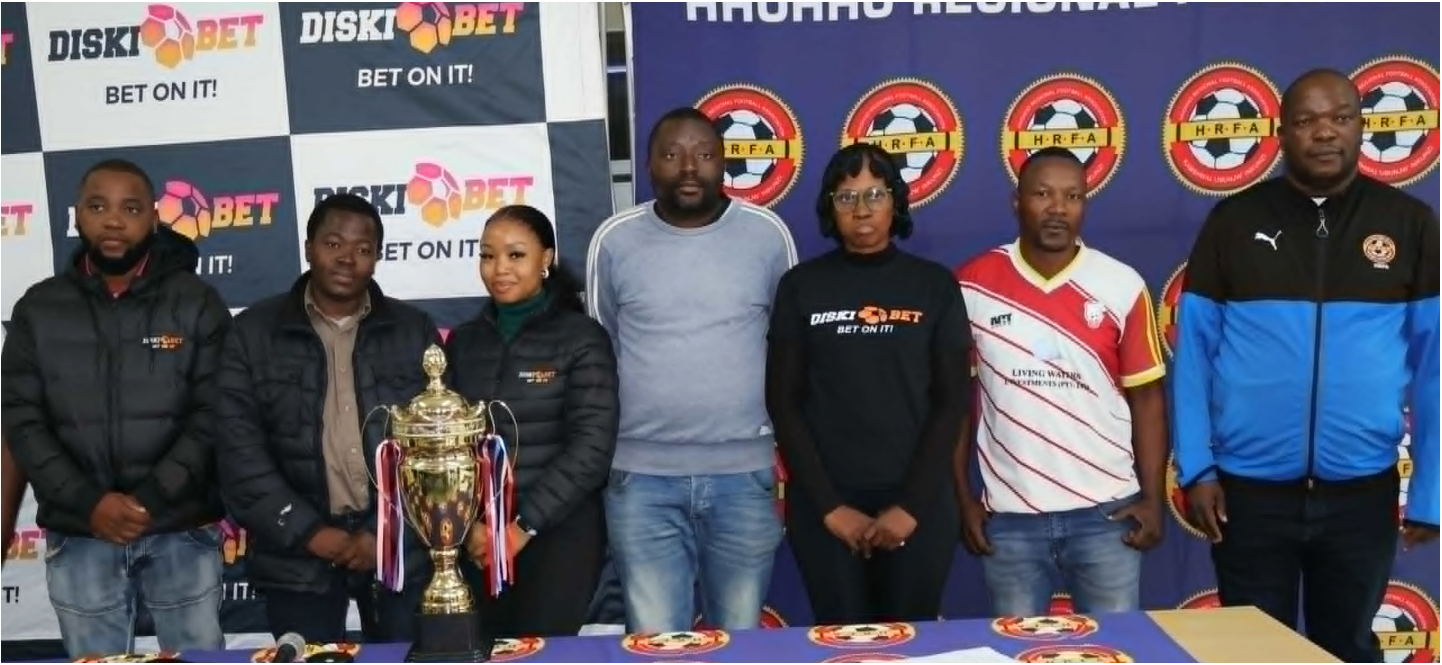
▲ DiskiBet , HRFA officials and players during the draw of the Mbabane tournament held at Sigwaca House.