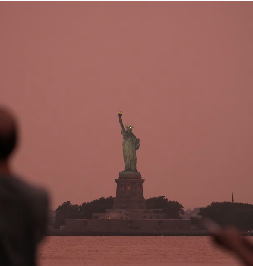
▲ People take photographs as the Statue of Liberty is seen at sunset through haze caused by smoke from Canadian wildfires, as viewed from Brooklyn, New York.