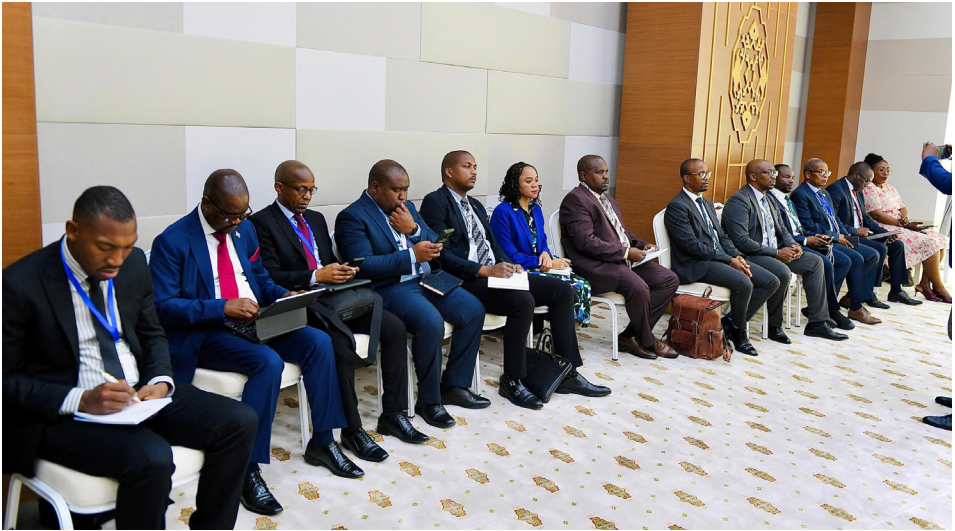
▲ Some of the Eswatini delegation in the session.

tion to facilitate potential trade in various products.