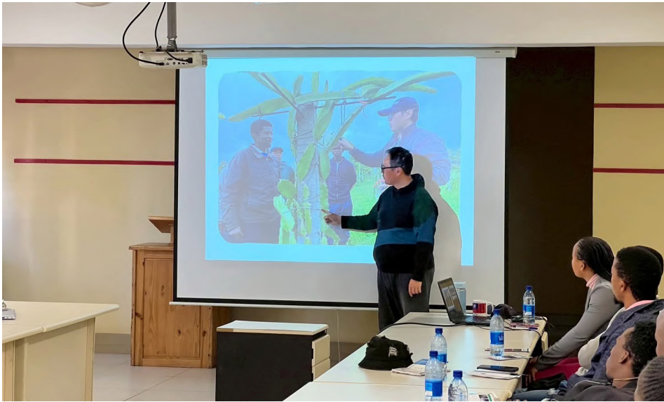
▲ Training on how to grow Dragon Fruit.

The mission also plans to scale the training to other regions if funding and local interest permit.