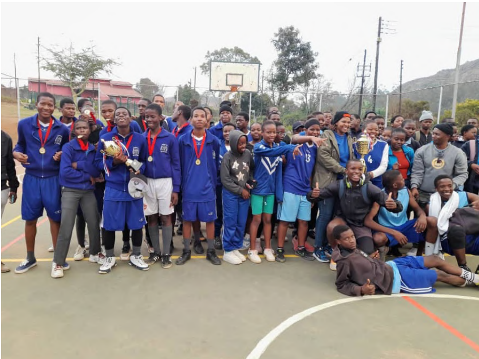
▲Mater Dolorosa basketball teams celebrating their sucesss during the Basketball Association schools championships.