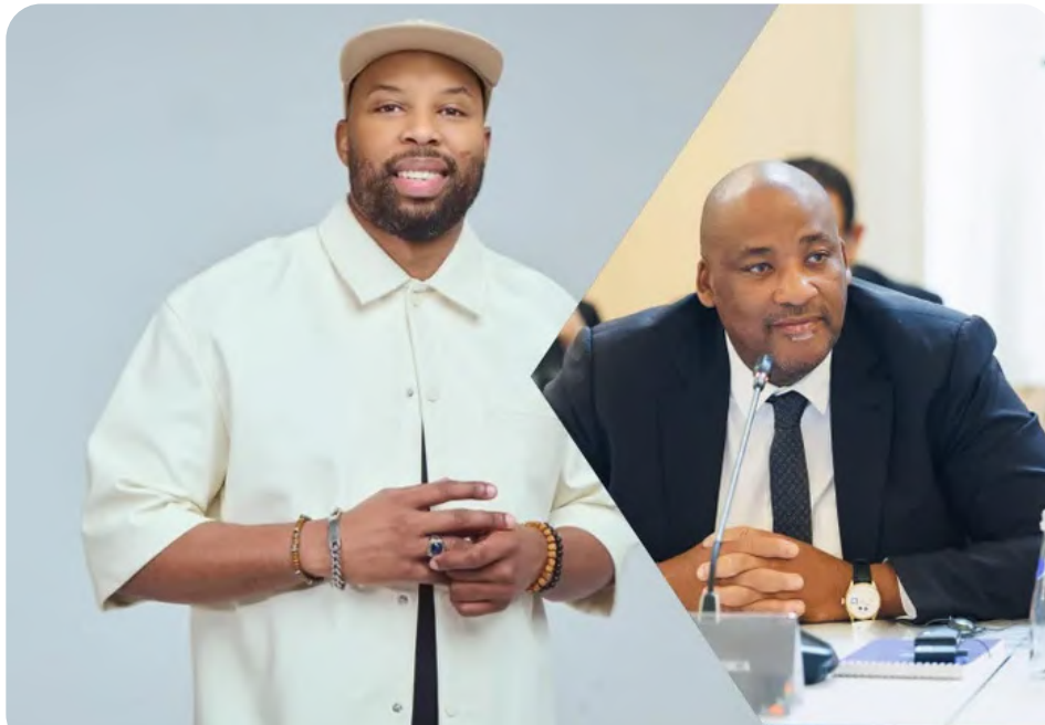
▲ Television and radio personality Sizwe Dhlomo has publicly called for the dismissal of Minister of Sports, Arts and Culture, Gayton McKenzie