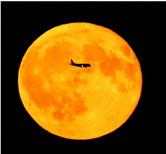
▲ A passenger plane passes a full moon known as the “Sturgeon Moon” as it rises over Frankfurt, Germany.