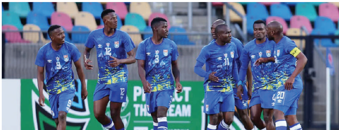
▲ Sihlangu players during a recent match.