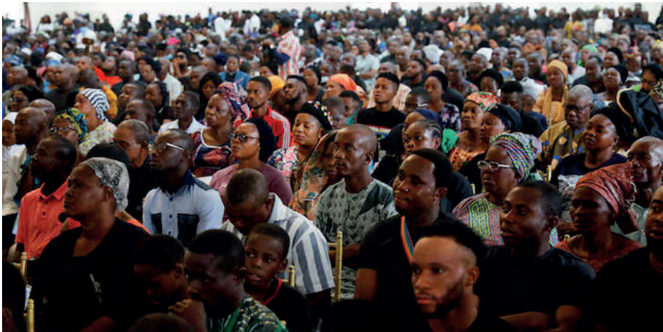
▲ People attend a mass memorial service for victims killed in an attack by gunmen during a Sunday mass service, at St. Francis Catholic Church in Owo, Ondo, Nigeria.

grapples with insurgencies and widespread insecurity. According to court filings, the men allegedly joined the East African terrorist group Al Shabaab in 2021 and plotted the assault at a public school in central Nigeria and near a mosque 30 kilometres (18.6 miles) from Owo's St Francis Catholic Church. Al Shabaab did not claim responsibility for the June 2022 attack, and its operational presence in Nigeria remains unverified. Authorities initially blamed Islamic State West Africa Province (ISWAP), which, alongside Boko Haram has waged a prolonged insurgency in Nigeria's northeast, though the group also did not claim responsibility for the attack. (Reuters)