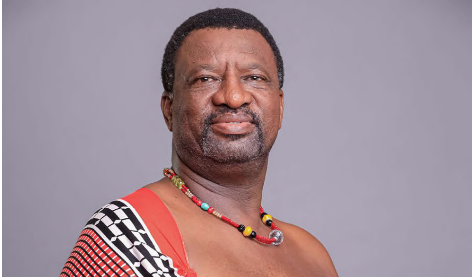
▲ Senator Chief Zabeni.