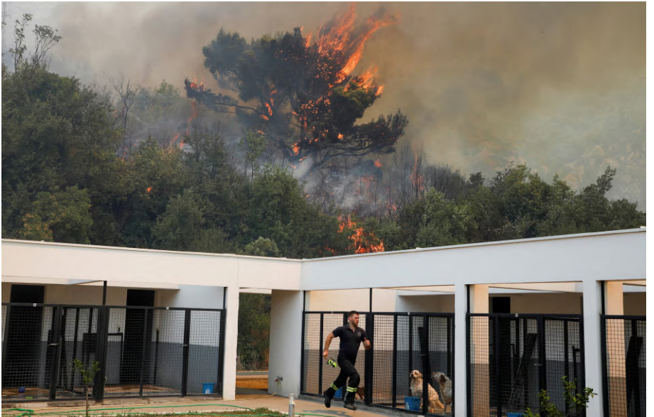
▲ A firefighter runs near caged abandoned animals as fire rises above the beach villages of Buljarica and Canj, during a heatwave near Bar, Montenegro.