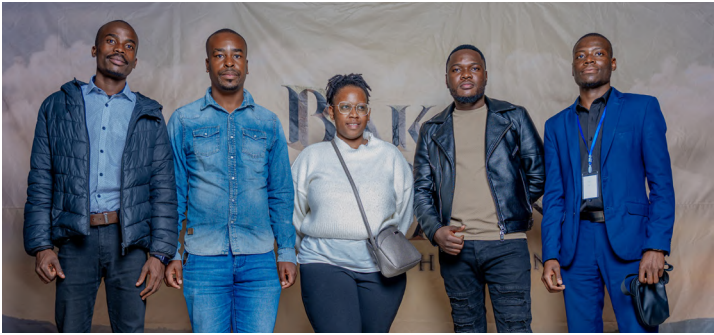
▲ Some of the people who attended the screening of the film at Mpumalanga.