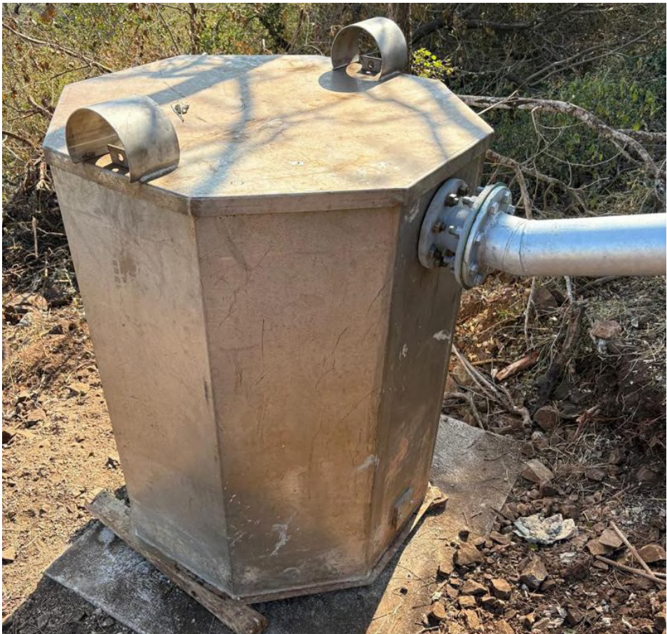
▲EWADE water project.

By aligning national development projects with global benchmarks, EWADE is helping to position Eswatini as a country committed to equitable and sustainable growth.