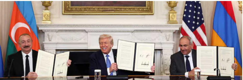
▲ U.S. President Donald Trump, Azerbaijan’s President Ilham Aliyev, and Armenia’s Prime Minister Nikol Pashinyan pose with their documents during a trilateral signing event at the White House, in Washington, D.C.

“The most robust security guarantee would be that there are no limitations on Ukraine armed forces and third countries’ support to Ukraine.” (Reuters)