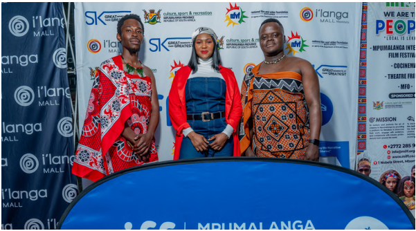
▲ The casts and crew represented Eswatini well with their traditional attires.