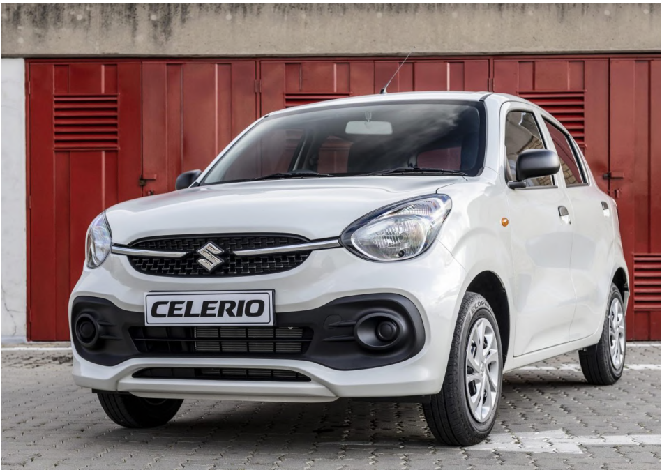
▲ A Suzuki Celerio.

It should be noted that the eBet Registration Drive has attracted thousands of new sign-ups since its launch, combining gaming excitement with life-changing prizes. With the Suzuki up for grabs this week, anticipation is at fever pitch among punters eager to see who will take the wheel.