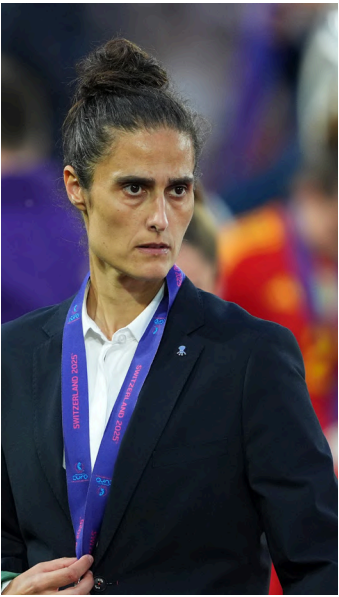
▲ Spain's women's team coach Montse Tome will step down from her role after her contract expires on August 31. Tome for her work, professionalism and dedication in various roles during her time as a member of the national teams at the RFEF, particularly during her time as head coach of the senior women's national team," the RFEF said in a statement.

MADRID - Spain's women's team coach Montse Tome will step down from her role after her contract expires on August 31, the Spanish football federation (RFEF) said on Monday, following their defeat by England in the final of Euro 2025. Sonia Bermudez, current manager of the women's Under-23 side, has been named as her successor. Tome, who took over the role less than two years ago, had previously served as assistant coach to Jorge Vilda from 2018 until his dismissal in 2023. Despite guiding Spain to the European Championship final in Switzerland last month, the RFEF decided against renewing Tome's contract. She previously led Spain to the 2023-24 Nations League title. However, a disappointing campaign at the Paris Olympics where the team failed to secure a medal followed by the penalty shootout heartbreak at the Euros, undermined confidence in her leadership. "The Board of Directors... would like to thank Montse