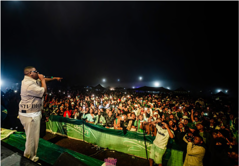
▲ Attendees at the previous edition of the Eswatini Farmers Market.

drawing near, Dlamini urged the public to secure their tickets early. "People should buy tickets as soon as possible, as this is for us Eswatini," he said, emphasising the importance of community participation in making the event a success. As the date approaches, excitement is building among potential attendees, with many eager to experience the vibrant atmosphere and the sense of unity that the Eswatini Farmers Market embodies. The event is expected to attract not only locals but also visitors from neighbouring countries, further promoting Eswatini as a destination for cultural tourism. One of the most important cultural events in Eswatini, the Eswatini Farmers Market is a must-visit for anyone looking to explore the country's rich traditions and local produce. Last year's event was a celebration of African unity, with the theme "Africa Unite" focusing on collaboration and showcasing the very best of African culture.