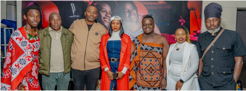
▲ BakaNgwane casts and production team at the Mpumalanga International Film Festival.