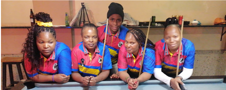
▲ Trading as the Black Queens, the country's pride of blackball or billiards displayed their talent in South Africa (SA) on Sunday.