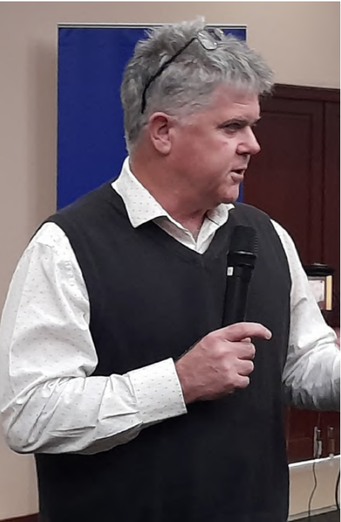
▲ Professor Owen Skae.

The framework introduces the National Competitiveness Council, chaired by the Prime Minister, and a