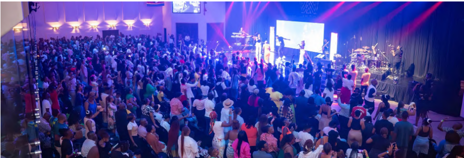
▲ A recent event at TLC Events Centre.

declaration of faith and glory, echoing well beyond the confines of the venue. Early Bird tickets for Kingdom Live are priced at E100, offering an affordable opportunity for fans to secure their seats ahead of time. The organisers have urged potential attendees to act quickly, stating, “Secure your seat now and be part of the sound that will be heard for years to come. Limited availability, once they are gone, they are gone.” This sense of urgency reflects the high demand anticipated for such a monumental event. Kingdom Live is poised to be a vibrant celebration of music, culture, and unity, featuring an impressive lineup of both local and international gospel artists. The event aims to create an electrifying atmosphere, characterised by captivating performances and innovative stage design that will enhance the overall experience. With a focus on fostering a sense of community among attendees, Kingdom Live will not only entertain but also inspire and connect individuals through the universal language of music. The event promises to be a melting pot of diverse musical expressions, showcasing the richness of gospel music and its ability to bring people together in worship.