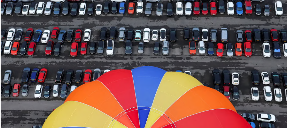
▲ A hot air balloon flies over an open air car parking lot, during a mass launch at the annual Bristol International Balloon Fiesta, in Bristol, Britain.