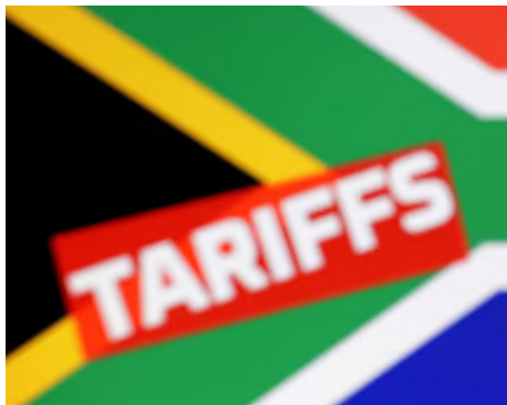
▲The South Africa flag and the word “Tariffs” are seen in this illustration.

“These cover things (like) ... expropriation without compensation. It deals with some of