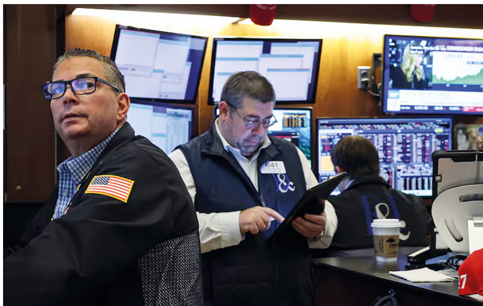
▲Traders work on the floor at the New York Stock Exchange (NYSE) in New York City, U.S.

It also comes at a complicated time for the