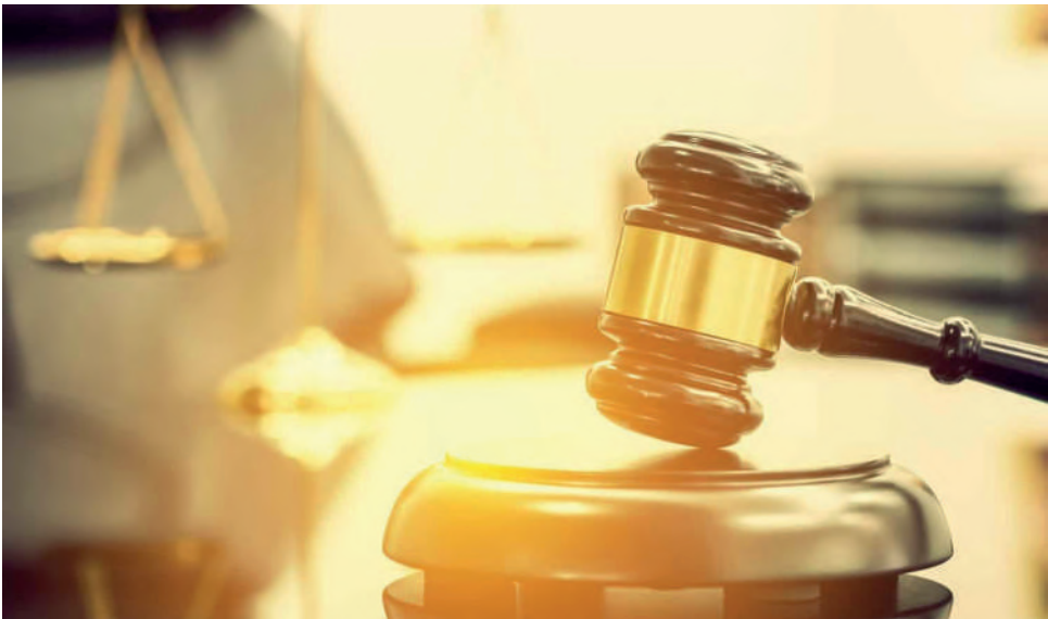
▲ The court dismissed the former MP's appeal of his sentence and struck his application for reconsideration of his conviction from the roll.