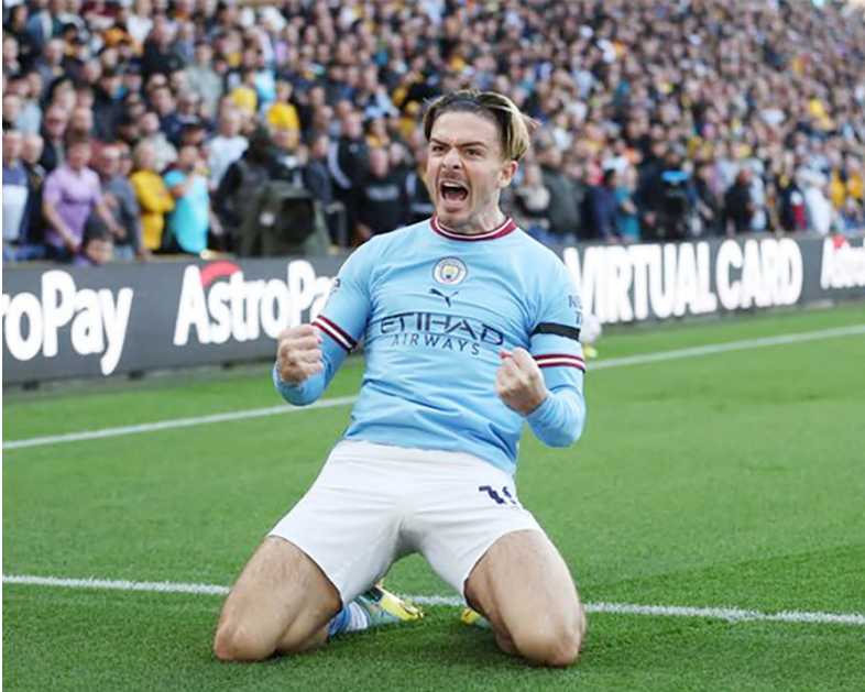
▲ Everton have agreed a season-long loan deal for Manchester City's England midfielder Jack Grealish, Sky Sports television reported on Monday.

LONDON - Everton have agreed a season-long loan deal for Manchester City's England midfielder Jack Grealish, Sky Sports television reported on Monday. The 29-year-old joined City from Aston Villa for 100 million pounds ($134.57 million) in 2021 but has fallen out of favour there and is in urgent need of game time ahead of next year's World Cup. Grealish made only seven league starts last season and was not included in City's recent Club World Cup squad. He was also omitted from England's 2024 European Championship squad. There was no immediate word from either club and the BBC cited sources saying a deal was not yet imminent although talks were progressing. (Reuters)