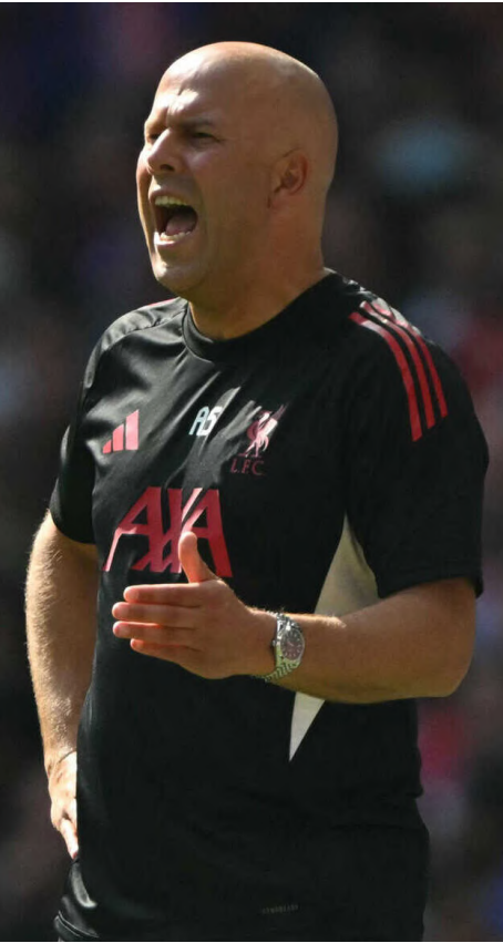
▲ Liverpool boss Arne Slot.

"We are able to create more but we are conceding at the moment more as well. If you want to compete to win the league, you cannot concede these chances. "We conceded too much today to win the game." Liverpool's spending in the transfer market may not be over as they continue to be linked with a move for Newcastle striker Alexander Isak. However, Slot dismissed the claim that the transfer spending will put his players under more pressure this season. "Because we are Liverpool the pressure is always on," he said. "That is nothing to do with brining players in." (Reuters)