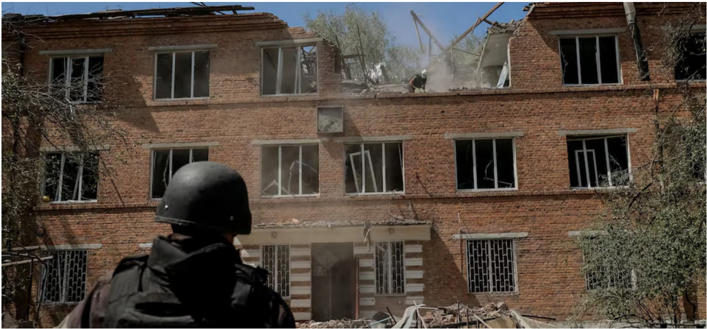
▲ Rescuers work at the site where a hospital was damaged during a Russian air strike, amid Russia’s attack on Ukraine, in Kharkiv, Ukraine.

European officials have sought to influence