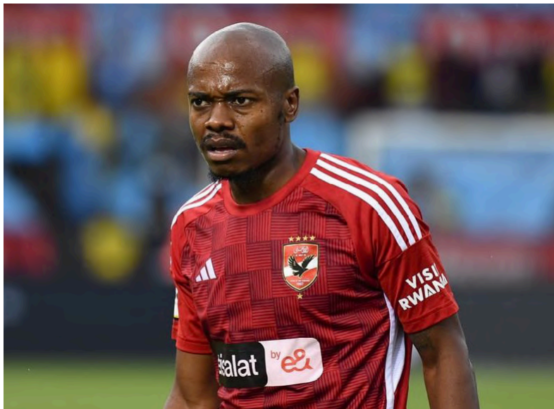
▲ Rumours linking Percy Tau with a move to Egyptian giants Zamalek are wide of the mark.

With the Africa Cup of Nations in Morocco kicking off in December, the 31-year-old is racing against time to secure a new club, regain top form and force his way into Hugo Broos's Bafana Bafana squad. Multiple