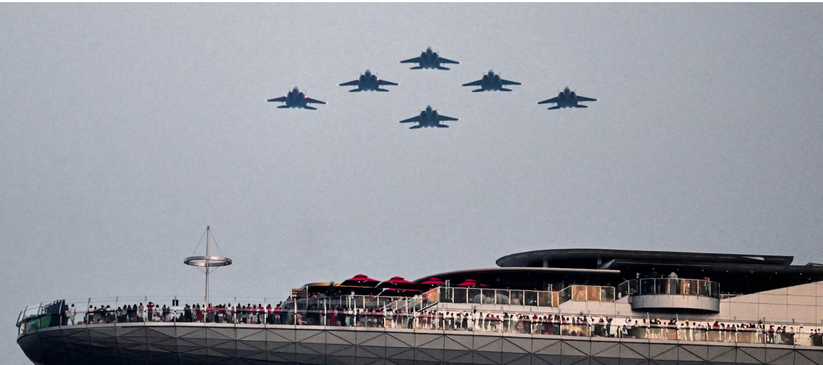
▲ The aerial flypast is performed by the Singapore Armed Forces at the 60th National Day Parade in Singapore.