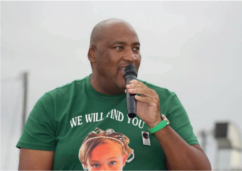
▲ Minister Gayton McKenzie's social media past is catching up with him.