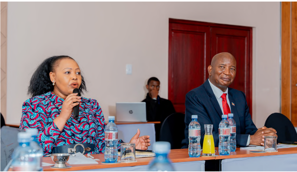
▲ Minister of Foreign Affairs and International Cooperation Pholile Shakantu explained that border control remains a critical tool for national security, economic management and the regulation of goods and people entering the Kingdom.

curity, managing the economy, and regulating movement into and out of the kingdom. She underscored Eswatini's distinct geopolitical situation. Being landlocked within South Africa and sharing a limited border with Mozambique necessitates a customised approach to border management. "Our context is not the same as Zambia and Zimbabwe," the Minister explained, adding that any future consideration of relaxed border controls would require thorough studies, regional consensus, and guarantees that national sovereignty and stability would remain uncompromised. The gathering also served to inform legislators about the ministry's operative framework, structured around three pillars: diplomacy, economic advancement, and international cooperation. Shakantu elaborated how these priorities interlink: diplomacy facilitates bilateral and multilateral relations, economic advancement drives trade and investment partnerships, and international cooperation fosters collaboration with global and regional institutions, delivering shared development benefits while contributing to peace and security. Highlighting parliament's pivotal role, Shakantu encouraged MPs and Senators to engage actively in foreign affairs, stressing that the ministry's success depends heavily on legislative backing through the passage of laws and ratification of international treaties.