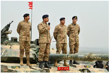
▲ Chief of Army Staff of Pakistan Asim Munir holds a microphone during his visit at the Tilla Field Firing Ranges (TFFR) in Mangla, Pakistan.

He said it was also regrettable that the