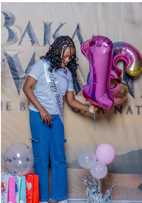
▲ A young girl celebrated her 13th birthday during the event.