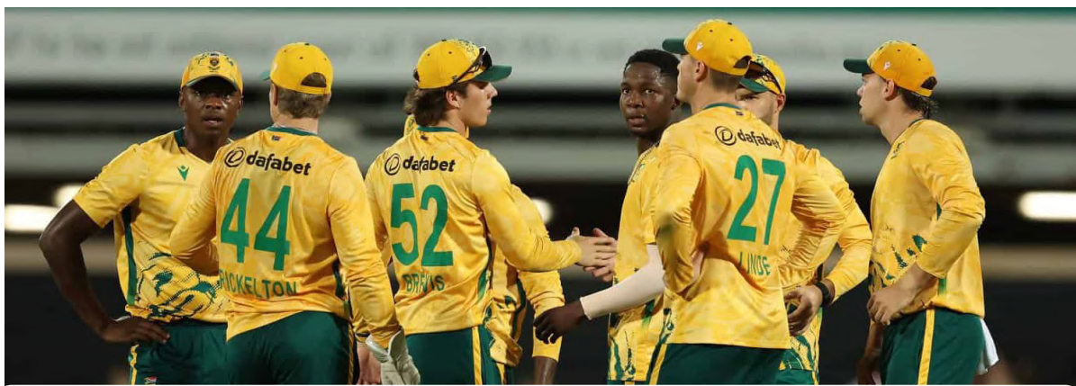
▲ Members of the Proteas team during the first T20 International against Australia in Darwin on Sunday.