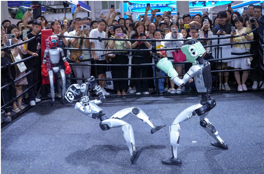
▲ Visitors watch humanoid robots fight at the Unitree Robotics booth during the World Robot Conference in Beijing, China.