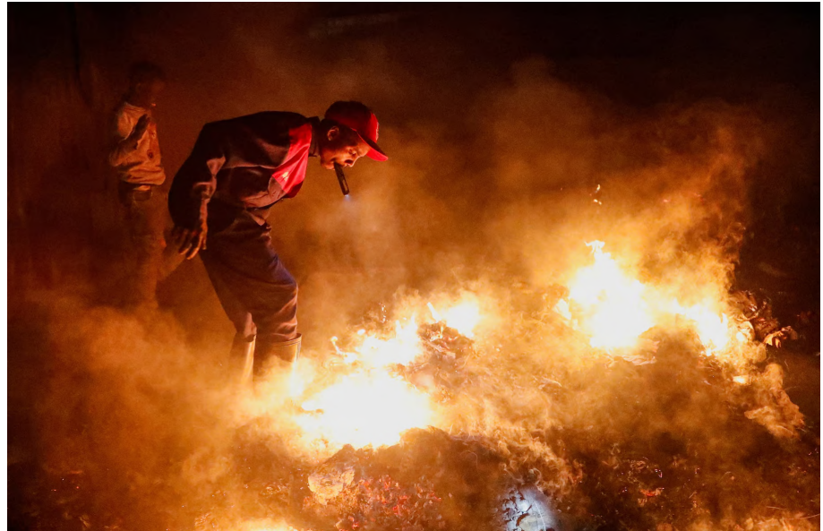
▲ A man uses a spotlight to salvage belongings during a fire outbreak at iron-sheet homes in the Grogon village of Huruma district in Nairobi, Kenya.