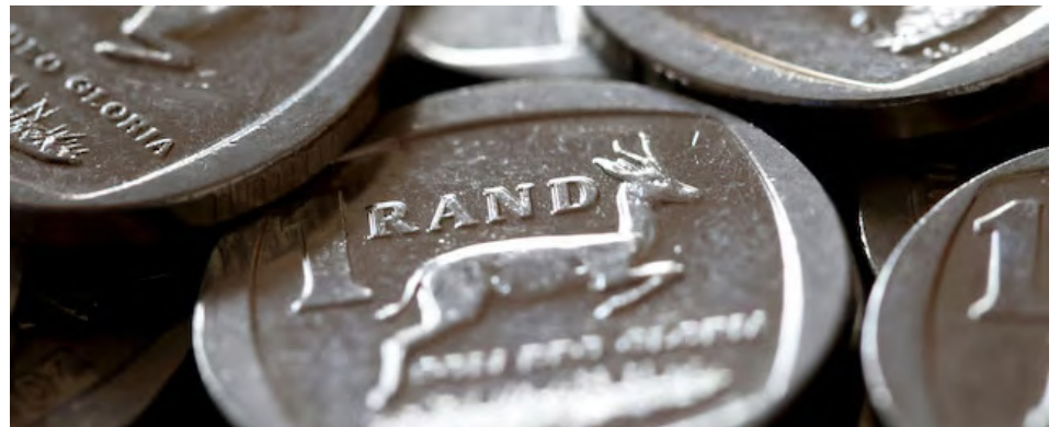
▲South African Rand coins are seen in this illustration.

Steenhuisen serves as agriculture minister in South African President Cyril Ramaphosa’s cabinet. Agriculture is one of the sectors worst hit by the tariffs. (Reuters)