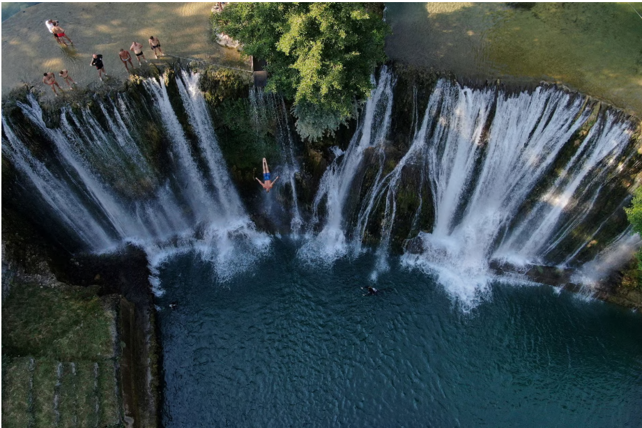
▲ A drone view shows competitors taking part in the annual international waterfall jumping competition held in the old town of Jajce, Bosnia and Herzegovina.