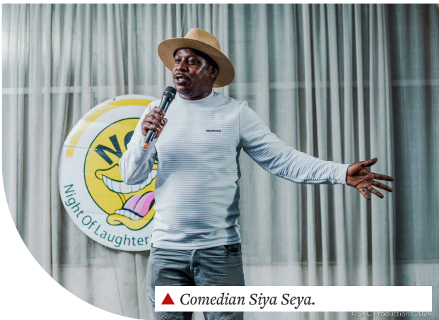
▲ Comedian Siya Seya.

SOUTH African international comedy star Siya Seya has been added to the second edition of the Eswatini International Comedy Festival (ECOFEST), set on September 26, 2025. This highly anticipated event will be an unforgettable evening filled with laughter and entertainment, showcasing a blend of local and international comedic talent.