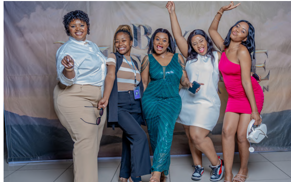
▲ Movie lovers had a blast at the screening.

The festival’s strategic location in Mpumalanga, a region known for its breathtaking landscapes, offers filmmakers unique opportunities to capture stunning visuals that enhance their storytelling. MIFF is dedicated to showcasing new independent films and recently produced works, featuring high-profile and undiscovered talent alike. This inclusive approach fosters a rich tapestry of cinematic expression, allowing filmmakers to connect with audiences and industry professionals.