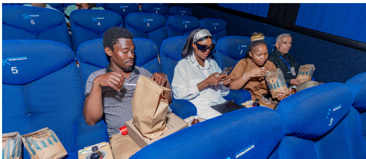
▲ BakaNgwane casts inside the cinema before the movie screening.