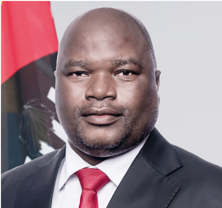
▲ Minister of Public Service Mabulala Maseko.

... Public Service Pensions Fund (PSPF) announces long-awaited increase effective from April, payout lands this month