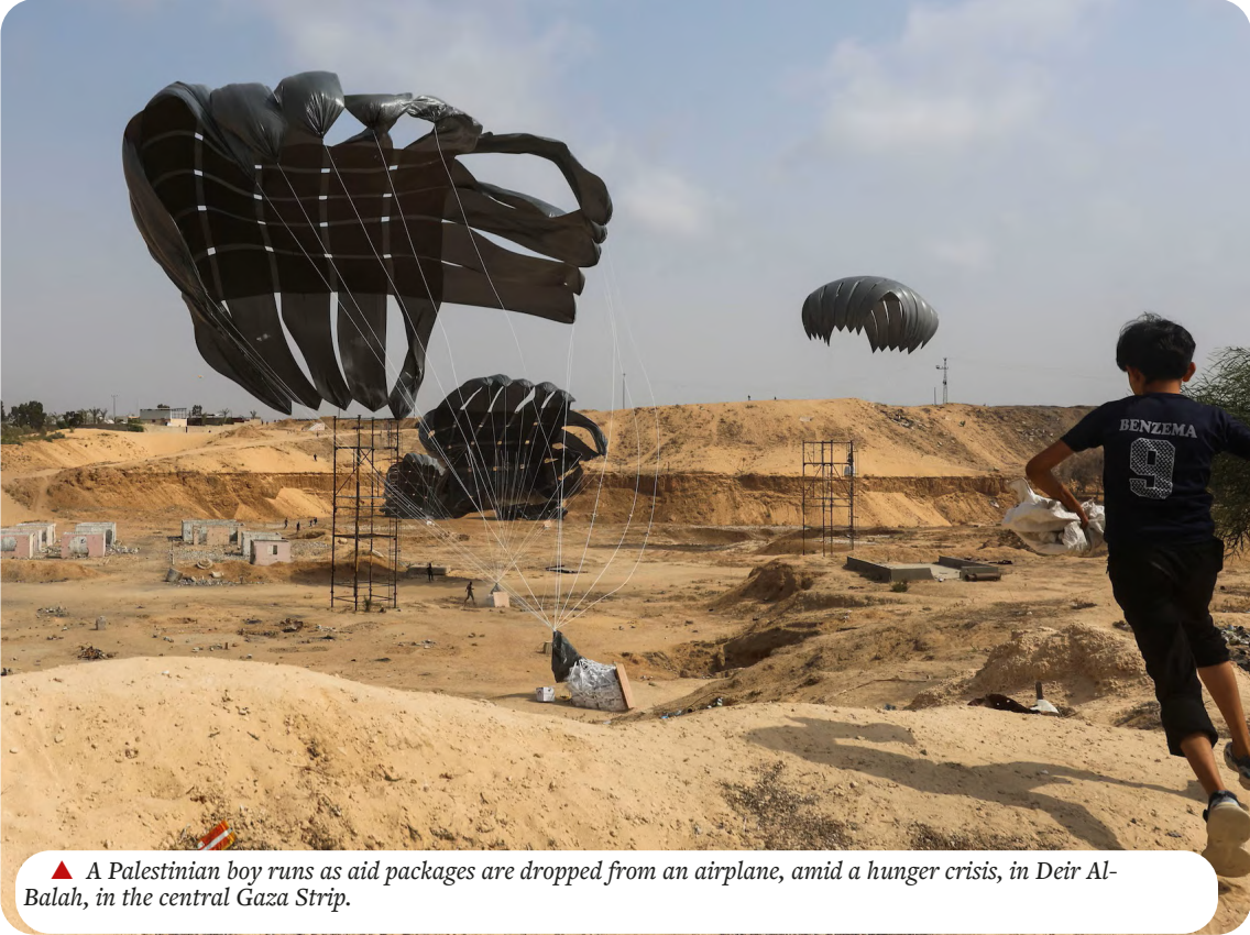
▲ A Palestinian boy runs as aid packages are dropped from an airplane, amid a hunger crisis, in Deir Al-Balah, in the central Gaza Strip.