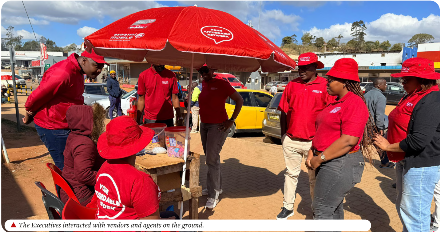
▲ The Executives interacted with vendors and agents on the ground.