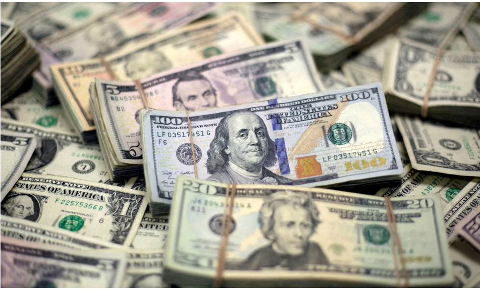
▲U.S. dollar banknotes are seen in this illustration.

LONDON — The dollar fell to a two-week low on Wednesday after a tame reading on U.S. inflation bolstered expectations of a Federal Reserve rate cut next month, with President Donald Trump’s attempts to extend his grip over U.S. institutions also undermining the currency. The dollar index, measuring the currency against a basket of peers, fell to 97.62, its lowest since July 28, extending its 0.5 per cent fall on Tuesday. It was last down 0.3 per cent at 97.70. U.S. consumer prices increased marginally in July, data showed on Tuesday, in line with forecasts and as the pass-through from Trump’s sweeping tariffs to goods prices has so far been limited. Investors eyeing imminent Fed cuts moved to price in a 98 per cent chance the central bank would ease rates next month, according to LSEG data. Also eroding investor confidence in the dollar were Trump’s latest attempts to undermine Fed independence, after White House spokeswoman Karoline Leavitt said on Tuesday that the president was considering a