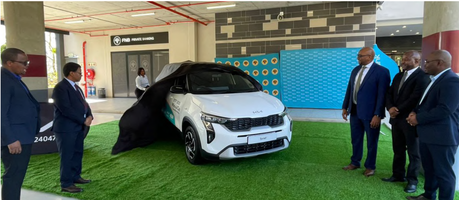
▲ The KIA Sonnet for this year's 'Win-a-Car' competition.