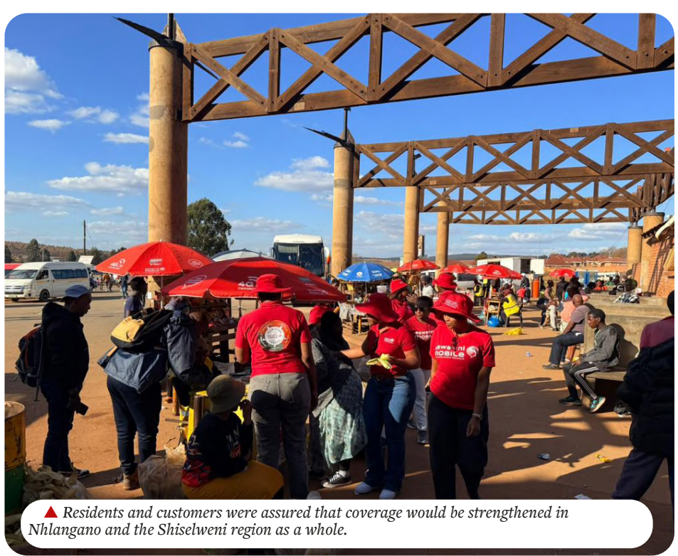
▲ Residents and customers were assured that coverage would be strengthened in Nhlangano and the Shiselweni region as a whole.