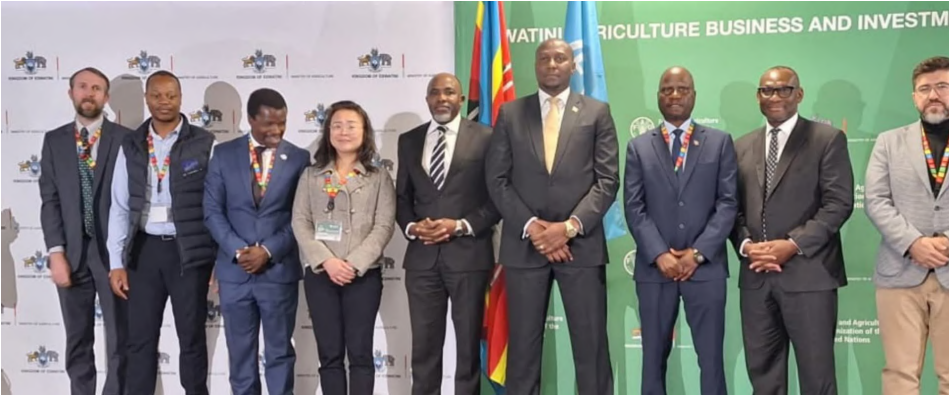
▲ The Prime Minister during the opening of the forum.

30-year economic, social, and institutional transformation plan, known as the Grand Plan for National Transformation, which emerged from national consultations at Sibaya," he said.