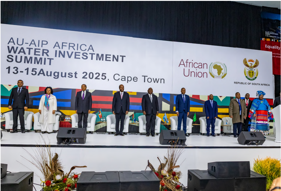
▲His Majesty King Mswati III with other Heads of State at the AU-AIP Summit in Cape Town, held under South Africa's G20 Presidency.

courses, crucial for industrialisation, energy, agriculture, health and development. "This summit showcases bankable, climate-resilient projects, fosters regional co-operation on transboundary water resources and attracts global finance to transform water systems," he said. His Majesty noted Africa's funding shortages for climate activities and limited access to technologies, yet the need to close the water security and sanitation investment gap remains. He welcomed the summit's outcome document, which would be presented at the G20 for consideration of financial support. "Let us reaffirm that Africa's water is its future. By investing in water security, we advance health, dignity and prosperity for a resilient Africa," the King concluded.