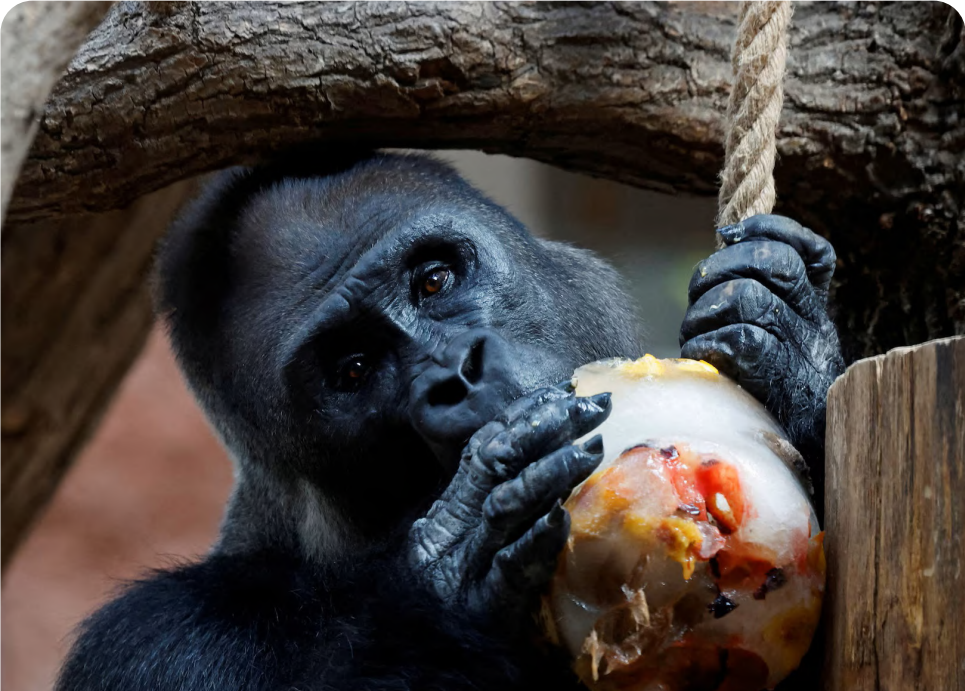
▲ A western lowland gorilla eats ice cream that was brought to its enclosure during a heatwave, at Prague Zoo, Czech Republic.