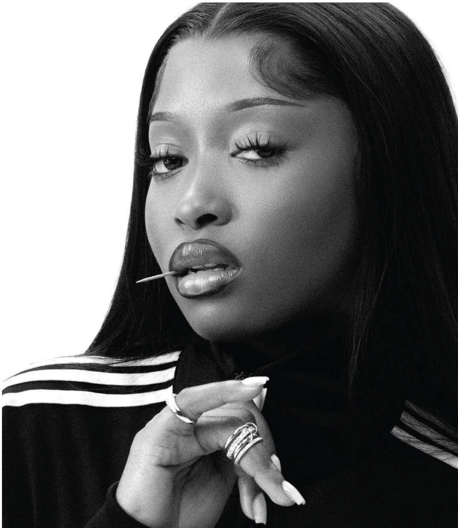
▲ Uncle Waffles.

creating a campaign that is both memorable and impactful. The partnership with Adidas is expected to further elevate her brand, providing her with a platform to reach new audiences and expand her influence.