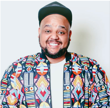
▲ South African comedian Shanray