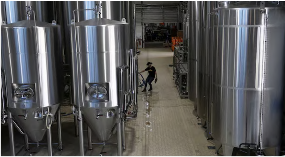
▲A worker at the beer storage tanks at Darling Brew, on the outskirts of Cape Town, South Africa.

JOHANNESBURG — South African business confidence rose in July, helped by higher new vehicle sales, rising manufacturing output, strong precious metals prices and well-contained inflation, data showed on Wednesday. The South African Chamber of Commerce and Industry’s Business Confidence Index rose to 116.7 in July, up from 113.2 in June. The business chamber releases the index every two months. June’s business confidence level was lower than May’s 115.8 reading before July’s rebound. The chamber said the 30 per cent tariff on South African exports to the U.S. that kicked in last week could weigh on sentiment in the remainder of the year.