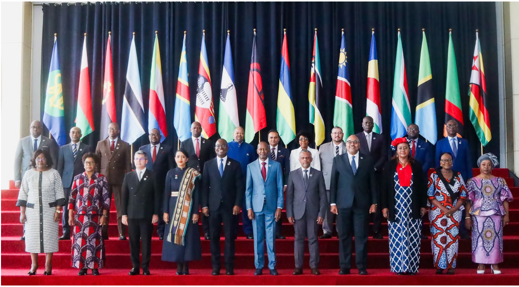
▲ The Southern African Development Community Council of Ministers.