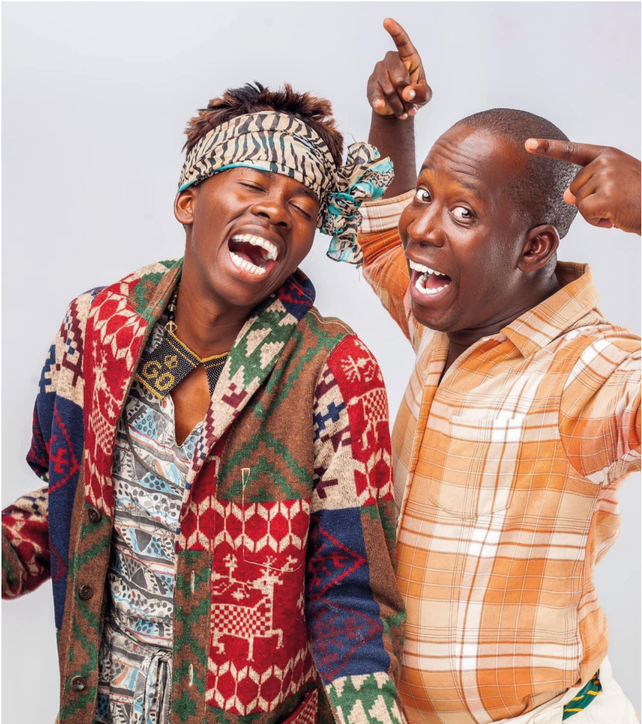
▲ Comedians Gogo & S'lwane.

Participants can look forward to invigorating hikes through the reserve's stunning landscapes, providing an opportunity to witness the rich flora and fauna that thrive in this protected area. Guided by knowledgeable local experts, these hikes will not only showcase the