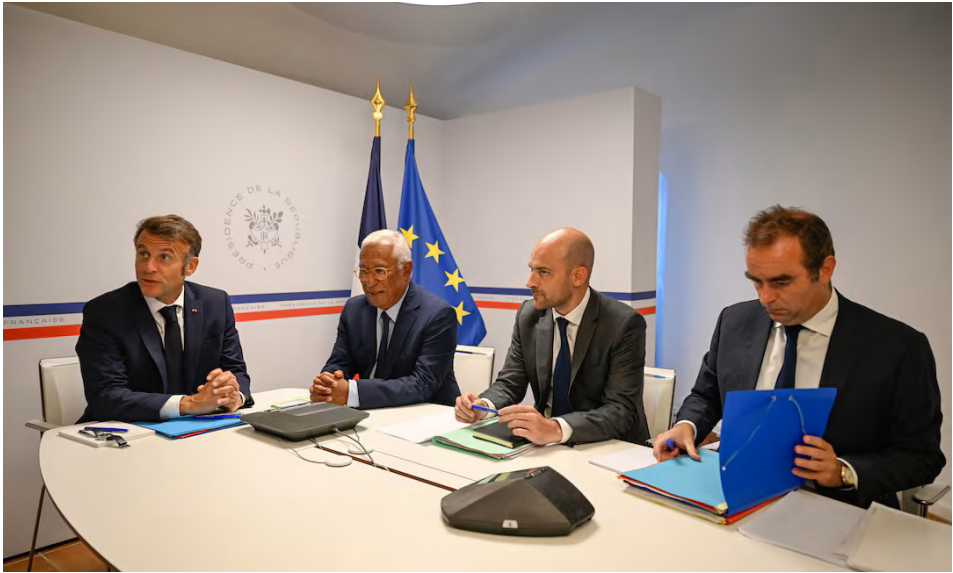
▲ French President Emmanuel Macron, Antonio Costa, President of the European Council, French Minister for Europe and Foreign Affairs Jean-Noel Barrot, and France's Minister of Armed Forces Sebastien Lecornu attend a video conference with U.S. President Donald Trump, Ukrainian President Volodymyr Zelenskiy and European Union leaders about the upcoming Trump-Putin meeting on Ukraine, at Fort de Bregancon in Bormes-les-Mimosas, France.

Merz said Ukraine was prepared to negotiate on territorial issues, but "legal recognition of Russian occupation is not up for