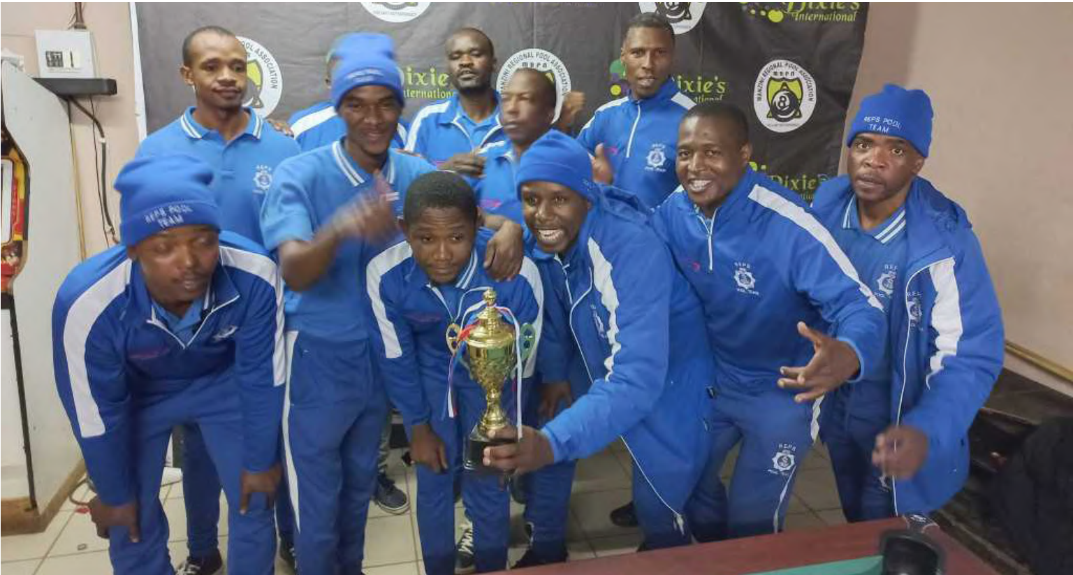
▲ Matsapha Police Academy pool club.

A fierce draw it is! Gigantic fixtures are underway in the upcoming Sphana Investments Manzini/Matsapha Zonal League Pool Teams Knockout Tournament. Four of the giant teams in the league could not avoid each other when the draw was held on Tuesday at Give Thanks Pool Room in Matsapha. With the two-weekend tournament starting on Saturday, August 16 at MPC and Matsapha Police Academy, giants MPC will start with a clash against big-time rivals, Ludzeludze Lions at noon. MPC will have a home advantage in this match. Interestingly, the winner here will go on to play ERS A in the quarterfinals at 2pm in the same venue. Meanwhile, a star-studded Royal Eswatini Police Service (REPS) Pool Team, got a bye to the quarterfinals where they will take on a tough Give Thanks who beat them in their last league meeting. This matchup is scheduled for 4pm at MPC. Other games will be played at Matsapha Police Academy at 10am and noon. Each team is to part with E300