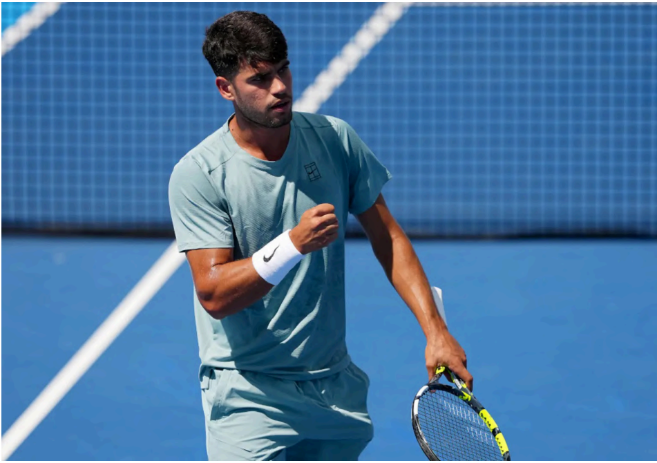
▲ Tennis player Carlos Alcaraz. Masters 1000 level.

Alcaraz has been on a tear in 2025 as he chases Jannik Sinner in the ATP rankings, and now owns 13 straight victories at the