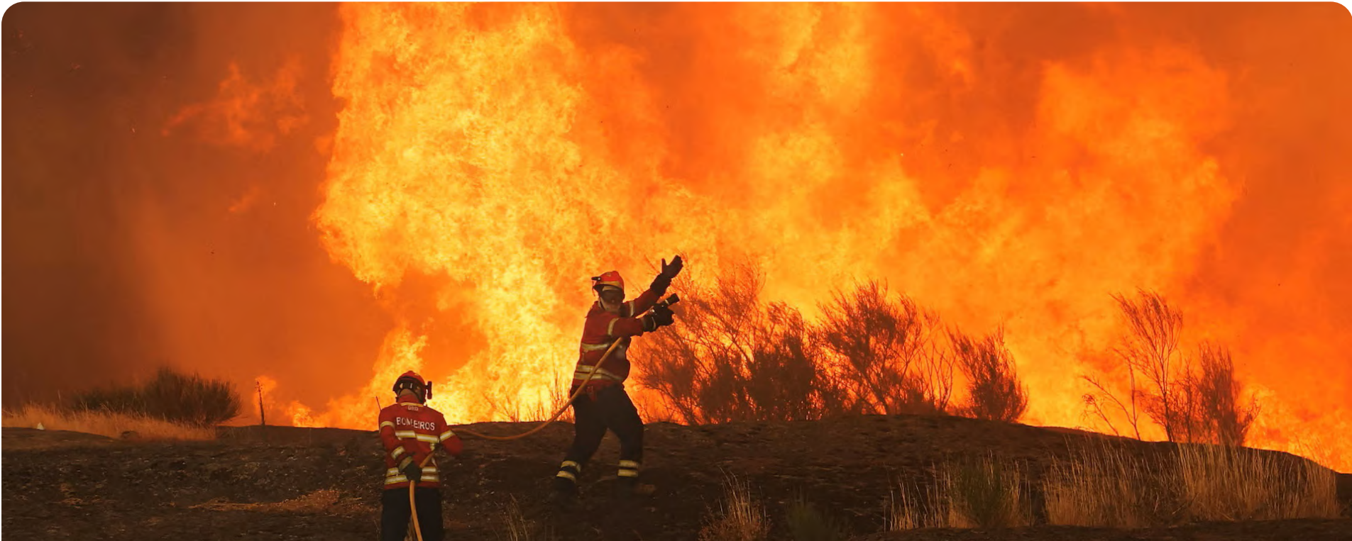
▲ Firefighters work to extinguish a wildfire approaching Trancoso, Portugal.