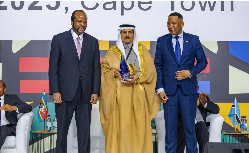
▲His Majesty King Mswati III and President of Botswana Duma Boko present an award to a representative of Prince Mohammed bin Salman Al Saud of Saudi Arabia.

the Global Water Organisation to drive cooperation on water security, sustainable development, peace and innovation. His Majesty King Letsie III of Lesotho was awarded for championing the Highlands Water Project, a model of transboundary cooperation. Presidents Bassirou Diomaye Faye of Senegal and HH Sheikh Mohamed bin Zayed Al Nahyan of the UAE were recognised for co-hosting the UN 2026 Water Conference, prioritising investment, solidarity and water in the global climate agenda through COP 28. President Samia Suluhu Hassan of Tanzania was honoured for developing the Tanzania Water Investment Programme and advancing leadership in water and climate through reforms, financing partnerships and inclusive governance. Not all leaders were present, with representatives accepting on their behalf.