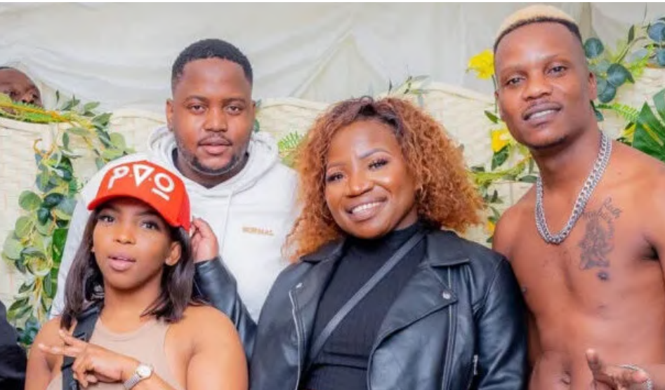
▲ Limpopo singer Makhadzi has fired her DJ after not showing up for work on several occasions.

"I want to stress that CCIFSA has undue control over KZN DSAC; they decide who receives gigs and funding in KZN. They're basically running the department. (Sunday