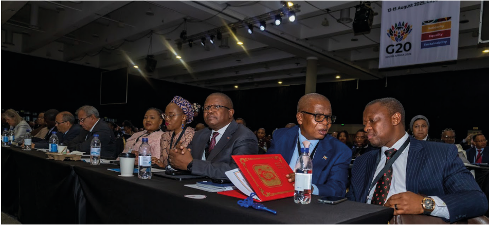
▲ Heads of State, ministers and financiers following proceedings at the AU - AIP Summit in Cape Town.

He praised the African Investment Programme as a model for impactful change in environmentally challenged regions.