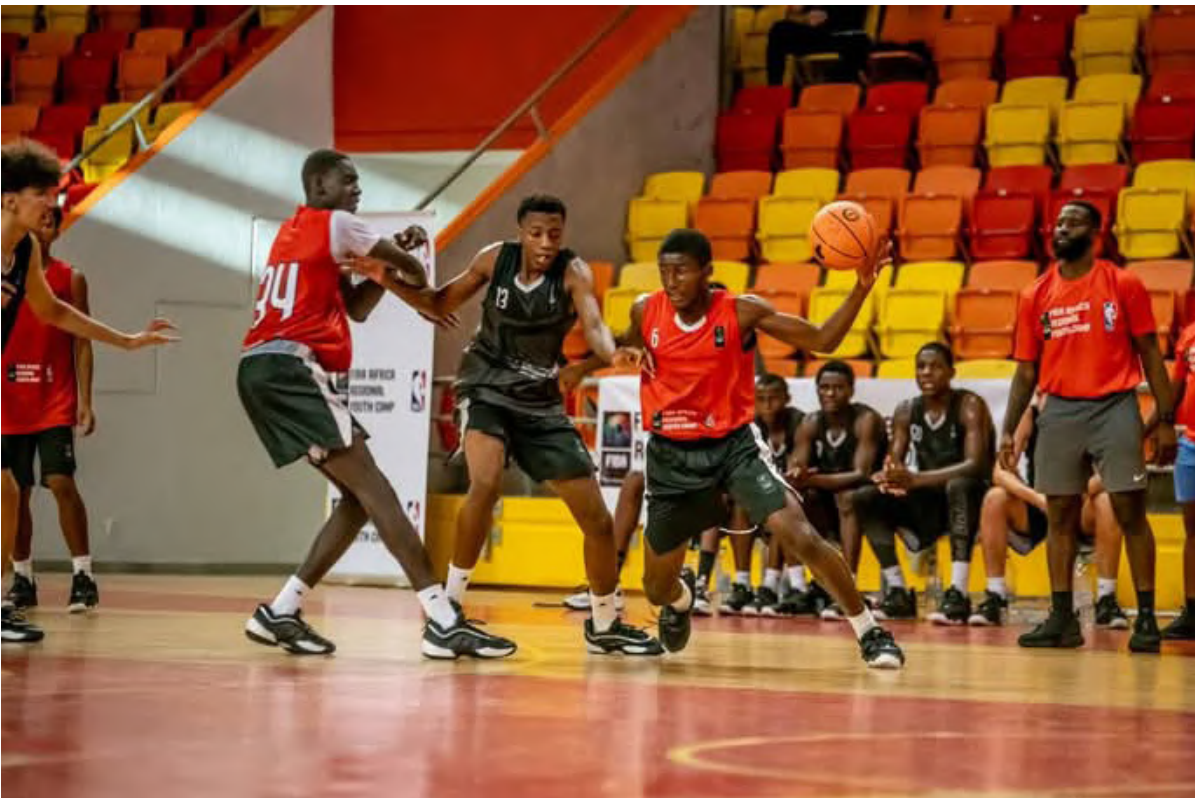
▲ Basketball teams in action.