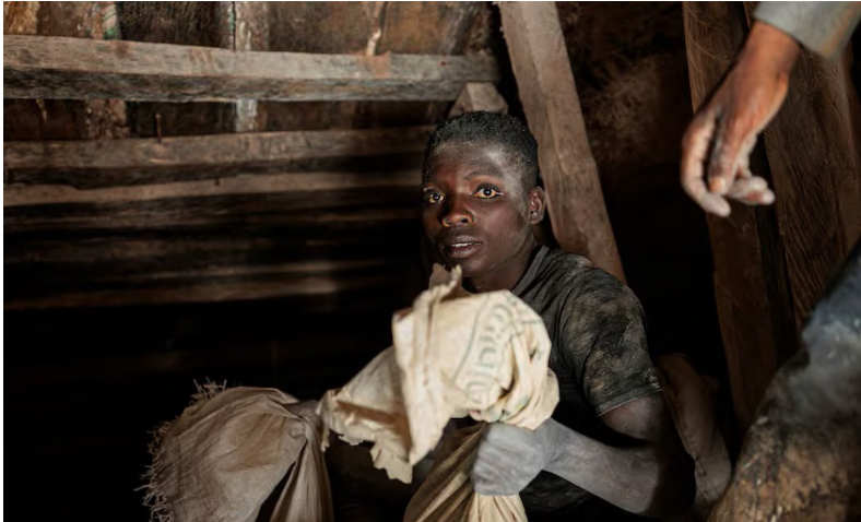
▲ A laborer grasps a sack of coltan ore at a mine near the town of Rubaya in eastern Democratic Republic of Congo.

Tuesday sanctioned other alleged participants in minerals smuggling in Congo, including PARECO-FF, a pro-government Congolese militia that the U.S. said controlled the Rubaya mining site from 2022 to early 2024, prior to M23's takeover.