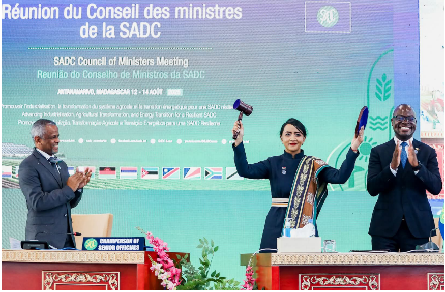
▲ Some of the deliberations.