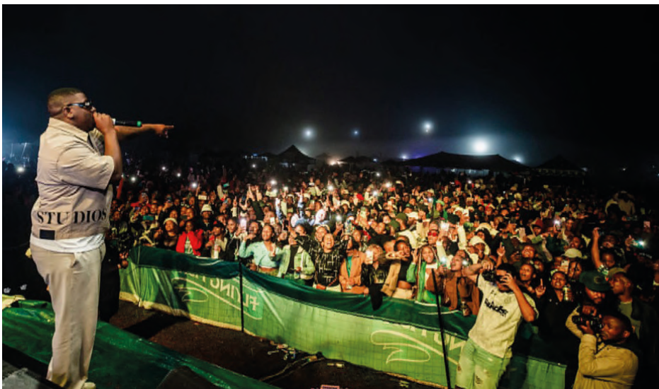
▲ Action during last year’s Eswatini Farmer’s Market at Malkerns Country Club.