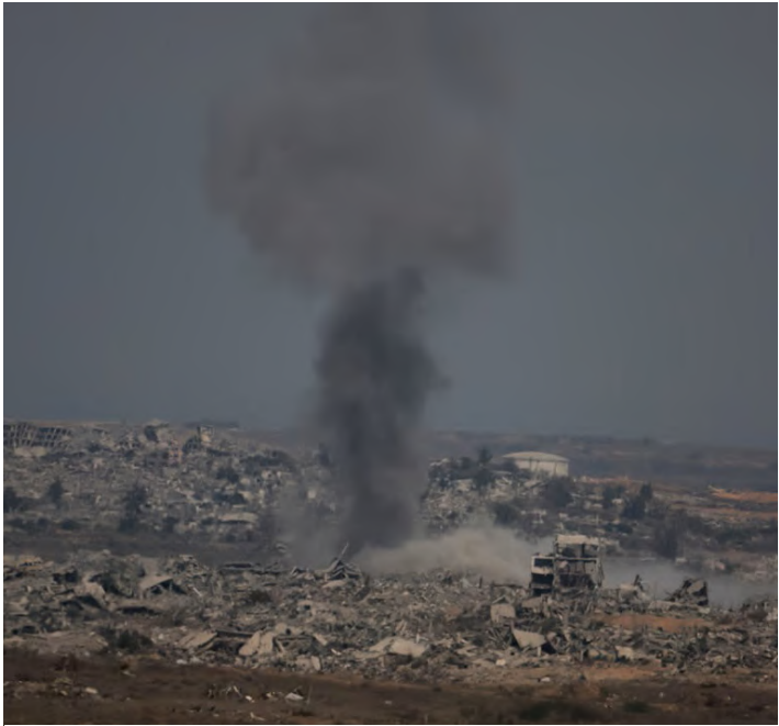
▲ Smoke rises after an Israeli air strike in north Gaza, as seen from Israel's border with Gaza, Israel.