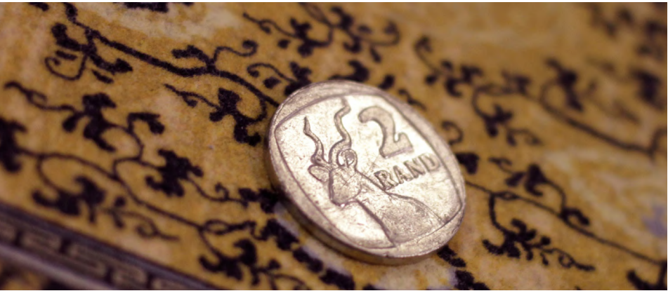
▲ A South African two rand coin is seen in this illustration picture.

The South African Chamber of Commerce and Industry reported a rise in the country’s business confidence in July, helped by higher new vehicle sales, rising manufacturing output, strong precious metals prices and well-contained inflation. Separately, Statistics South Africa figures showed on Wednesday that retail sales rose 1.6 per cent year-on-year in June after rising by a revised 4.3 per cent in May. The Johannesburg Stock Exchange’s Top-40 index was last up 1.2 per cent. South Africa’s benchmark 2035 government bond was also stronger, with the yield down 4.5 basis points to 9.62 per cent. (Reuters)