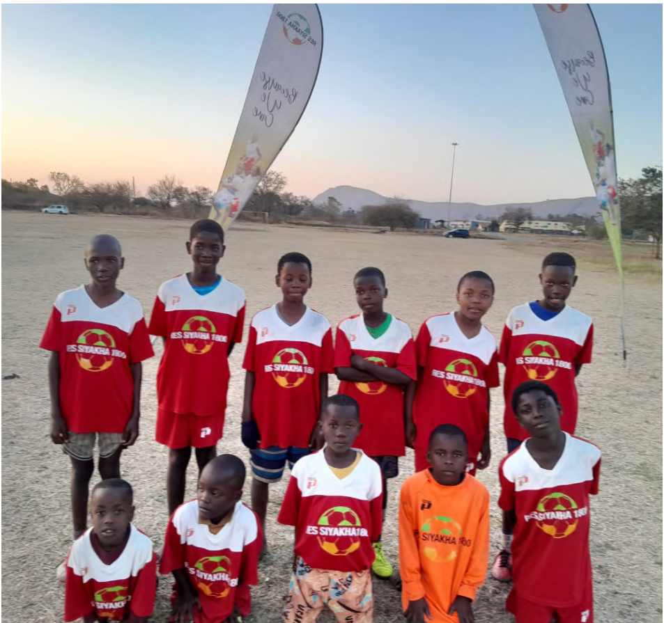
▲Siyakha Under 13 champions Young Reds.