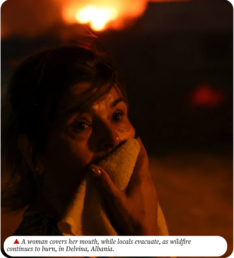
▲ A woman covers her mouth, while locals evacuate, as wildfire continues to burn, in Delvina, Albania.