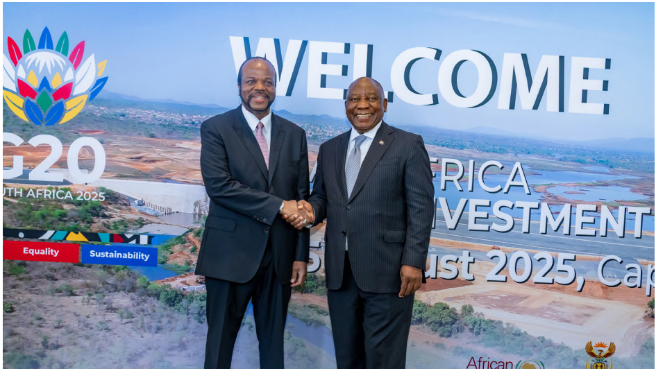
▲His Majesty King Mswati III and President Cyril Ramaphosa shake hands at the AU-AIP Africa Water Investment Summit in Cape Town. by 2030. It also advances Agenda 2063: the Africa We Want." The King highlighted Eswatini's efforts, including dams for irrigation and clean water supply, and ongoing engagements with financial institutions to support agriculture and water projects. He stressed the need for support from development partners, financial institutions, private investors and multilateral organisations due to the substantial funding required.

Global Water Partnership Southern Africa and Green Climate Fund, we are developing the Eswatini Water Investment Programme, set for completion by late 2025. This will guide resource mobilisation and implementation of high-impact water projects," the King said. He emphasised water's role in Eswatini's development, stating: "It fuels agriculture, which accounts for over 90 per cent of water abstractions, drives industry, safeguards public health and strengthens climate resilience. However, ageing infrastructure, rising water needs and climate change pose challenges." His Majesty endorsed the Continental Africa Water Investment Programme (AIP), a transformative platform to mobilise US$30 billion (E570 billion) annually to close Africa's water investment gap. He added: "The AIP aligns with our national development plan, climate adaptation priorities and commitment to United Nations Sustainable Development Goal 6, ensuring clean water and sanitation for all