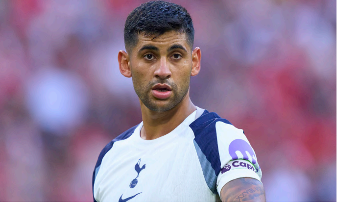
▲ Cristian Romero.

Romero, who joined Spurs from Atalanta four years ago