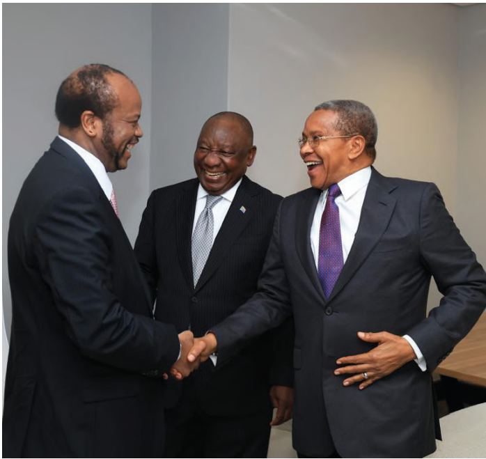
▲ His Majesty King Mswati III shares a light moment with South African President Ramaphosa and former President of Tanzania Jakaya Kikwete.