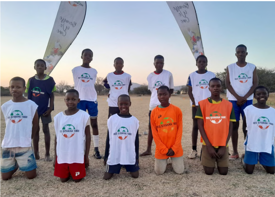
▲Siyakha Under 15 champions Vuvulane Brave Lions.

about 90 per cent of the Brave Lions seniors team players. “Actually, I am always with the children, I love them, and they love me. I’m like a father to them. I derive pleasure in producing the