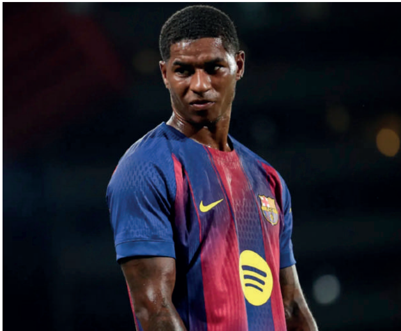
▲ Marcus Rashford.

managers, different ideas and different strategies to win that you end up in no man’s land.”