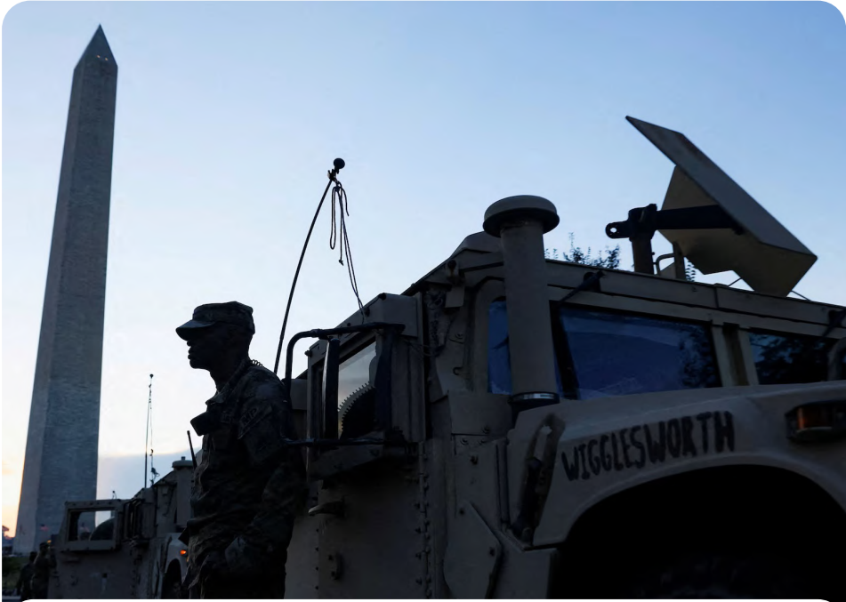
▲ U.S. Army National Guard Humvees park near the Washington Monument after President Trump announced a federal takeover of the Metropolitan Police Department under the Home Rule Act to assist with crime prevention in the nation's capital.