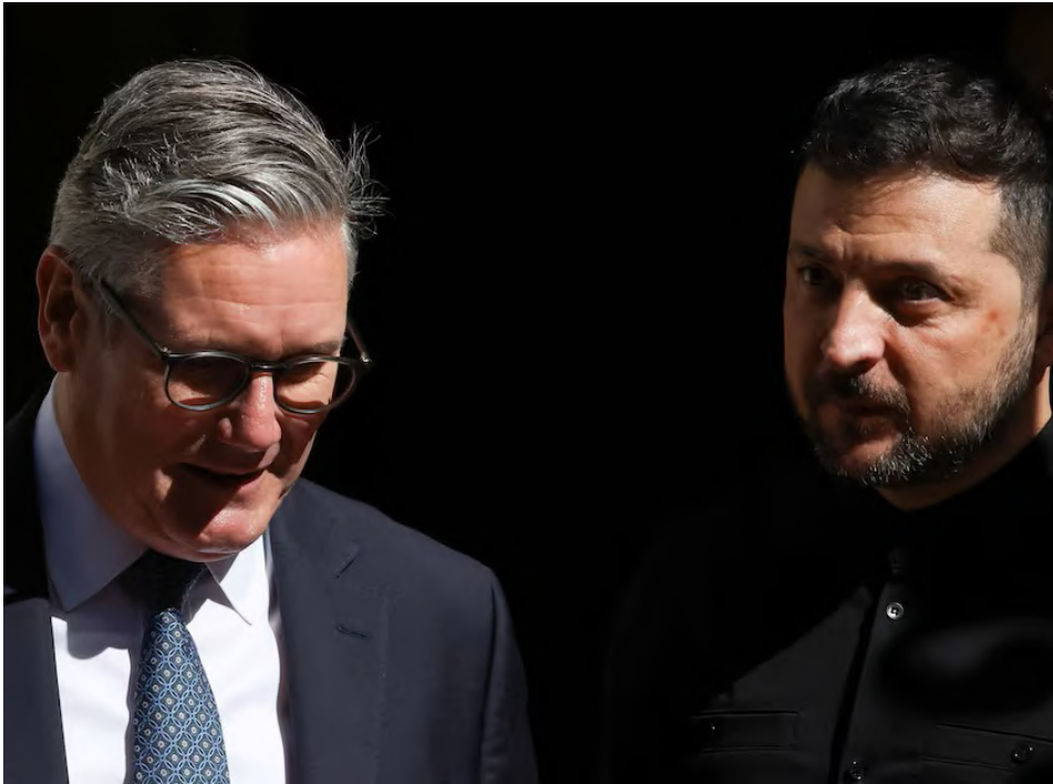
▲ Ukrainian President Volodymyr Zelenskiy and British Prime Minister Keir Starmer walk out of 10 Downing Street, in London, Britain.

A senior eastern European official, who requested anonymity to discuss sensitive matters, said Putin would try to distract Trump