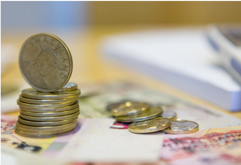
▲ According to the CBE, the fixed interest rates for the bonds will range from 10.50 per cent to 12.00 per cent.

Application forms can be obtained from the Bank's offices or downloaded from the dedicated