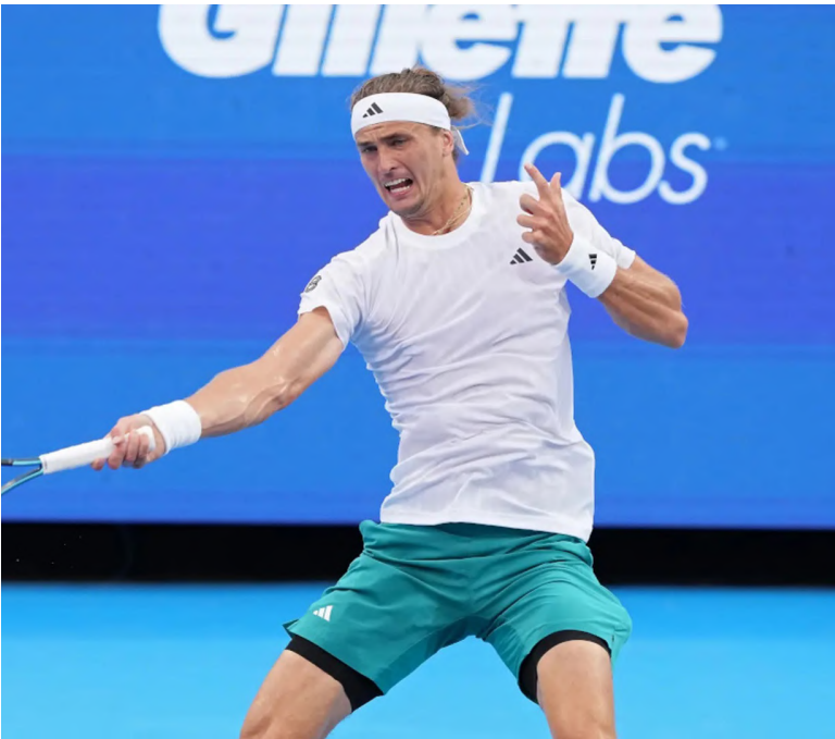
▲ Former champion Alexander Zverev.

problem, but did not seem to lead to improvement as Rune gained control.