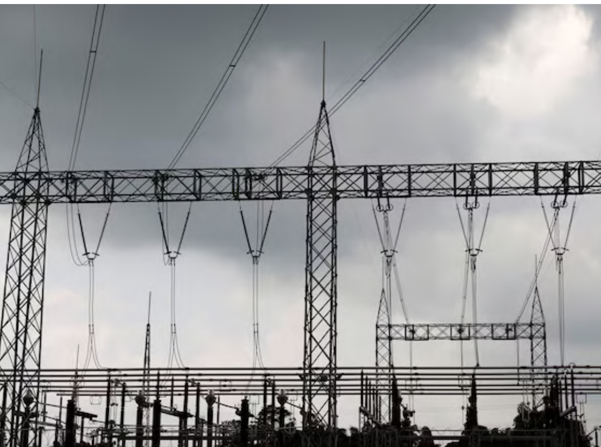
▲ High-tension electrical power lines are seen at the Azura-Edo Independent Power Plant (IPP) on the outskirts of Benin City in Edo state, Nigeria.