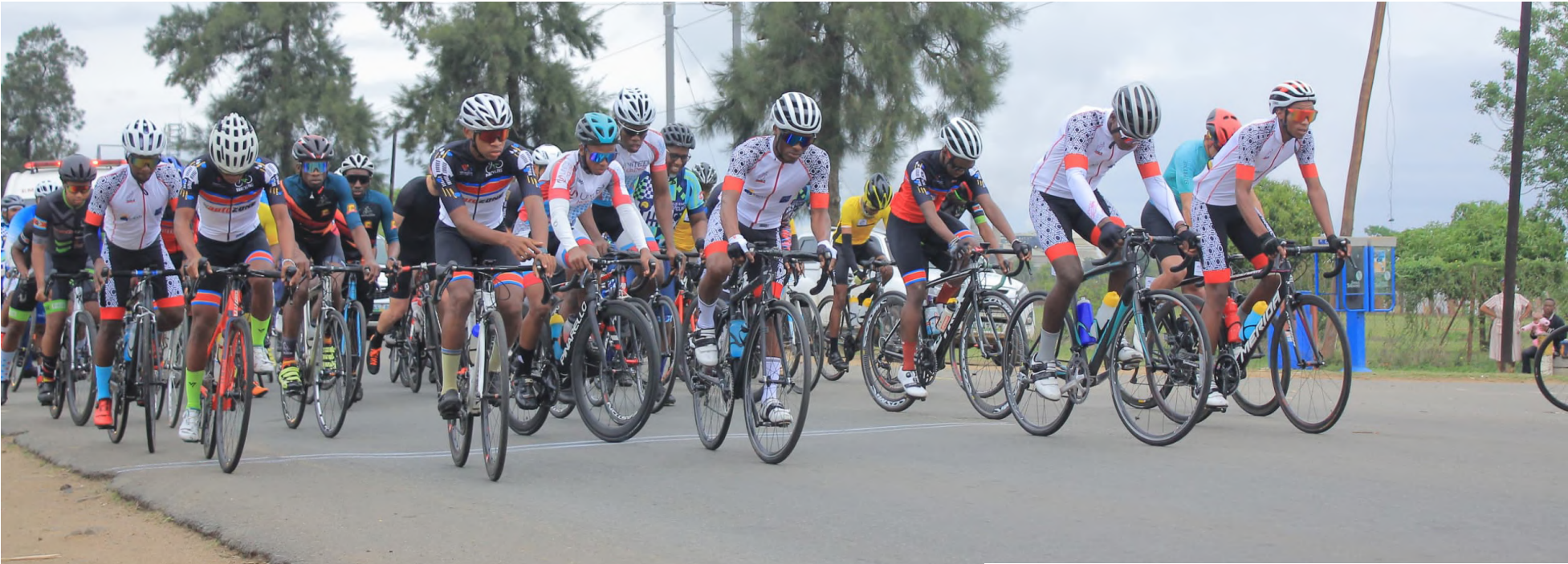
▲ Riders in action during a local race.