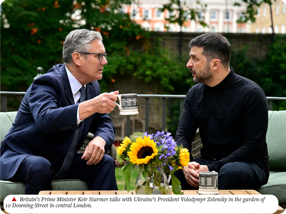
▲ Britain's Prime Minister Keir Starmer talks with Ukraine's President Volodymyr Zelensky in the garden of 10 Downing Street in central London.