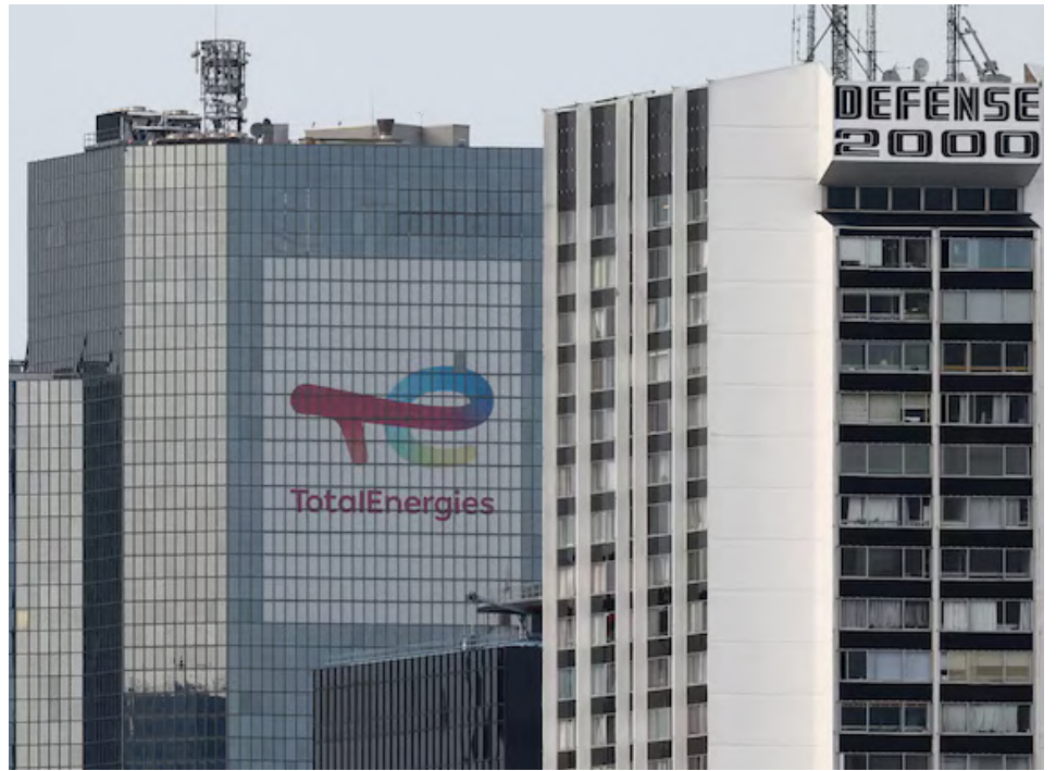
▲ The TotalEnergies logo sits on the company’s headquarters skyscraper in the La Defense business district near Paris, France.