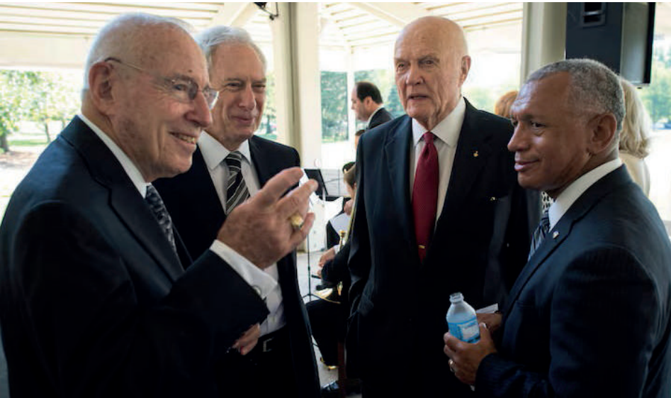
▲ Apollo 13 astronaut Jim Lovell (L to R), former NASA Administrator Dan Goldin, Sen. John Glenn and NASA Administrator Charles Bolden talk at a private memorial service celebrating the life of Neil Armstrong at the Camargo Club in Cincinnati, Ohio

There was drama even before Apollo 13’s launch on April 11, 1970. Days earlier, the backup lunar module pilot inadvertently exposed the crew to German measles but Lovell and Haise were immune to it. Ken Mattingly, the command module pilot, had