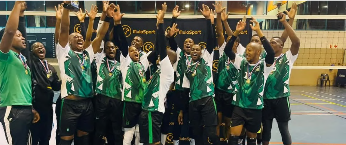
▲ Correctional males celebrating their victory during the previous edition of the Mula Sport Series.

the development of the sport in the country,” she said. The domestic competition will help local clubs prepare for international assignments such as the zone vi clubs championships slated for December at Polokwane, South Africa. The full fixture UNESWA vs UEDF Men REPS vs Zakhlele Women Tigers’ vs Bob Cats Men REPS vs Correctional Men RES Vs Olympia Men TIGRESS vs UEDF Women Correctional vs Scorpions Women