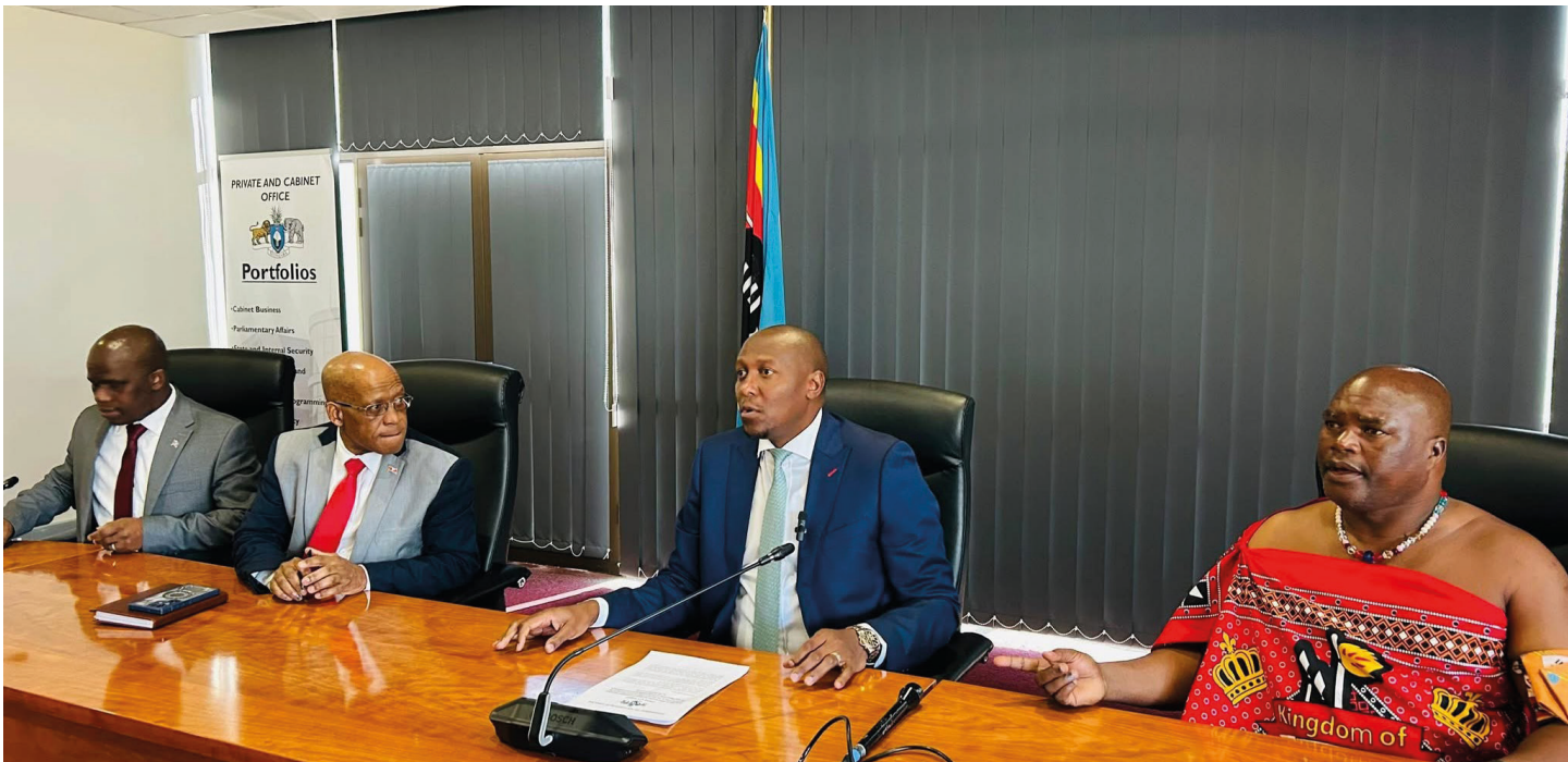
▲ Prime Minister Russell Dlamini has revealed that government has enhanced security personnel salaries.

a) The Government will implement the recommended professional adjustments for the three ranks identified as misaligned in the Consultant's assessment: Inspector/