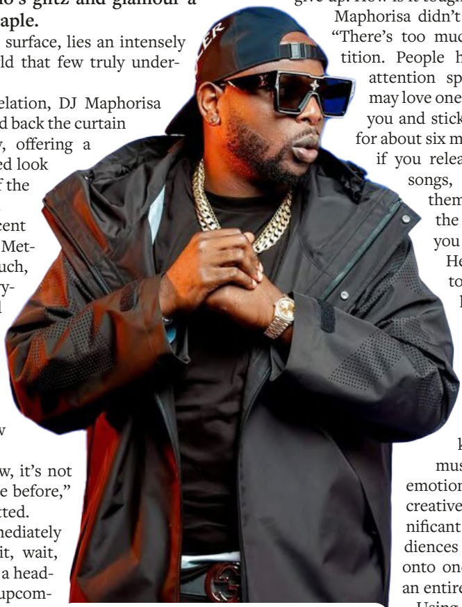
▲ DJ Maphorisa has slightly pulled back the curtain on the industry, offering a raw and unfiltered look at the realities of the Amapiano scene.