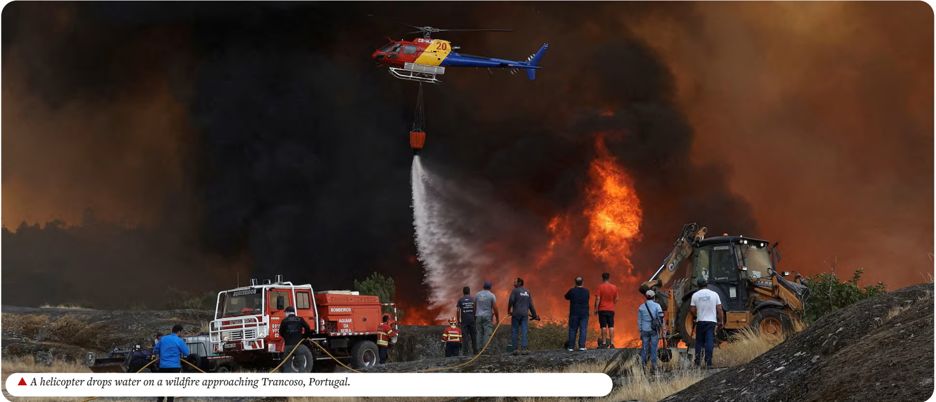
▲ A helicopter drops water on a wildfire approaching Trancoso, Portugal.