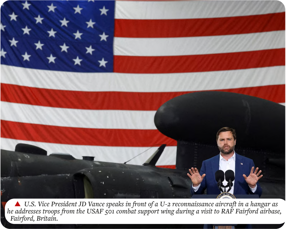
▲ U.S. Vice President JD Vance speaks in front of a U-2 reconnaissance aircraft in a hangar as he addresses troops from the USAF 501 combat support wing during a visit to RAF Fairford airbase, Fairford, Britain.