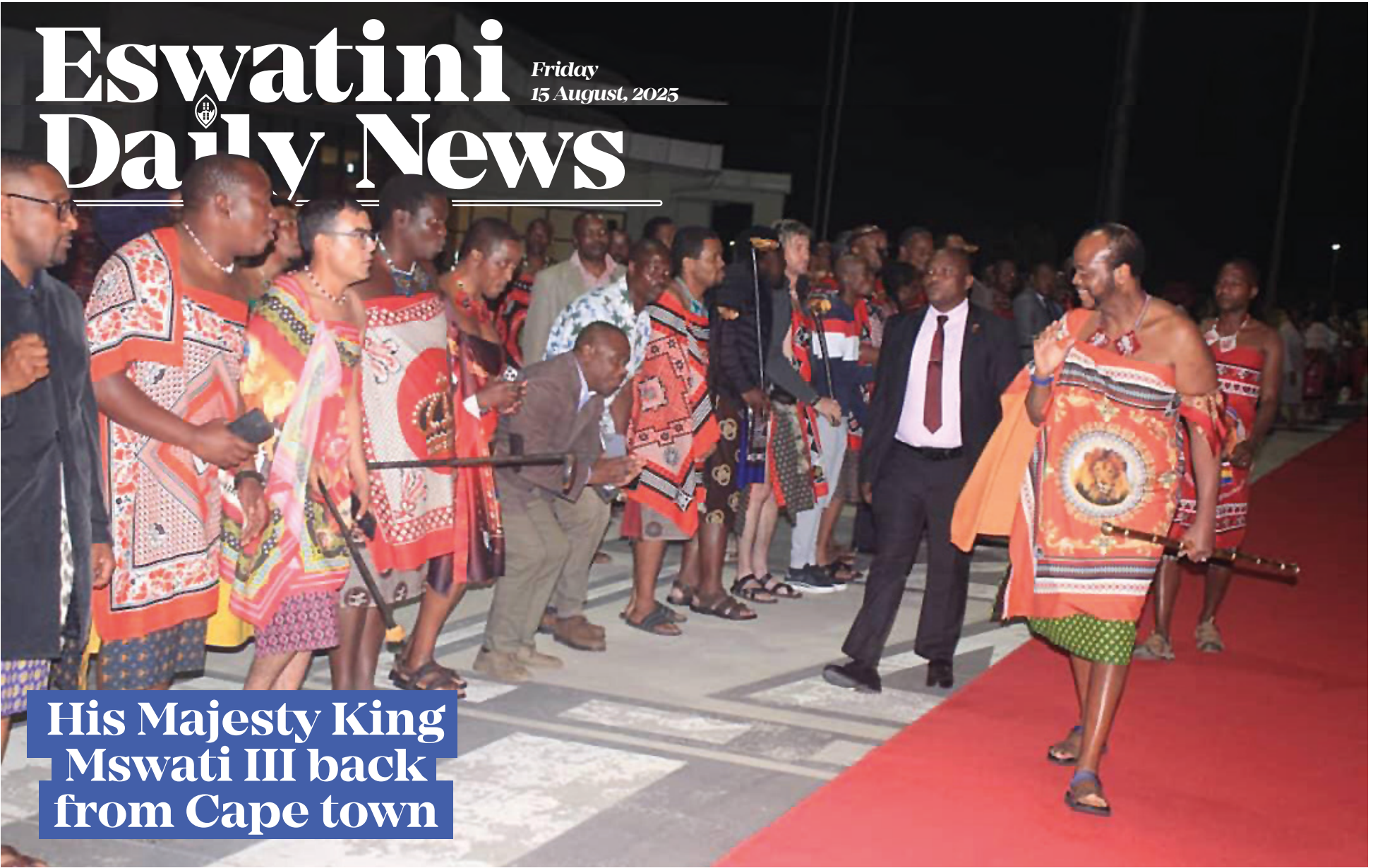
▲ His Majesty King Mswati III is back in the country from the AU-AIP Water Investment Summit, hosted by South African President Cyril Ramaphosa, G20 Chairperson in Cape Town, South Africa.

● The implementation of this agreement is set to take effect in September 2025.