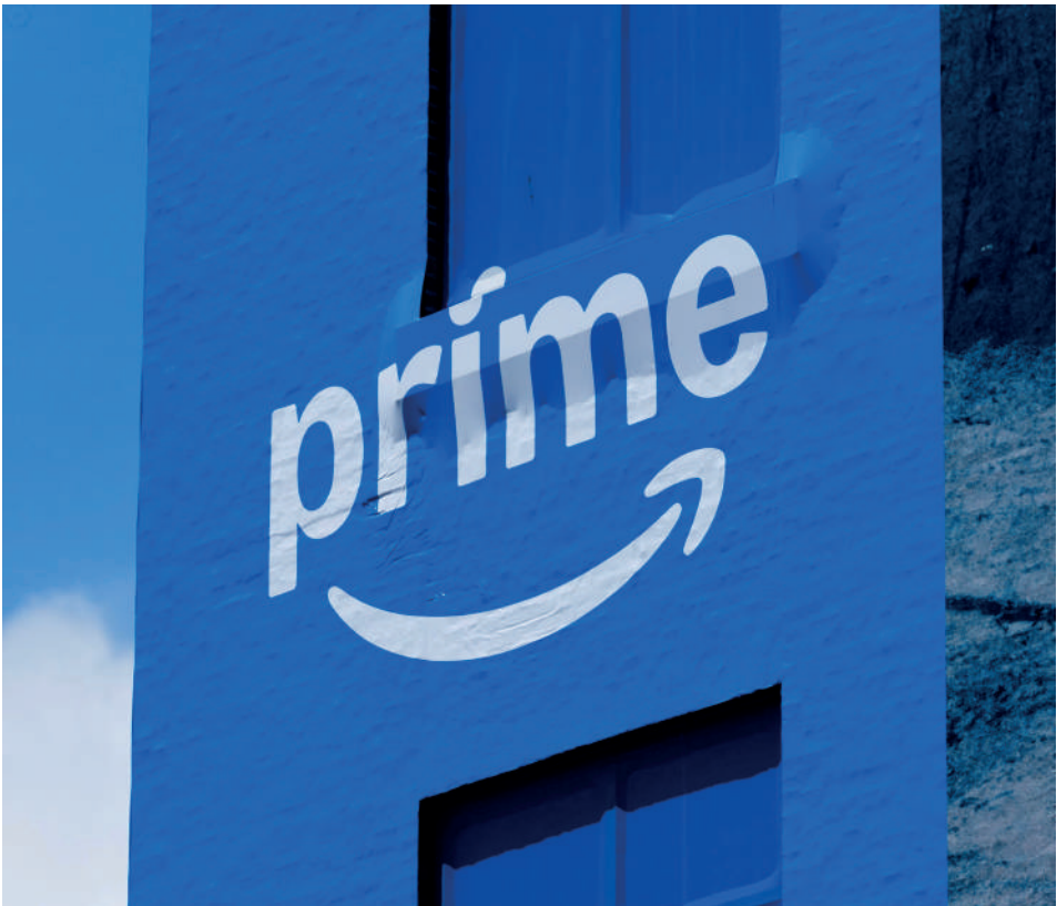
▲ A downtown building is wrapped in Amazon Prime advertising ahead of Comic-Con International, in San Diego, California, U.S.

In May, Walmart said it will soon be able