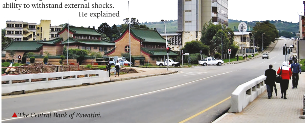
▲ The Central Bank of Eswatini.

He also notes that higher reserves can support the exchange rate and give the government more room to manage its fiscal and monetary policies. The Bank's statement concluded by reaffirming its commitment to monitoring liquidity conditions, maintaining financial stability, and supporting sustainable economic growth.