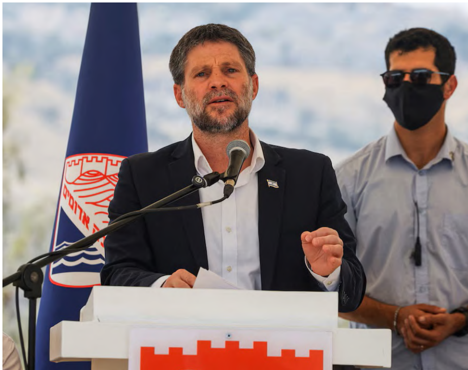
▲ Israeli Finance Minister Bezalel Smotrich speaks at a press conference regarding settlements expansion for the long-frozen E1 settlement, that would split East Jerusalem from the occupied West Bank, near the Israeli settlement of Maale Adumim in the Israeli-occupied West Bank,

Peace Now, which tracks settlement activity in the West Bank, said there were still steps needed before construction. But if all