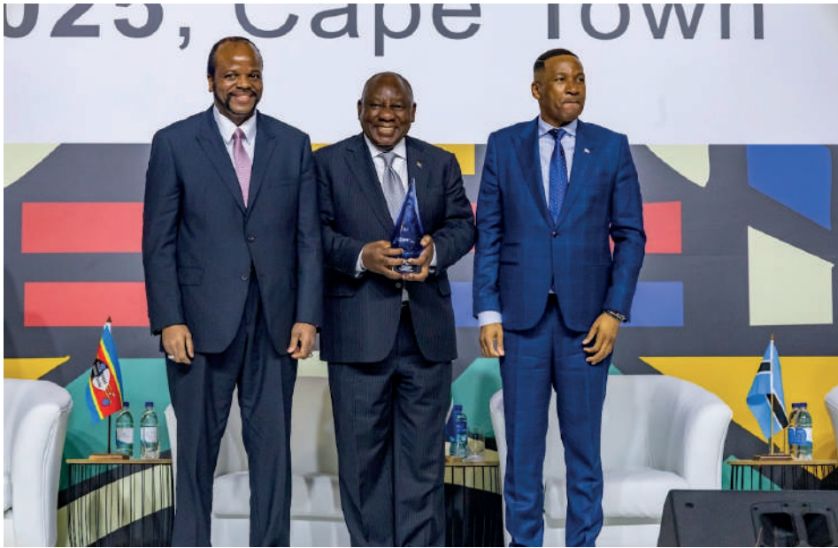
▲His Majesty King Mswati III, South African President Cyril Ramaphosa and Botswana President Duma Boko at the AU-AIP Water Investment Summit.