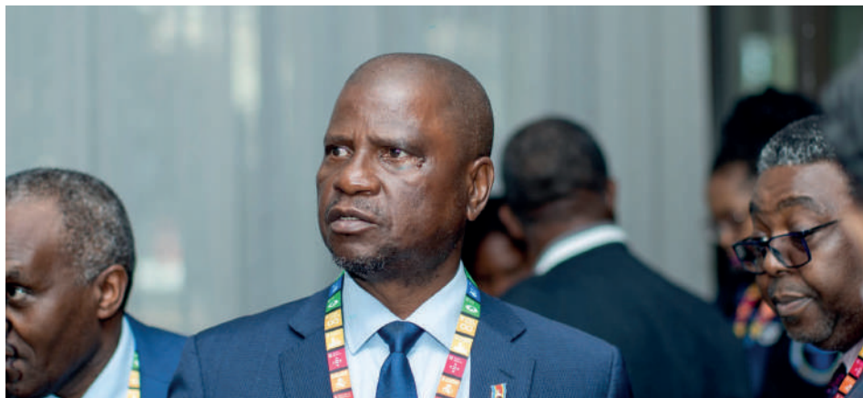
▲ Minister of Agriculture Mandla Tshawuka.

the Hand-in-Hand (HIH) Initiative and the One Country One Priority Product (OCOP) programme, which support the creation of agro-industrial parks and agri-tech hubs across the country.