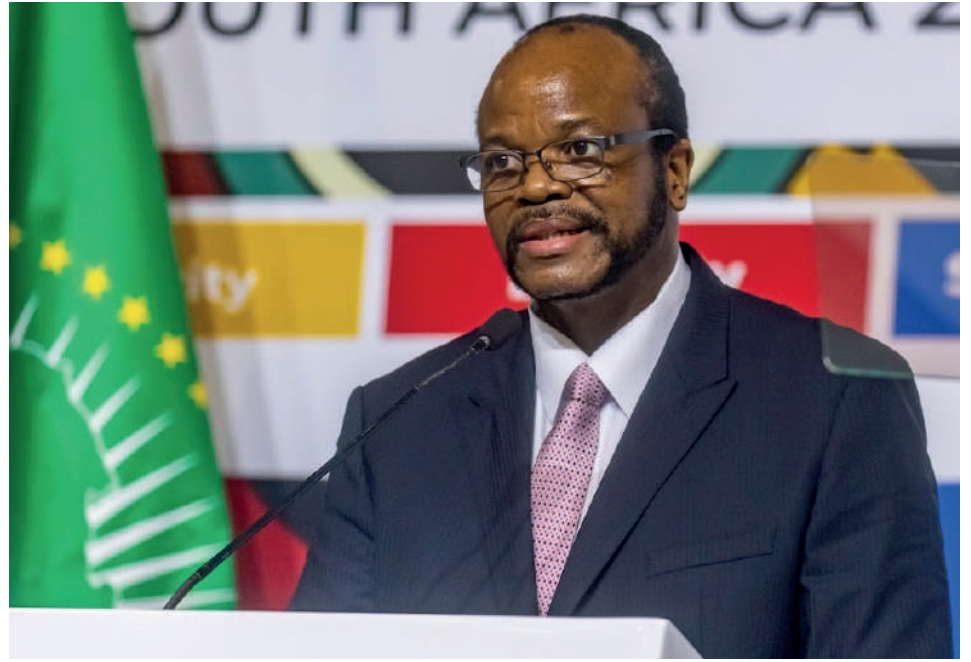
▲His Majesty King Mswati III speaking at the Summit.