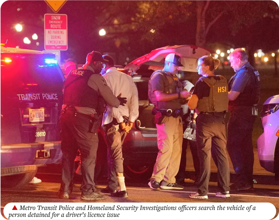
▲ Metro Transit Police and Homeland Security Investigations officers search the vehicle of a person detained for a driver's licence issue