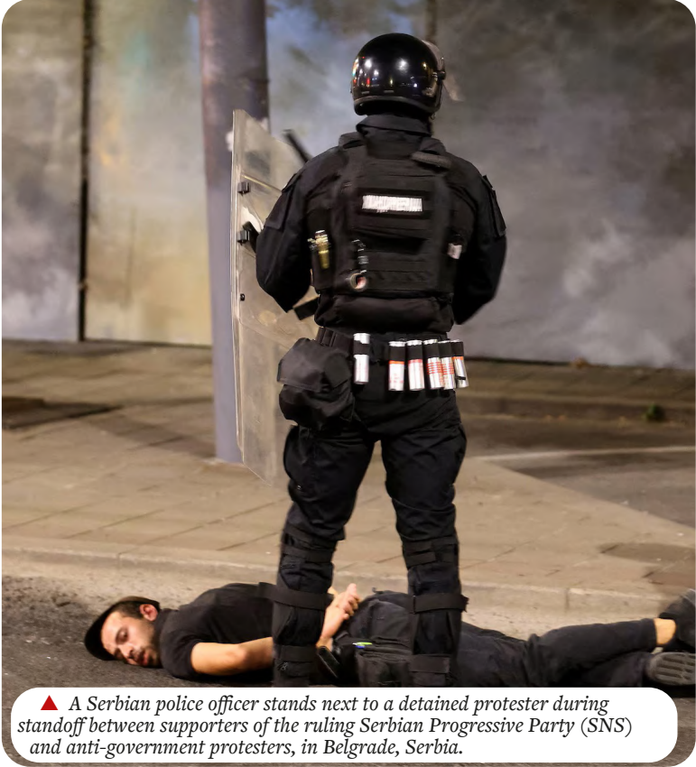
▲ A Serbian police officer stands next to a detained protester during standoff between supporters of the ruling Serbian Progressive Party (SNS) and anti-government protesters, in Belgrade, Serbia.