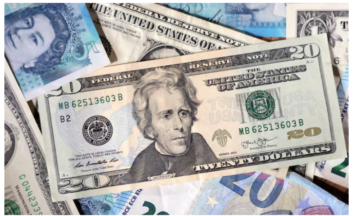
▲ The hot measure of inflation at the wholesale level follows the release on Tuesday of a better than feared rise in consumer prices in July, which emboldened traders to boost bets on interest rate cuts from the Federal Reserve in coming months.