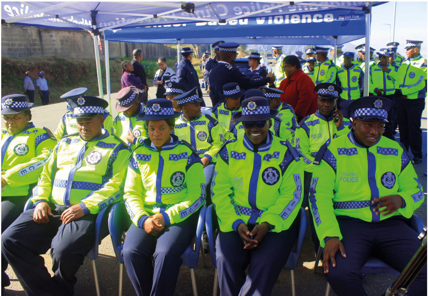
▲ Police officers in this undated photo.

8% backpay for senior ranks, 3% increment for junior cops