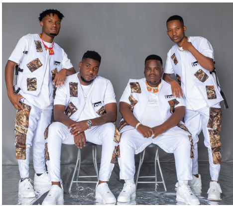
▲ The four local stars who have signed with True Classic.

The upcoming New York show is part of Uncle Waffles’ broader efforts to reach international audiences and showcase the vibrant sounds of amapiano on a global stage. This performance is particularly significant as it represents a growing trend of African artists gaining recognition and acclaim in the U.S. music market. With the increasing popularity of genres like amapiano, Afrobeat, and Afropop, Uncle Waffles is poised to be at the forefront of this musical movement.