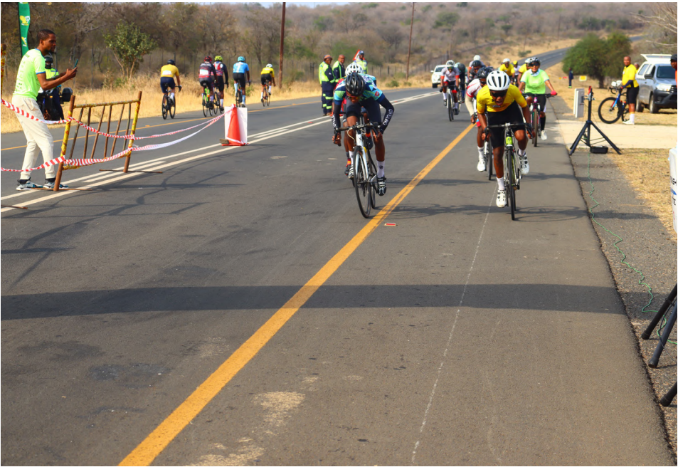
▲ 75km riders approaching the finish line.

said they were happy with their progress of their youngsters. “We are pleased with the performance of our youngsters and will continue guiding them until they reach full potential. We have nurtured some exciting talent in the past, such as Muzi Shabangu, as part of our commitment to develop cycling in the country,”he said.