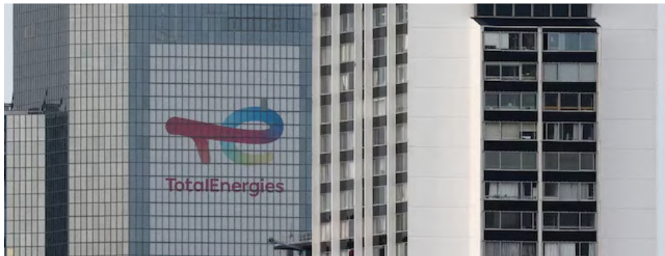
▲ The TotalEnergies logo sits on the company’s headquarters skyscraper in the La Defense business district near Paris, France.