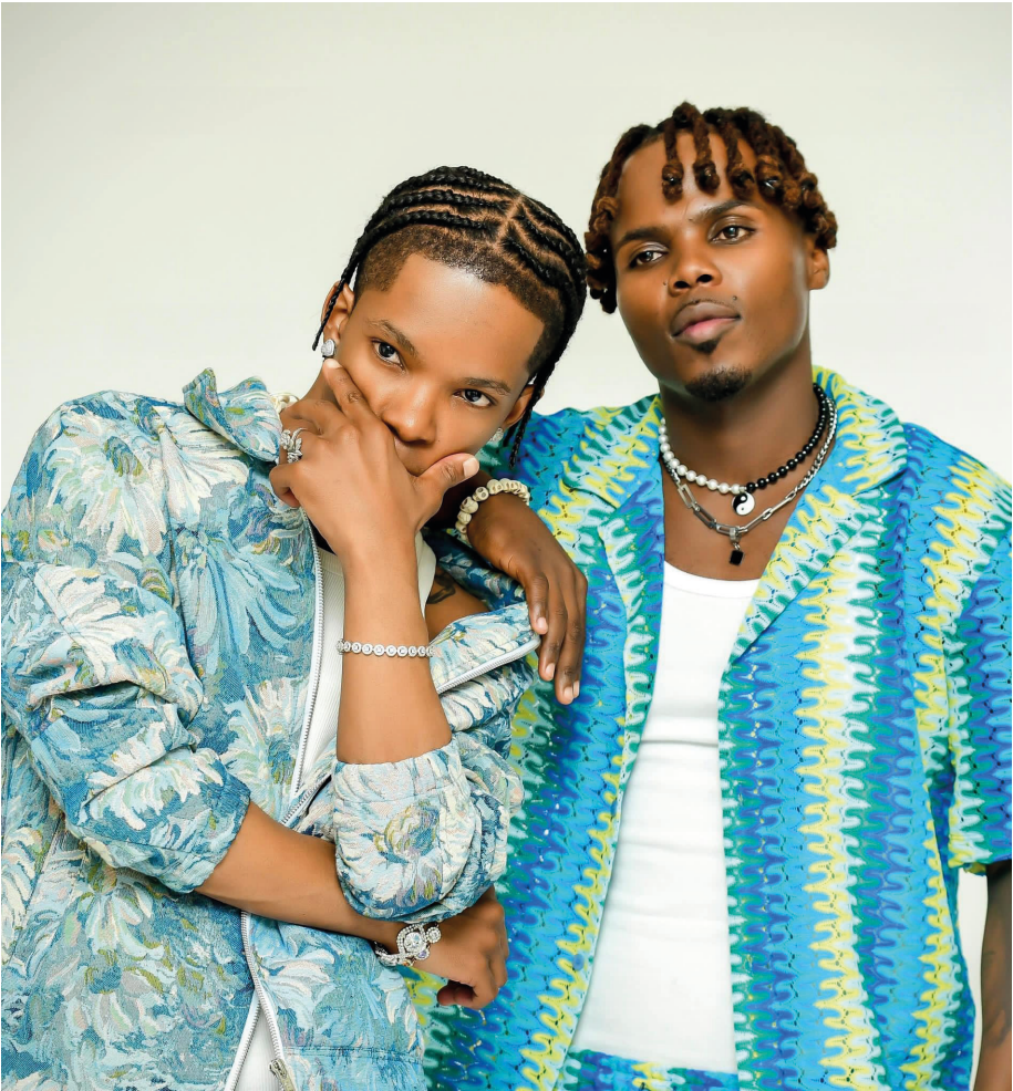
▲ Blaq Diamonds.

The journey of Blaq Diamond began in 2010 during a seemingly ordinary school