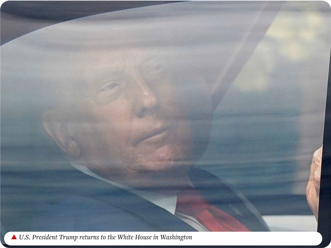
▲ U.S. President Trump returns to the White House in Washington