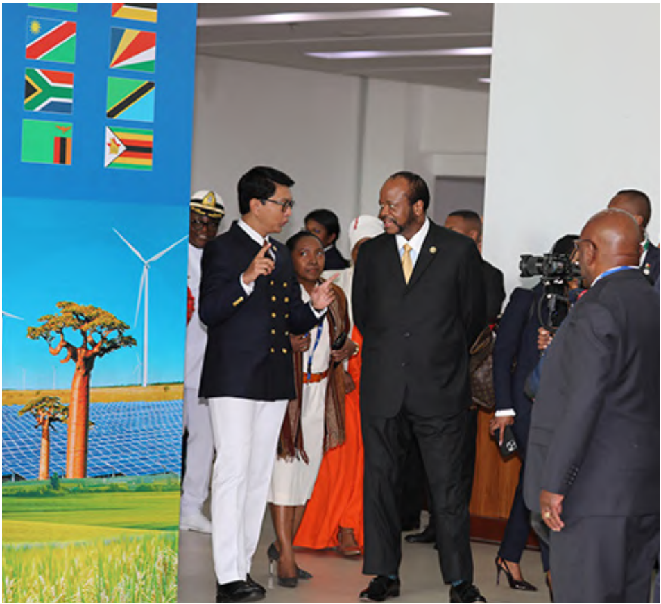
▲ His Majesty King Mswati III the incoming Deputy Chairperson of the SADC Organ on Politics, Defence and Security Cooperation speaks to incoming SADC Chairperson, President of Madagascar Andry Rajoelina on the sidelines of the 45th Ordinary SADC Summit.

Coincidentally, this appointment occurs in Madagascar, where His Majesty previously played a pivotal role as Chairperson of Organ on Politics, Defence and Security Cooperation from 2010 to 2011. During that period, the organ initiated a roadmap that led to a peaceful resolution to the political conflict that began in 2009 with the ousting of then-President Marc Ravalomanana.