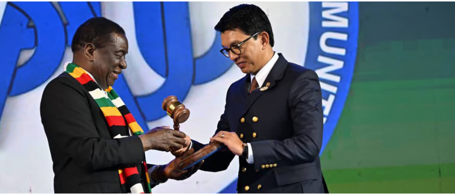
▲ In a heartfelt moment, President Mnangagwa passed the SADC Chairmanship to President Rajoelina.