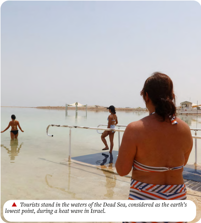
▲ Tourists stand in the waters of the Dead Sea, considered as the earth's lowest point, during a heat wave in Israel.