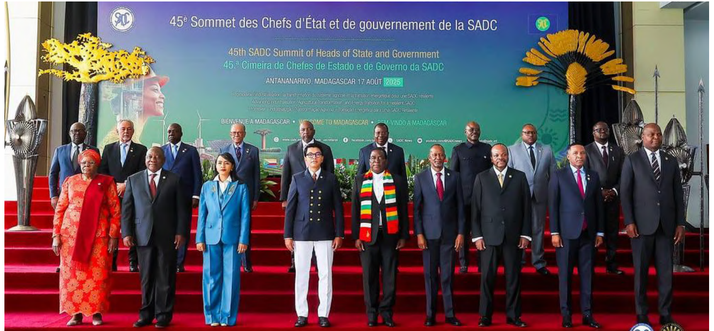
▲ SADC heads of state pose for a picture during the ADC's development agenda for the coming year.

Energy Security: Despite abundant renewable energy resources, electricity access