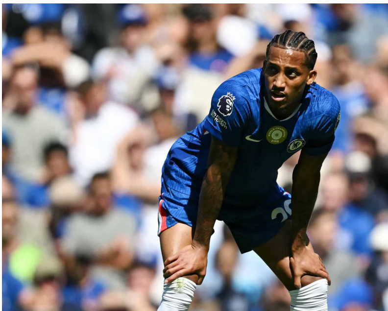
▲ Chelsea's Brazilian striker #20 Joao Pedro.

the Club World Cup in his final game for Palmeiras.