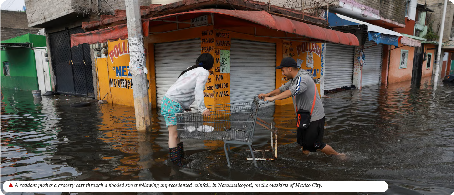
▲ A resident pushes a grocery cart through a flooded street following unprecedented rainfall, in Nezahualcoyotl, on the outskirts of Mexico City.