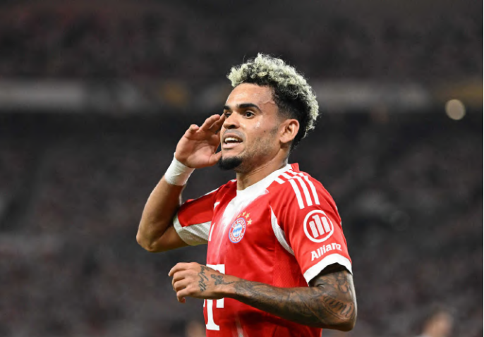
▲ Bayern Munich's Colombian forward #14 Luis Diaz.