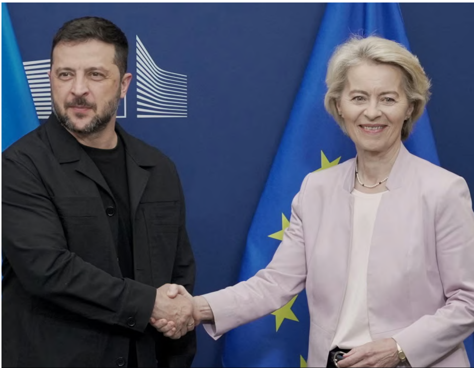
▲ European Commission President Ursula von der Leyen shakes hands with Ukrainian President Volodymyr Zelenskiy in Brussels, Belgium, where he will participate in a meeting of European leaders,

European Commission President Ursula von der Leyen will also travel to Washington, as will Finland’s President Alexander Stubb,