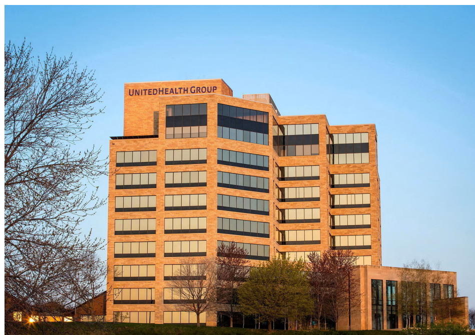
▲ UnitedHealth Group's headquarters building is seen in Minnetonka, Minnesota, U.S.

UnitedHealth missed Wall Street's earnings target for two straight quarters this year