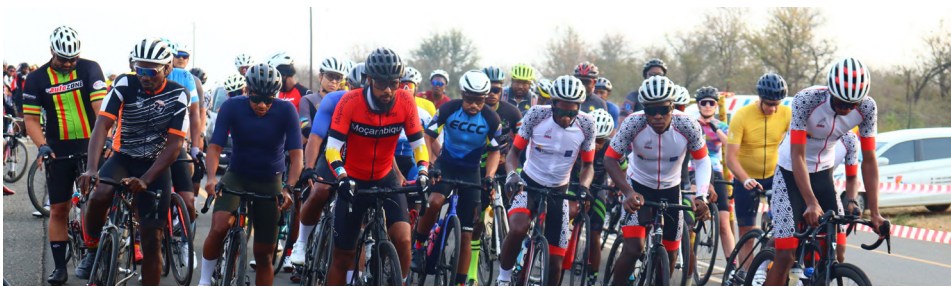
▲ Riders at the start of the race.