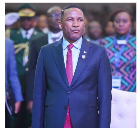
▲ Botswana's President, Duma Boko.

President Boko called for a departure from traditional approaches, advocating for "radical and progressive ideas" to address poverty, unemployment, and inequality. He emphasised that SADC's success depends on collective action, with no nation left behind. "We need each other desperately," he said, urging African countries to value their interdependence and build a united, prosperous future.