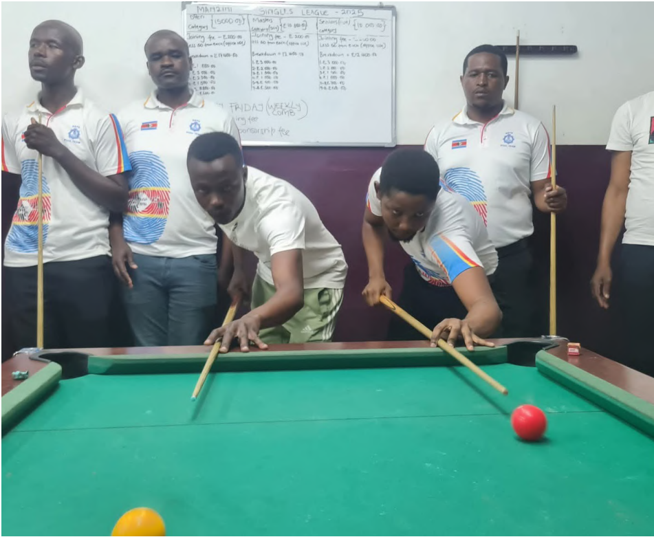
▲REPS and Give Thanks players during the Sphana knockout tournament.