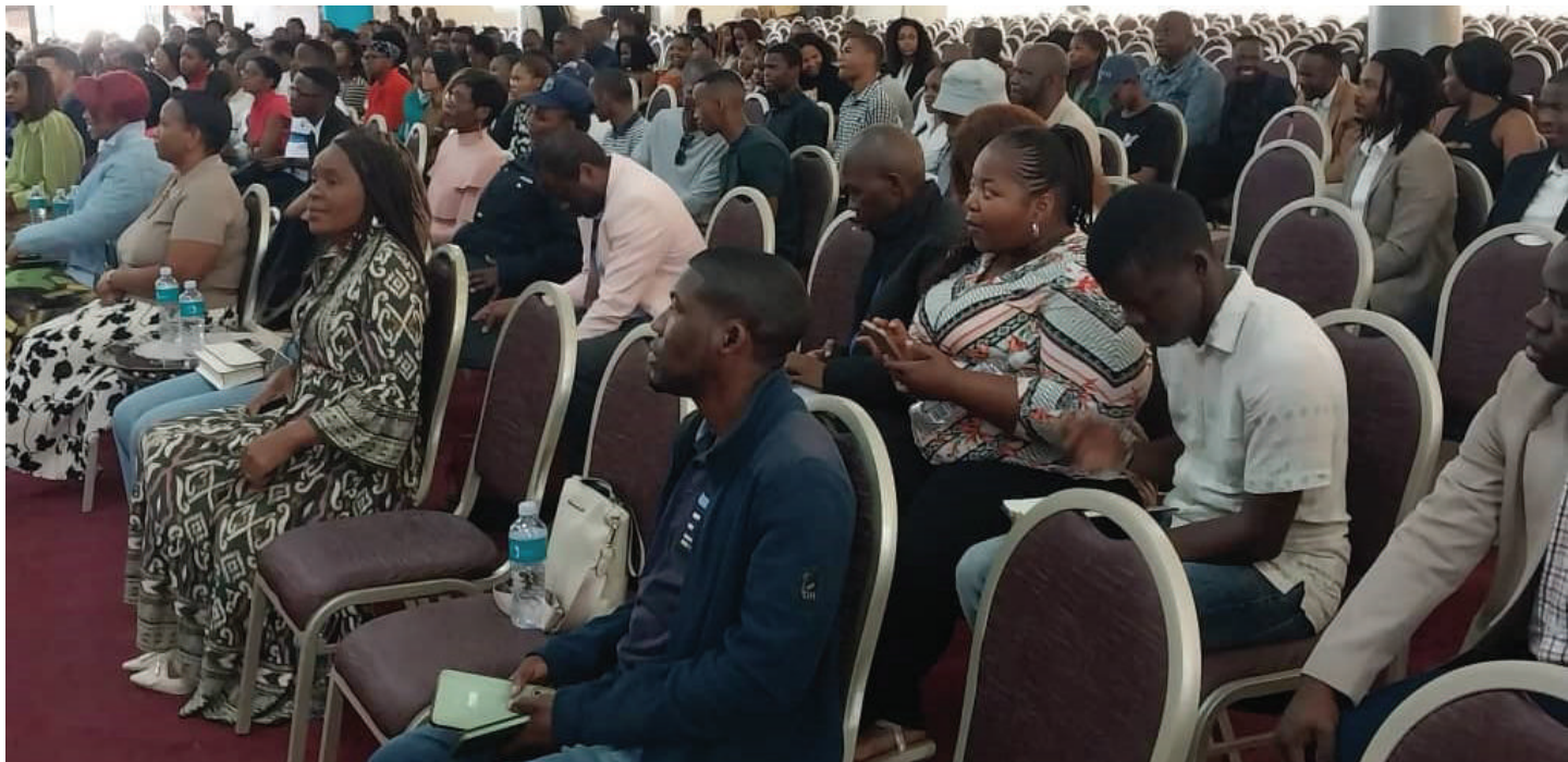
▲ STEM Mentorship Programme participants.

such, they should perform to the best of their abilities once they get into the workspace.