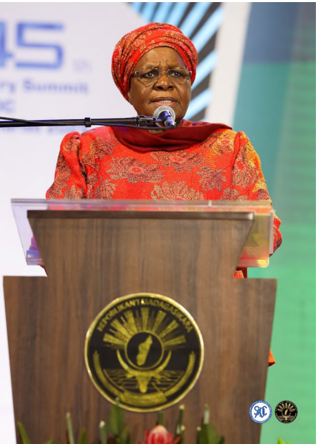
▲ President of Namibia Dr. Netumbo Nandi-Ndaitwah makes her address at the 45th Ordinary SADC Summit.

"Namibia is deeply committed to the empowerment of women, and my presence here today stands as testimony to that commitment," President Nandi-Ndaitwah said.