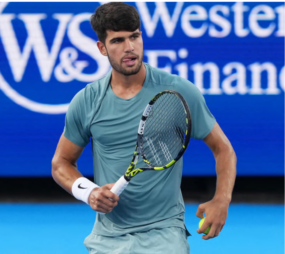
▲ World No 1 Jannik Sinner.

"I tried to focus on myself, how I usually play, and then try to adapt a little bit to his game style," Sinner said. "And that's exactly what I did today."