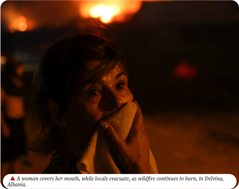
▲ A woman covers her mouth, while locals evacuate, as wildfire continues to burn, in Delvina, Albania.