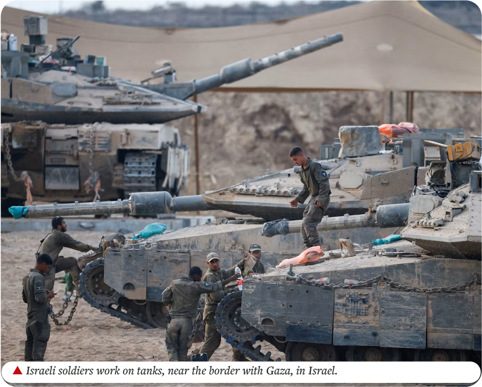
▲ Israeli soldiers work on tanks, near the border with Gaza, in Israel.