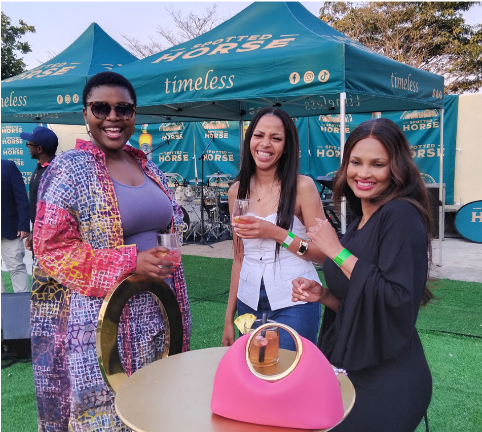
▲ Invited socialites during the event.