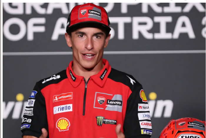
▲ Marc Marquez.

"I will need to control myself in some races because you cannot be the fastest out there in every session, every practice and every race." (Supersport)