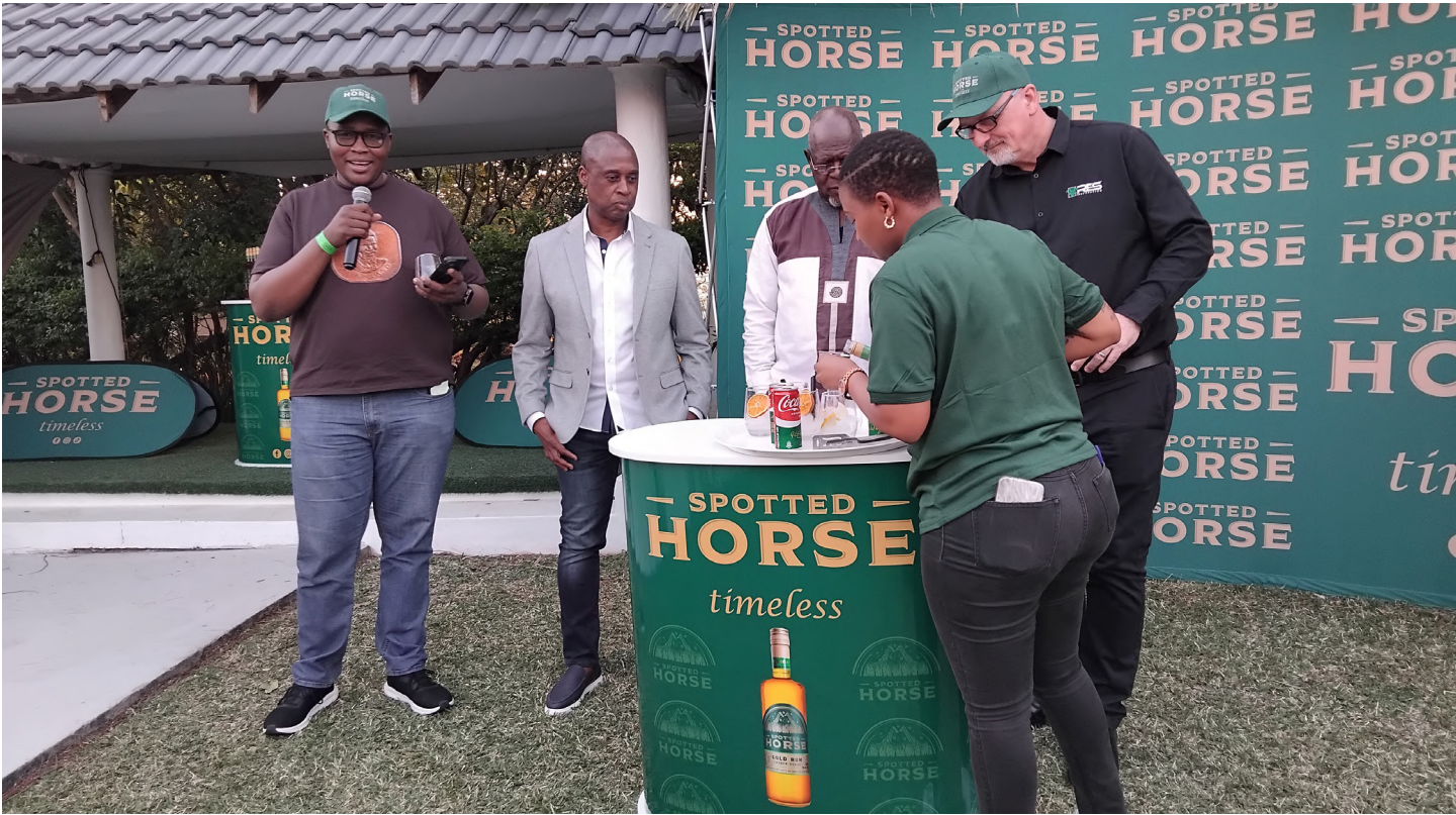
▲ RES Executives tasting the rum.

the enterprise through cycles. He said the company would continue to investigate other ideas beyond rum, framing diversification as a portfolio approach in which energy, ethanol and beverages reinforce one another.