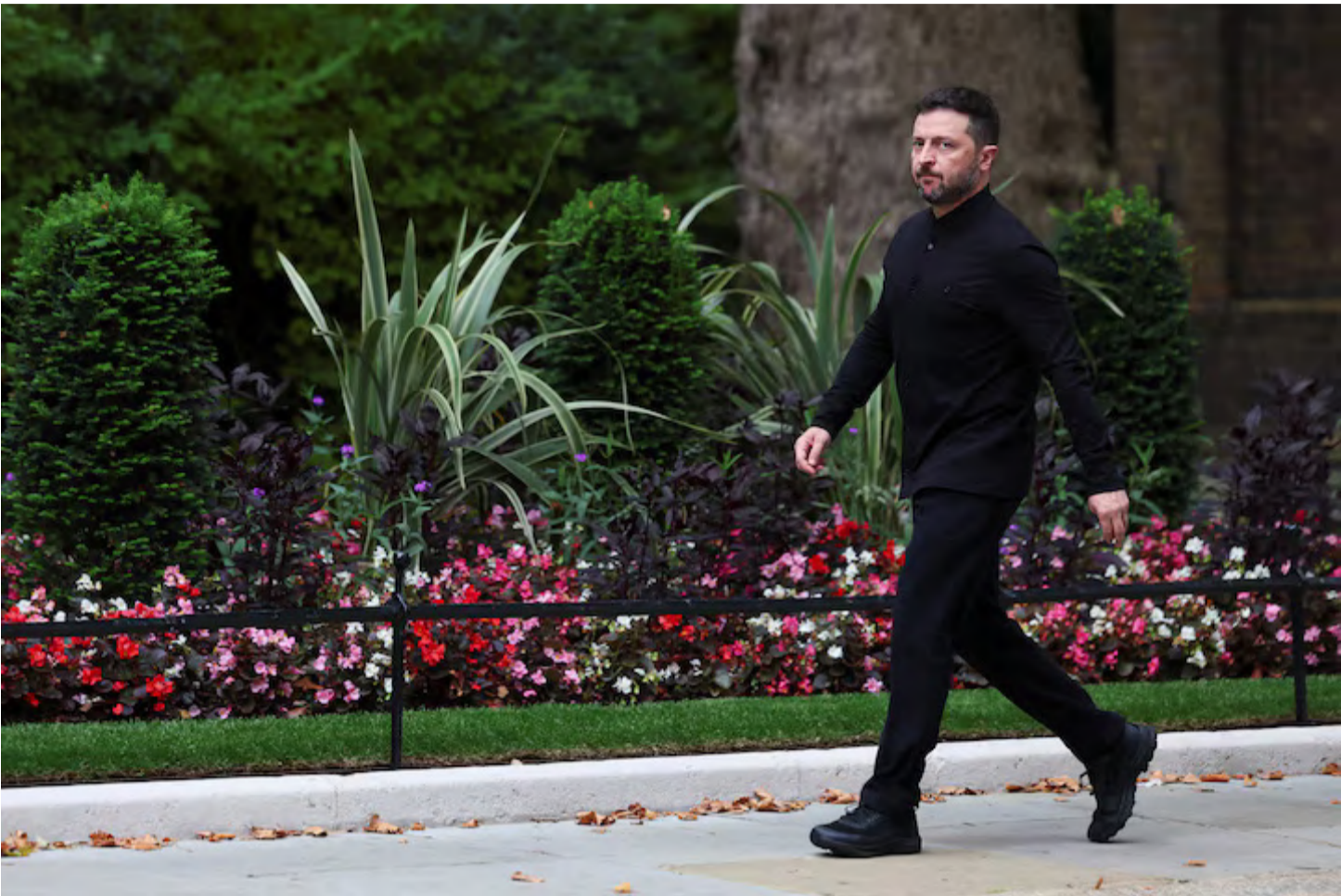
▲ Ukrainian President Volodymyr Zelenskiy walks to meet British Prime Minister Keir Starmer at Downing Street, in London, Britain

are flying to Washington to show solidarity with Ukraine and to press for strong security guarantees in any post-war settlement. Trump’s team stressed on Sunday that there had to be compromises on both sides. But Trump put the burden on Zelenskiy to end the war that Russia began with its full-scale invasion in February 2022. Ahead of the meeting, he said in a social media post Ukraine should give up hopes of getting back Crimea, annexed by Russia in 2014 during Barack Obama’s presidency, or of joining the NATO military alliance. That suggested he would press Zelenskiy hard.