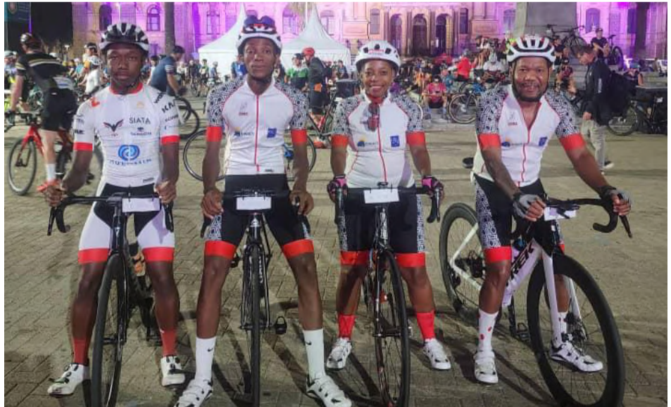
▲Team G members in Cape Town.

2 Furious race and ensured that we register for the cycling & fun walk competition. We had a good time during the event & this one not only does it presents a well-organized event. The location is very good as it accommodates even our non-partakers with all that Treetops offers. We are looking forward to the next one #shisawena,” she said. The race was attended by various local clubs such as 4eva cycling club, MTN Khemani, Newcomm Wheels, Darkton Cycling club, Kusekhaya,among others. Mozambique and South Africa also attended the race.