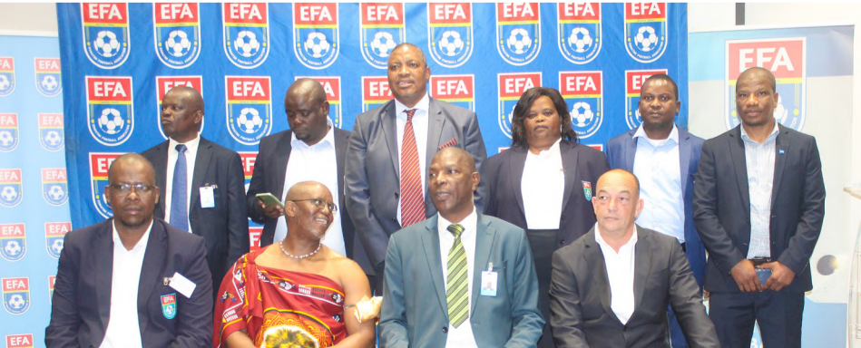
▲ The new EFA executive comiteee.