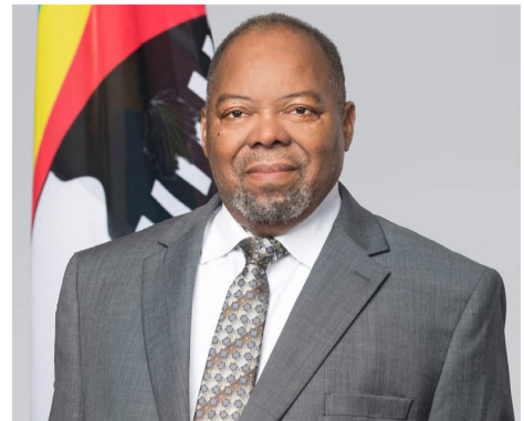
▲ Minister of Economic Planning Dr Tambo Gina.

However, the report also highlights significant disparities among different sectors. The hospitality industry, which encompasses restaurants and hotels, experienced a dramatic shift. Following a period of stagnation in June, when inflation plummeted to 5.1 per cent, July saw a sharp increase of 5.3 per cent in prices. This surge can be attributed to a resurgence in demand, as more consumers sought accommodation and dining experi-