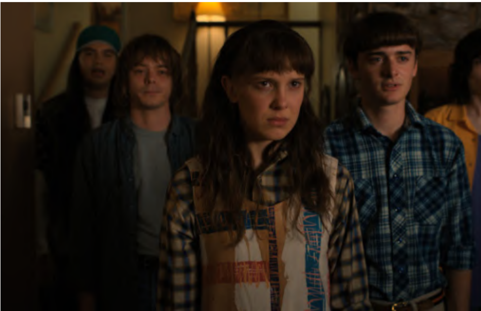
▲ The cast of “Stranger Things”.

Netflix movies usually aren’t shown by the major chains. This was, apparently, a sticking point for “Barbie” director Greta Gerwig, so the first of her “Narnia” movies for Netflix will play exclusively on Imax screens for two weeks (or more) before going to streaming on Christmas Day 2026. And it seems this was also important to the Duffers, with Belloni reporting that the “theatrical component” turned out to be the “dealbreaker” in their negotiations. The brothers’ absence will not be immediately noticeable on Netflix, which will be releasing the final season of “Stranger Things” in three (!) parts later this year, and where the Duffers have two new shows scheduled to launch in 2026. Plus, the “Stranger Things” empire is growing, with a prequel playing on Broadway, an animated series coming soon, and a live action spinoff reportedly in the works. (TechCrunch)