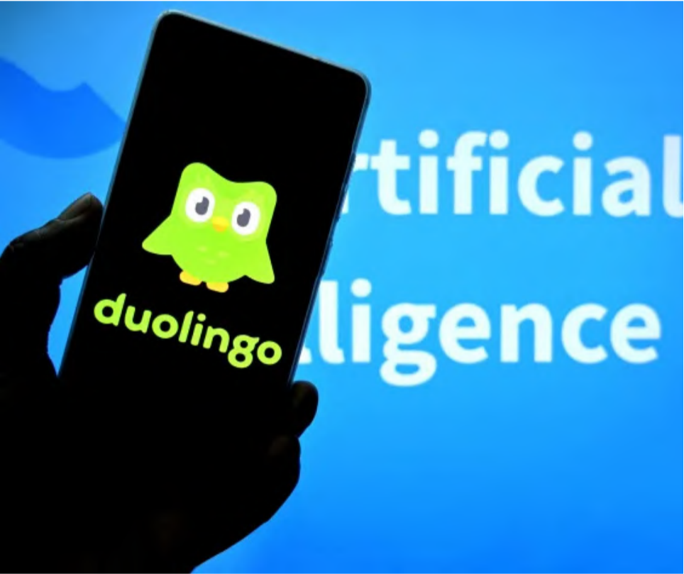
▲ Duolingo logo.