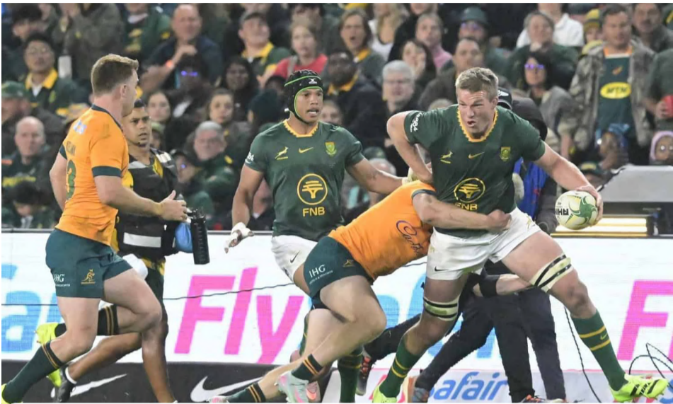
▲ Siya Kolisi and Pieter-Steph du Toit had been ruled out of the match through injury. Siya Kolisi and Pieter-Steph du Toit had been ruled out of the match through injury.

"They gave us shots there. Siya hurt his knee about five minutes from halftime and