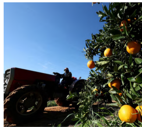
▲ A farm worker drives past an orange tree at Marcuskraal in Citrusdal, Western Cape province, South Africa.

In the first quarter of 2025, South African agricultural exports to the U.S. were $118 million, up by 19 per cent year-on-year, he added. (Reuters)