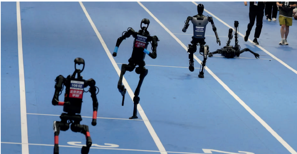
▲ Unitree Robotics and Tiangong humanoid robots compete in the 100m final at the inaugural World Humanoid Robot Games in Beijing, China.