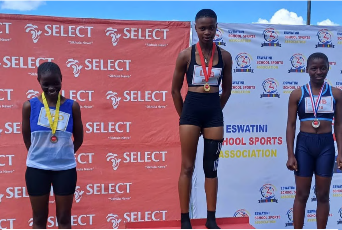
▲ Some of the junior athletes to represent the country during the 2025 COSASSA Games.

“Entry into these games is free for all. Please come and cheer your Eswatini team throughout the sporting event involving neighbouring countries,” he appealed. The treasurer also confirmed there will be soccer, volleyball, netball, basketball, and athletics as the codes in the competition. The confirmed countries are South Africa (SA), Zimbabwe, Lesotho, and Eswatini.