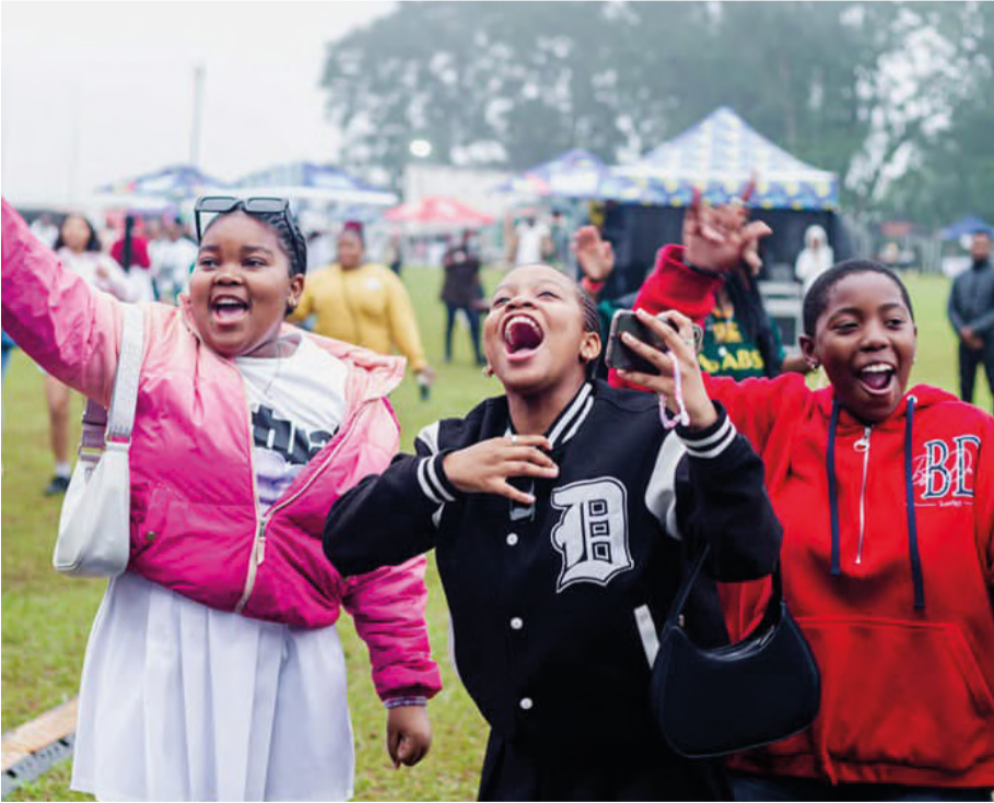
▲ Kids having fun during the previous edition of Eswatini Farmers Market.

Ticket sales for the event have been brisk. Early bird VIP tickets have already sold out, and the early bird kids' tickets have followed suit, leaving only general tickets available at E250. The price for children's access to the dedicated section is set at a family-friendly E100. Dlamini encouraged the public to purchase tickets promptly, emphasising the