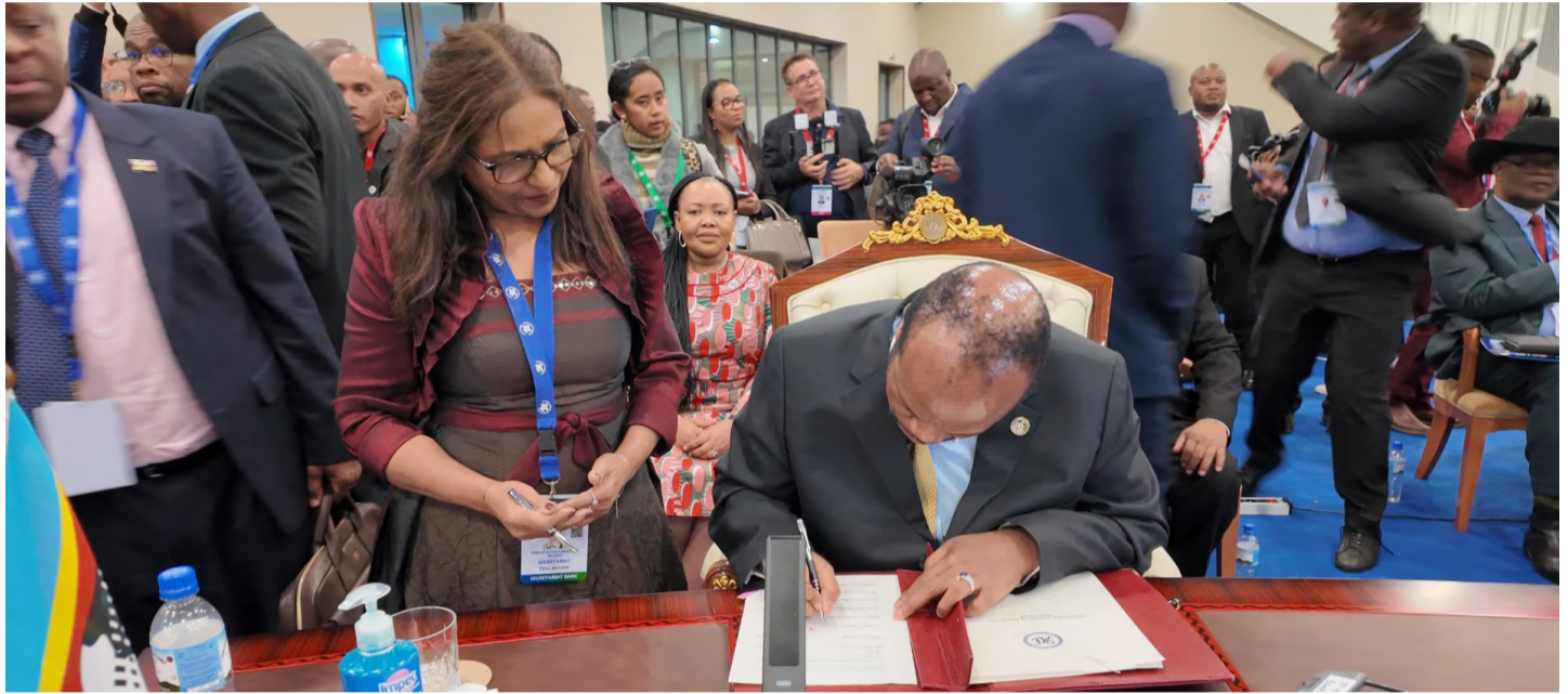
▲ His Majesty King Mswati III signed four SADC legal instruments on behalf of the Kingdom. The ratification took place during the 45th Ordinary Summit of Heads of State and Government held in Antananarivo, Madagascar.

In a statement released by the Ministry of Foreign Affairs and International Coopera-