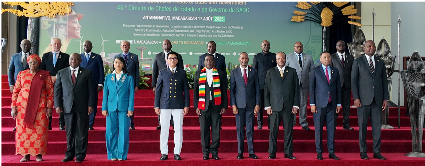
▲ SADC Heads of State and Government at the 45th Ordinary Summit have called for an immediate ceasefire, the release of all hostages and the start of talks to achieve a lasting solution in Gaza.

The Agreement on the Status of SADC Standby Force is said to further bolster national security, enabling Eswatini to participate in or receive regional aid during conflicts or disasters, while building military capacity and goodwill, according to the ministry.