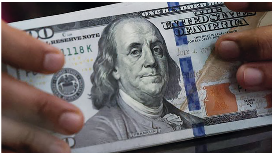
▲ U.S. dollar banknotes are seen in this illustration.