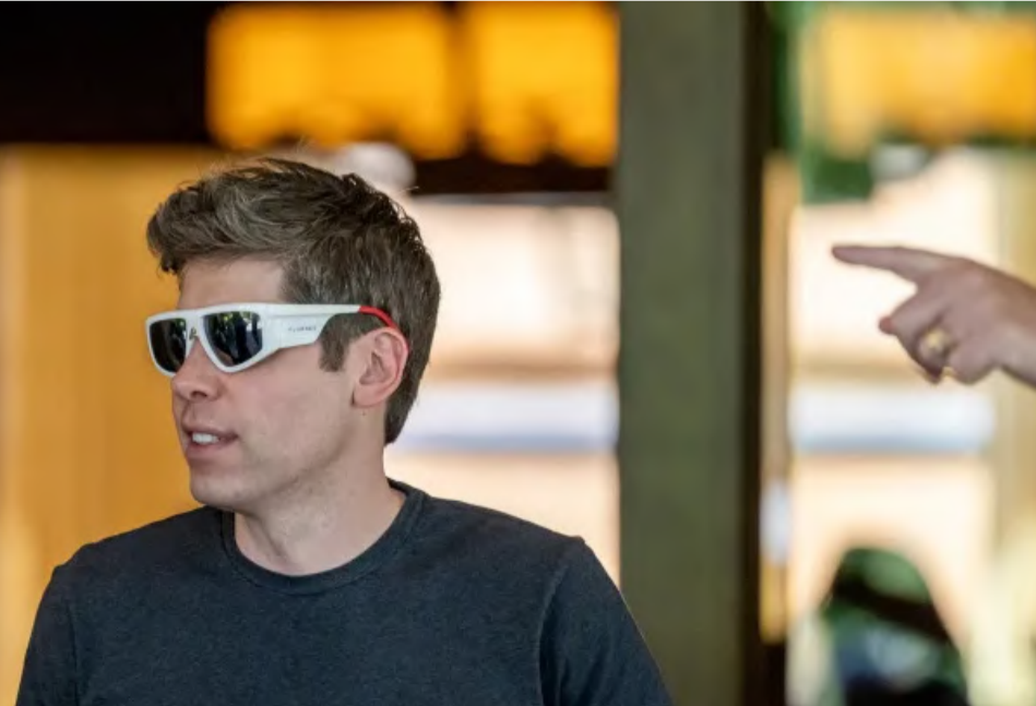
▲ OpenAI CEO Sam Altman.

“Externally, as a publicly traded company some people assume that it’s just for profit. Or that we’re trying to lay off humans.”