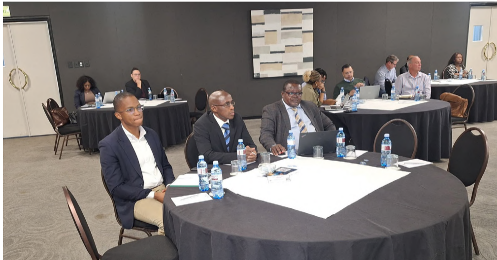
▲Participants at the ESE workshop.

She said Exchange Traded Products (ETPs) had become a vital tool globally by giving both institutional and retail investors access to a wide range of assets in a cost-effective manner.