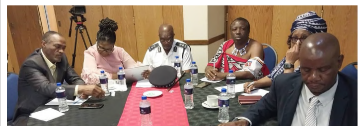
▲ Chiefs in attendance in the workshop.