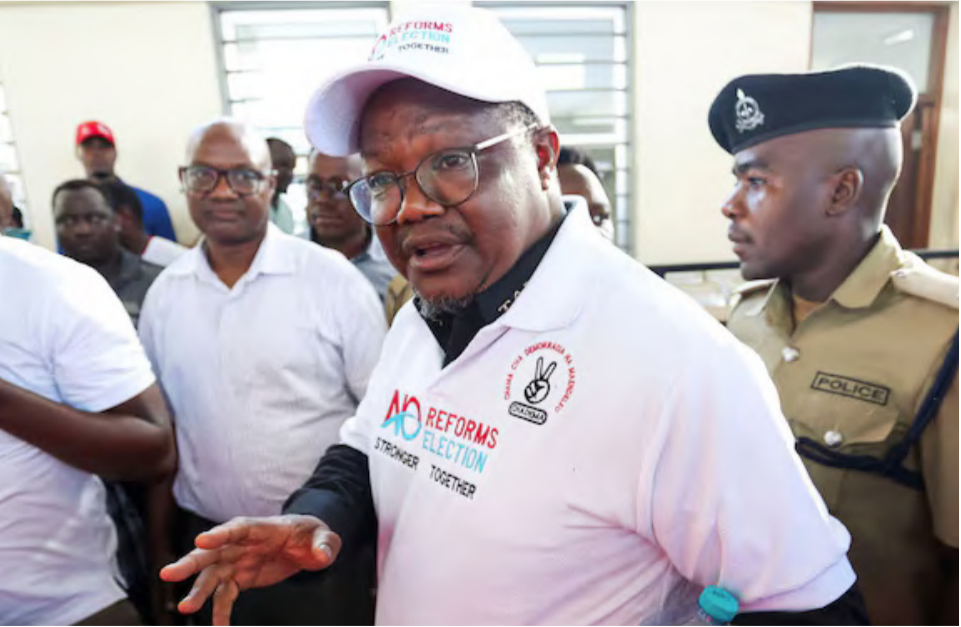
▲ East African nation’s main opposition leader, Tundu Lissu.