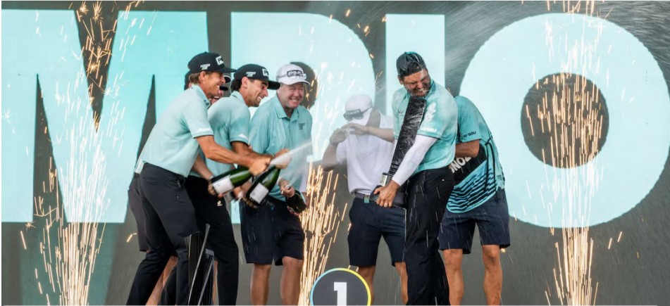
▲ Indianapolis, IN, United States; Sebastian Munoz is sprayed with champagne to celebrate the Torque GC team victory after the final round of LIV Golf Indianapolis.

It was Munoz's first career LIV victory after he previously had six top-five finishes and 13 top-10 finishes over his three years on the tour. "There's no words to describe it right now. I'm proud of myself," Munoz said. "It's been a long time coming, six years since my last win, and it's awesome right now being able to take it in with my daughter, my family, everyone here, it's great." Rahm, who entered the day tied for ninth at 11-under, was sensational throughout the final individual round of the 2025 LIV season. He finished a bogey-free front nine with five birdies. On the back nine, he scored an eagle on the Par-5 13th, and then birdied the final four holes after a bogey on the par-3 14th. Rahm won the individual title despite not winning a single event this season. He stormed past Niemann at the wire with three second-place finishes in the last four LIV events. (Reuters)