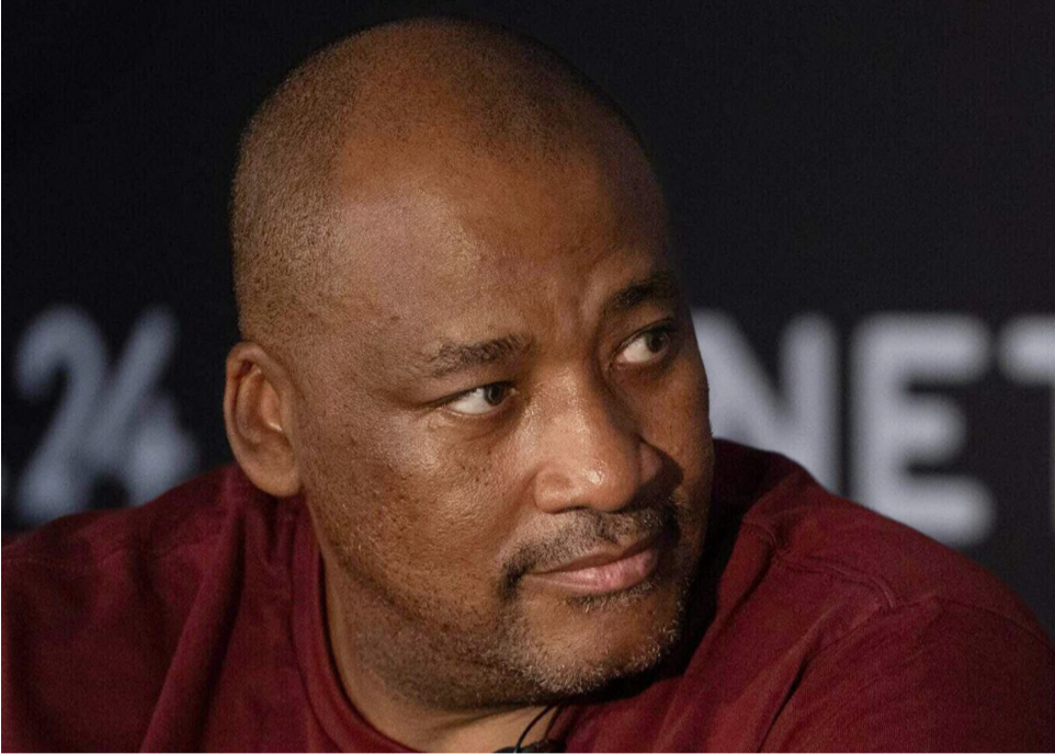
▲ Patriotic Alliance leader Gayton McKenzie.