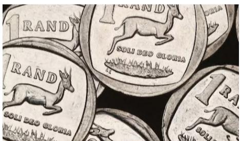
▲ South African Rand coins are seen in this illustration picture.

Ether similarly slid 4.6 per cent to $4,275.85, after hitting its highest in nearly four years last week.. (Reuters)