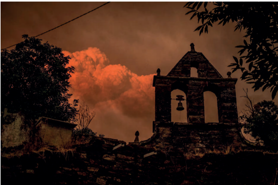
▲ A pyrocumulus cloud forms as smoke rises from a wildfire as seen from a cemetery in the village of Vilarmel, Lugo area, Galicia region, Spain.