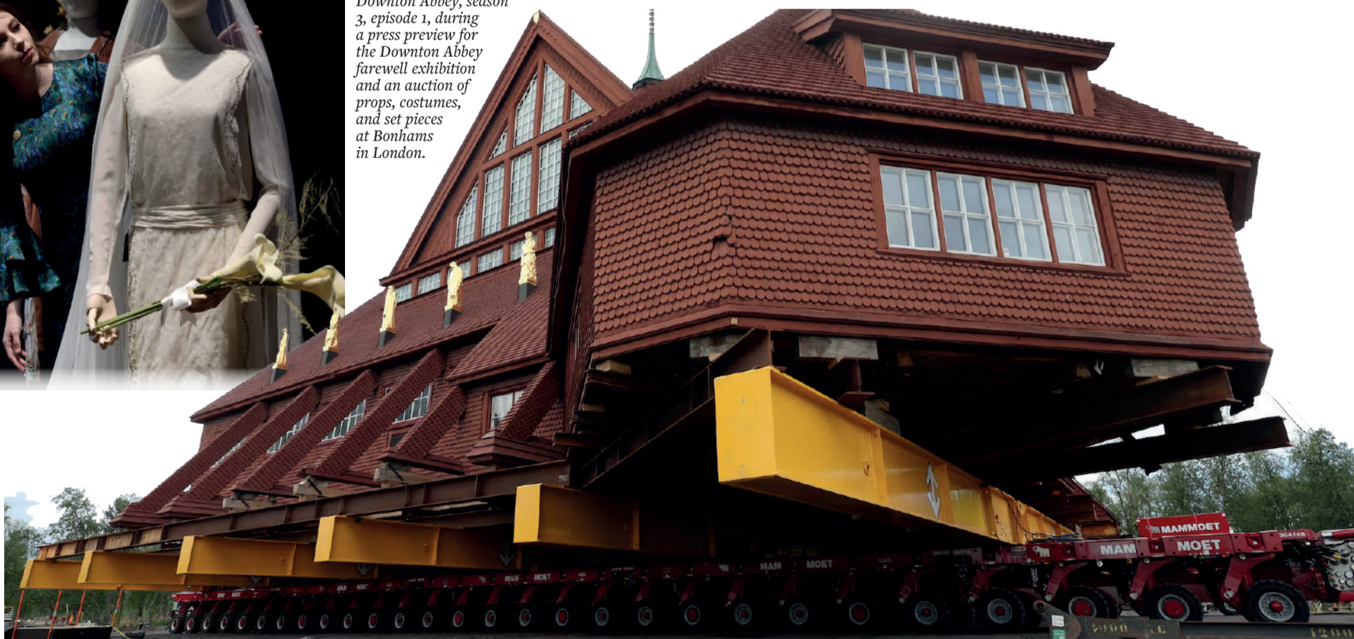
▲ Kiruna's historic wooden church sits on wheels before being moved to its new site next to the cemetery, in Kiruna, Sweden.