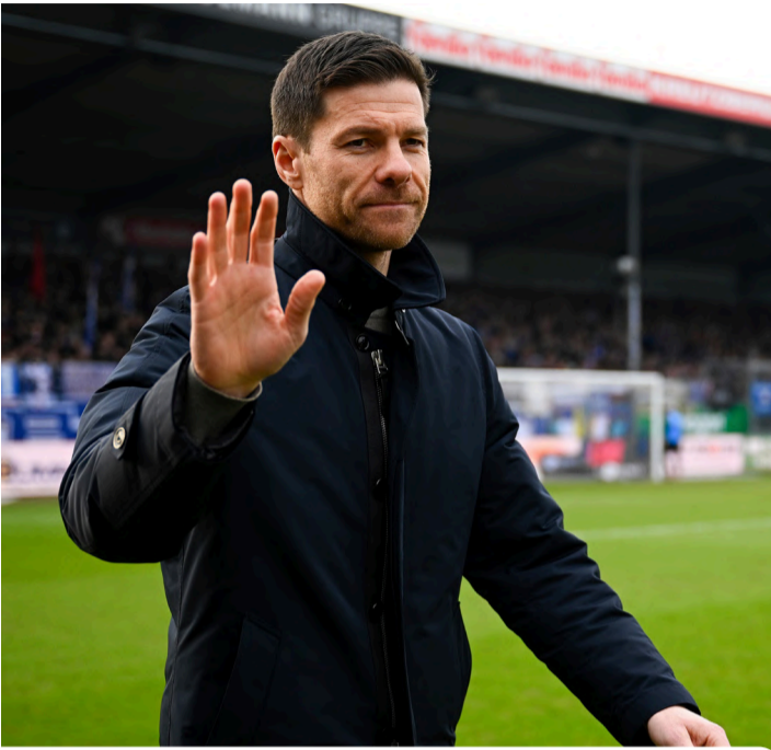
▲ Real Madrid manager Xabi Alonso said on Monday he wanted his team's performance on the pitch to do the talking for him as he begins his first LaLiga campaign at home against Osasuna on Tuesday.

want to bring that energy to the stadium and earn their (the fans') support." Alonso has bolstered Real's defence with England right-back Trent Alexander-Arnold joining from Liverpool along with Bournemouth's 20-year-old Spain centre-back Dean Huijsen and left back Alvaro Carrera from Benfica. The reinforcements address last season's defensive troubles that deflated Real's title challenge. Defender Dani Carvajal, who is easing his way back after last season's ACL injury, has been named in Real's squad to face Osasuna. "It's great competition for the players, and I love that we have two who can play in each position," said Alonso. "Sometimes I will have to rotate. Carvajal is getting closer and closer to his best, and that's very good for the squad." However, Real will be without Antonio Ruediger (suspended) as well as injured left back Ferland Mendy, midfielders Eduardo Camavinga and Jude Bellingham plus forward Endrick. Alonso also discussed Real's decision to denounce plans for a Barcelona-Villarreal LaLiga match in Miami in December. Real have warned that the proposal could undermine foot-