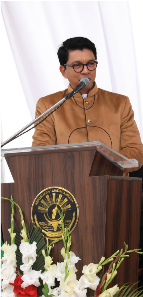
▲ Madagascar President Andry Rajoelina making his remarks during the launch of the highway.