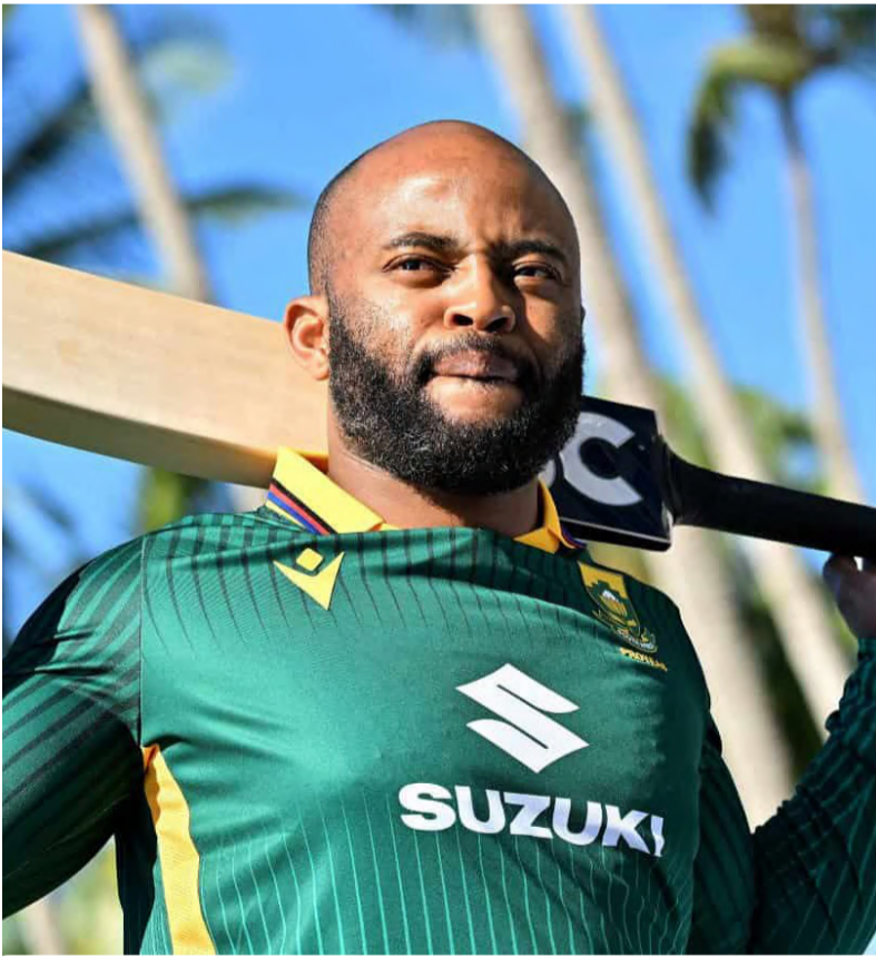
▲ Temba Bavuma says he is itching to get back on the park as he prepares to lead the national team in the opening fixture of a three-match one-day international (ODI) series against Australia in Cairns today.

However, Tuesday's match will be the first ODI game between the two sides since Australia beat South