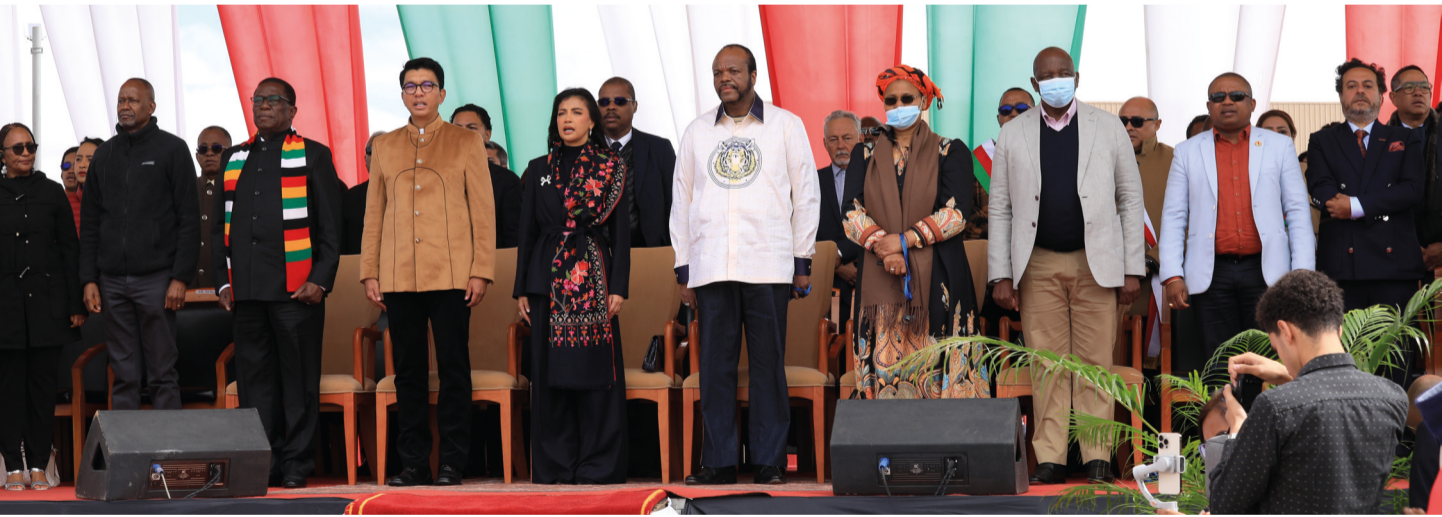
▲ Heads of States during the Madagascar’s national anthem.