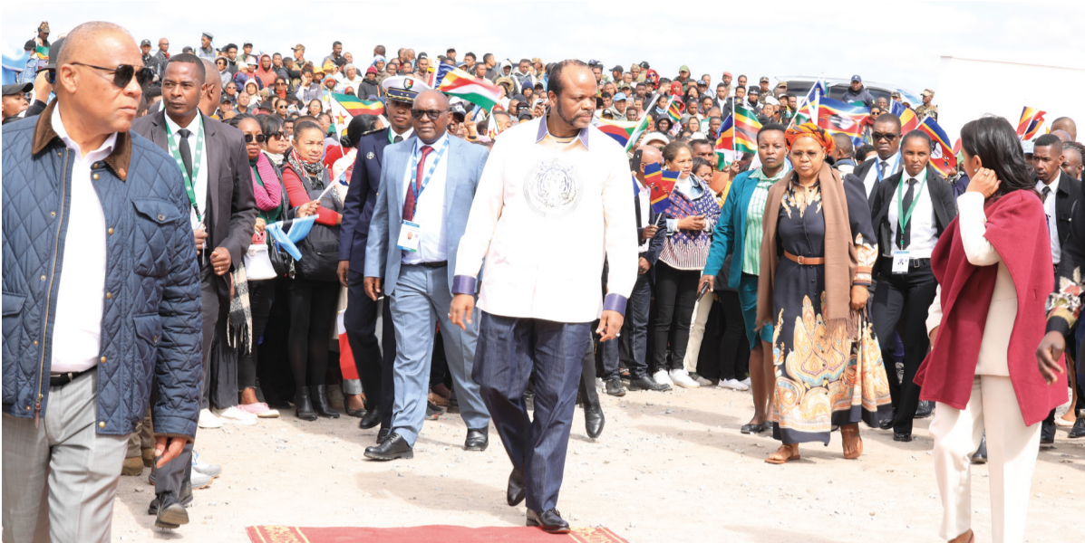
▲ His Majesty King Mswati III witnessed the inauguration of a highway in Antananarivo, Madagascar. His Majesty was accompanied by Inkhosikati Make LaMatsebula at this event. The inauguration of the highway was part of the broader agenda of the summit, which focused on advancing regional integration, industrialisation, and infrastructure development.