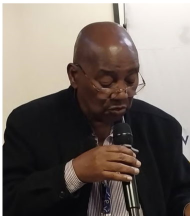
▲ Chiefs in attendance in the workshop.

He therefore, asked the Human Rights and Public Administration/