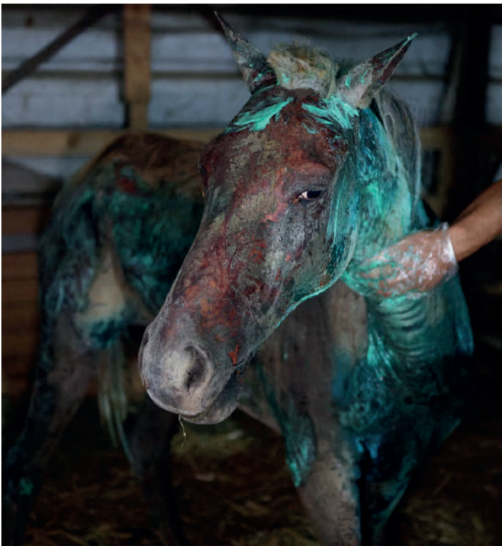
▲ A burned horse in an animal shelter, after a wildfire, in Tirana, Albania.