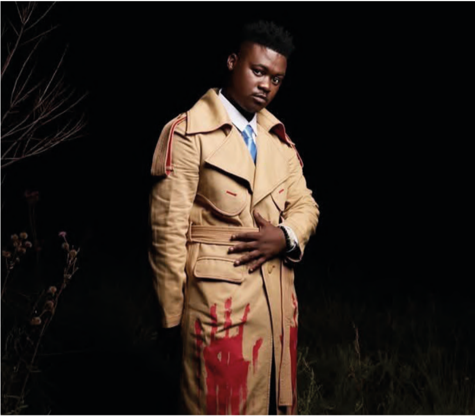
▲ Mlindo The Vocalist.

Mlindo gained notable recognition following the release of his debut single,