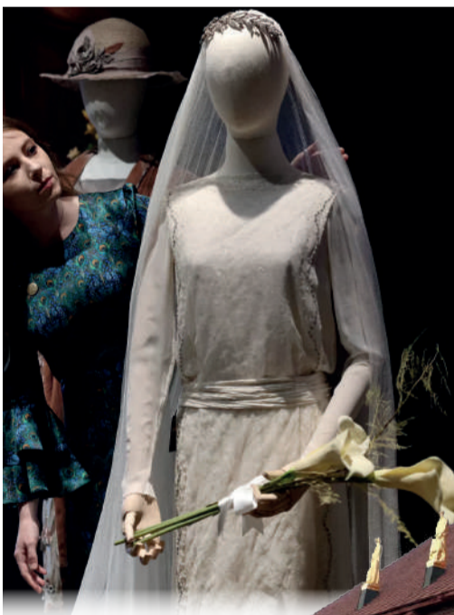
◀ A gallery assistant poses with a wedding prop costume and a bouquet worn by actress Michelle Dockery (as Lady Mary) in Downton Abbey, season 3, episode 1, during a press preview for the Downton Abbey farewell exhibition and an auction of props, costumes, and set pieces at Bonhams in London.