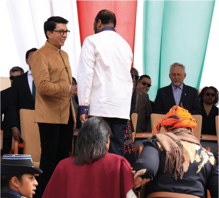
▲ His Majesty King Mswati III exchanging pleasantries with Madagascar President and SADC Chairperson Andry Rajoelina.