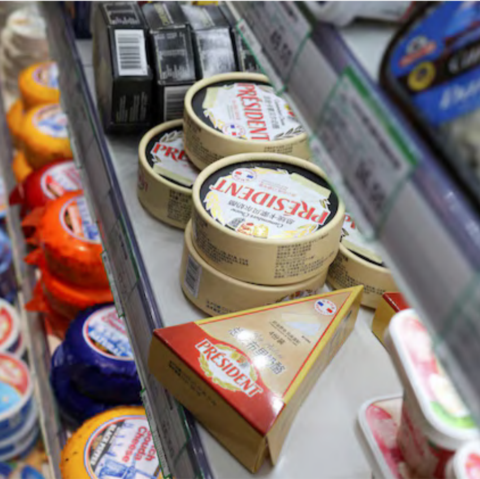
▲ Cheese products are displayed at the dairy section of a supermarket in Beijing, China.