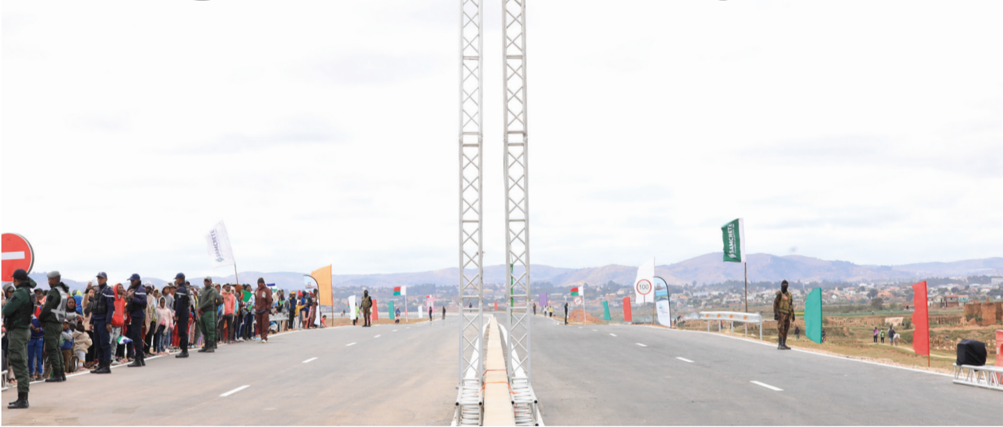
▲ The 260km road project in Antananarivo, Madagascar which was launched before concluding the 45th SADC Ordinary Summit of Heads of States and Government.