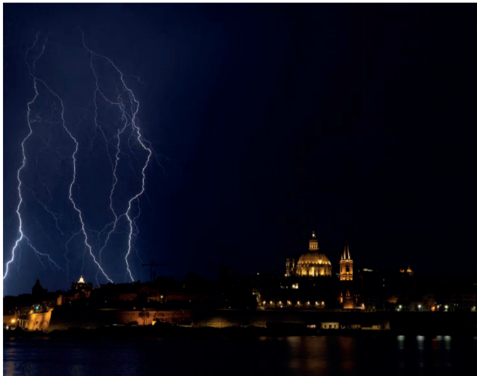
▲ A lightning storm passes over Valletta, as seen from Sliema, Malta.