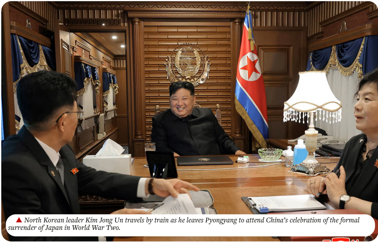
▲ North Korean leader Kim Jong Un travels by train as he leaves Pyongyang to attend China's celebration of the formal surrender of Japan in World War Two.