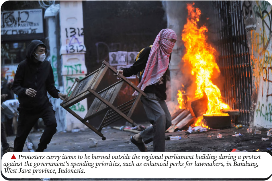
▲ Protesters carry items to be burned outside the regional parliament building during a protest against the government's spending priorities, such as enhanced perks for lawmakers, in Bandung, West Java province, Indonesia.