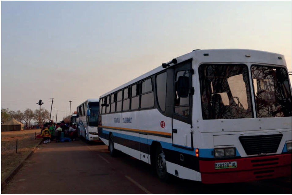
▲ Buses transported throngs of Imbali to Ludzidzini Royal Residence in readiness of the Umhlanga Ceremony.

Through their colourful arrival and resonant voices, they have declared that gender-based violence has no place in society, and they are ready to lead by example in fostering a culture of respect, dignity, and peace.