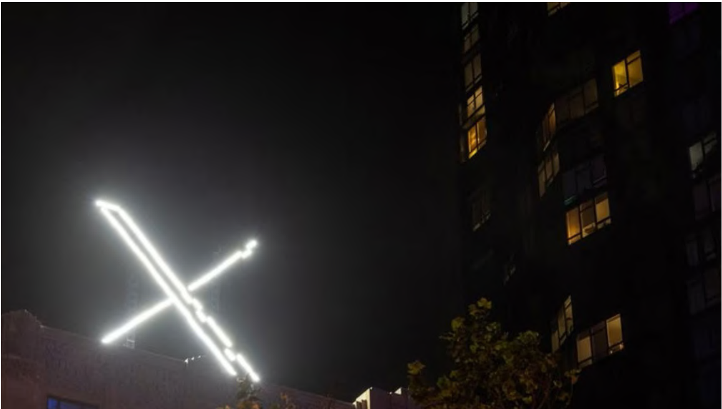
▲ 'X' logo is seen on the top of the headquarters of the messaging platform X, formerly known as Twitter, in downtown San Francisco, California, U.S.,

Musk fired approximately 6,000 employees after his 2022 acquisition of Twitter, which he rebranded X. Many employees sued over their terminations, and X last month agreed to pay an undisclosed sum to settle a lawsuit in California by ex-workers who said they were owed $500 million in