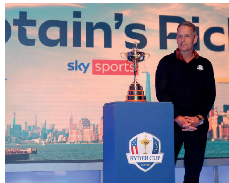
▲ Europe Ryder Cup captain Luke Donald.

selves. I think if you look at New Yorkers, they appreciate that," Donald said. "They appreciate you going out there, fighting hard for your team.