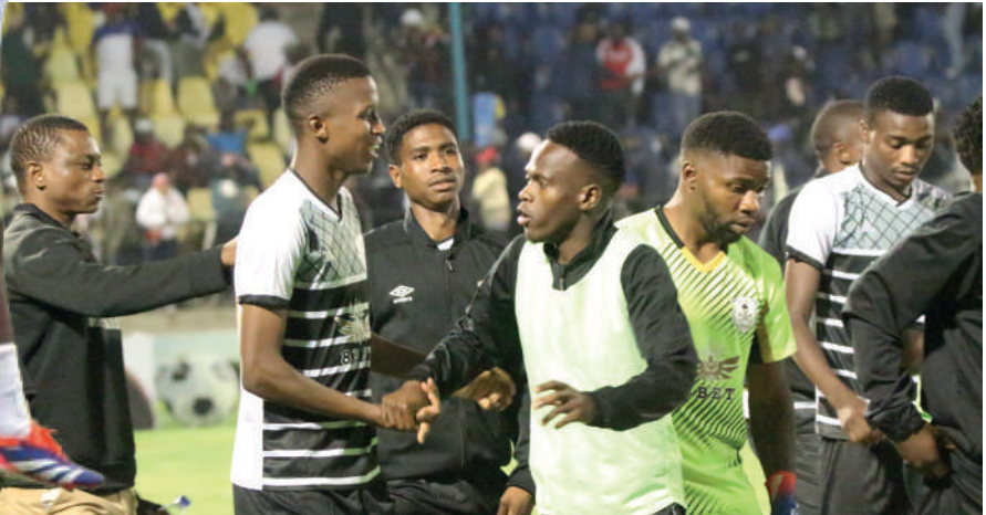
▲ Moneni Pirates celebration. (Right) Green Mamba players celebrating their 2-0 win over Young Buffaloes.