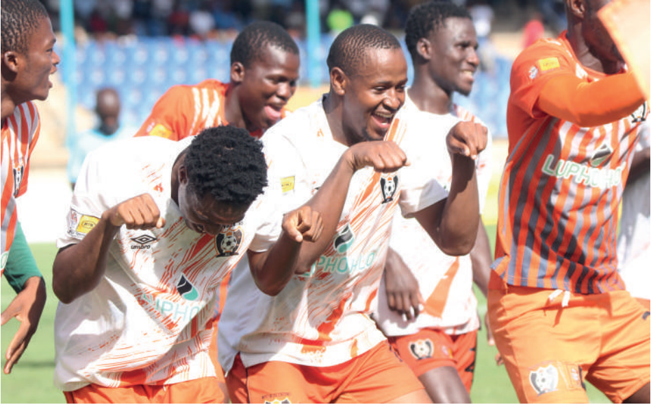
▲ Ezulwini United players celebrating.