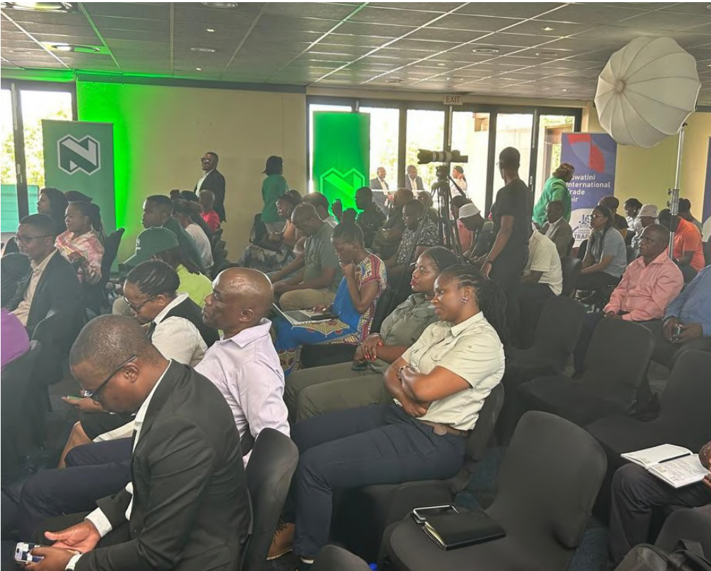
▲ The audience at the Nedbank Green Zone.

tential of green finance for the Kingdom and beyond. "Let's make this seminar a catalyst for meaningful change," she concluded.