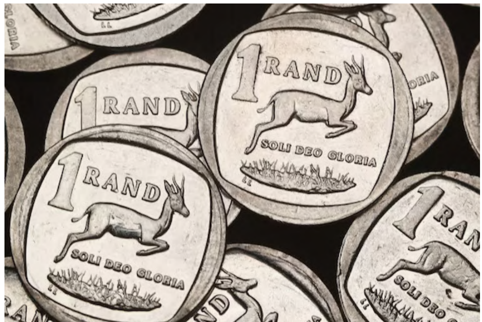
▲South African Rand notes are seen in this illustration.

South Africa’s benchmark 2035 government bond weakened, bringing the yield up 5.5 basis points to 9.645 per cent. (Reuters)