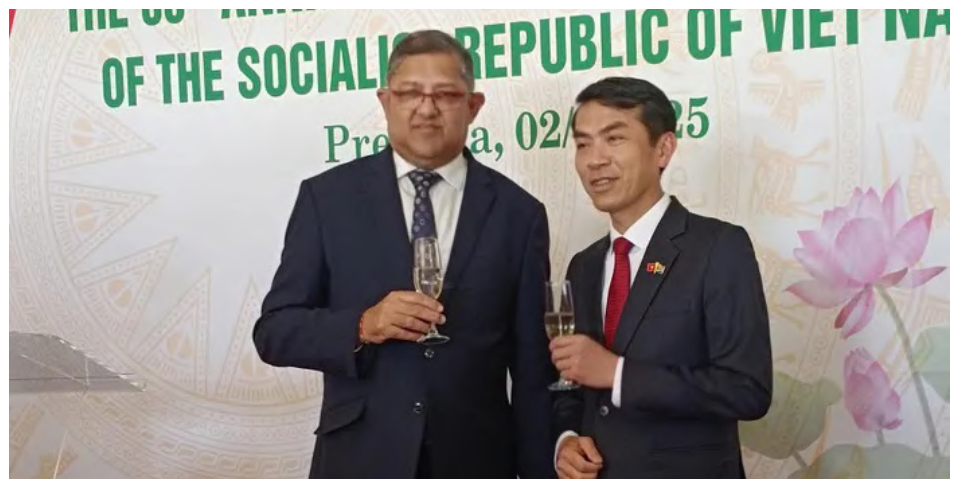
▲ Deputy Minister of Forestry, Fisheries and Environment, Narend Singh, and Vietnam's Ambassador to South Africa, Hoang Sy Cuong, toast 80 years of independence for Vietnam.