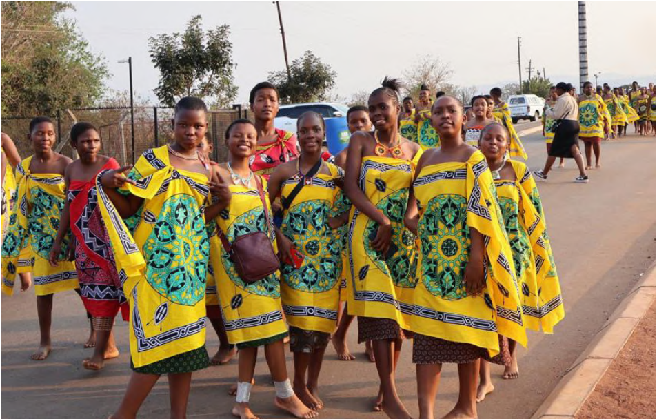
▲Imbali in jovial mood at Ludzidzini upon arrival on Tuesday.

The Umhlanga Reed Dance has grown to become an internationally recognised cultural spectacle, drawing tourists, diplomats, and researchers each year. For Eswatini, however, its meaning runs far deeper—it is a sacred tradition that binds generations, instils discipline among the youth, and reaffirms loyalty to the monarchy. As thousands of Imbali continued to arrive, the atmosphere at Ludzidzini promises a week filled with colour, song, and the graceful steps of young maidens determined to keep Eswatini’s cultural flame burning bright.