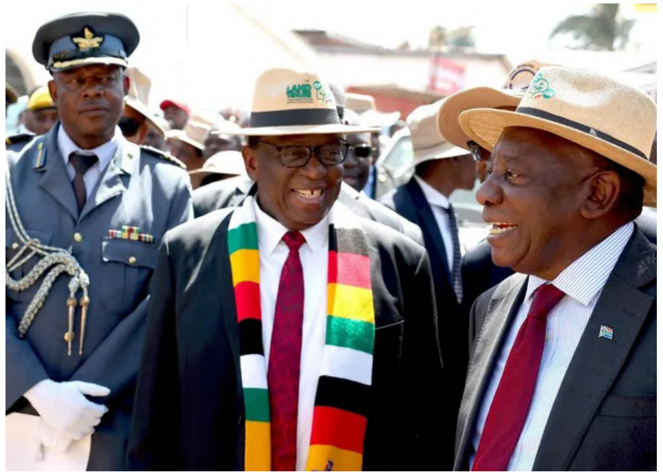
▲ President Cyril Ramaphosa was in Harare last week, at the invitation of Zimbabwe's President Emmerson Dambudzo Mnangagwa.

"The DA firmly believes in the need to redress the injustices of the past, particularly through fair and lawful land reform that restores dignity and economic opportunity.