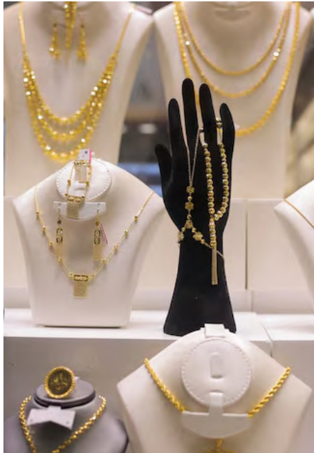
▲Jewellery is displayed at the Gold Souk market in Dubai, United Arab Emirates.

Investors are now looking forward to the