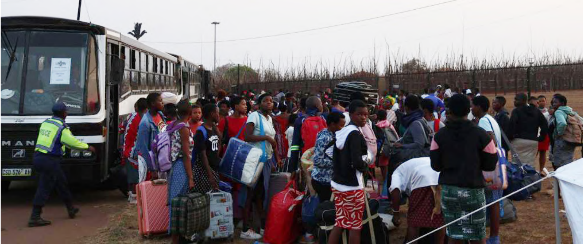
▲Throngs of maidens have descended to the Ludzidzini Royal Residence from all corners of the country.