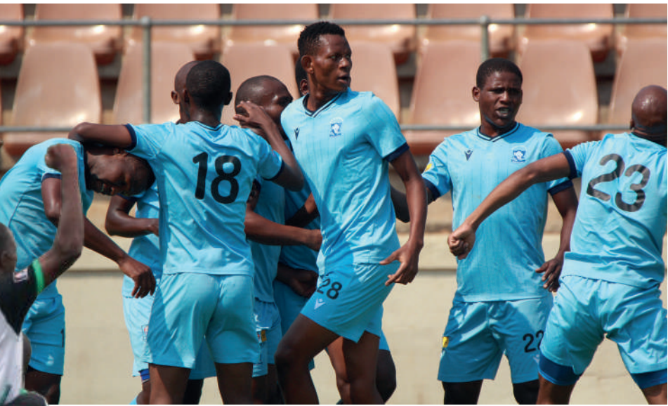
▲ Royal Leopard players.