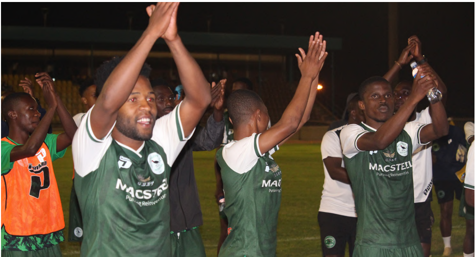
▲Nsingizini Hotspurs’ cup pedigree helped them to send a stubborn Malanti Chiefs packing in the 2025 8Bet Trade Fair Cup.