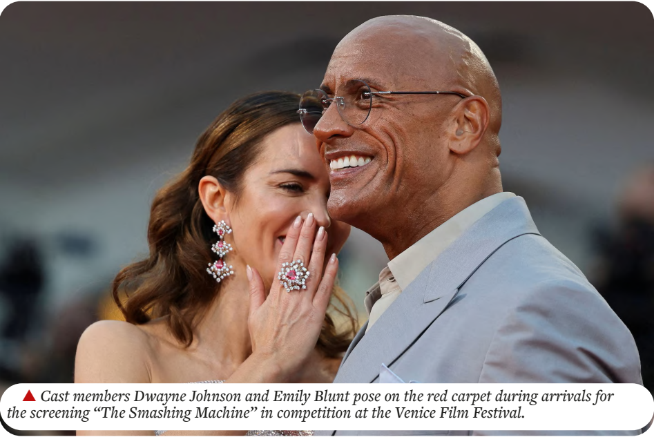
▲ Cast members Dwayne Johnson and Emily Blunt pose on the red carpet during arrivals for the screening "The Smashing Machine" in competition at the Venice Film Festival.