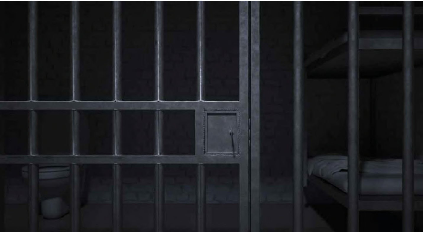
▲ A 47-year-old man has been arrested for allegedly defrauding a pensioner a sum of E200 000

Matsebula was remanded into custody until September 3, 2026 pending trial. However, he applied for bail and he was granted same fixed at E10 000, under the normal bail conditions, which include amongst others, that he does not interfere