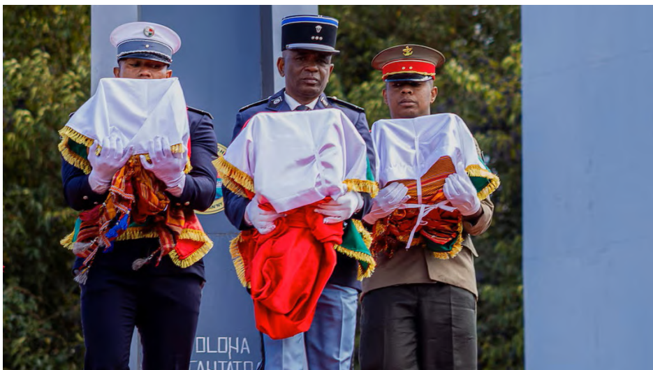
▲ A Madagascar soldier and a gendarme carry three colonial-era skulls, presumed to belong to King Toera and two others from the Sakalava ethnic group.