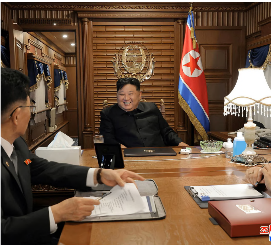
▲ North Korean leader Kim Jong Un travels by train as he leaves Pyongyang to attend China's celebration of the formal surrender of Japan in World War Two.

Before crossing into China, Kim on Monday visited a missile laboratory that is researching carbon fibre composite materials