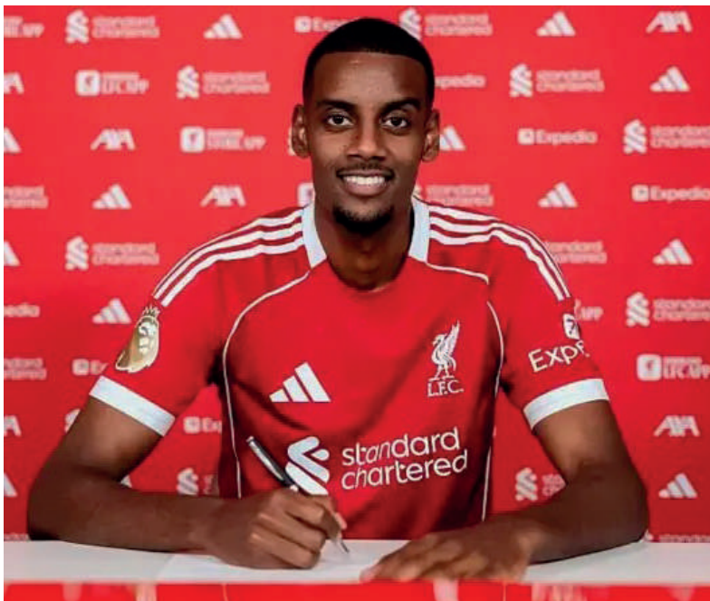
▲ Liverpool's new record signing Alexander Isak.

Isak was signed from Newcastle United for a British record transfer fee of £125m.