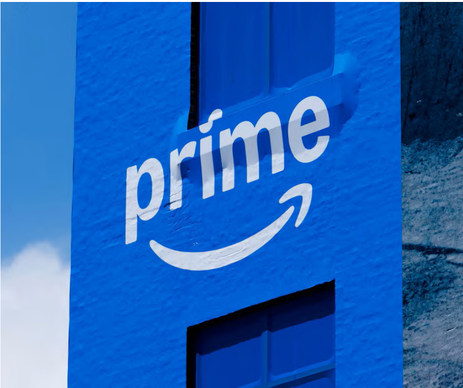
▲ A downtown building is wrapped in Amazon Prime advertising ahead of Comic-Con International, in San Diego, California, U.S.

Prime Day is viewed as the marquee event outside of the holiday shopping season to attract new members to Amazon Prime, two people familiar with the matter said. But subscriptions typically fall off after the event once the discounts disappear, said the sources, who declined to be identified as