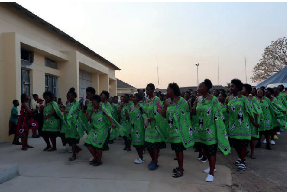
▲▼ Madiens in jubilation as they danced their way to the Royal Residence.