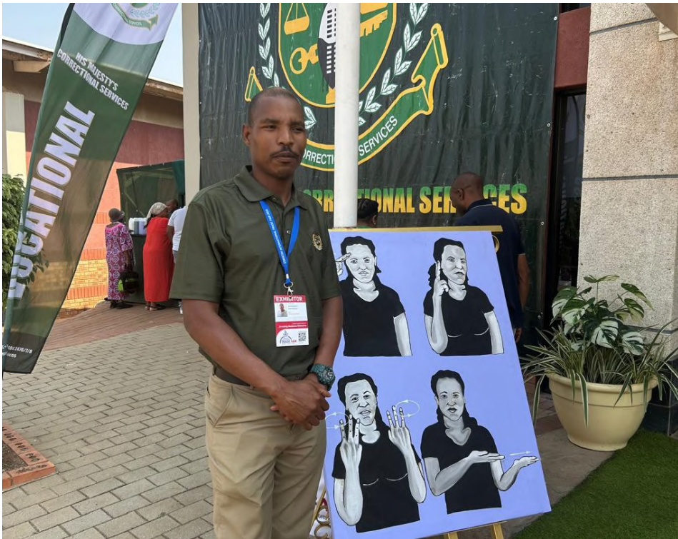
▲ An HMC officer ready to attend to those living with disabilities.

The Eswatini International Trade Fair, which is currently underway, has become an important platform for showcasing innovation and inclusivity across different sectors. For His Majesty’s Correctional Services, this year’s participation stands out as a testament to the institution’s evolving role in society — not just as a custodian of justice, but also as a champion of inclusivity and human dignity.