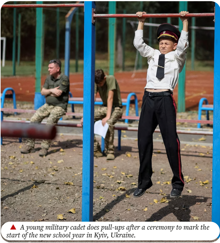
▲ A young military cadet does pull-ups after a ceremony to mark the start of the new school year in Kyiv, Ukraine.