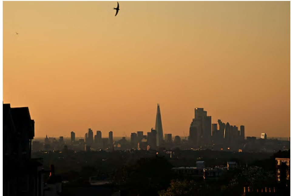
▲The sun sets over the capital’s skyline as warm temperatures, wind and emissions combined to trigger a ‘high’ alert for air pollution, in London, Britain.

Platinum lost 0.8 per cent to $1,388.22 and palladium fell 1.3 per cent to $1,123.14. (Reuters)