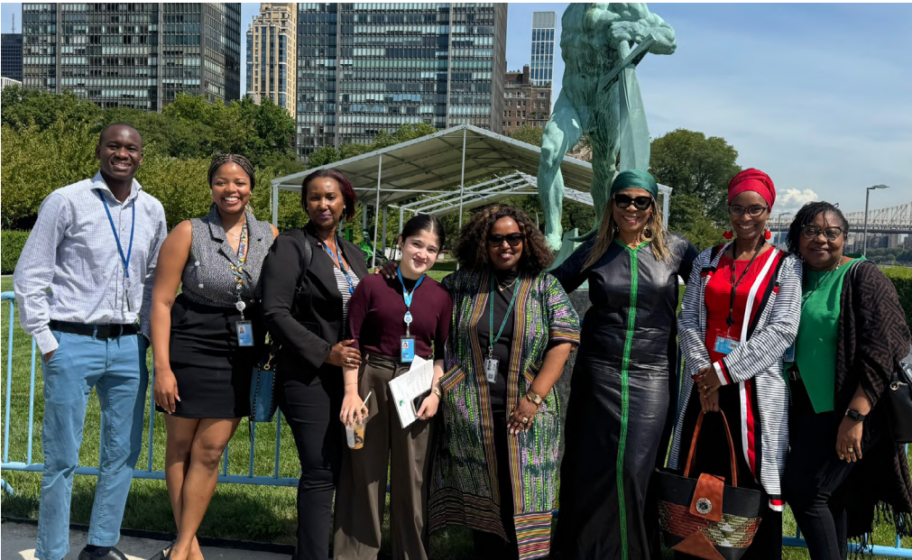
▲ Representatives who attended the UNDP meeting.

According to UNDP, such reforms are aimed at reducing barriers to justice, especially for vulnerable groups, and fostering greater social