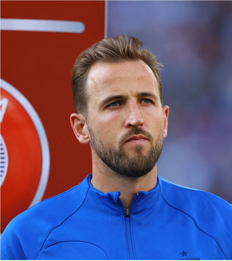
▲ Former Tottenham Hotspur striker Harry Kane.