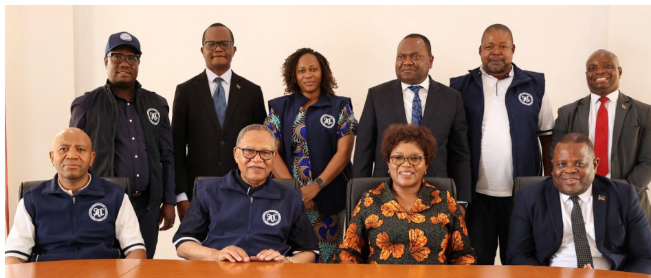
▲ SADC Electoral Mission Head Themba Masuku with Malawi Foreign Affairs Minister Her Excellency Nancy Tembo and the SADC Electoral Observation Mission team.

On Tuesday morning, Masuku paid a courtesy call on Malawi’s Minister of Foreign Affairs, Nancy Tembo (MP). Minister Tembo expressed deep appreciation to His Majesty King Mswati III for assigning Eswatini to spearhead the observation mission, particu-