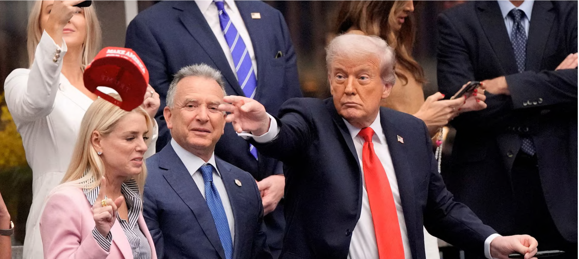
▲ U.S. President Donald Trump throws a hat after Spain's Carlos Alcaraz won the men's singles final at the U.S. Open in New York.