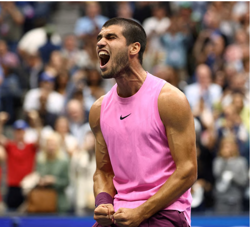
▲ Spain's Carlos Alcaraz celebrates winning the men's singles final against Italy's Jannik Sinner at the U.S. Open in New York.