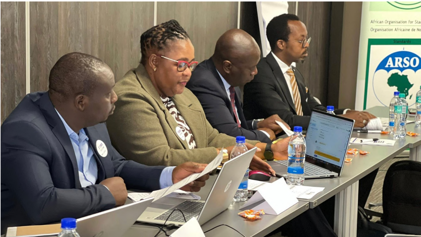
▲ Stakeholders from Government and major entities who attended the training on ARSO programmes earlier this year.

“One of the most attractive aspects of this