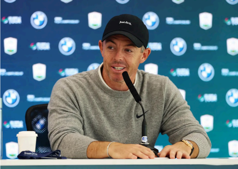
▲ Rory McIlroy.

“I want to go and play in different places in the world and experience things that I haven’t experienced before, to be able to do things for the