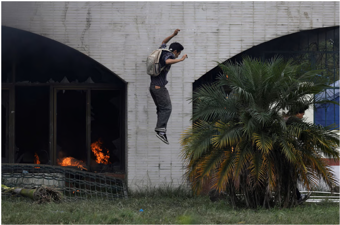
▲ A demonstrator jumps from the gate of the Parliament during a protest against corruption and the government's decision to block several social media platforms, in Kathmandu, Nepal.