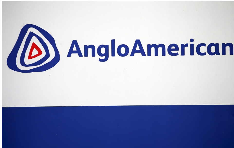
▲ The Anglo American logo is seen in Rustenburg, South Africa.

Both Anglo and Teck have undergone significant restructuring in recent years, driven by external takeover attempts and strategic shifts within the mining industry.