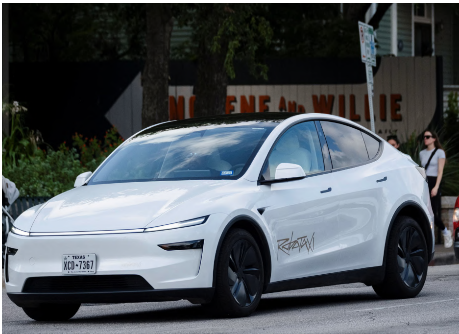
▲ A Tesla robotaxi drives on the street along South Congress Avenue in Austin, Texas, U.S.

A lot depends on how investors value the company. Tesla, for example, is valued as a growth stock, trading at around 75 times its earnings before interest, taxes, depreciation and amortization, or EBITDA, even though its vehicle sales dropped last year and are