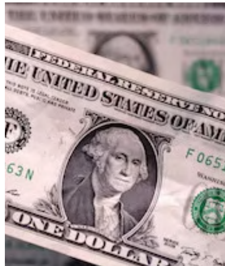
▲ A U.S. dollar note is seen in this illustration.

Burgeoning expectations of policy easing by the Fed have also helped lift the spot gold price to a record high of $3,659.10 per ounce on Tuesday.