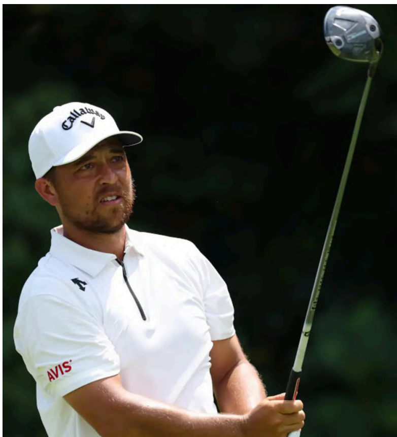
▲ Xander Schauffele.

The 31-year-old has made only 15 starts this year after missing six weeks in January and February be-