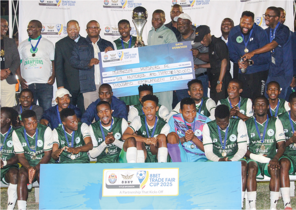
▲ 8Bet Trade Fair Cup Champions Nsingizini Hotspurs.