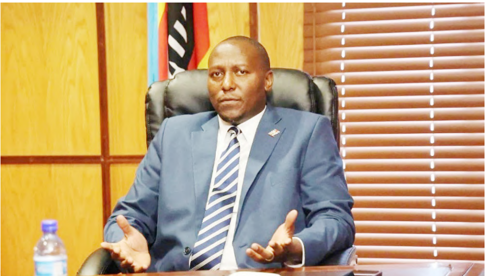
▲ Prime Minister Russell Dlamini delivered a powerful address on Saturday during the official closing of the Eswatini International Trade Fair (EITF), a ceremony that coincided with the Kingdom’s 57th Independence Day celebrations.

“It is encouraging to see our entrepreneurs, especially women and youth, actively engaging in solutions that protect our plan-