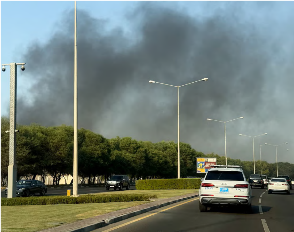
▲ Smoke rises after several blasts were heard in Doha, Qatar.

what it called a “brutal Israeli aggression” against Qatar’s sovereignty.