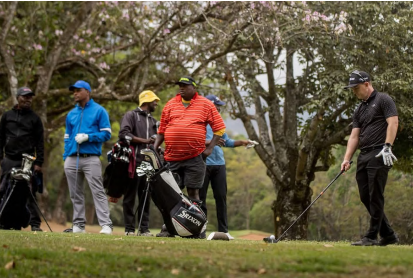
▲ Caddies and golfers during the Kings cup golf pre qualifier.