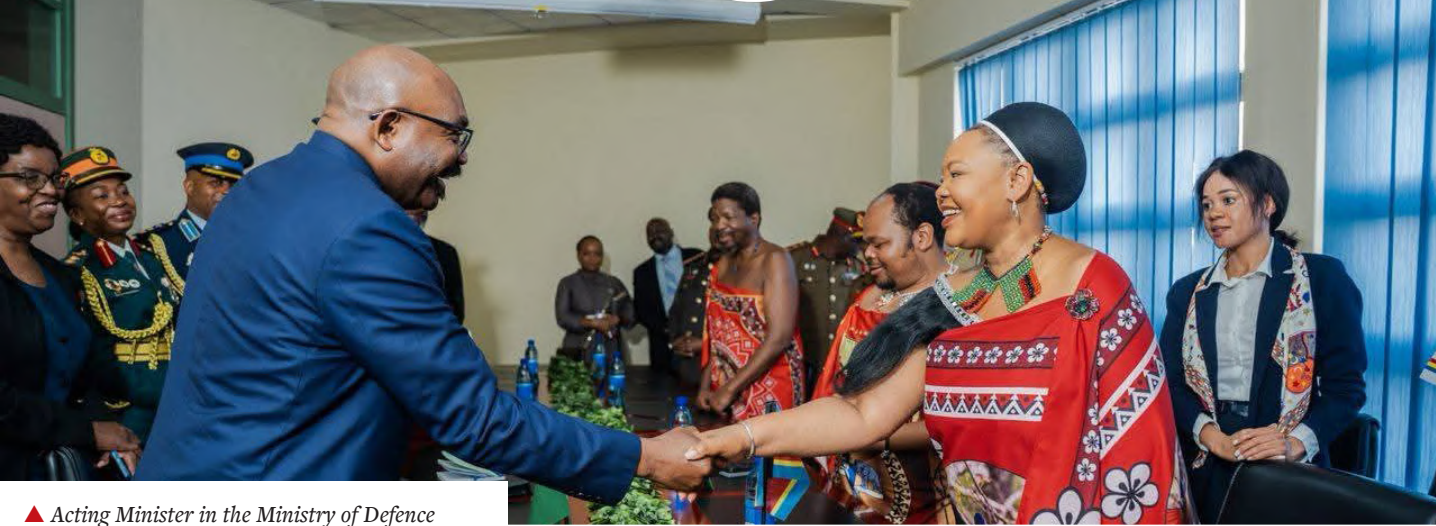
▲ Acting Minister in the Ministry of Defence and Security Senator Pholile Shakantu shaking hands with Honourable Ambrose Lwinji Lufuma, Minister of Defence for Zambia during the signing of the Memorandum of Understanding to establish a joint Permanent Commission on Defence and Security between Eswatini and the Republic of Zambia on Tuesday.

expanding relations across various fields remains a top priority for his government.