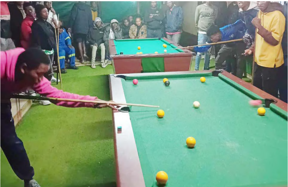
▲ Pool players in action during the Mlu and Lee pool knockout tournament.

It was E500 apiece for the semi-finalists, Way Inn and Ntongozi. The full results and winners are listed in the article. Mlu & Lee Pool Knockout Results: Malkerns 13-8 Blackball Queens Wayinn 13-9 Bhunya Mlandvo 13-8 Figareido Dvudvusini 11-13 Ntongozi Semi-finals Malkerns 13-8 Ntongozi Wayinn 8-13 Mlandvo Final Mlandvo 13-12 Malkerns Winners and prizes: 1. Mlandvo Pool Team - E2 000 2. Malkerns - E1 200 3. Way Inn - E500 4. Ntongozi - E500