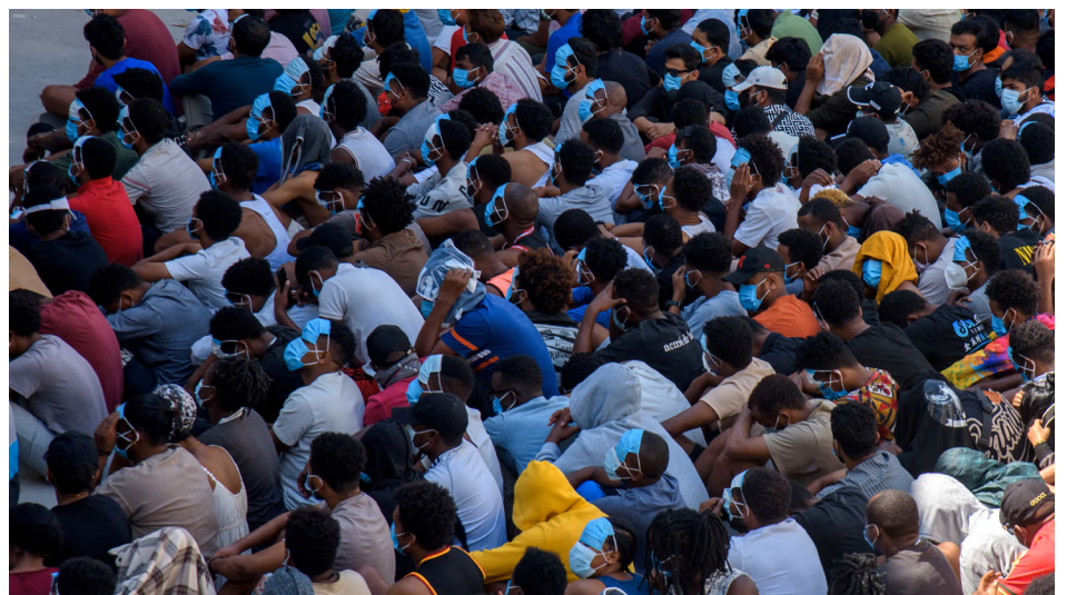
▲ Victims of scam centers who were tricked or trafficked into working in Myanmar, are stuck in limbo at a compound inside the KK Park, a fraud factory, and a human trafficking hub on the border with Thailand-Myanmar after a multinational crackdown on the compounds run by criminal gangs, operated by the Karen Border Guard Force (BGF) in Myawaddy, Myanmar.

Nuno took charge in December 2023 after Steve Cooper was sacked and went on to save the club from relegation.