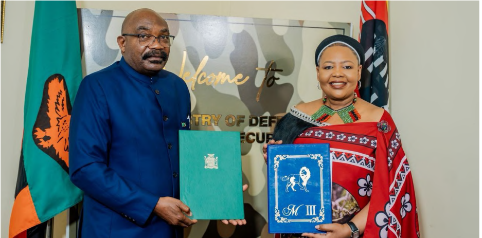
▲ Acting Minister in the Ministry of Defence and Security Senator Pholile Shakantu and Minister of Defence for Zambia Honourable Ambrose Lwinji Lufuma holding the MoU documents after the two countries signed a landmark defence deal.

As both countries move forward under this new framework, they aim to strengthen ties, enhance security cooperation, and ultimately foster a stable and prosperous environment for their citizens.