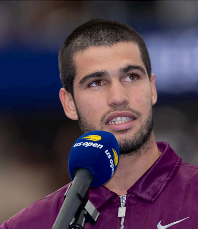
▲ Carlos Alcaraz.