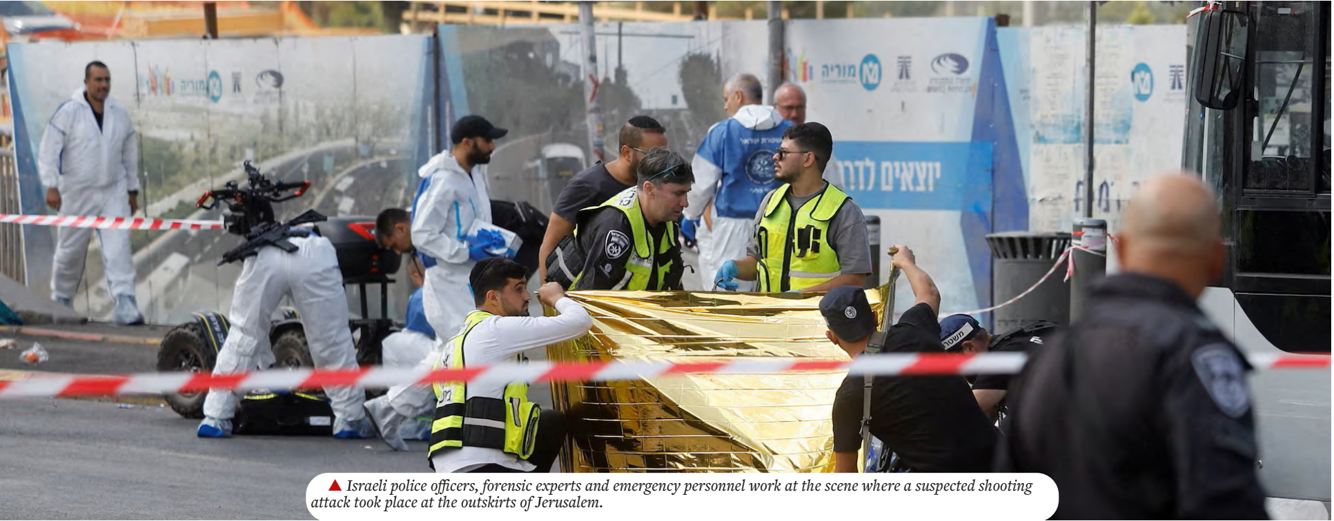
▲ Israeli police officers, forensic experts and emergency personnel work at the scene where a suspected shooting attack took place at the outskirts of Jerusalem.