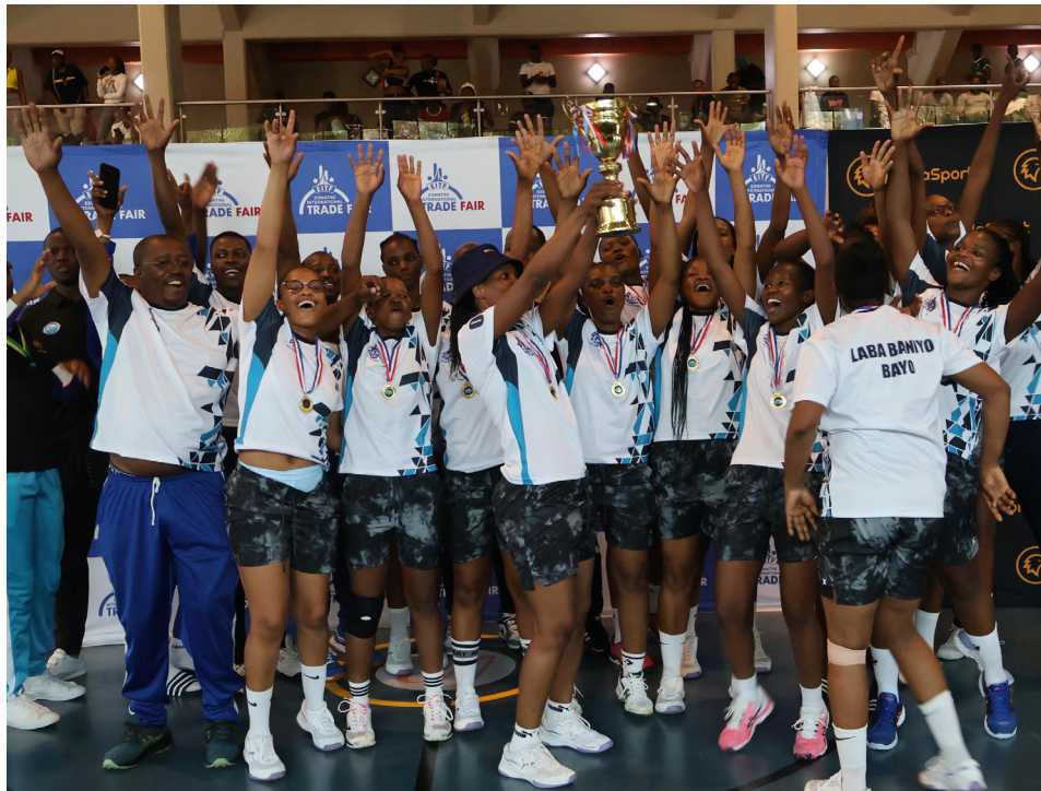
▲ Ladies champions Royal Flames in a jovial mood.

By Sibusiso Masilela sibusisom@rubiconmedia.group