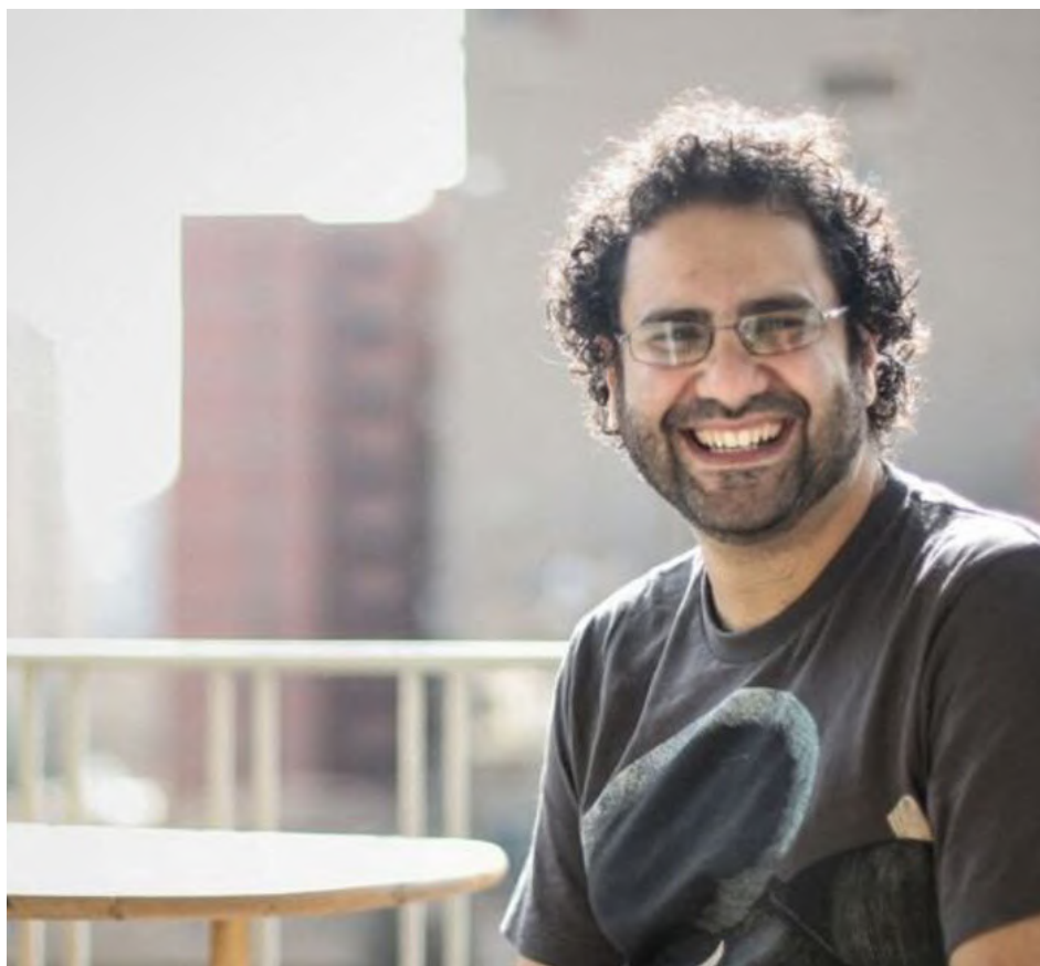
▲ Egyptian-British hunger striker Alaa Abd el-Fattah poses for a photo in unknown location, in this undated handout image obtained by Reuter.

"We continue to raise his case at the highest levels of the Egyptian government," the spokesperson said.