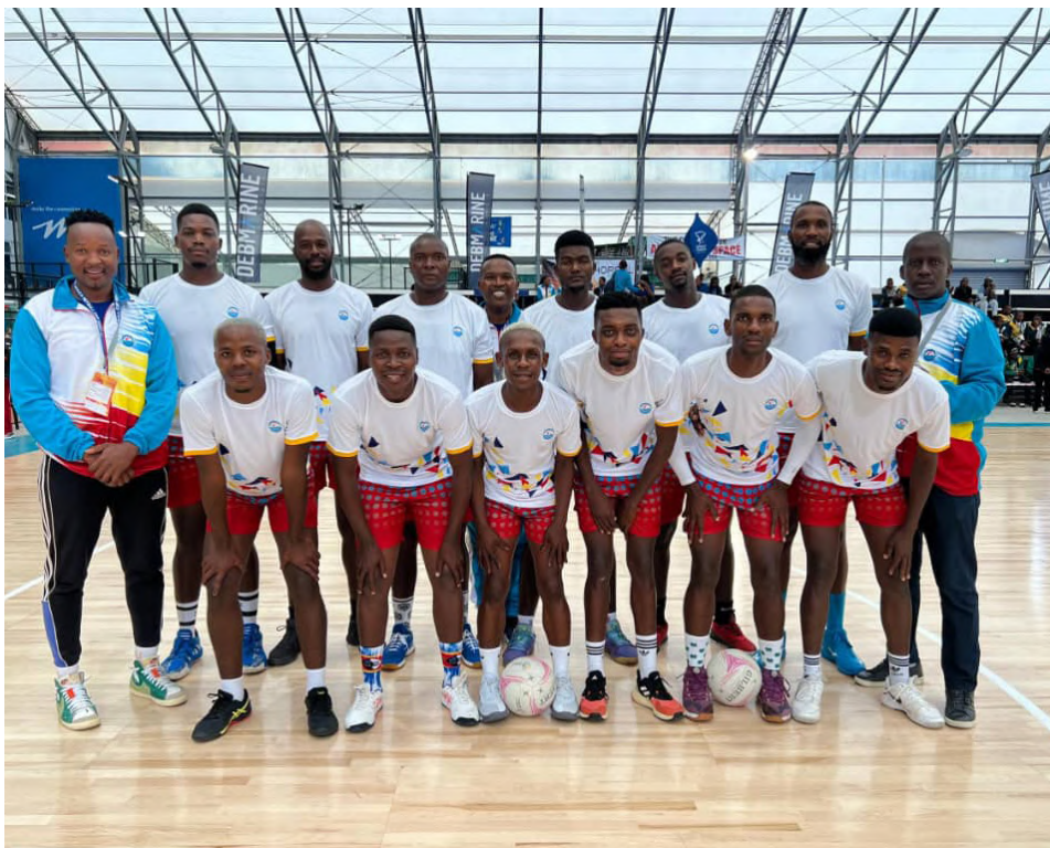
▲ The mens netball national team.