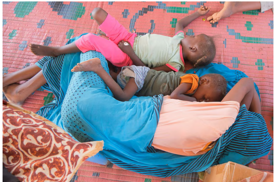
▲ Displaced Sudanese children who fled intense fighting in al-Fashir sleep at a displacement camp, as the humanitarian situation deteriorates amid the ongoing conflict between the paramilitary Rapid Support Forces (RSF) and the Sudanese army, in Al Dabba, Sudan.

A senior army source said the army had launched a major air and ground offensive in neighbouring North Kordofan state on Sun-