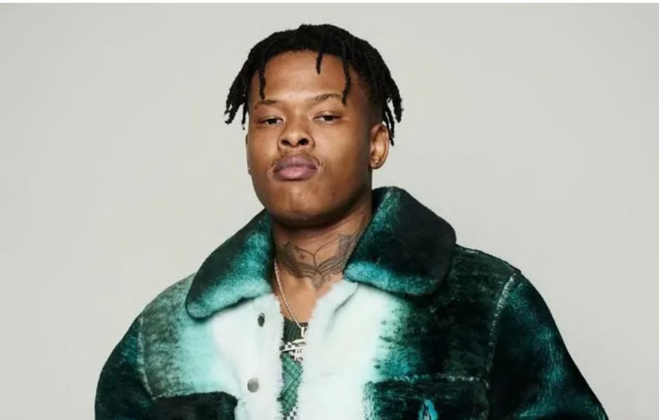
▲ Rapper Nasty C is gearing up for the release of “Free”, an album where he allowed his creative juices to flow freely.