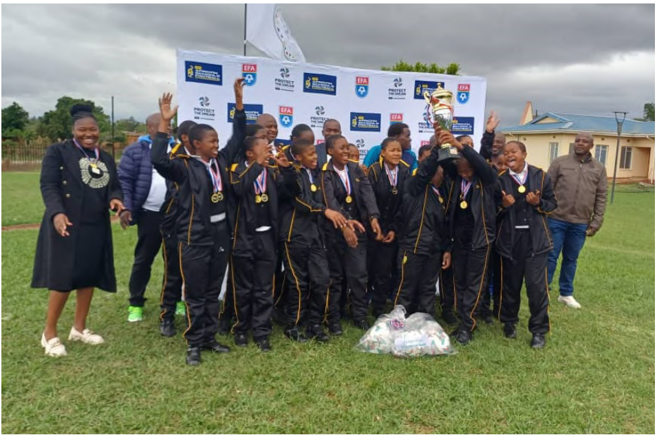
▲ Mjingo High school celebrating their success in the CAF school tournament.