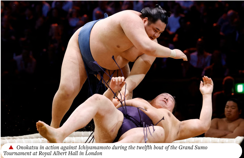
▲ Onokatsu in action against Ichiyamamoto during the twelfth bout of the Grand Sumo Tournament at Royal Albert Hall in London