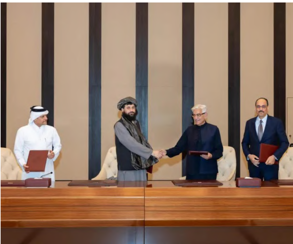
▲ Tommy Fleetwood.

Walmart, H&M, and Gap, employs about 4 million workers and generates around $40 billion a year — more than a tenth of the country's GDP. The fire, which struck during the peak export season, is expected to delay shipments and pose additional challenges in meeting international delivery deadlines. (Reuters)