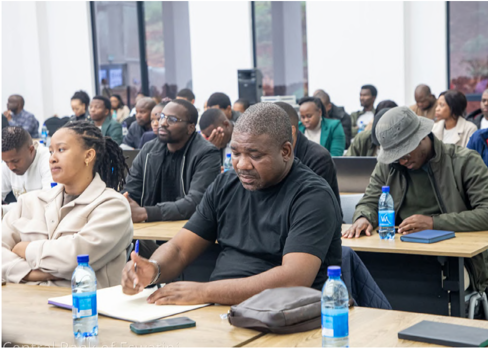
▲A section of the 450 suppliers that attended.

The 2025 Annual Supplier Day marked a significant increase in participation, with nearly 450 suppliers attending the event at the CBE Complex.