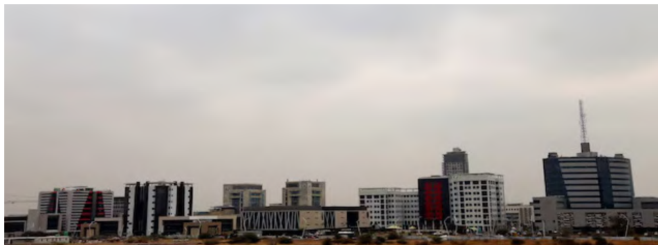
▲ Buildings are seen in the Central Business District (CBD) in the capital Gaborone, Botswana.