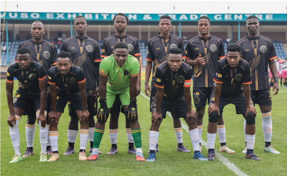
▲ Mbabane Highlanders players.