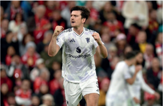
▲ Harry Maguire.

Liverpool tried to rally again in the closing stages but Gakpo missed a glorious opportunity, heading wide from Jeremie Frimpong's cross when it looked easier to score, leaving them to face up to a fourth consecutive loss for the first time since 2014, having also been beaten by Chelsea, Galatasaray and Crystal Palace. (Reuters)