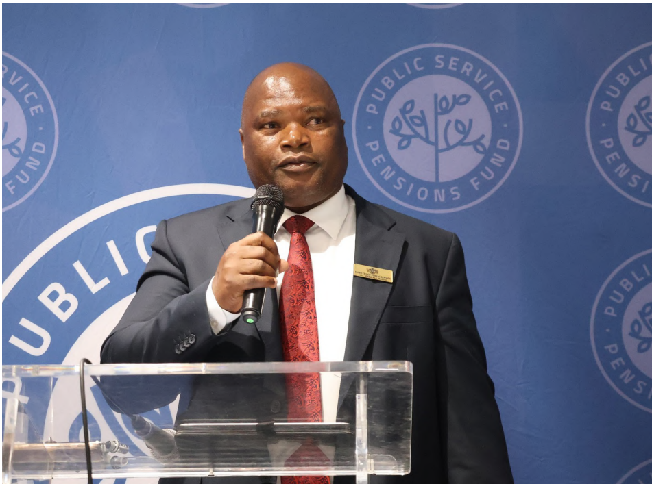
▲ Minister of Public Service Mabulala Maseko described the current situation as an “unfortunate scenario” but assured public servants that salaries would be paid in full, together with the new salary adjustments, by October 27 or possibly earlier.

As government finalizes the technical alignment of the new pay structures, officials have encouraged public servants to re-