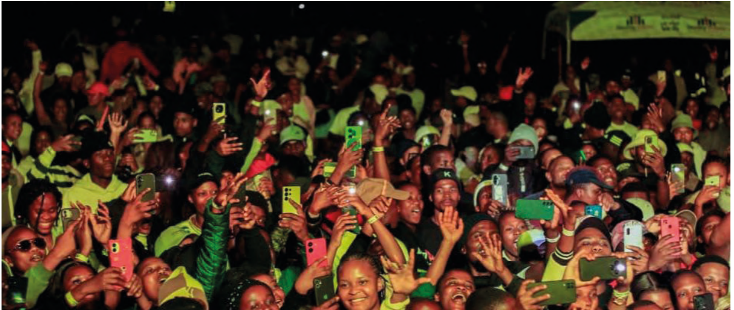
▲ Funlovers ecstatic during the event.

fused her DJ skills with dance artistry. Her set, accompanied by a team of dazzling dancers, was an explosive visual and musical spectacle. She moved to her own rhythm, commanding the stage with charisma that left the audience enthralled.