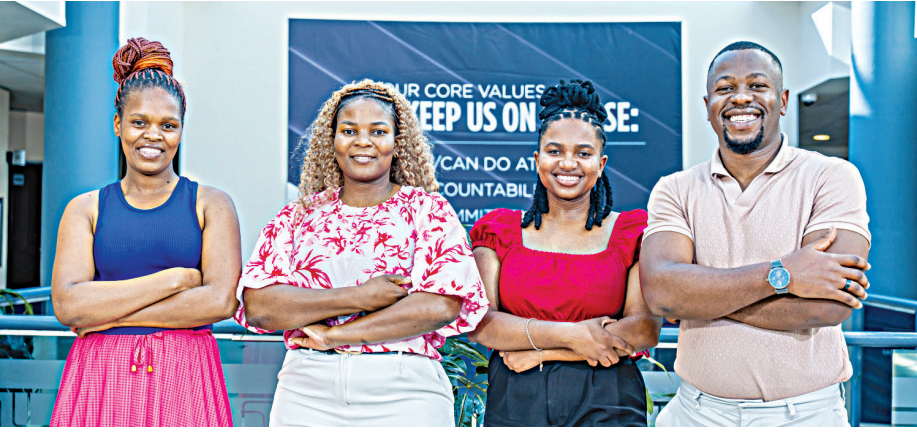
▲ The Clinic Group invites everyone to take that vital first step, get screened, stay informed, and take charge of your health.

This Breast Cancer Awareness Month, The Clinic Group invites everyone to take that vital first step, get screened, stay informed, and take charge of your health. Because awareness saves lives, but action saves even more.