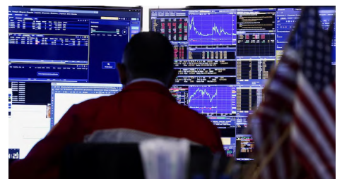
▲ A trader works on the floor at the New York Stock Exchange (NYSE) in New York City, U.S. said.