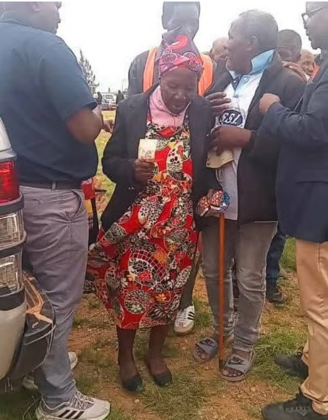
▲ The usually quiet community of Phondo was on Saturday transformed into a scene of celebration, gratitude, and unity as residents gathered at Bhadzeni Umphakatsi to witness an act of generosity that touched many hearts.

The joyful event also featured traditional performances, prayers, and words of blessing from community elders. For many in attendance, it was more than just a gift-giving ceremony it was a moment of hope and reconnection between the community and its leaders. As the sun set over Bhadzeni Umphakatsi, the spirit of gratitude lingered in the air. Residents went