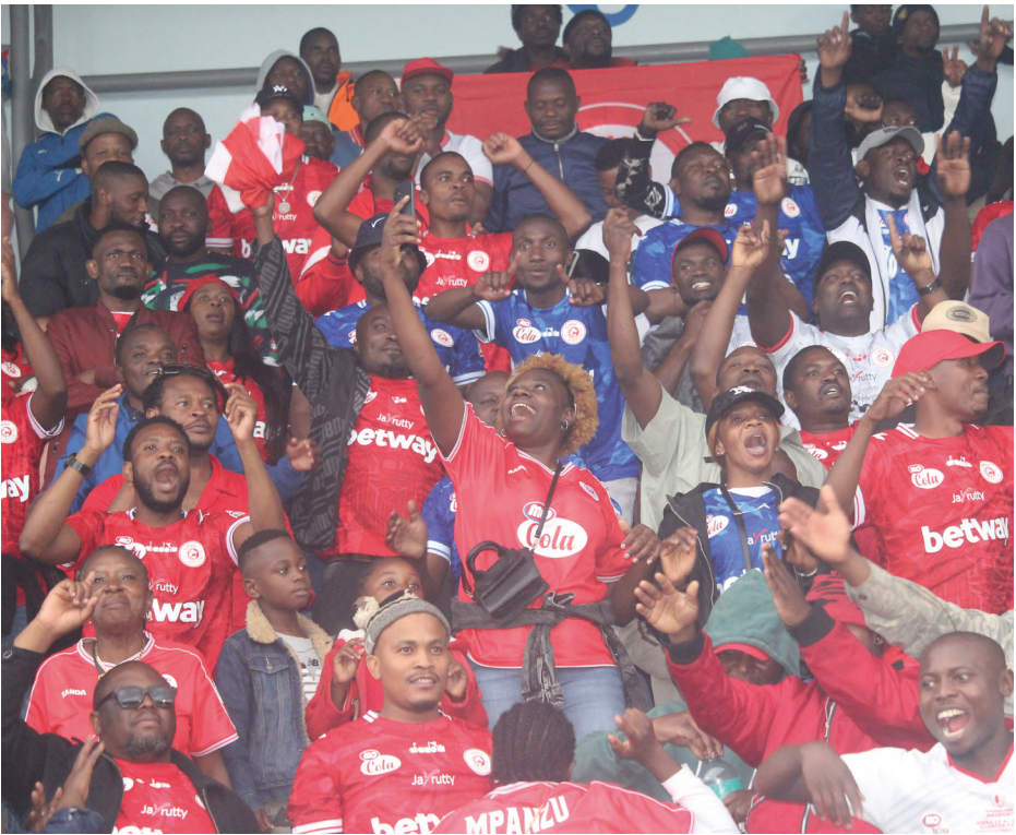
▲ Simba SC fans ecstatic after the final whistle. The wallopped Nsingizini Hotspurs 3-0 at Somhlolo National Stadium.