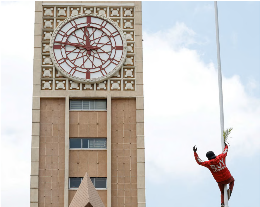
▲ A mourner climbs a pole outside the Parliament building where the body of Kenya’s former Prime Minister Raila Odinga, who had been receiving treatment in India when he died, is expected to be kept for people to pay tribute, in Nairobi Kenya