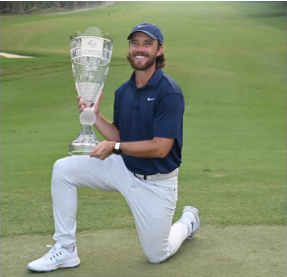
▲ Tommy Fleetwood.

with a brilliant 25-foot putt for an eighth birdie of the day at the 17th to end Nakajima's chances and the Japanese player had to settle for second. The Englishman's win followed him lifting the PGA Tour's FedEx Cup order of merit in August. He sealed that by finishing in the top four of the first two PGA Tour playoff events and then winning the season-ending Tour Championship for his maiden victory on the US-based circuit. "There's plenty of times where things haven't gone my way," said Fleetwood. "But the last two tournaments (where) I've been in contention I've won, so maybe things are starting to even out a little bit." Fleetwood, the world No 5, was also the leading points scorer for the victorious European team at the Ryder Cup last month. The inaugural $4 million event in India attracted a host of Ryder Cup players and star names to the historic Lodhi course at Delhi Golf Club, a green lung in the heart of the city studded with the ruins of Mughal-era tombs. Ireland's Shane Lowry had a final-round 68 to tie for third on 18-under par with England's Alex Fitzpatrick and South Africa's Thriston Lawrence. Norway's Viktor Hovland finished with a flourish, sinking a chip for an eagle three at the 18th to get into a three-way tie for sixth at 17-under. Rory McIlroy struggled to get going on Sunday and a 71 that left him on 11-under and a share of 26th place.