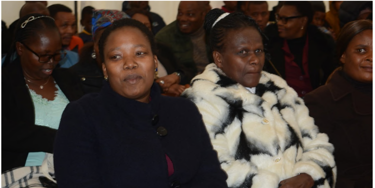
▲ Some of the Agriculture teachers who attended even.

table biodiversity across Africa, including in Eswatini.