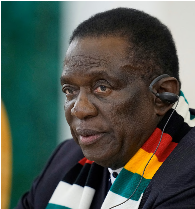
▲ Zimbabwean President Emmerson Mnangagwa attends a meeting with Russian President Vladimir Putin in the Grand Palace at the Kremlin in Moscow, Russia.

Prime Minister Benjamin Netanyahu said its reopening would de-