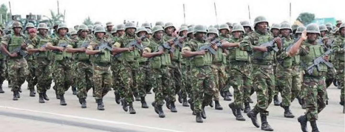
▲ The Umbutfo Eswatini Defence Force (UEDF) has intensified its border security operations.

In addition to combating rustling, the Defence Force also recorded significant progress in stopping the smuggling of un-