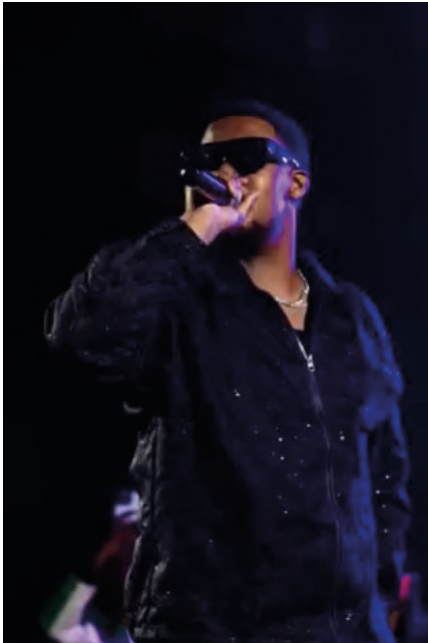
▲ Mawelele enticing fun lovers.