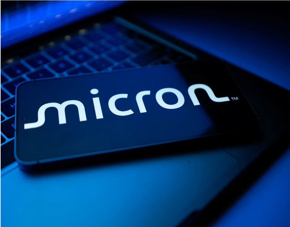
▲ A Micron logo appears in this illustration.

MICRON plans to stop supplying server chips to data centres in China after the business failed to recover from a 2023 government ban on its products in critical Chinese infrastructure, two people briefed on the decision said. Micron was the first U.S. chipmaker to be targeted by Beijing - a move that was seen as retaliatory for a series of curbs by Washington aimed at impeding tech progress by China's semiconductor industry. Shares of the chipmaker were down about 1%. Since then, both Nvidia and Intel chips have similarly fielded accusations from Chinese authorities and an industry group of posing security risks, though there has not been any regulatory action.