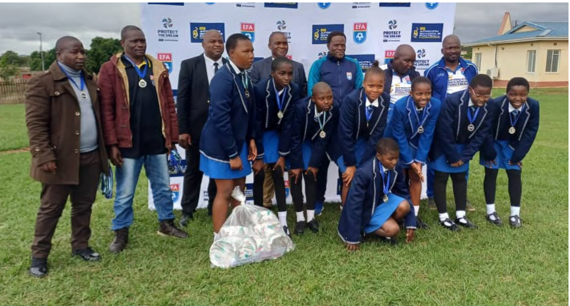
▲ St Marys high school were runner up.

the title, with St. Mary's High taking the second spot. The champions won 11 and drew two, finishing with 35 points, while their runners-up finished with 29 points, six short of the champions after suffering two defeats. For their achievement, the Mjingo ladies took home 10 soccer balls, a trophy and gold medals. St. Mary's received seven soccer balls and silver medals while third-placed Hillside High got five soccer balls and the silver medals. Otherwise, every school took home something as each was handed three soccer balls. In the boys' section, Lobamba National was presented with 10 soccer balls as well as their trophy and gold medals after beating 17 other schools to the title. Lobamba finished with 44 points, level with the runners-up Elangeni Primary. However, a better goal difference of five goals did the trick for Lobamba. Just like the ladies, it was sev-