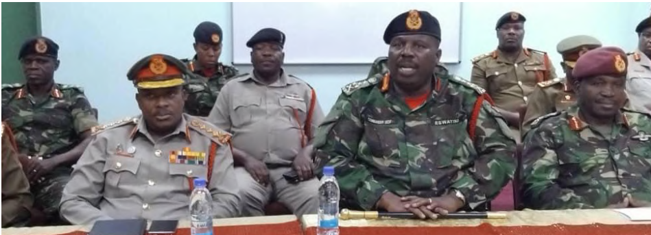
▲ Army Commander Moses Mashikilisane Fakudzwe speaks.

patrols to vehicle checkpoint (VCP) patrols," the report stated. "Foreign nationals, especially from the Republic of South Africa, were intercepted while attempting to transport dagga across the border."