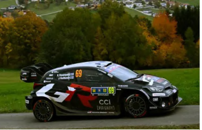
▲ Kalle Rovanpera.

for his thumping win in the Super Sunday stage and the Power Stage. Racing on tarmac in Germany, Austria and Czech Republic, this was Rovanpera's third win of the year, following triumphs in the Canary Islands and Finland, but he saved his praise for the Toyota team. "Huge congratulations to everyone in the workshop, clearly, we are super good as a team," said two-time world champion who will leave the world of rallying at the end of the season to try a new venture, still with Toyota, in the Japanese Super Formula Championship. The 25-year-old, however, made it clear he wants to go out with a bang.(Supersport)