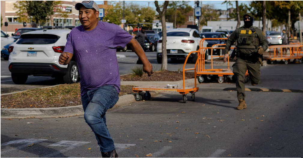
▲ A federal agent chases a man in the parking lot of a Home Depot in Chicago.