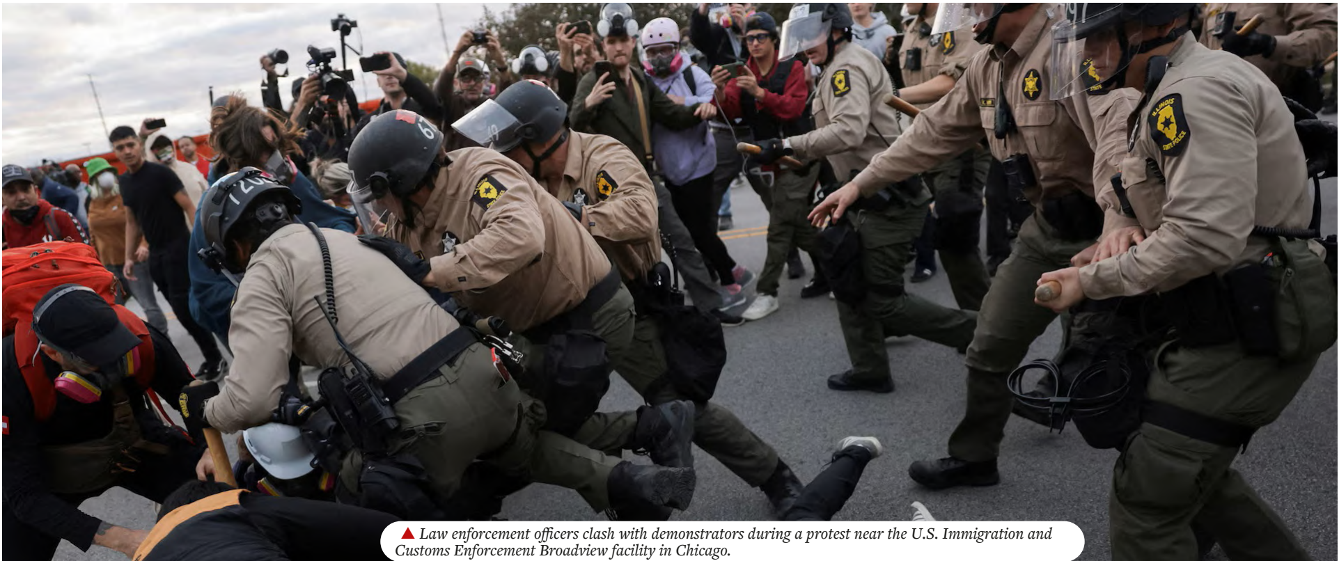
▲ Law enforcement officers clash with demonstrators during a protest near the U.S. Immigration and Customs Enforcement Broadview facility in Chicago.