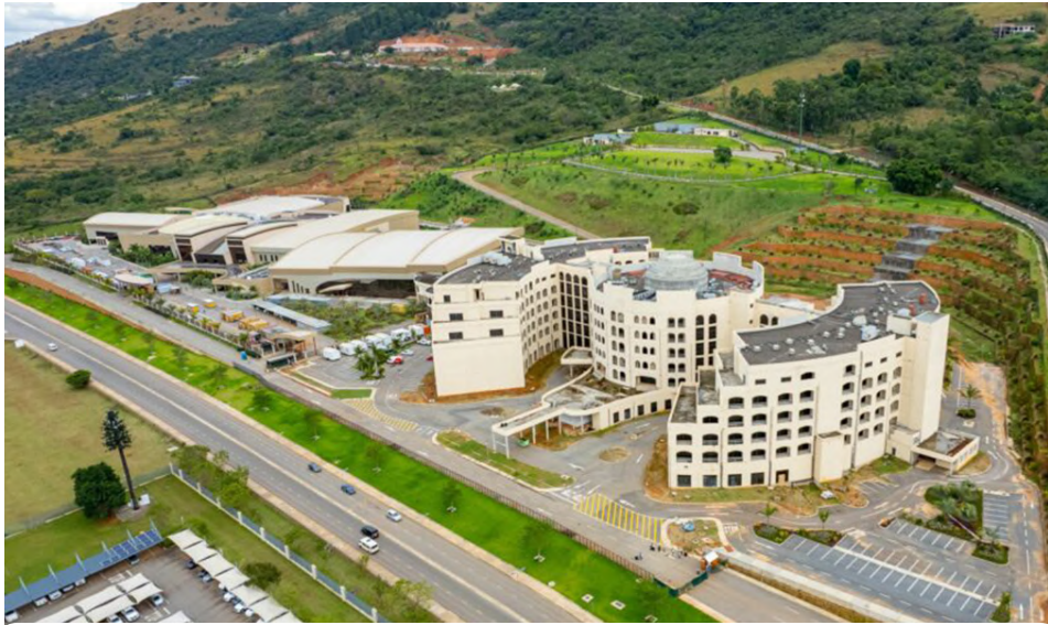
▲ The International Convention Centre (ICC) and the Five-Star Hotel (FISH).

In response, the Ministry clarified that