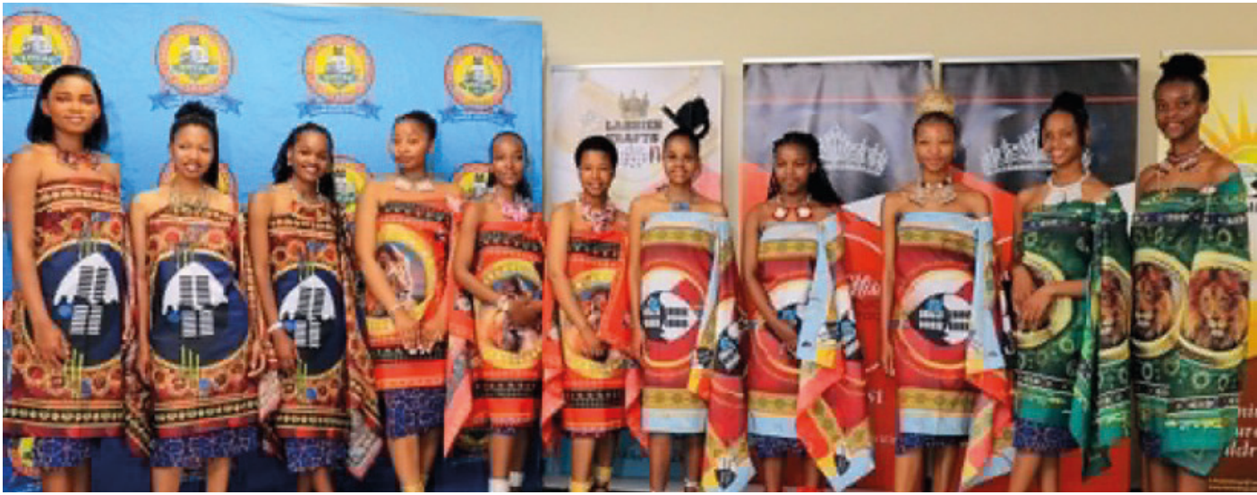
▲ Miss Cultural Heritage Eswatini 2025 finalists.