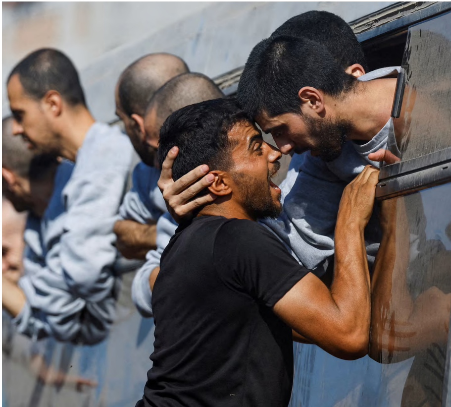
▲ A man greets a freed Palestinian prisoner released by Israel as part of a hostages-prisoners swap and a ceasefire deal, in Khan Younis in the southern Gaza Strip.