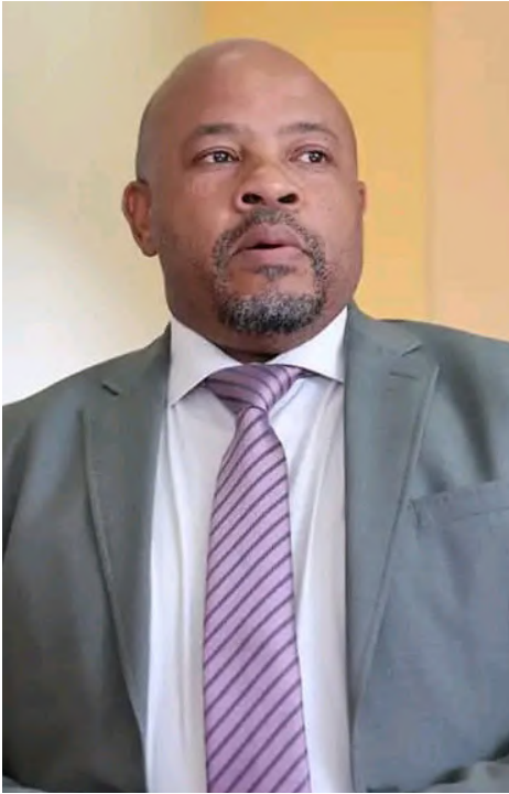
▲ Minister of Health Mduduzi Matsebula.

"Continuous professional development and aligning local training institutions with national health needs are key to ensuring a sustainable supply of qualified health professionals for the future," said the Minister.