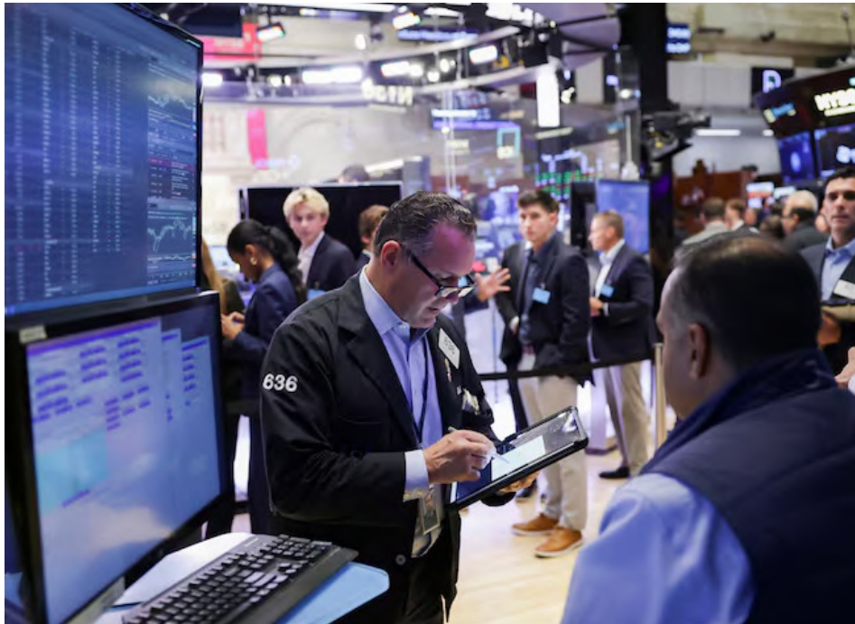
▲ Traders work on the floor at the New York Stock Exchange (NYSE) in New York City, U.S.

end the week also kept investors on edge as they weighed the extent of credit concerns emerging from regional U.S. banks.