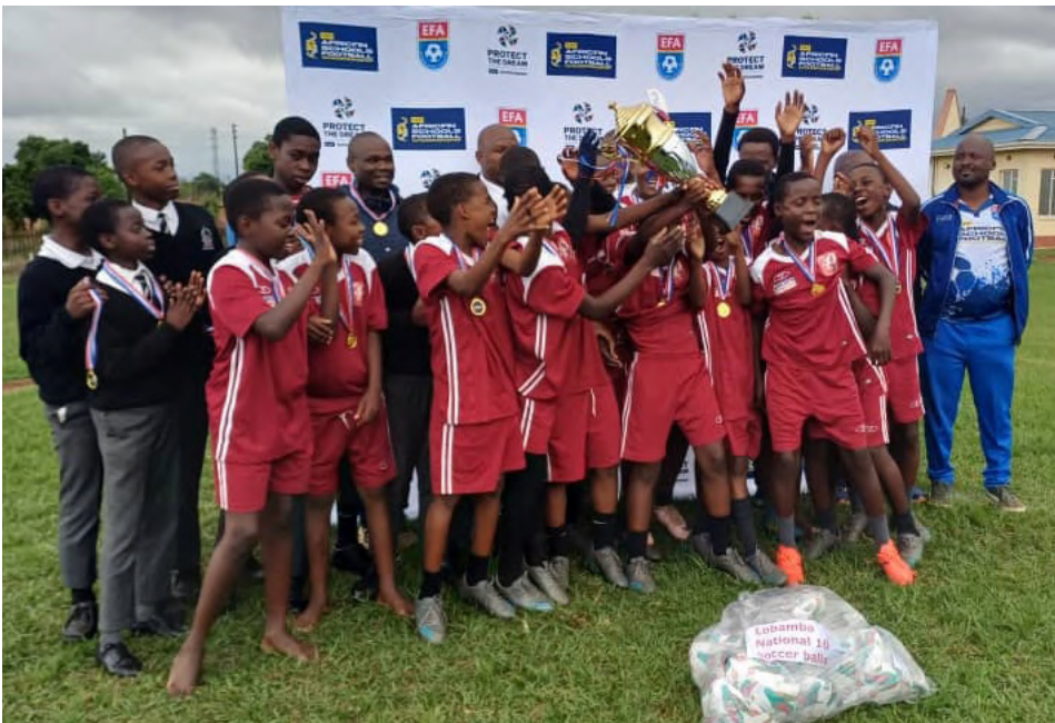
▲ Lobamba National High school in jovial mood.