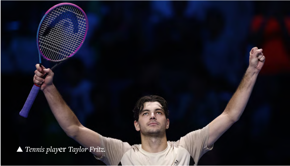
▲ Tennis player Taylor Fritz.

Jalen Brunson and OG Anunoby scored 19 points apiece for the Knicks, who scored their second-most points of the season while allowing their second-fewest points of the campaign. New York shot 54.5%, including 45.9% (17-of-37) from 3-point land, while limiting the Nets to 40.2% shooting. Michael Porter Jr. scored 25 points for the Nets, who have lost nine of their first 10 this season. Drake Powell had 15 points while fellow reserve Ziaire Williams finished with 13 points. Nic Claxton collected 12 points while Egor Demin and Day’Ron Sharpe added 10 points apiece. (Rueters)