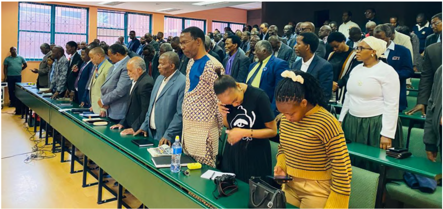
▲ The Ministry of Home Affairs hosted pastors.

They emphasised that their concern is with transparency and