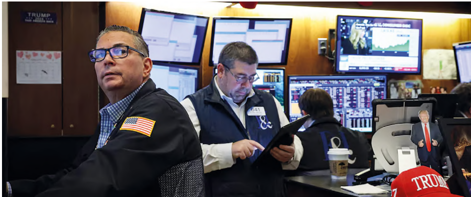
▲ Traders work on the floor at the New York Stock Exchange (NYSE) in New York City, U.S.

U.S. economy, with federal workers from airports to law enforcement and the military going unpaid while the central bank flies blind with limited government reporting of economic data.