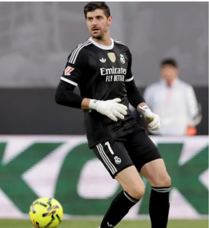
▲ Belgium goalkeeper Thibaut Courtois.