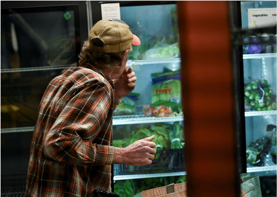
▲ A man reacts while selecting produce at Connections 4 Life food pantry in Fountain, Colorado.