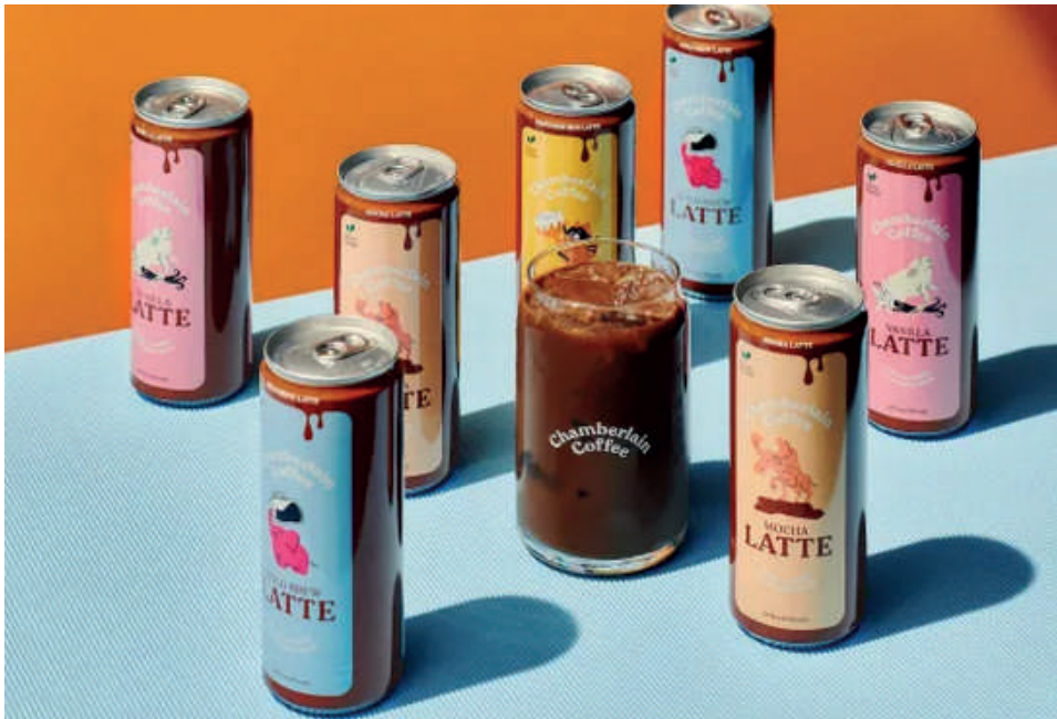
▲ Emma Chamberlain, who rose to fame as a teen vlogger in 2016, now has over 12 million subscribers and has found success in the beverage industry.