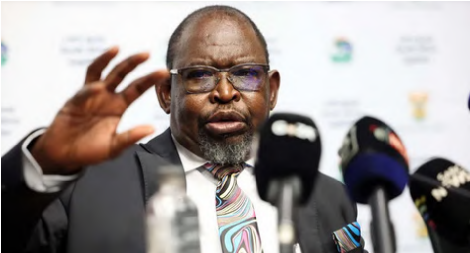
▲ The markets will be watching Finance Minister Enoch Godongwana closely when he delivers the Medium-Term Budget Policy Statement.

SOUTH Africans battling high food and fuel costs could get some relief, if the Reserve Bank’s calculations are right. The markets will be watching Finance Minister Enoch Godongwana closely when he delivers the Medium-Term Budget Policy Statement on November 12. Wednesday’s budget is likely to bring the cost of living into sharp focus, with economists saying he could well back a plan to lower the country’s inflation target range. South African Reserve Bank Governor, SARB Governor Lesetja Kganyago, has been pushing to lower the inflation target from the current 3%–6% range to a flat 3%. Kganyago argues that a lower target would support “sustainable economic growth and cheaper borrowing costs”. This could eventually make borrowing and living costs cheaper. Investec treasury economist Tertia Jacobs said the change would give the policy more credibility. “What we have seen is that South Africa’s target range is actually at the top end of most emerging markets,” she said. Jacobs added that “what is very important is that the minister of finance backs it up with a lower inflation target, say from 2 to 4 percent”. Jacobs said the Reserve Bank had already shifted its focus to the bottom end of the current 3 to 6 percent range. “If the government can embrace it because it means broader buy-in, that will give impetus and support to the Reserve Bank,” she said. National Treasury and the central bank had been investigating the impact of