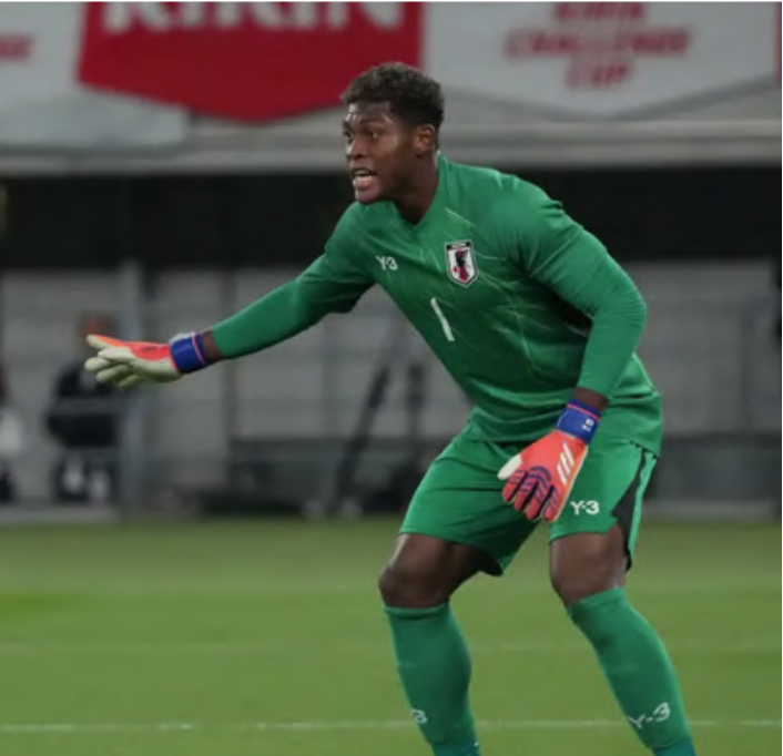
▲ Japan goalkeeper Zion Suzuki.

picked up the injury in their 2-2 draw with AC Milan on Saturday. “After picking up an injury against AC Milan last night, Zion Suzuki underwent scans today, which revealed a composite fracture in the middle finger of his left hand and in the scaphoid bone,” Parma said in a statement on Sunday. “Suzuki will undergo further specialist consultation in the coming days, and he will also have to undergo an eventual surgery in order to help cure the injury.” (Rueters)