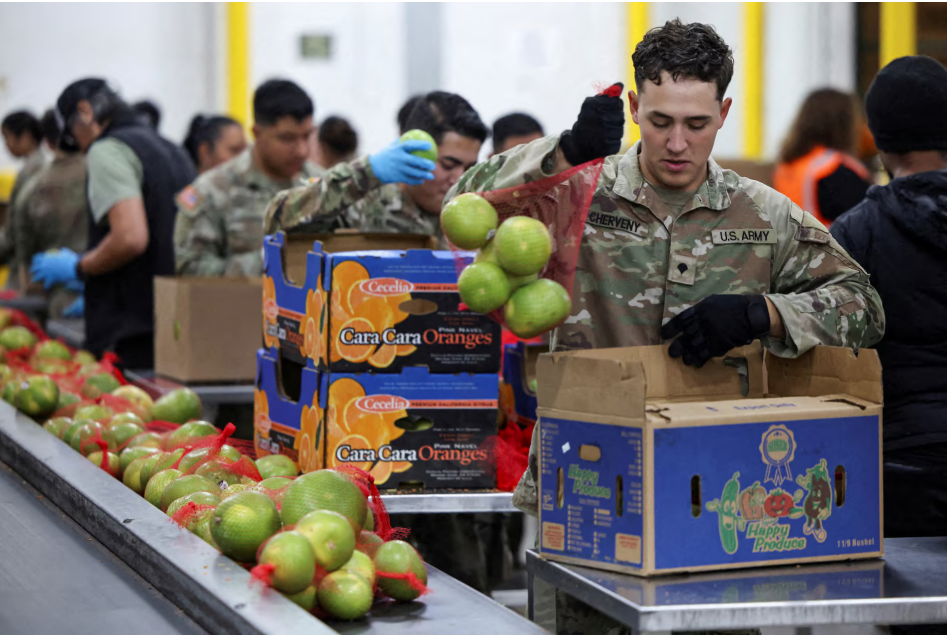
▲ A member of the National Guard packs food at a Los Angeles Regional Food Bank facility in Los Angeles, California. Nearly 42 million Americans rely on SNAP benefits delayed by the ongoing government shutdown, now the longest in U.S. history.