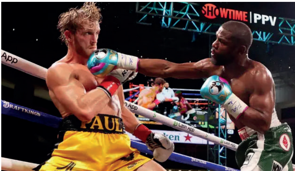
▲ Logan Paul (23.6 million subscribers) is now known for his wrestling career but was earlier known for numerous controversies, like an infamous 2017 video and an allegedly scammy NFT project, CryptoZoo.