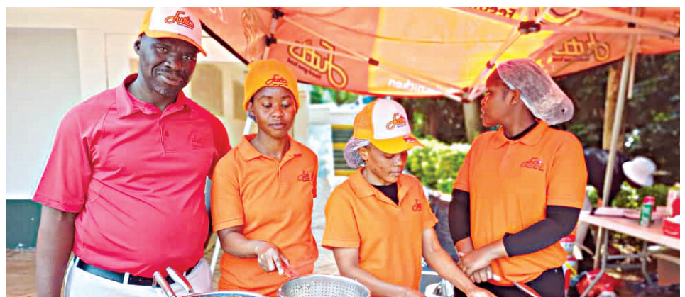
▲ Futi's staff members served golfers with food on Sunday.