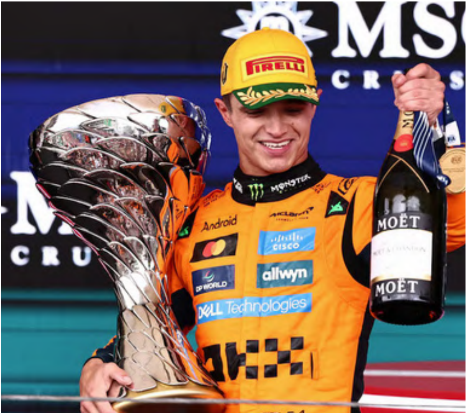
▲ McLaren's Lando Norris celebrates on the podium with a trophy after winning the Sao Paulo Grand Prix.