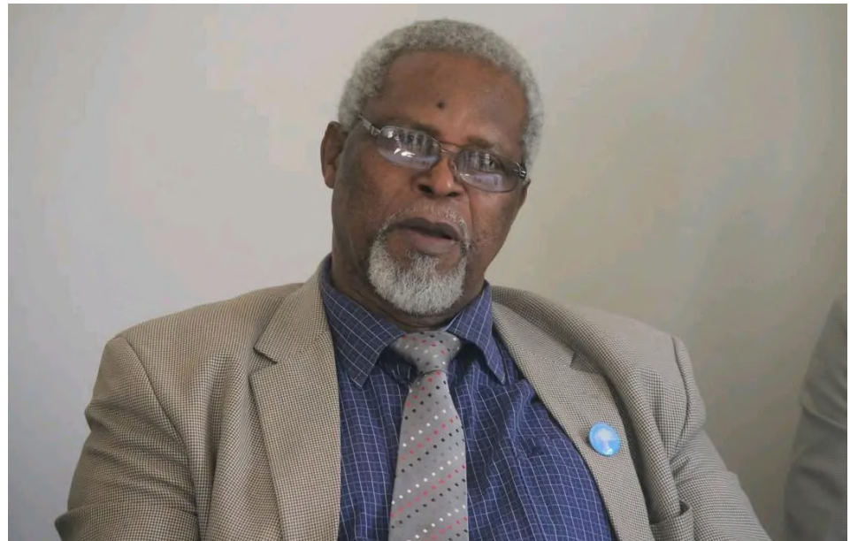
▲ Bishop Samson Hlatjwako.

Furthermore, the discussions highlighted broader challenges facing religion in Eswatini. Rapid growth in the number of