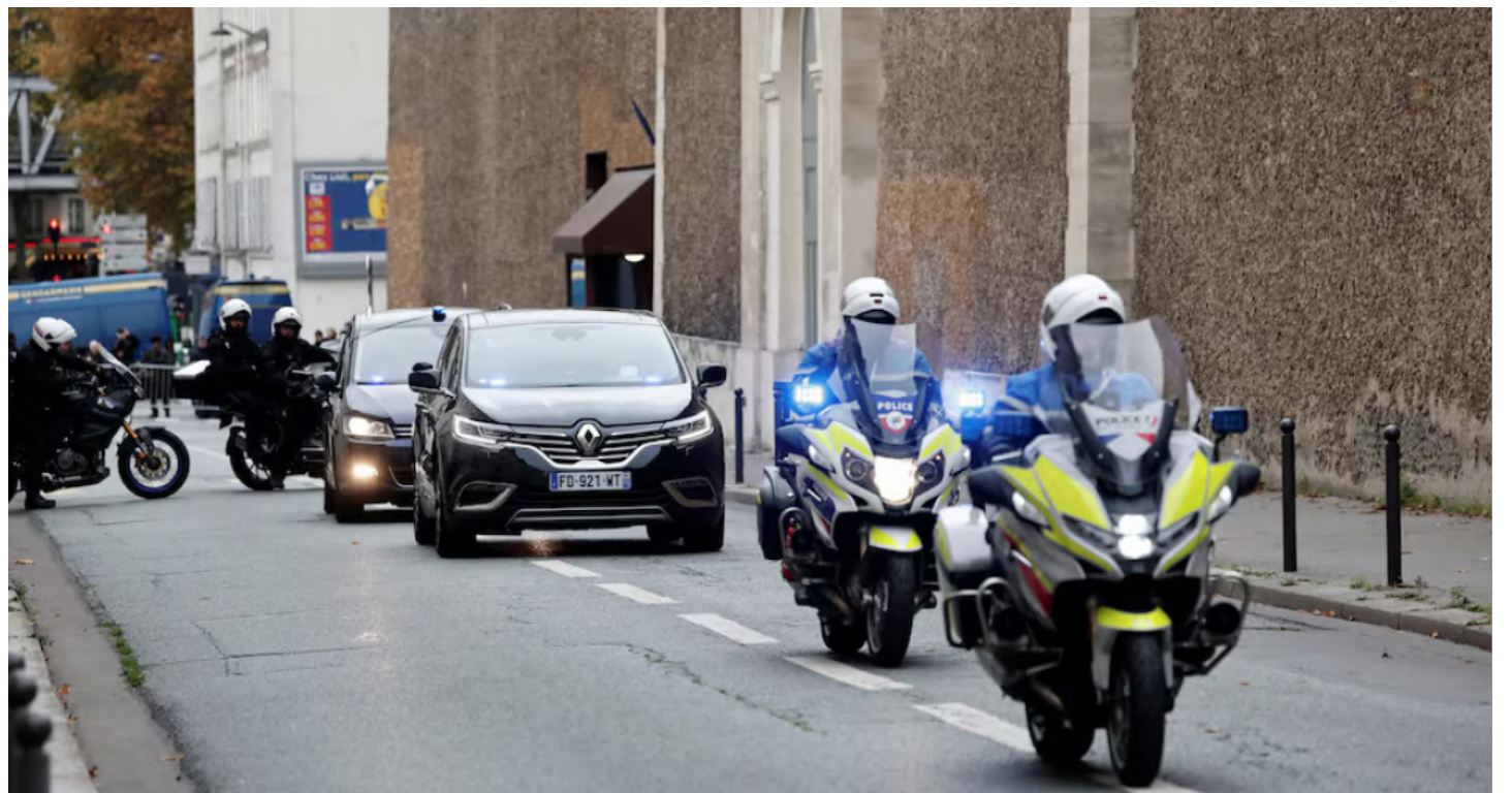
▲ Vehicles believed to be carrying former French President Nicolas Sarkozy leave the Sante prison, after a Paris court granted him an early release from jail, pending an appeal, weeks after he started a five-year sentence for conspiring to raise campaign funds from Libya, in Paris, France, justice ministry official.

The court agreed to release him under judicial supervision, which includes a ban on leaving France and a ban on talking to any