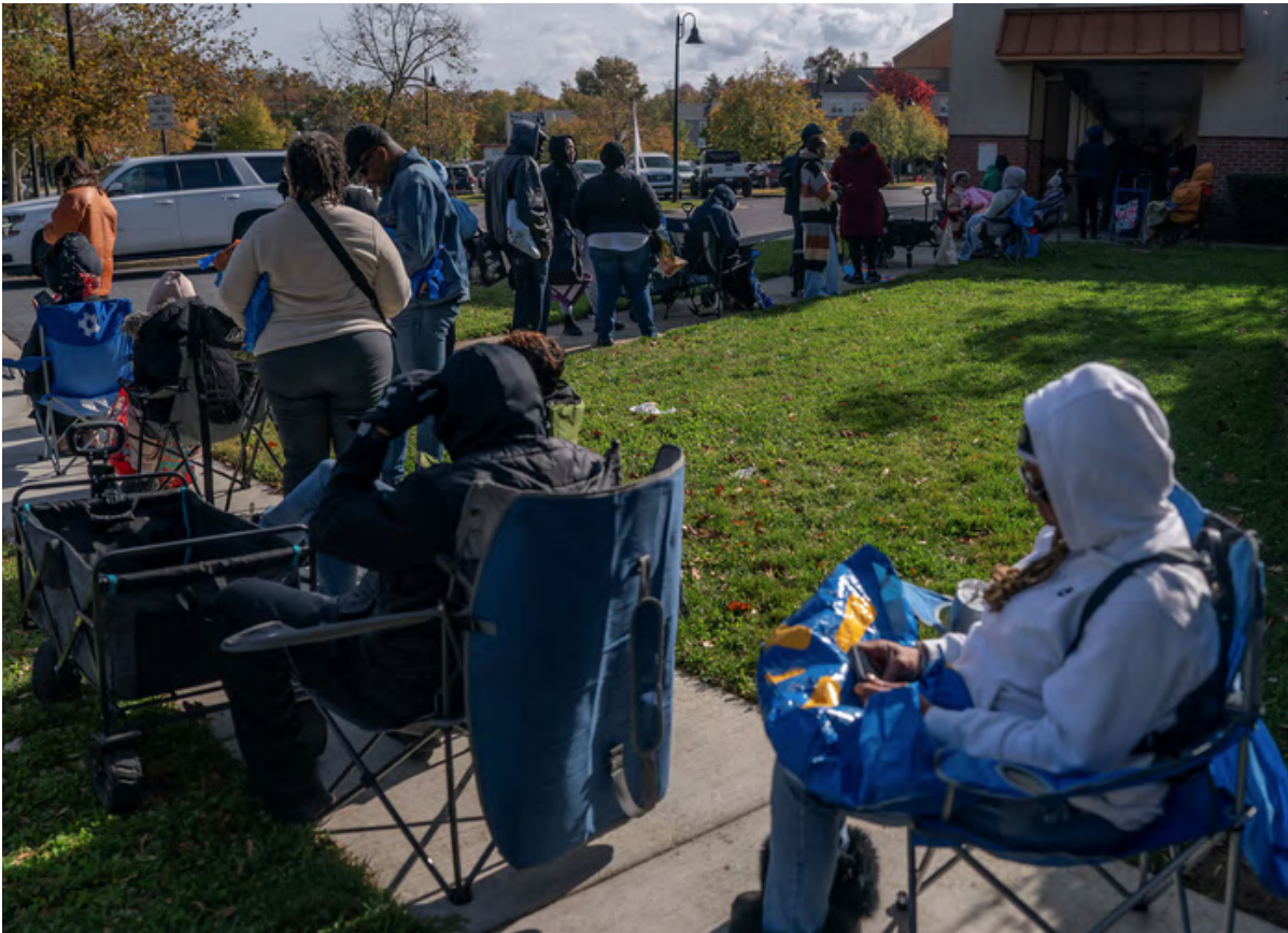
▲ Federal employees line up before collecting food from a Capital Area Food Bank distribution center in Hyattsville, Maryland.