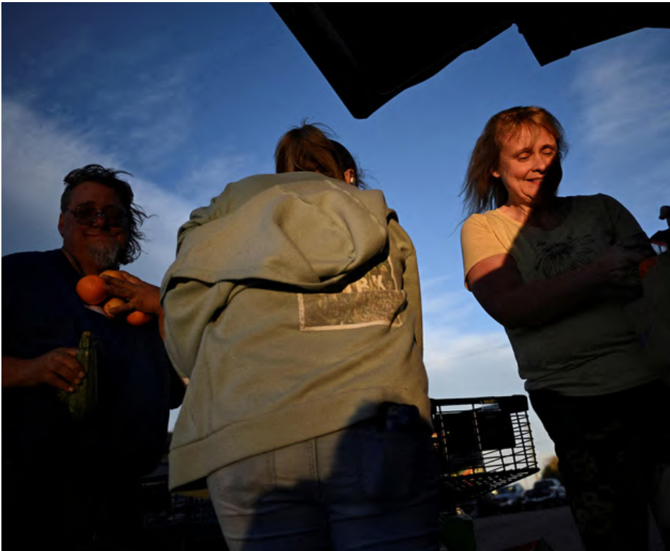
▲ A volunteer assists women in loading selected food into their car after visiting Connections 4 Life food pantry in Fountain, Colorado.