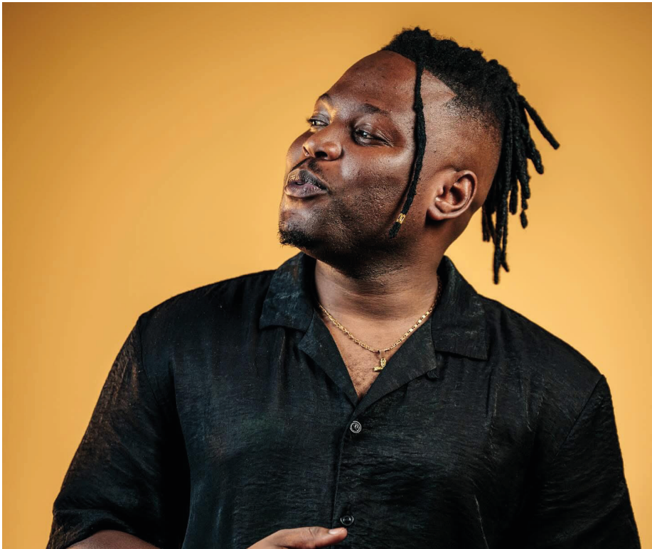
▲ Mduduzi Ncube.