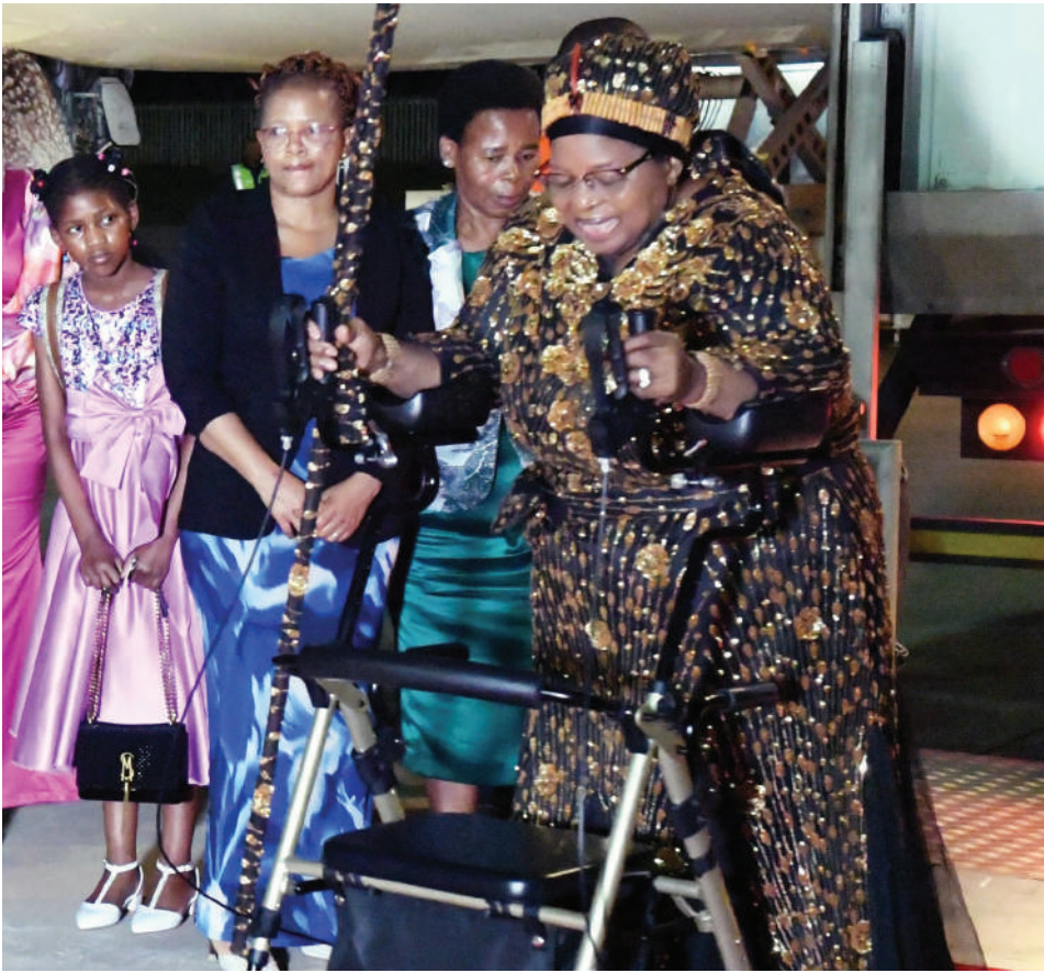
▲ Her Majesty Indlovukazi has been lauded by Manzini residents and market vendors for her enduring compassion and dedication to community upliftment.

Despite the grievances, residents commended the council for positive community-oriented initiatives, particularly the Mayor's Cup, a local football tournament