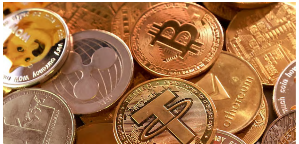
▲ Representation of cryptocurrencies.