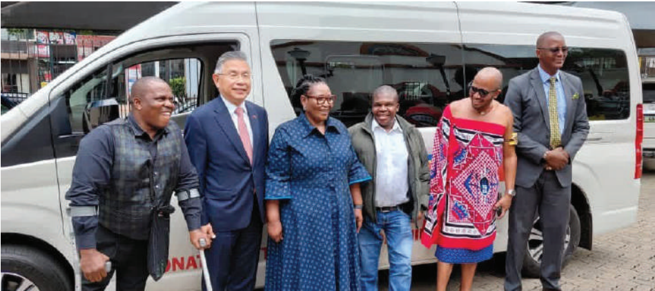
▲ The office of the DPM has received two generous donation of two universally designed vehicles, commonly known as quantumts, from the Republic of China (Taiwan).