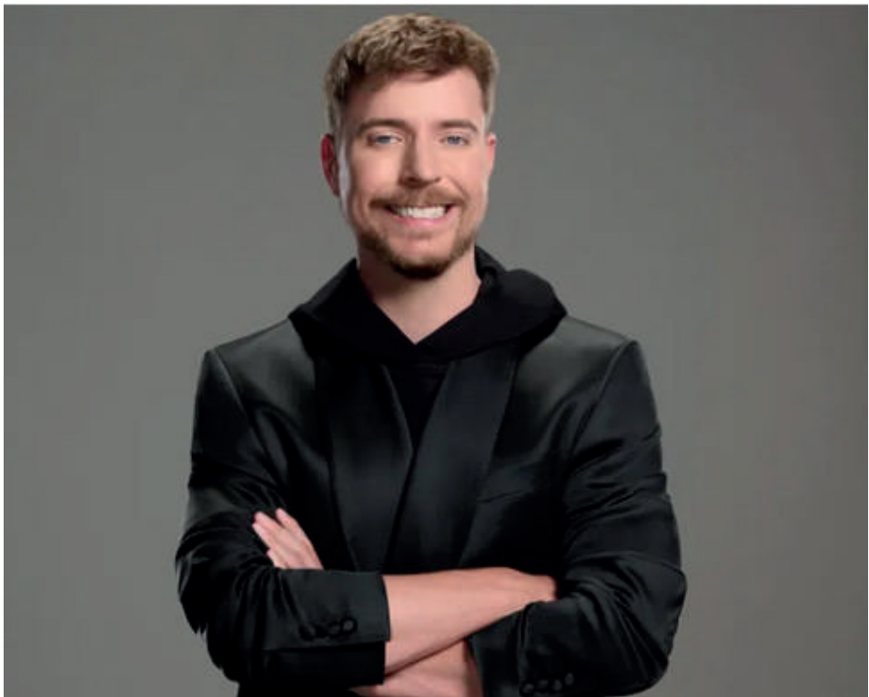
▲ Jimmy Donaldson, known as MrBeast, who has 442 million subscribers, isn't just one of YouTube's biggest stars — he's its most aggressive entrepreneur.