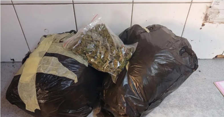
▲ A picture of dagga sourced from the internet.