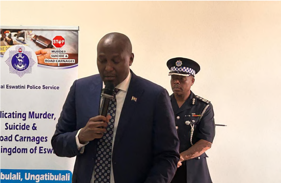
▲The Prime Minister Russell Mmiso Dlamini has made a clarion call for the return of the ‘Nawe Uliphoyisa’ mantra in the anti-national crime crusade.

demographic and technological changes require a new version of Nawe uliphoyisa one that embraces both traditional neighborhood watch systems and digital citizen reporting mechanisms.