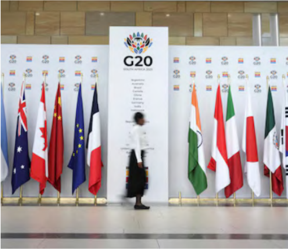
▲ A woman walks at the Cape Town International Convention Centre during the G20 Finance Ministers meeting in Cape Town, South Africa.

Afrikaners are subjected to oppression. “The claim that this community faces persecution is not substantiated by fact,” the ministry said, adding that South Africa’s past of racial inequality gives it the experience to help the world tackle divisions through the G20 platform. “Our nation is uniquely positioned to champion within the G20 a future of genuine