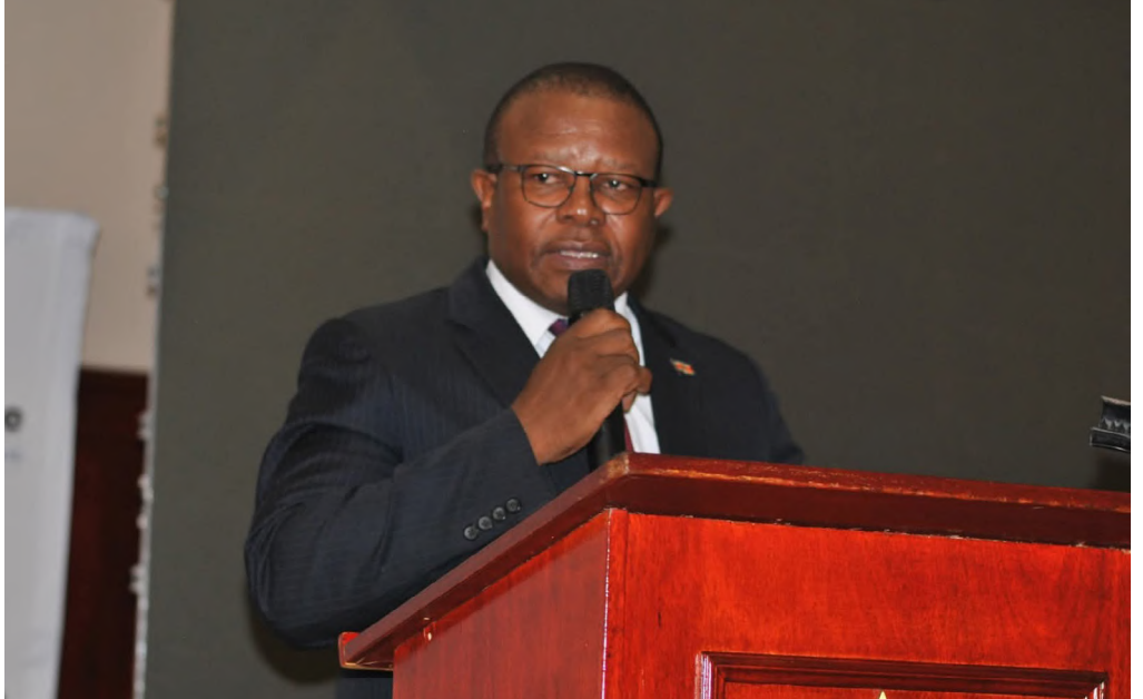
▲ Minister of Commerce, Industry and Trade Manqoba Khumalo.

The Government of Eswatini, in partnership with the United Nations Development Programme (UNDP) and the International Trade Centre (ITC), has reaffirmed its commitment