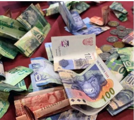
▲ A customary wife’s lack of financial dependency caused her to lose out on her husband’s R4.5