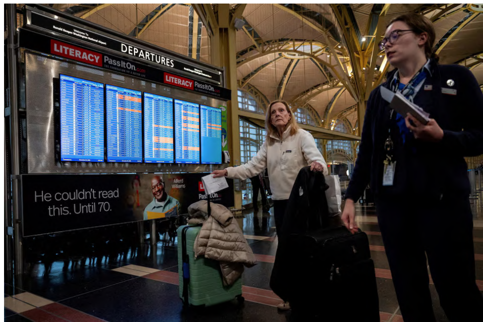
▲ An airport staff member helps a traveler at Ronald Reagan Washington National Airport, more than a month into the ongoing U.S. government shutdown.

federal employees, including members of the military, Border Patrol agents, and air-traffic controllers. When the Senate reconvenes on Monday, Republican leaders will try to get a bipartisan agreement to circumvent Senate rules and move quickly to passage. Otherwise, the chamber would require much of the coming week to move through procedural actions before voting on final passage, possibly extending the shutdown into next weekend.