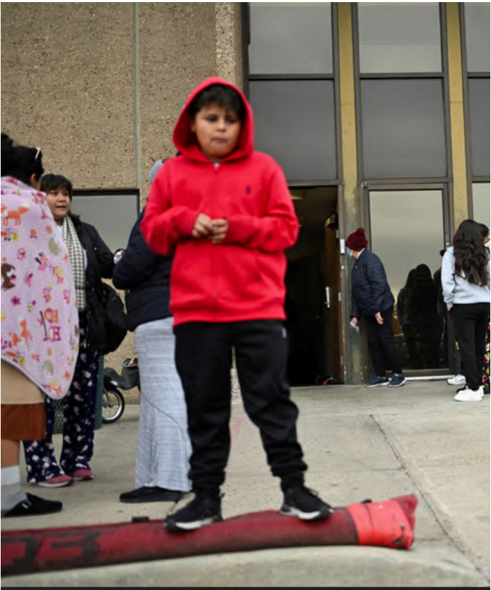
▲ People wait in line outside Adams County Emergency Food Bank in Commerce City, Colorado.