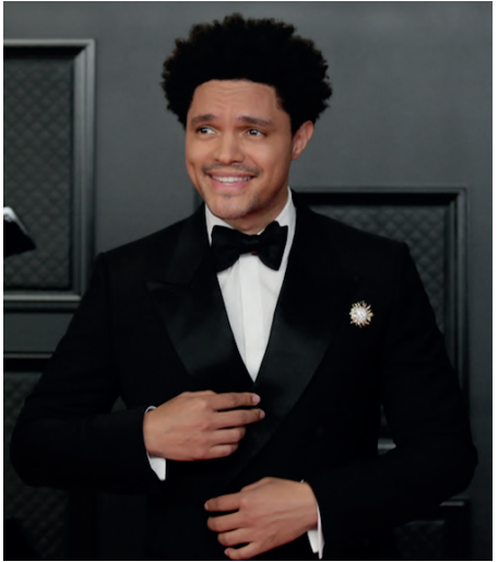
▲ Trevor Noah has received a nomination for Best Audio Book.

TREVOR Noah has received a nomination for Best Audio Book, Narration and Storytelling Recording for his reading of his illustrated fable, "Into the Uncut Grass", at the upcoming 68th Annual Grammy Awards. The nominations were announced on Friday, November 7, and this marks another milestone in Noah's evolving creative journey. Known globally as a comedian, author and television host, Noah continues to expand his storytelling across different mediums. In this category, he joins a select group of artists whose works showcase exceptional narration and the power of voice-driven storytelling.