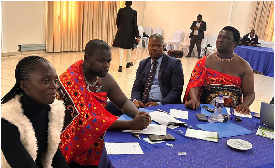
▲Some of the participants at the opening of the Police Service Regulations 2025 Workshop for the PM’s Office Parliamentary Portfolio Committee.

He added that maintaining discipline within the force is not only about enforcing rules but also about upholding integrity, accountability, and professionalism in every