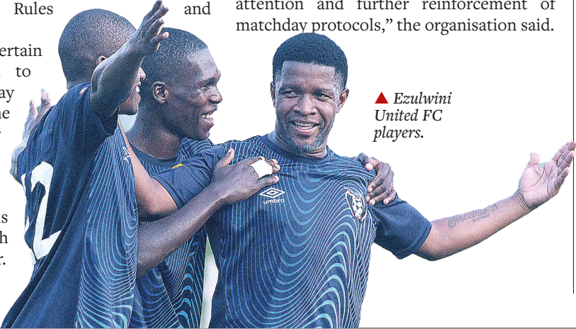
▲ Ezulwini United FC players.