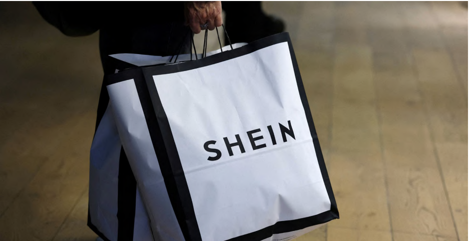
▲ A customer holds shopping bags with a Shein logo in the first physical space of Chinese online fast-fashion retailer Shein on the day of its opening inside the Le BHV Marais department store, the Bazar de l’Hotel de Ville, in Paris, France.

The promotional push extends around the world.