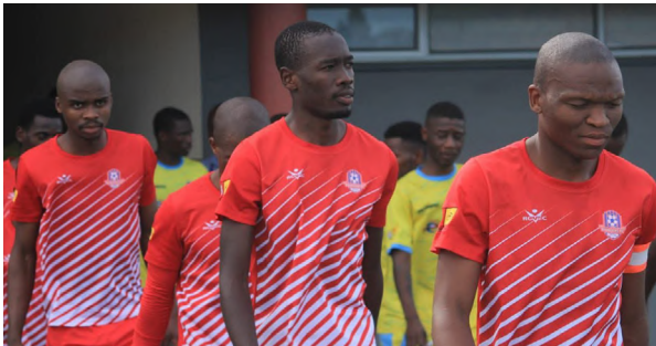
▲ Rangers players.

leaders. He has the knack for special goals. HEAD-TO-HEAD: 26/04/25 Ns. Hotspurs 1-0 M. Sea Birds 09/11/24 M. Sea Birds 1-2 Ns. Hotspurs 04/02/24 M. Sea Birds 0-1 Ns. Hotspurs 24/09/23 Ns. Hotspurs 1-1 M. Sea Birds PREVIOUS MATCH RESULT: Ns. Hotspurs 1-0 M. Pirates M. Sea Birds 2-0 R. Leopard PERFORMANCE GUIDE: Ns. Hotspurs L W L W W M. Sea Birds W W W W W