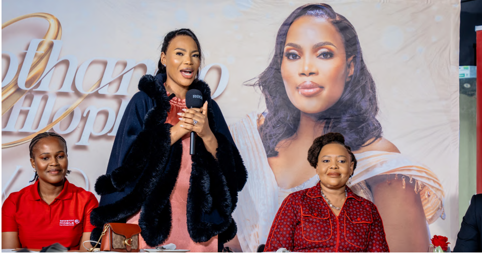
▲ Award winning gospel sensation Nothando Hlophe speaking during the luncheon, seated on her left is Minister of Foreign Affairs and International Cooperation, Senator Pholile Shakantu.

passion for storytelling and a desire to present the Eswatini narrative on every possible platform. “Seeing Nothando shine across Africa reinforces the importance of platforms that lift local creatives,” she said. “This win is bigger than one artist. It is a reflection of what Eswatini can offer the world when talent is nurtured and supported.”