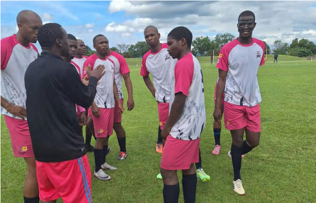
▲ Sea Birds players.