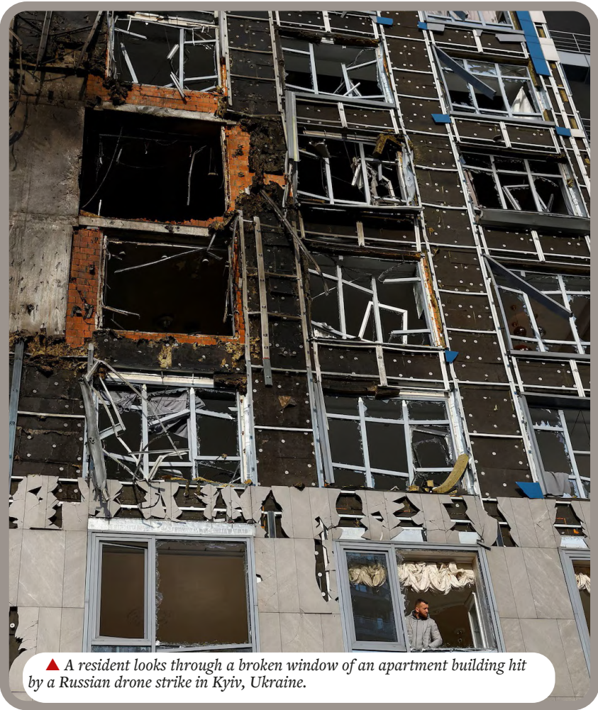
▲ A resident looks through a broken window of an apartment building hit by a Russian drone strike in Kyiv, Ukraine.