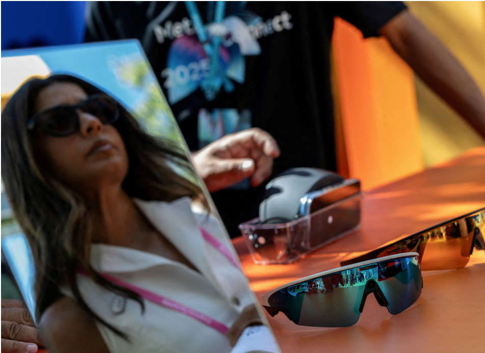
▲ Meta and partner EssilorLuxottica’s “smart” Ray-Bans and Oakleys, which first launched in 2023, have captured the tech world’s attention by answering calls, taking pictures and playing music.

About 25% of respondents surveyed by CivicScience - a consumer research firm that