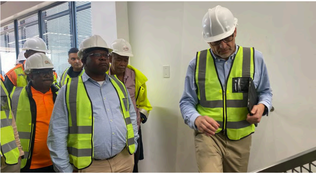
▲ Minister Khumalo and the team during the tour.

and semi-urban areas that historically did not attract heavy industrial investment.