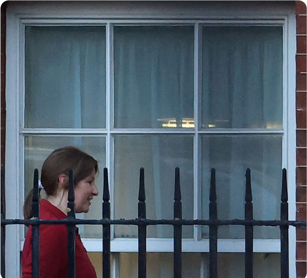
▲ Britain's Chancellor Rachel Reeves returns to a back entrance of Downing Street, following a run, in London, Britain.