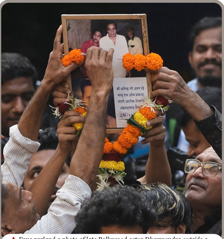
▲ Fans garland a photo of late Bollywood actor Dharmendra outside a crematorium where his rites take place in Mumbai, India.