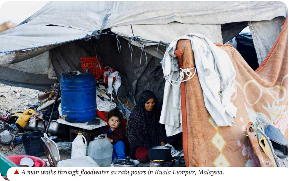
▲ A man walks through floodwater as rain pours in Kuala Lumpur, Malaysia.