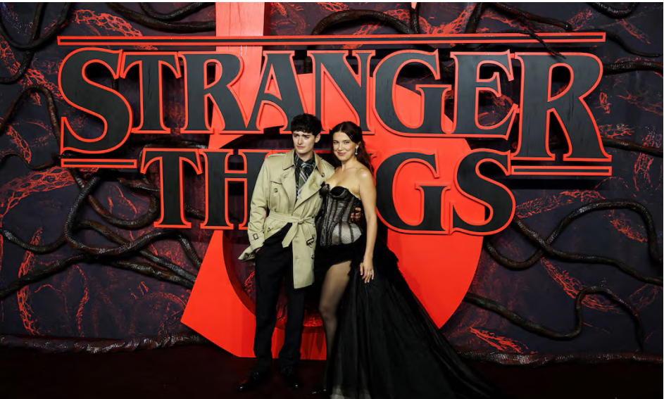
▲ Cast members Noah Schnapp and Millie Bobby Brown attend the screening for the final season of the television series “Stranger Things”, at Odeon Luxe Leicester Square in London, Britain

NETFLIX’S hit sci-fi series “Stranger Things” is about to ride to its conclusion with a marketing and merchandising blitz befitting a blockbuster movie.