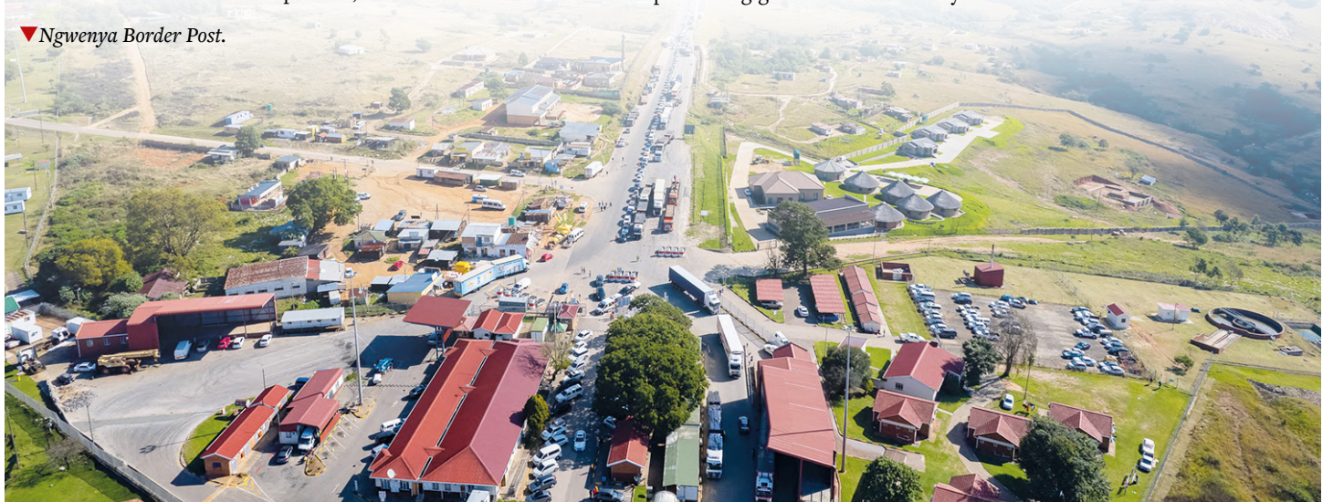
▼ Ngwenya Border Post.

With the new threshold set to take effect on November 28, Eswatini's border posts are preparing for a transition many hope will bring order, fairness and much-needed clarity.