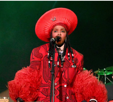
▲ Lauryn Hill.

Hill explained that her experience in Johannesburg was transformative and remarkable for many reasons: “We made new connections and solidified new friendships