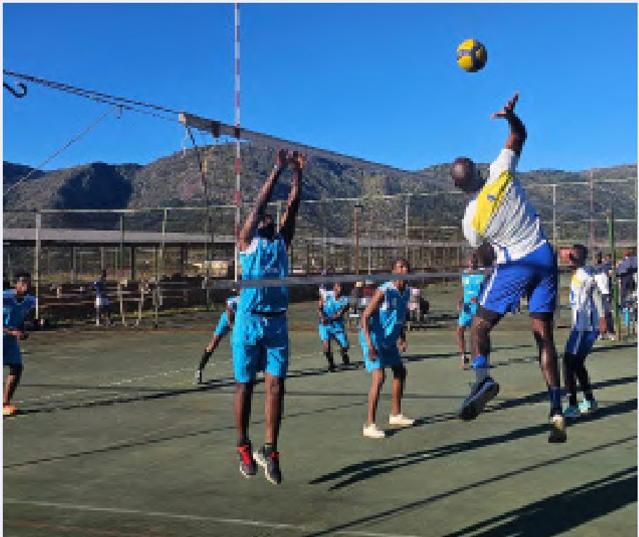
▲ Volleyball B Division teams in action during the Sandza Construction League.