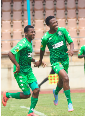
▲ Tambankulu Celtics players celebrating.