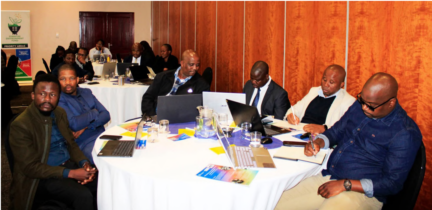
▲ Some of the attendees during the event.

fore droughts cause widespread damage," he said.