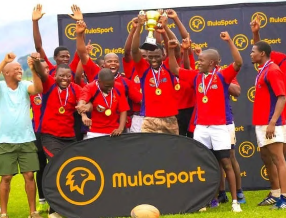
▲ Dvokolwako Buffaloes in a jovial mood after the finals.