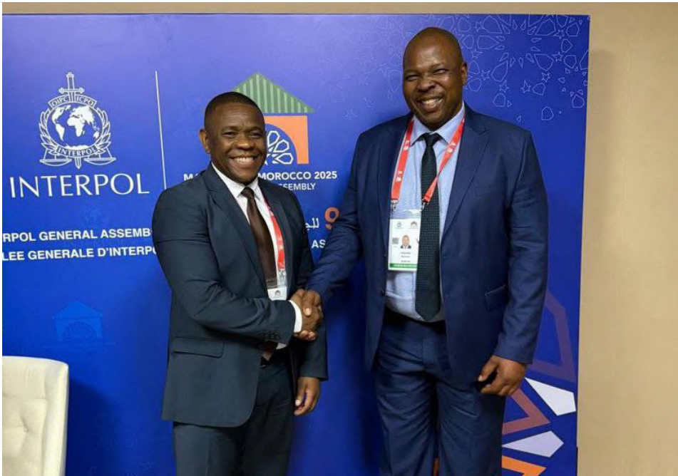
▲ Royal Eswatini Police Services National Commissioner Vusi Manoma Masango (Right) with KZN Provincial Commissioner Nhlanhla Mkhwanazi.

The Ministry of Foreign Affairs and International Cooperation has pointed out that Taiwan's support has extended beyond the exchange of personnel and knowledge. Taiwanese institutions have played a role in strengthening cybercrime detection, enhancing forensic capabilities and providing specialised training in areas such as border security and anti trafficking operations. These collaborative efforts have