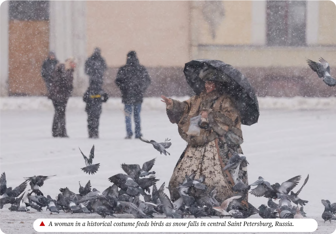
▲ A woman in a historical costume feeds birds as snow falls in central Saint Petersburg, Russia.