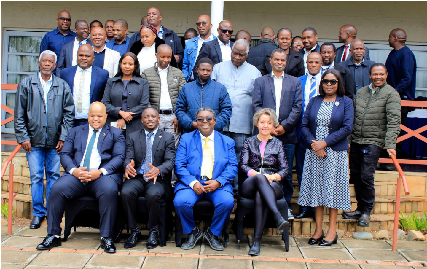
▲ The stakeholders during the meeting.

"Drought is the highest hazard in Eswatini, and it affects every citizen. We need coordinated systems and reliable funding to act be-