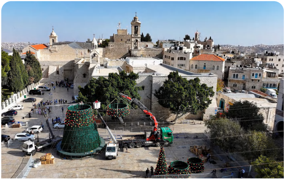
▲ A drone view shows cranes are used to assemble the Christmas tree at the Manager Square near the Church of Nativity in Bethlehem, in the Israeli-occupied West Bank.