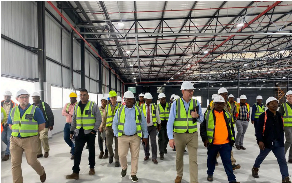
▲ Minister for Commerce, Industry and Trade Manqoba Khumalo touring the factory with the Jonsson Workwear team.

... Marks major industrial milestone for Eswatini