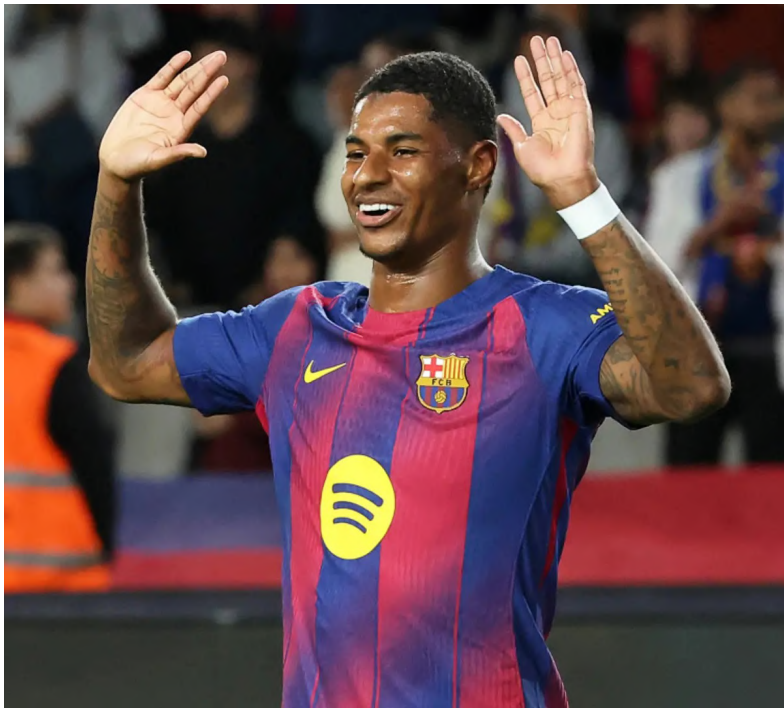
▲ Marcus Rashford.

Barca and Chelsea are level on seven points after four matches in