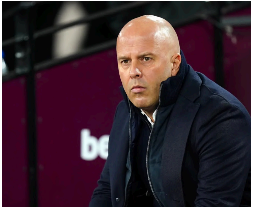
▲ Arne Slot.

“After the game on Saturday it was a kind