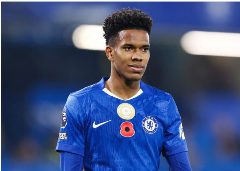
▲ Enzo Maresca.

self day by day. Try to work hard, improve.”