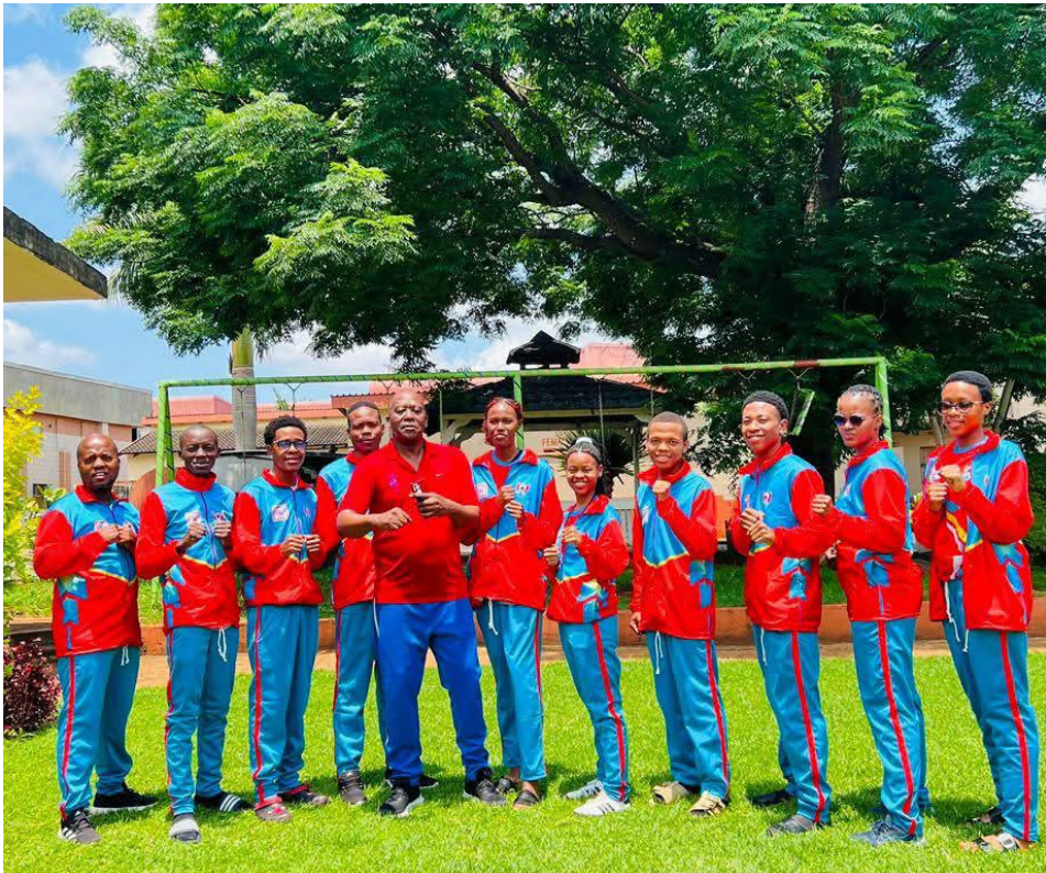
▲ The Taekwondo national team.