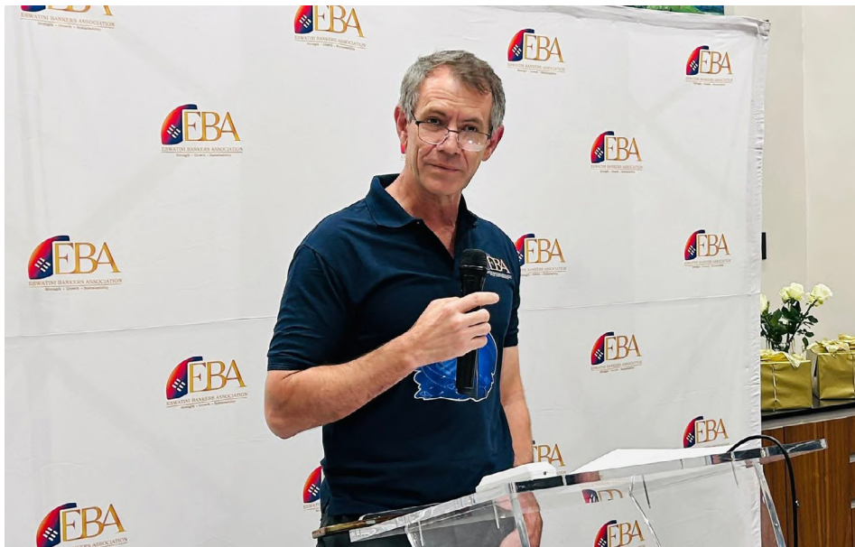
▲ Minister of Finance Neal Rijkenberg.

... Govt pushes for easier, more transparent border compliance