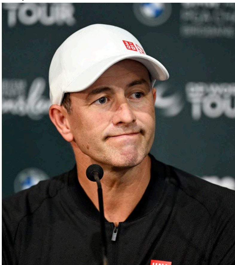
▲ Former Masters champion Adam Scott.