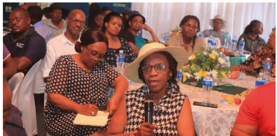
▲ Mankayane community members came all out for the annual general meeting (AGM).