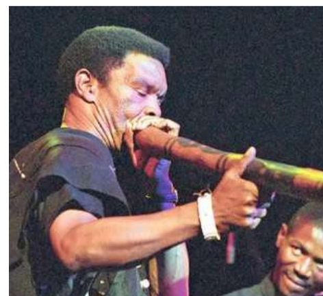
▲ Legendary musician Pops Mohamed.

Details of his memorial and funeral services have not yet been announced