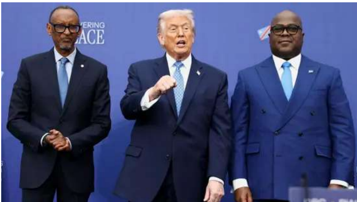
▲ Donald Trump gestures as he hosts the signing ceremony of a peace deal with Rwandan president Paul Kagame (left) and the president of the Democratic Republic of the Congo Felix Tshisekedi at the United States Institute of Peace in Washington, DC.