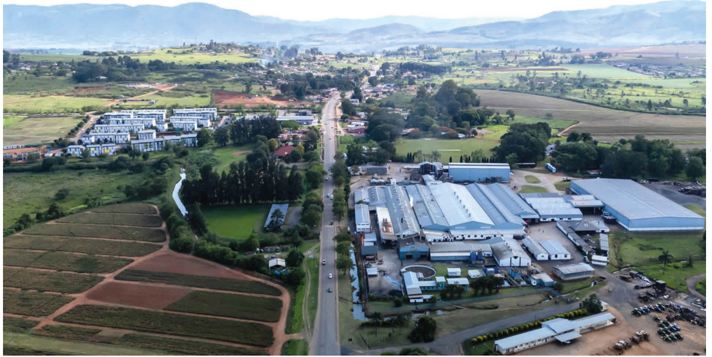
▲ An aerial view Malkerns Town. Towns like Malkerns stand to benefit from the E20 million boost as this is a move expected to accelerate infrastructure upgrades in six Town Boards and strengthen service delivery where support is most urgently needed.