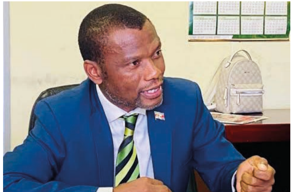
▲ Minister of Housing and Urban Development Appollo Maphalala.

and financial independence, with some municipalities successfully implementing phased projects using a combination of loans, internal revenue, and external partnerships.