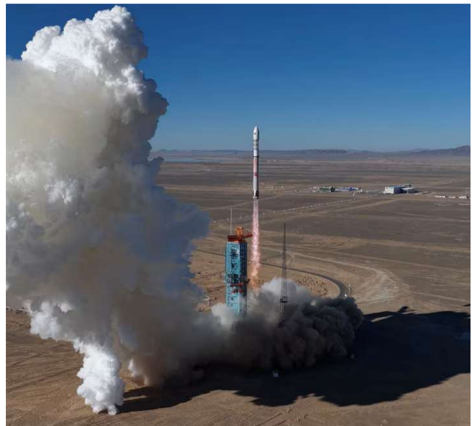
▲ The Zhuque-2 Y-3 carrier rocket, a methane-liquid oxygen rocket by Chinese company LandSpace, carrying satellites takes off from the Jiuquan Satellite Launch Center, in Gansu province, China.

For Beijing, companies like LandSpace are a way to combine the experience of long-established state space firms with the speed and risk-taking of startups as it seeks to