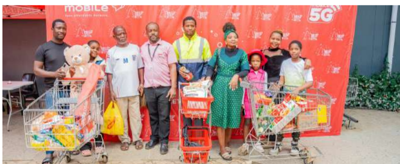
▲ Eswatini Mobile had a blast settling their loyal customers' bills at Buhleni Shoprite.