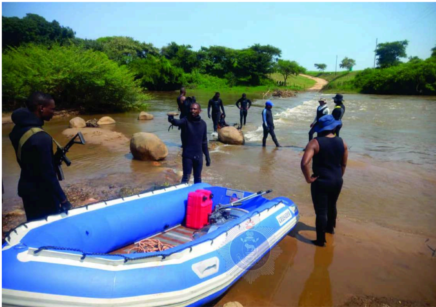
▲ Police scuba divers seen at work in search of the 32 year old Mozambican man.

A police scuba diving unit was deployed and initiated a search and rescue operation along the river. However, the operation proved difficult due to the strength of the current and fading visibility. Despite several