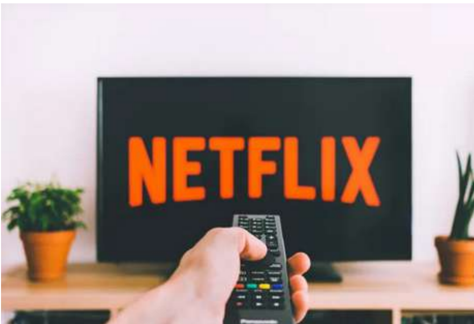
▲ This is the entertainment industry's biggest consolidation deal this decade. The acquisition gives Netflix access to a vast film catalogue and streaming service HBO Max.

The newly announced agreement places Warner Bros. Discovery's value at about US $27.75 per share (R474), giving the media giant an eye-watering equity valuation of roughly US $72 billion (R1.23 trillion), and an enterprise value of around US $82.7 billion (R1.41 trillion) once debt is factored in.