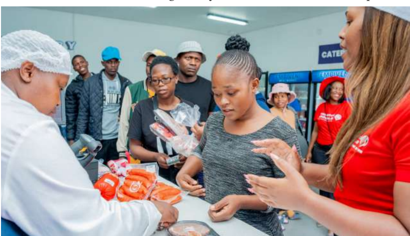
▲ Settling meat carts was the order of the day at Embiveni Pigg's Peak.