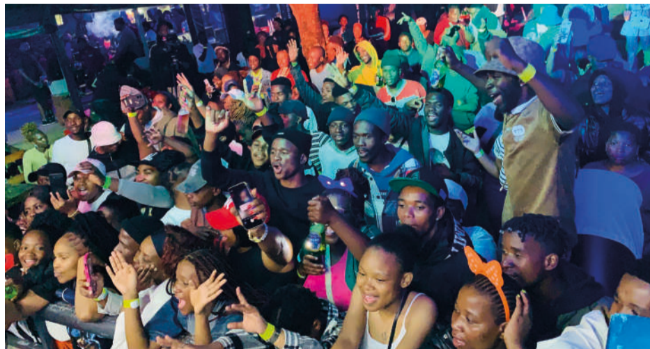
▲ A section of the audience during the show.

the atmosphere changed. People moved differently, grounded, united, drawn into the pulse of the drums and the melody of memory. When he followed it with "Batawuvuma," the entire venue erupted in singing, dancing, and that beautiful communal vibe that only traditional Eswatini music can spark.