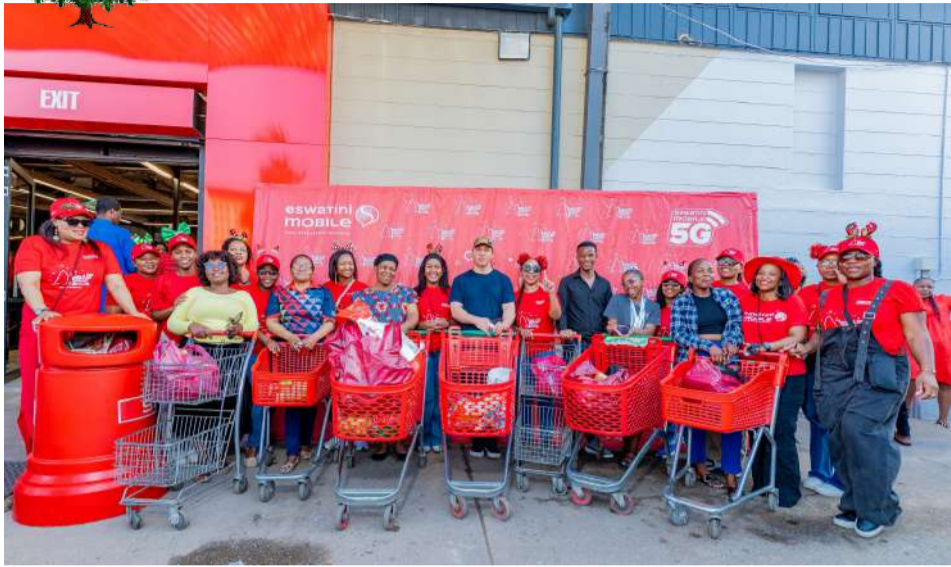
▲ The Red Team posing for a group picture with some of the winners at SuperSpar Mbabane.