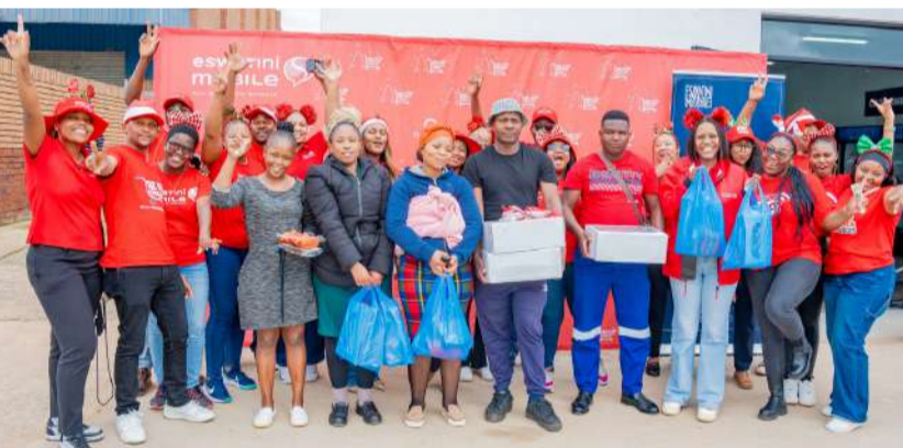
▲ The team posing for a group picture with some of the winners at Embiveni Pigg's Peak.