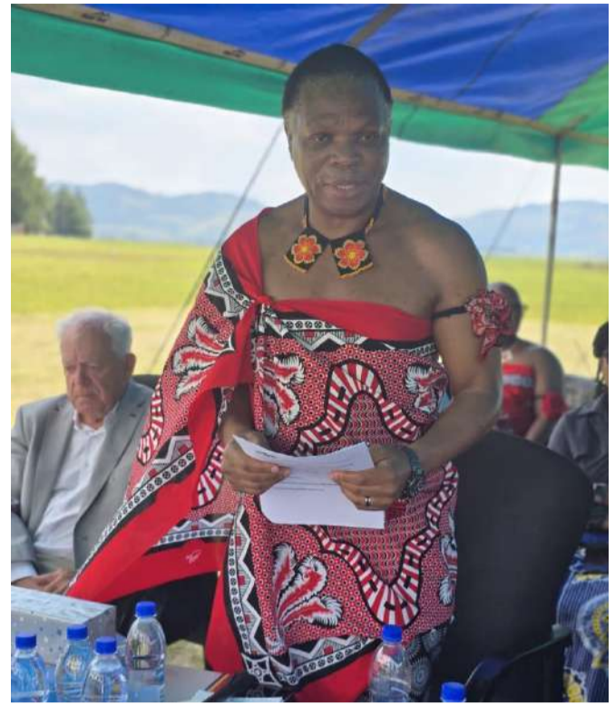
▲ Minister for Natural Resources and Energy HRH Prince Lonkhokhela during the launch of the project.