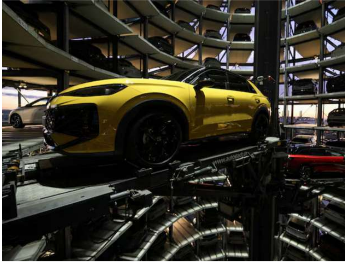
▲ Volkswagen T-Roc vehicle is loaded into a delivery tower at the German carmaker's plant in Wolfsburg, Germany.