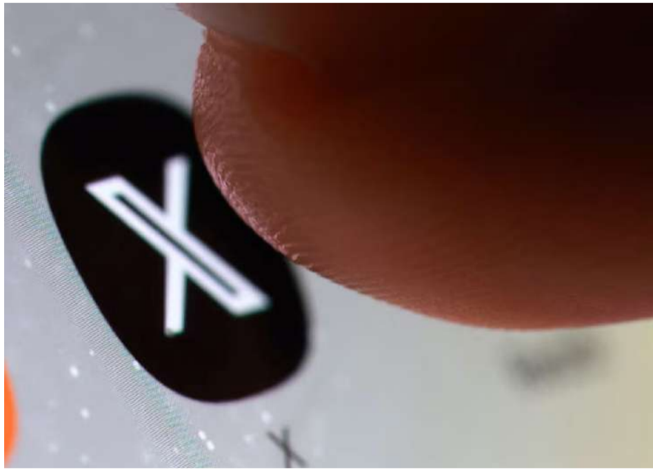
▲ The X app icon on a smartphone in this illustration.

The reusable Falcon 9 core stage allowed SpaceX to start launching its Starlink satellites in 2019 far faster than its rivals, becoming the world's largest operator the follow-