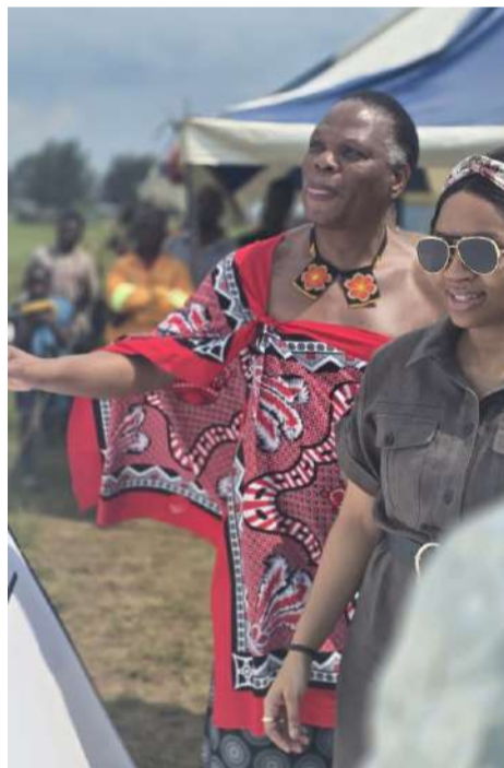
▲ The project will take 18 months to complete.

"We are moving with urgency because the country needs reliable, affordable electricity. This solar plant will add much-needed capacity to support factories, hospitals,