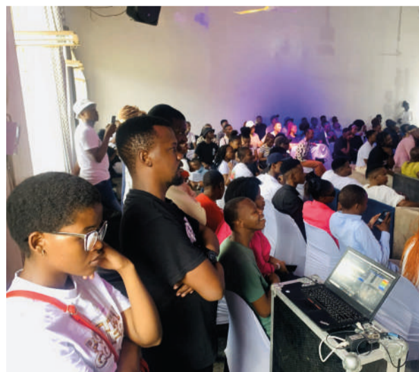
▲ Attendees at the Poetry In Comfort show following proceedings.

“This segment allows us to crown the best