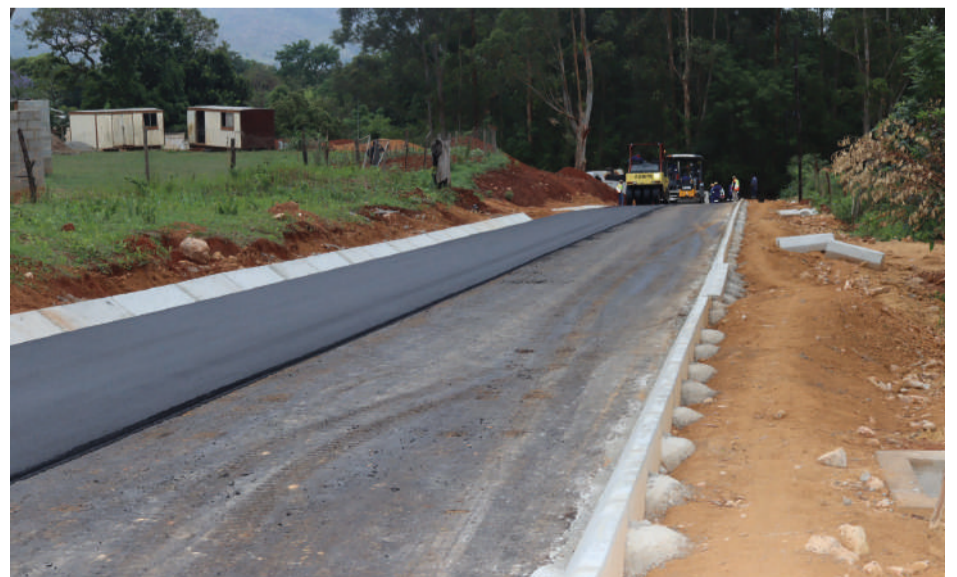
▲ According to the Ministry of Housing and Urban Development, this year’s budget will fund a series of projects aimed at improving road networks.

“For now, government sees the current allocation as an opportunity for the six Town Boards to strengthen their infrastructure foundation, enhance service delivery, and set examples of efficient project implementation that can be replicated nationwide,” said Maphalala.