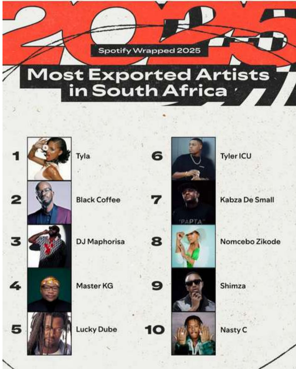
▲ Spotify's Wrapped 2025 results are in and superstars Tyla and Black Coffee are among the most-exported South African artists, reaching audiences far beyond the country's borders.

Renowned music producer, DJ and artist DJ Maphorisa is the third most-exported South African artist and his frequent collaborator Kabza De Small is number seven. "Jeruselema" hitmaker Master KG is the fourth-most-exported South African artist, with his former labelmate and collaborator, Nomcebo Zikode, at number eight. (IOL)