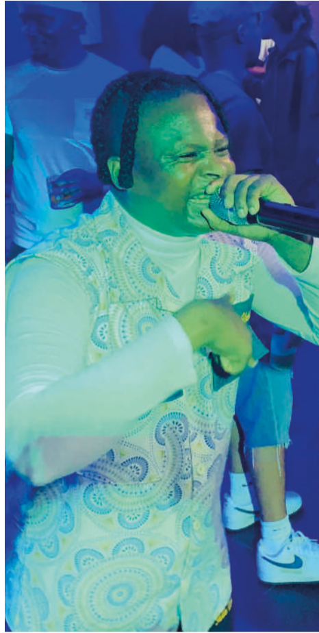
▲ Young Zesh jumping on stage, belting it out.