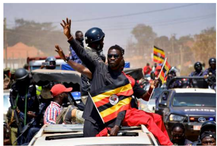
▲ Ugandan Presidential candidate Robert Kyagulanyi, also known as Bobi Wine, of the National Unity Platform (NUP) party, campaigns ahead of the general elections in Kira Municipality, Wakiso district on the outskirts of Kampala, Uganda.